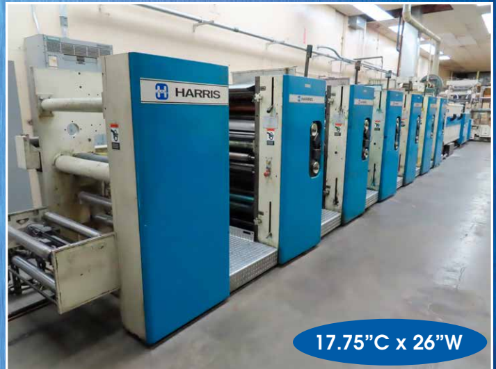
Harris M110 Heatset Offset Web Press

THIS BROCHURE IS A PARTIAL LISTING - MANY ITEMS BEING ADDED DAILY VISIT WWW.THOMASAUCTION.COM FOR FINAL LOT LISTING