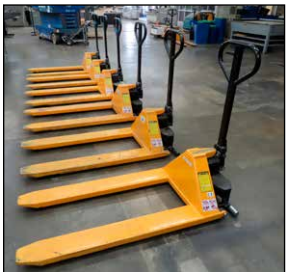
(10+) HYDRAULIC PALLET JACKS