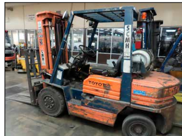
TOYOTA 42-5FD25, 4000 LB LPG FORKLIFT