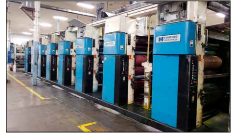
HARRIS M1000 PRINTING PRESS