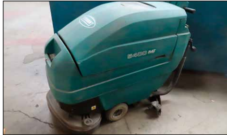
TENNANT 5400 FAST FLOOR SCRUBBER