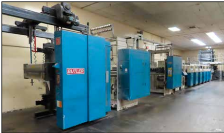
HARRIS V25 WEB PRESS WITH JF35 FOLDER