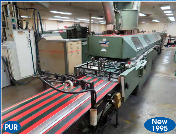
Muller Martini Star Binder