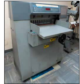
CHALLENGE 305 CUTTER