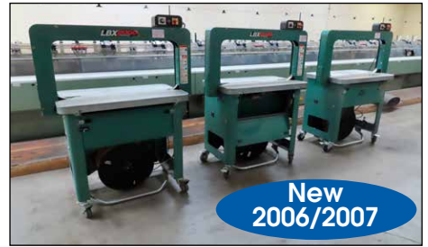
SIGNODE LBX2000 STRAPPING MACHINES