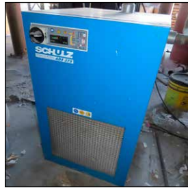
SCHULTZ ADS375 COMPRESSED AIR DRYER