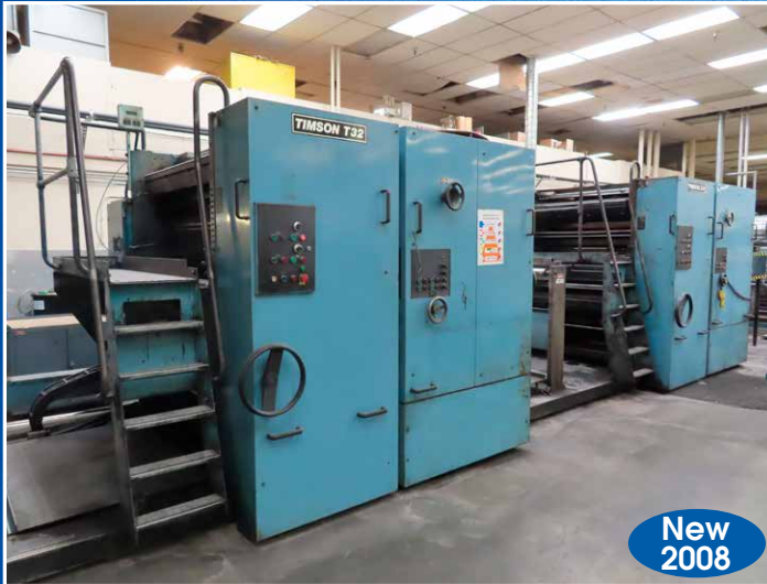
Timson T-32 UV Web Press, 46" x 53"

INSPECTION: TUESDAY, FEBRUARY 16, 9 AM TO 4 PM (LOCAL)