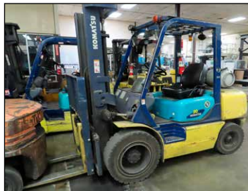
KOMATSU 5000 LB LPG FORKLIFT