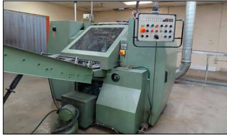
KOLBUS HD150 TRIMMER