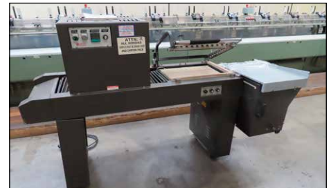
PREFERRED PACKAGING L-SEAL PACKAGING MACHINE