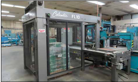
COLUMBIA FL10 PALLETIZER ON T32 PRESS