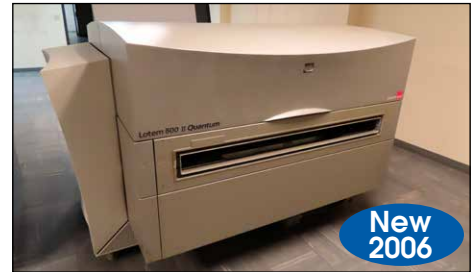
CREO LOTEM 800 II QUANTUM CTP SYSTEM, SQUARE SPOT