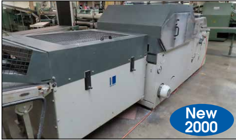
KOLBUS TR160 SAW