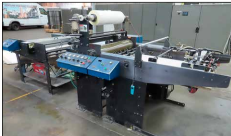
ACCULAM 31" LAMINATOR MODEL 320