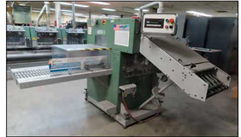
MULLER MARTINI APOLLO COUNTER/STACKER