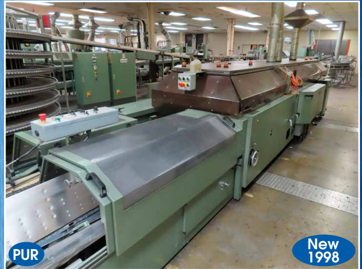
Kolbus KM470 Perfect Binder