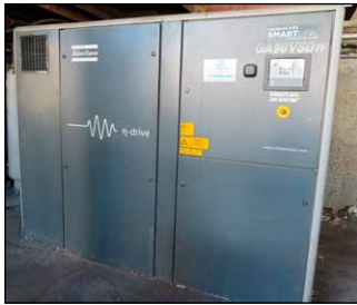
ATLAS COPCO GA90VSD FF AIR COMPRESSOR