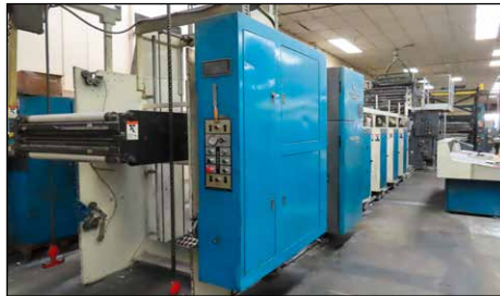
HARRIS V15 WEB PRESS WITH JF35 DP FOLDER