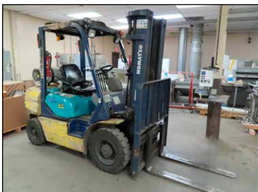
KOMATSU 5000 LB LPG FORKLIFT