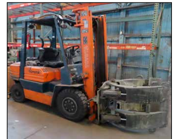
TOYOTA 42-5FG25, 3600 LB LPG CLAMP TRUCK