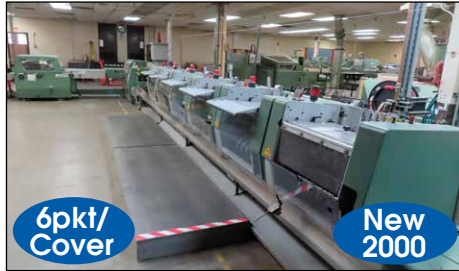
MULLER MARTINI BRAVO-S SADDLE STITCHER