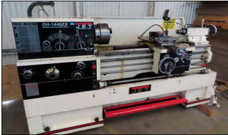
JET GH-1440ZX LATHE