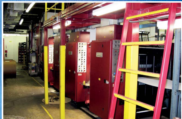
Process King 4-Unit Web Press, 22.75" Cut-Off