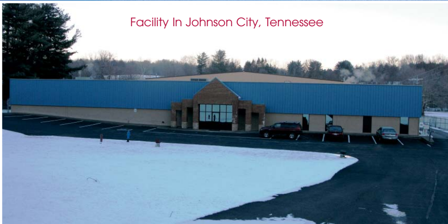
Facility In Johnson City, Tennessee