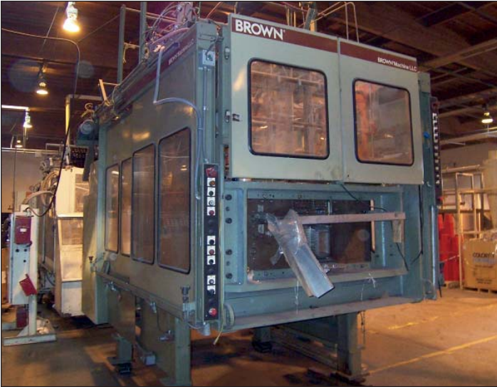
BROWN T350L TRIM PRESS