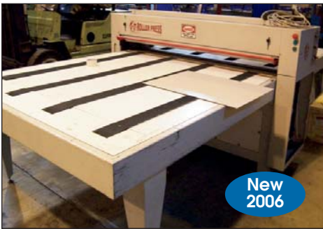
INDUSCO 63" ROLLER PRESS DIE CUTTER