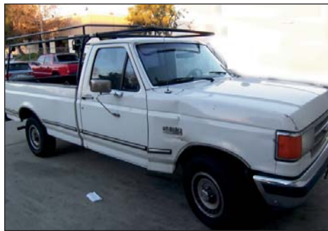
1988 FORD F-150 XLT LARIAT PICKUP