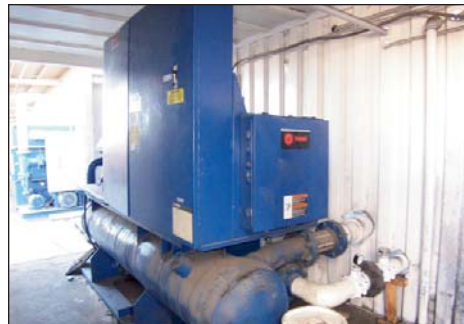
TRANE 100 TON CHILLER #CGWCD101RJNKK6237DPT