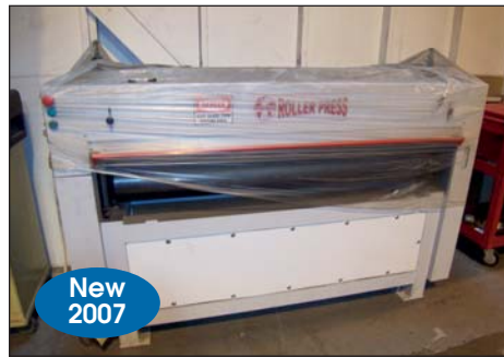
INDUSCO 63" ROLLER PRESS DIE CUTTER