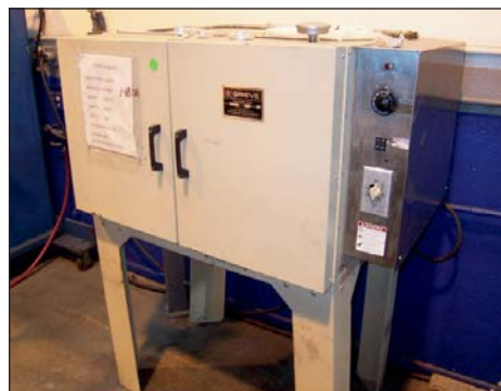
GRIEVE #NB-550 OVEN