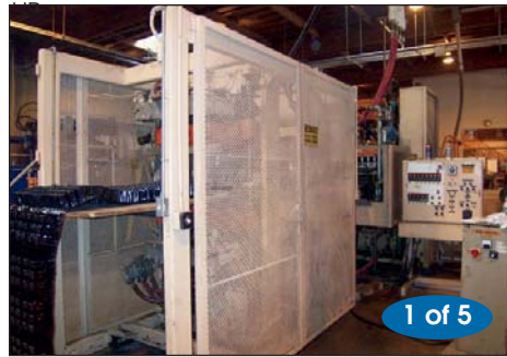
ARMAC THERMOFORMING LINES