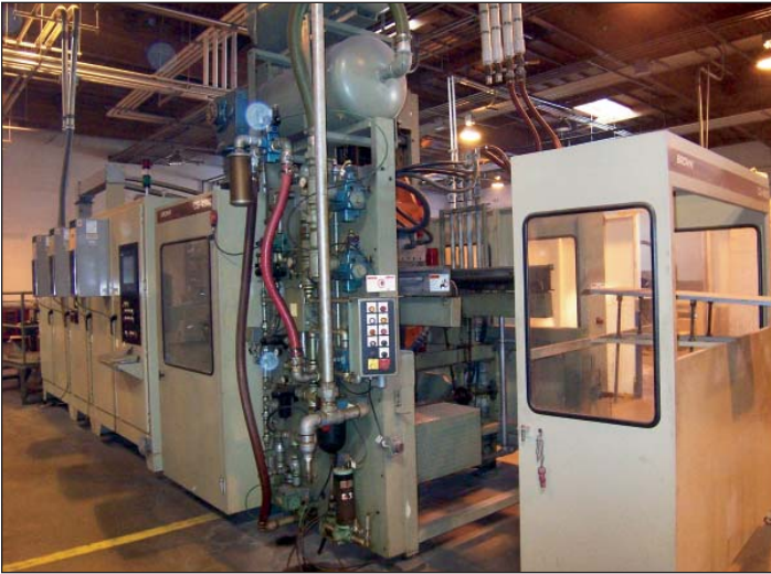
BROWN CS-4500 THERMOFORMER