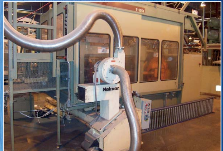
BROWN T350L TRIM PRESS

AUCTION INFORMATION: THOMAS INDUSTRIES 203-458-0709