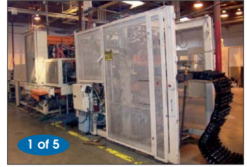
ARMAC THERMOFORMING LINES