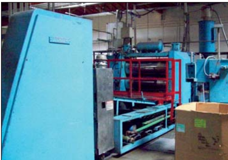
VIEW OF STERLING EXTRUSION LINE