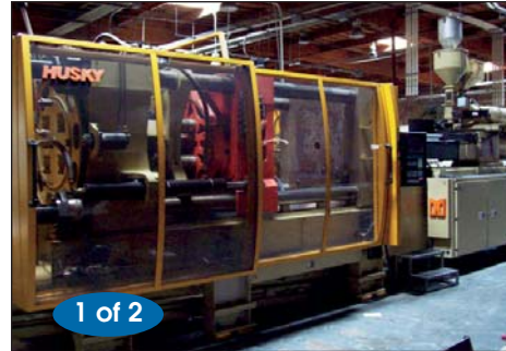
HUSKY G300-RS60160 INJECTION MOLDER (1998)