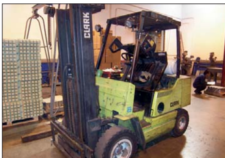
CLARK 4,000 LB LPG FORKLIFT MODEL GPX25