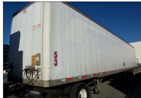
1992 WABASH 53' TANDEM AXLE VAN TRAILER