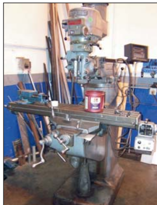
BRIDGEPORT SERIES I, 2HP VERTICAL MILL