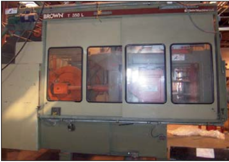
BROWN T350L TRIM PRESS