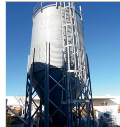
BROCK CONE TYPE GALVINIZED 1,700 CU FT SILO