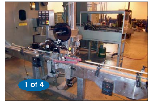
CALIFORNIA PACKAGING EQUIPMENT ST2100 LABELER