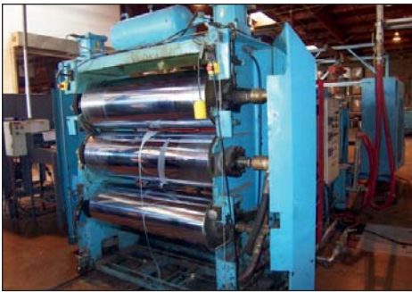
WELEX 3-ROLL STAND