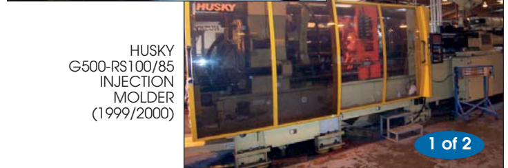
HUSKY G500-RS100/85 INJECTION MOLDER (1999/2000)