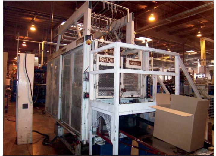
BROWN C-4200 THERMOFORMER