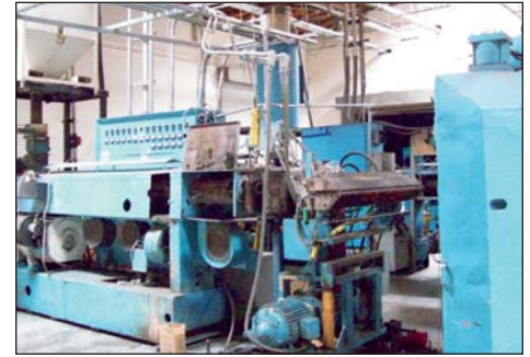
WELEX 4.5" MODEL 450 EXTRUDER, 250 HP