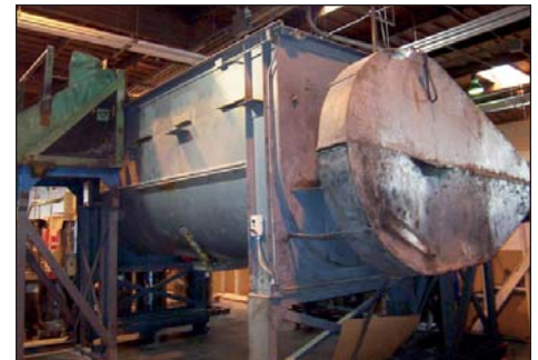
10,000 LB RIBBON BLENDER