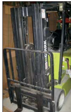
Clark 3000 lb. Forklift Model TMG20