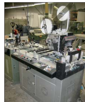
Kirk Rudy Tabber/Labeler Model 535-CS

OPEN HOUSE INSPECTION: MONDAY, SEPTEMBER 21, 9 AM TO 4 PM