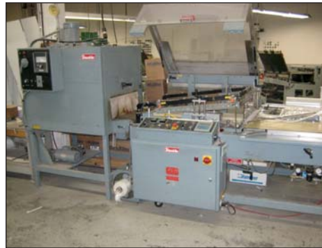
Shanklin Packaging Machine Model A27A