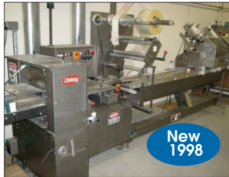
Doboy Packaging Machine Model Super Mustang