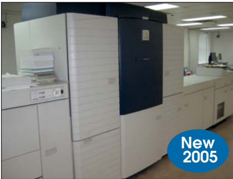
Xerox Digital Production System IGen3

SALE DATE: TUESDAY, SEPTEMBER 22, 10:30 AM (EDT)