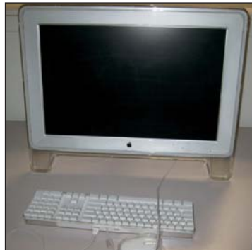
Large Apple Flatscreens