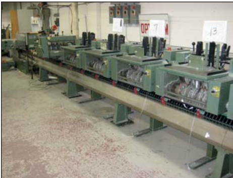
Muller Martini 321 Fox Saddle Stitcher