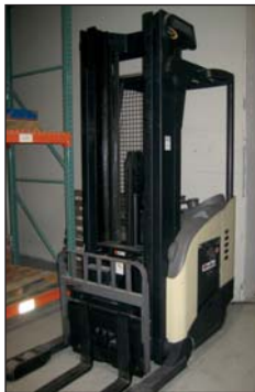
Crown 3000lb. Standup Aisle Lift, 5200 Series