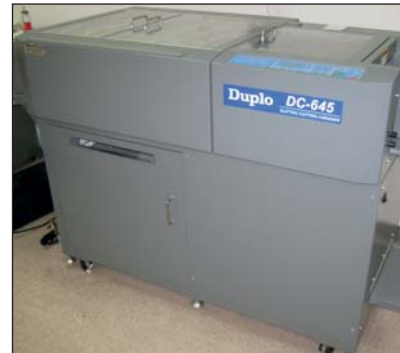
Duplo Slitter Cutter Creaser Model DC-645