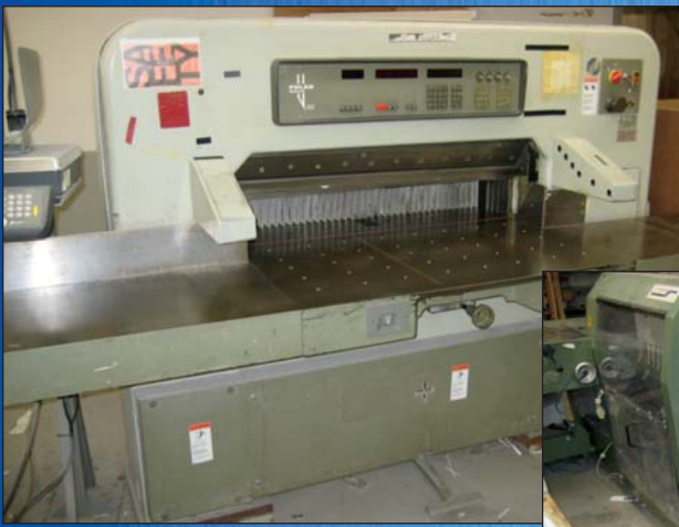
Polar Mohr Paper Cutter Model 115-MON