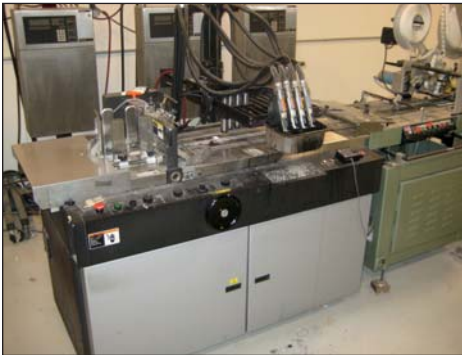
Video Jet Ink Jet Print System Model 2001