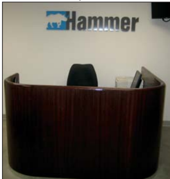
Large Assortment High Quality Office Furniture