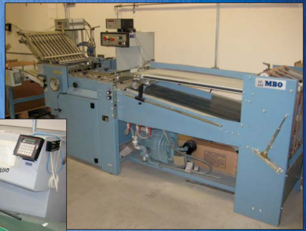
MBO Folder Model B120-C

AUCTION INFORMATION: WWW.THOMASAUCTION.COM OR 203-458-0709