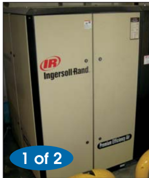
Ingersoll Rand 50 HP Rotary Screw Air Compressor