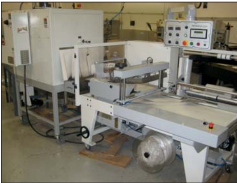
Texwrap Packaging Machine Model 2219