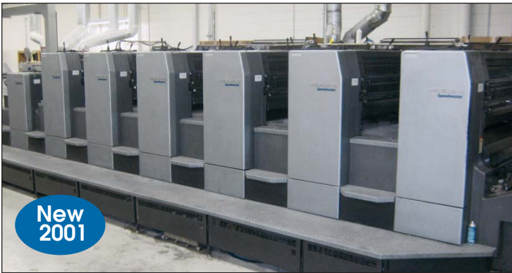
Heidelberg CD102 6+LX, 6/C Printing Press