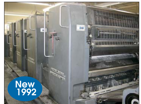
Heidelberg SM102-VP 4/C Printing Press

Heidelberg 4/C Sheet Fed Printing Press, Model SM102-VP, S/N 528000 (New 1988), 28 x 40, 155 Million Impressions, CPC 102 Control Console w/CPTronic, Baldwin/Royce Circulators, Oxy Dry Sprayer, Heidelberg Perfector, Pre Loader, Super Blue