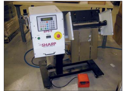
Sharp Bag Machine Model BPS-2