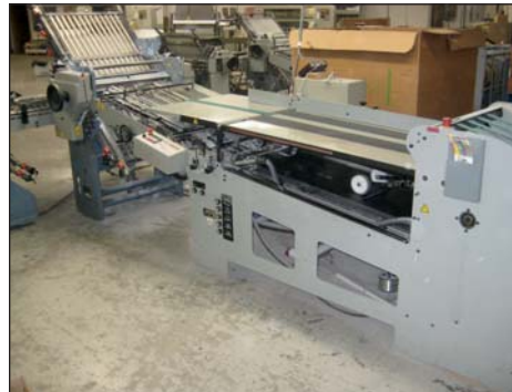
Heidelberg Finishing Folder Model S1426B