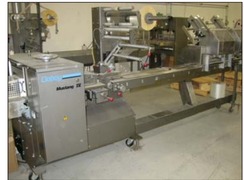
Doboy Packaging Machine Model Mustang IV