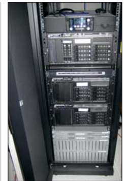
View of Server Cabinet