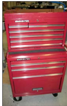
Snap-On Portable Tool Cabinet