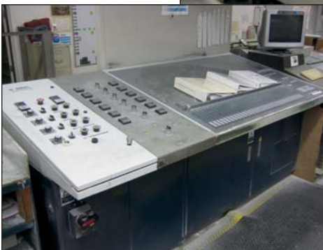
Komori 6/C Printing Press Model L640