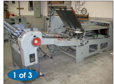
Stahl Folder Model TD66/4-4-4