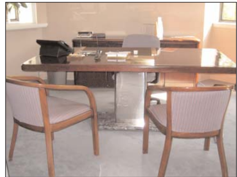
View of office suite