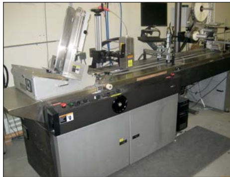
Inkjet Print System W/ Cheshire 7050 Base