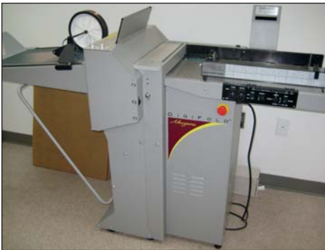
Morgana Digi Fold Machine 120-00-02