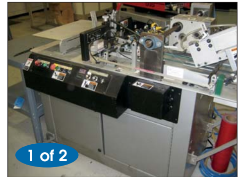
Kirk Rudy Labeler Model 215