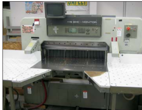
Polar Mohr Paper Cutter Model 115-EMC