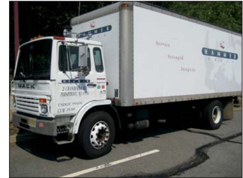
Mack Box Truck