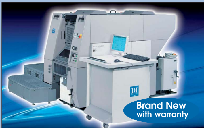
Ryobi D.I. Presses Model 3404 EDI