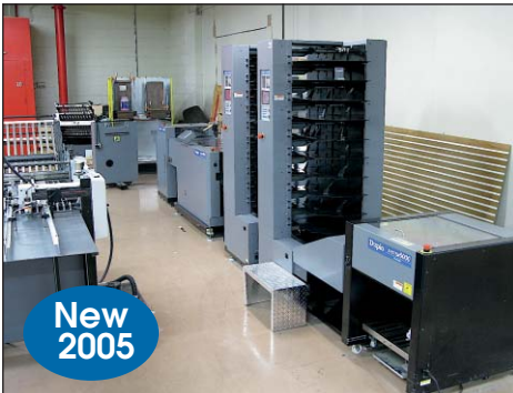
Duplo Booklet Maker Model 5000