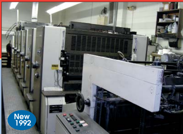
Mitsubishi 6-Color Sheet Fed Press Model 3F-6D