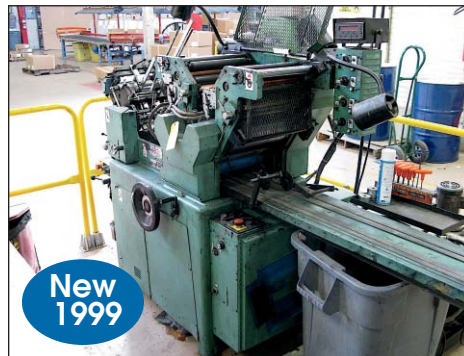
Halm-Jet Press 2 Color Press Model JPTWOD-PD