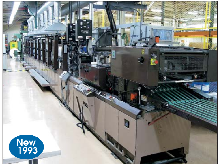
Didde 8-Color Web Press Model F226JN-G

Didde 8-Color Web Press Model F226JN-G, S/N 350-0207, (New 1993), 22" Web Width, Butler double roll stand. Press is equipped with Prime UV system containing four interdeck lamp stations. Variable cut off with two positions, 11" or 22". In line rotary punch with four heads. In line rotary perf, capable of two directional configurations - inline with web travel or across web width. Kodak Versamark & Kodak Scitex Print Stations (to be sold separately) Press capable of speeds up to 800 linear feet per minute. Two Kirk Rudy IR Dryers (sold separately) In Line sheeter, 11" or 22" with rotary die capability. Sheet Stacker. Roll to Roll attachment. Royle re-circulators, various spare parts. (print test available by appointment - all components of the entire print system can be demonstrated on the day of inspection)