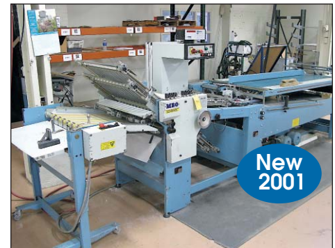
MBO Folder Model B-26