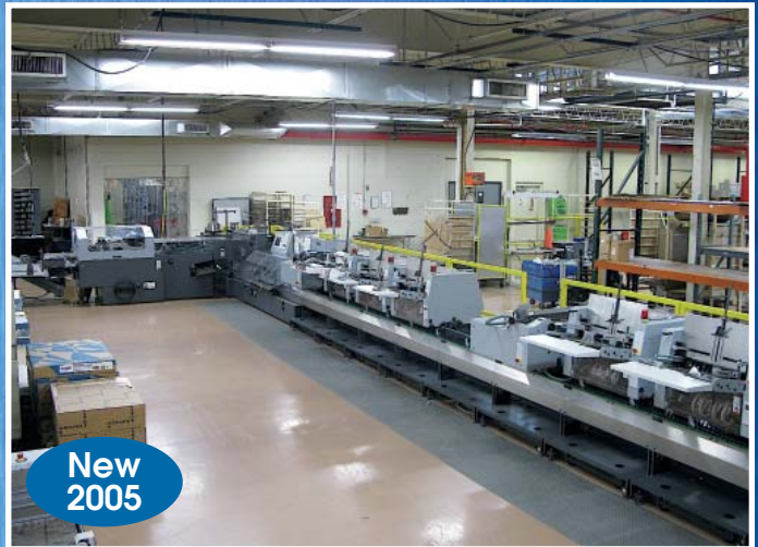
Heidelberg Stitcher Model ST400