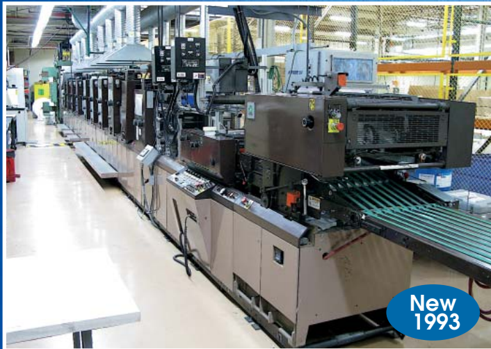
Didde 8-Color Web Press Model F226JN-G

FINAL BIDDING: SEPTEMBER 30, 2:00 PM (ET)