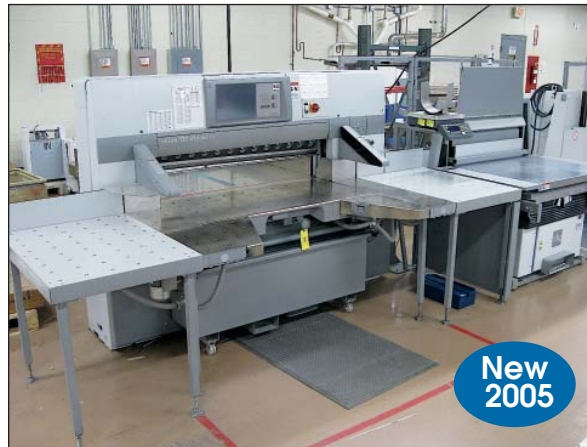
Polar Guillotine Cutter 137XT-AT, w/Lift & Jogger