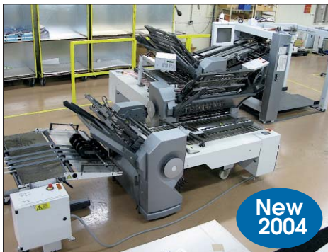
Heidelberg Folder TH-82