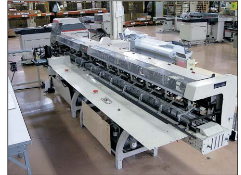
Bell and Howell Mailstar Jumbo Inserter 92768A