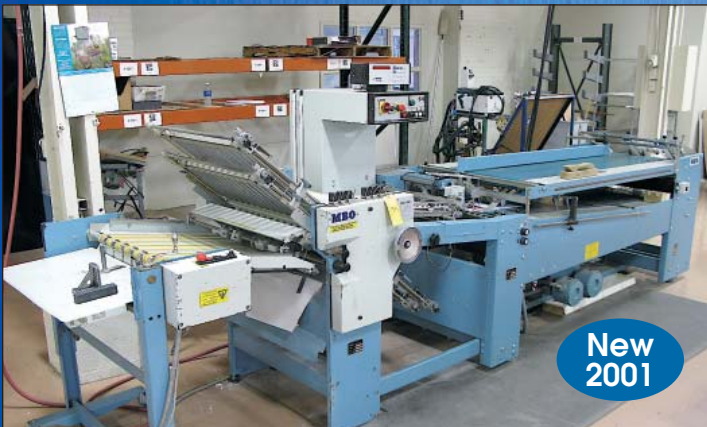
MBO Folder Model B-26