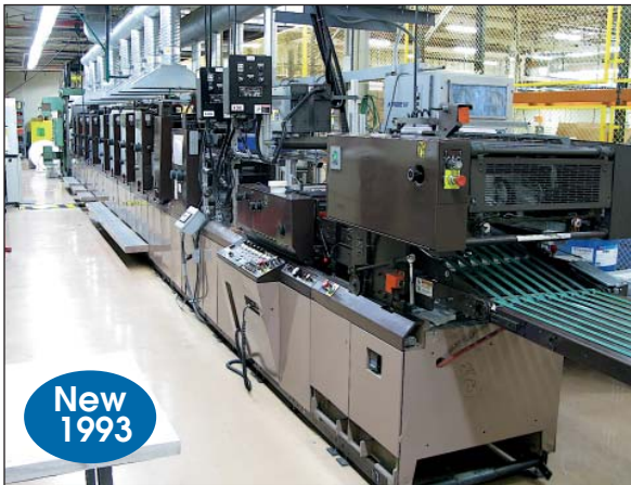
Didde 8-Color Web Press