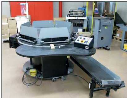
Brackett Circular Padder Model CPM-89-1E