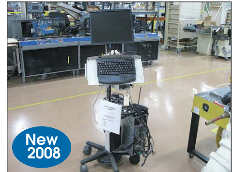
Lake Vision Matched Data System MR5-660P