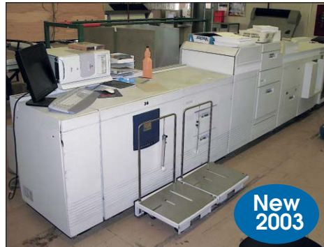
Xerox Docutech Laser Printer