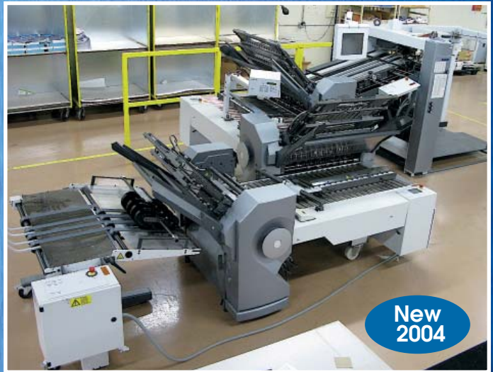
Heidelberg Folder TH-82

ALL ITEMS AVAILABLE FOR IMMEDIATE SALE SEE LOT CATALOG FOR BUY NOW PRICING