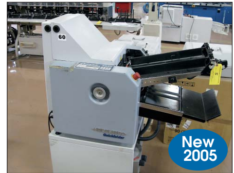
Heidelberg Quick Folder Model T34C-2-P-2