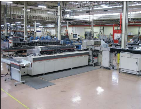
Bell and Howell Inserter Model Mailstar 500