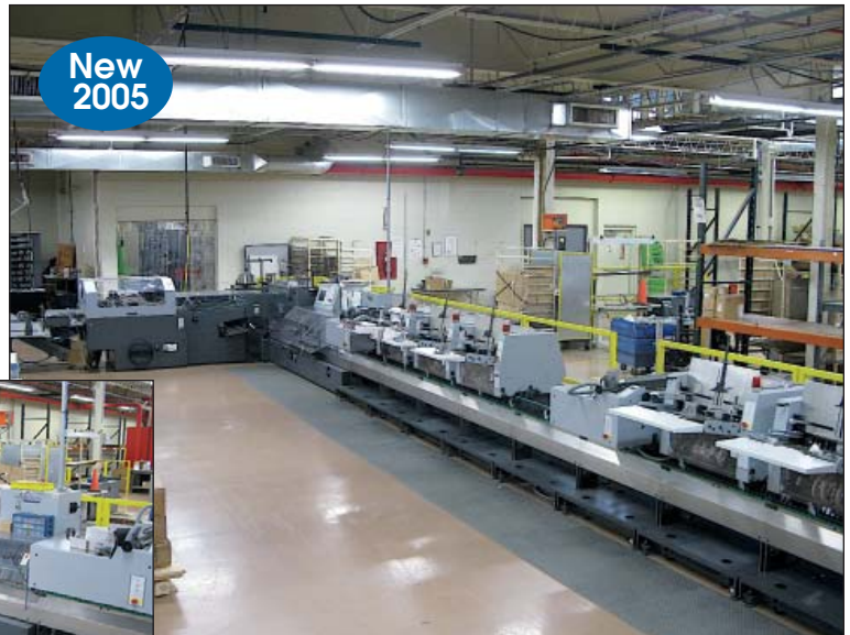
Heidelberg Stitcher Model ST400