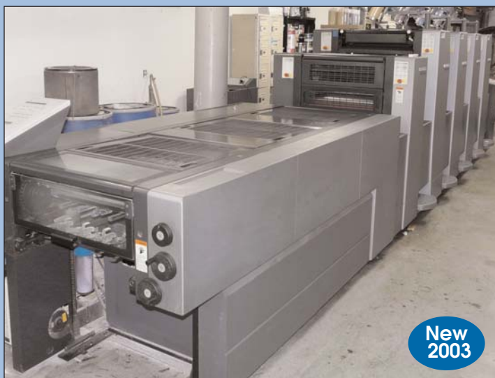
Heidelberg 4/C Press Model SM 52-4+LX

(5) Ryobi D.I. Presses Model 3404 EDI. SN: 2603 PDS-E. Plate Saver. IR Dryer. FM screening. RYOBI Program Inking. Image area ratio data calculation function. Cooling device for imaging unit and control unit. Ink roller temperature control system (ink fountain rollers, ink oscillating rollers). Automatic ink roller cleaning device. Automatic blanket cleaning device. Plate cleaning device. Front lay vertical/diagonal image micro adjustment mechanism. Impression cylinder air blower guide. Infrared dryer. Pre-plate device. Paper feed table motor drive. Delivery table motor drive. Spray device. Decurling device. Suction wheels. Delivery paper pull-out device. Delivery jam detector. Static eliminator. Double sheet detectors (mechanical, electronic). Total counter. Machine counter. Preset repeat counter. OK monitor. Centralized oiling system. Safety covers. Safety bars. Ink roller clean-up attachments. Foot step. This is a new, never used press with manufacturer's new product warranty (Located in Illinois)