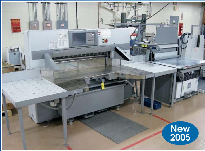
Polar Guillotine Cutter 137XT-AT, w/Lift & Jogger