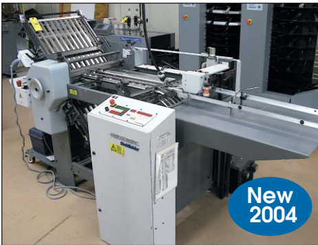
Heidelberg Folder Model B-20-4