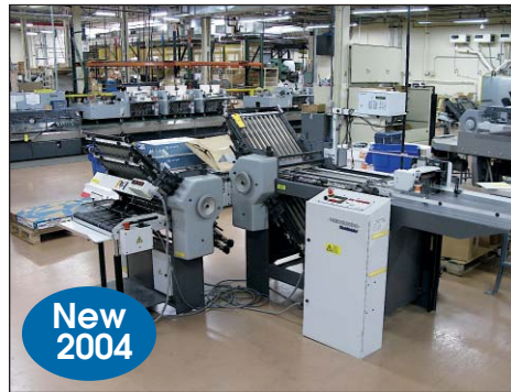
Heidelberg Folder Model B-20