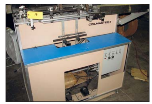
SPIEL COILMASTER II INSERTER MODEL CM 179