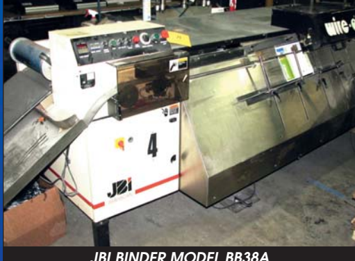
JBI BINDER MODEL BB38A