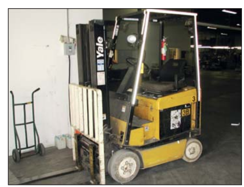
YALE 3,000 LB CAP ELECTRIC FORKLIFT