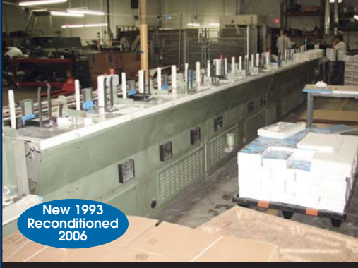
KOLBUS 16 POCKET BINDER MODEL KM470