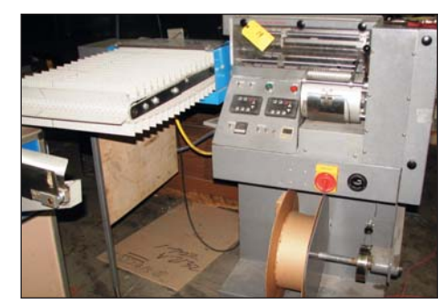
SPIEL COIL FORMER