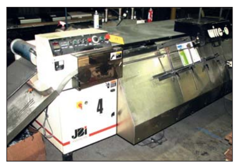
JBI BINDER MODEL BB38A