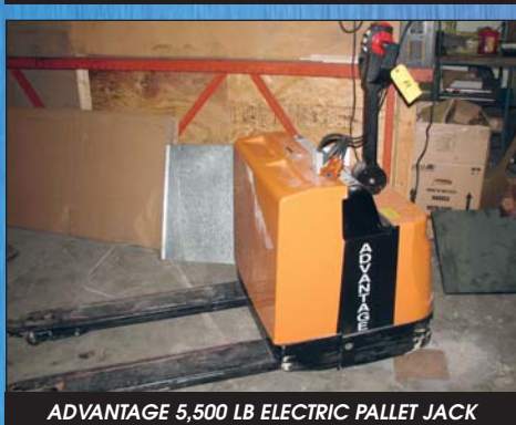
MAJOR ONLINE BINDERY AUCTION OUTSTANDING OFFERING