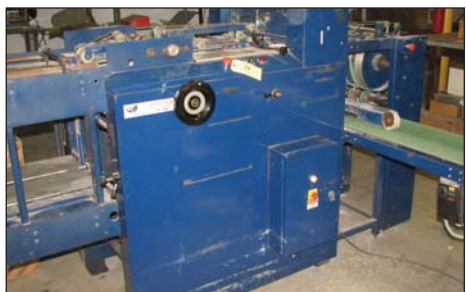
JBI /LHERMITE PUNCH MODEL EX380