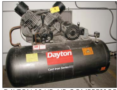
DAYTON 10 HP AIR COMPRESSOR