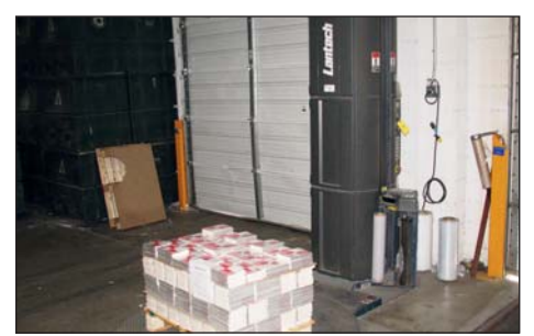
LANTECH AUTOMATIC STRETCH WRAPPER MODEL Q300