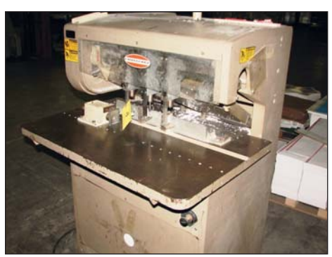
CHALLENGE 3 HEAD MODEL MS-10A