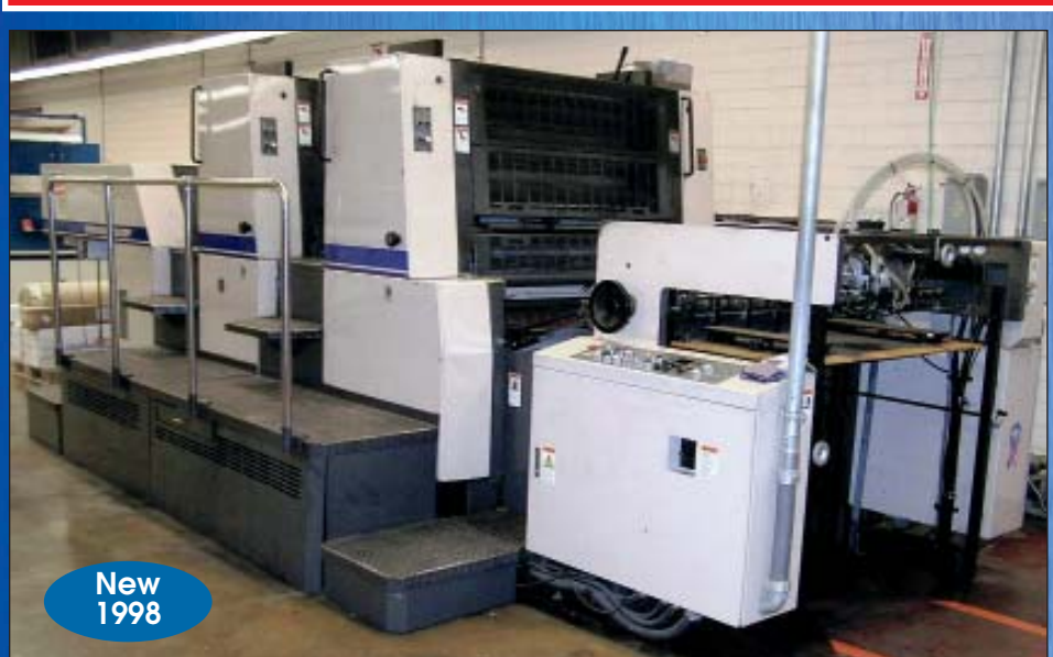
SHINOHARA 40" MODEL 10411P 2-COLOR PERFECTOR SHEET FED PRESS, 11MM IMP