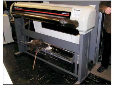
AGFAJET SHERPA MODEL 43 DIGITAL PROOFER

AGFA SELECTSET AVANTA MODEL 445 DIGITAL IMAGE SETTER