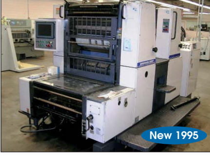
SHINOHARA 25" MODEL 6611P 2-COLOR PERFECTOR SHEET FED PRESS, 22MM IMPS

2414 Boston Post Rd. Guilford, CT 06437 PH 203-458 0709 FX 203-458-0727 gavel@thomasauction.com www.thomasauction.com