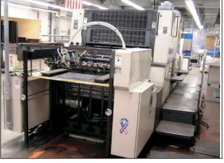
SHINOHARA 40" MODEL 104IIP

All items are sold As is - Where Is with all faults. The Auctioneer expressly disclaims any warranty of merchantability or fitness for a particular purpose. It is the bidders' sole responsibility to examine or inspect items prior to placing their bids.