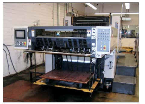
SHINOHARA 40" MODEL 104IIP

SHINOHARA 40" MODEL 104IIP 2-COLOR PERFECTOR SHEET FED PRESS, 11MM IMPS