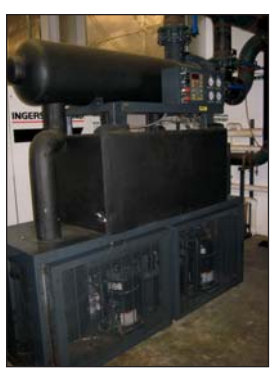
ZEKS REFRIGERATED AIR DRYER MODEL 2000HS DMA400