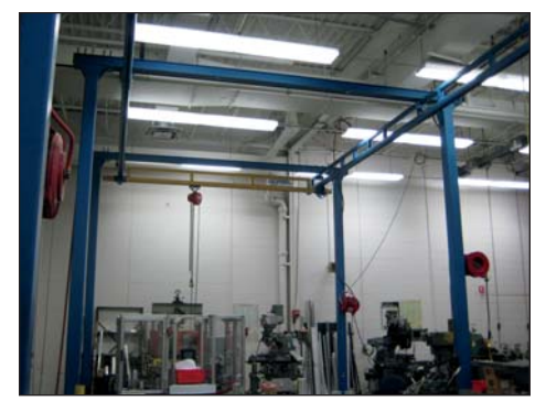
GORBEL 2000 # 20' X 40' CRANE SYSTEM