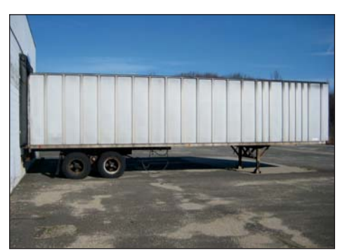
(2) FRUEHAUF 42' TANDEM AXLE BOX TRAILERS