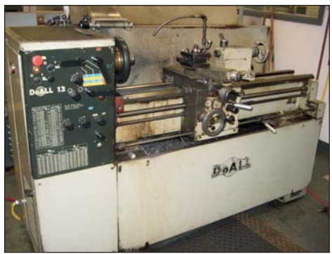
DOALL ENGINE LATHE 13" X 40"