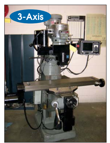
BRIDGEPORT SERIES 1 PROTO-TRAK 2 HP