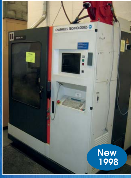
CHARMILLES ROBOFIL 290 EDM

ONE OF THE NATIONS LARGEST MANUFACTURERS OF METAL & PLASTIC PRODUCTS FOR THE BEAUTY INDUSTRY