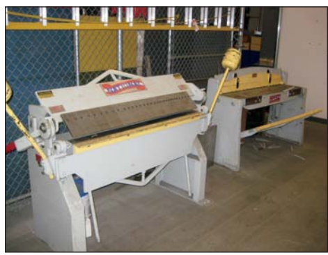
NATIONAL SHEAR & FINGER BRAKE