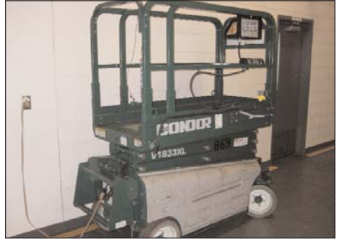
CONDOR ELECTRIC SCISSOR LIFT