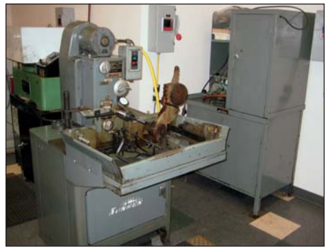
SUNNEN HONING MACHINE MBB 1660