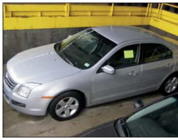
FORD FUSION SE