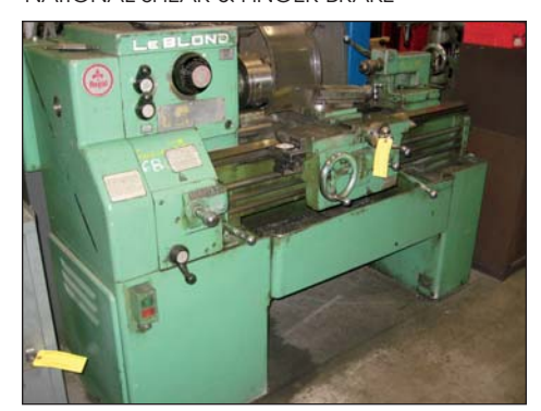
LEBLOND REGAL 15" X 30" LATHE