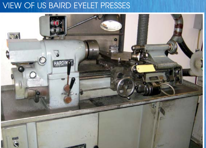
HARDINGE HLV-H TOOLROOM LATHE