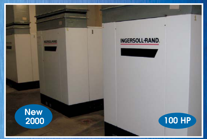
(3) INGERSOLL RAND ROTARY SCREW AIR COMPRESSORS MODEL SSR-EPE 100-2S