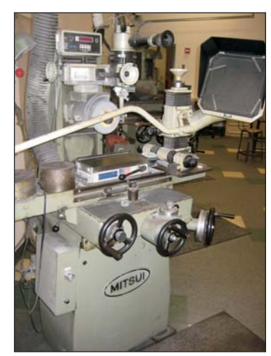
MITSUI 6" X 12" W/ OPTI-DRESS