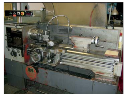
SOUTHBEND TOOLROOM LATHE