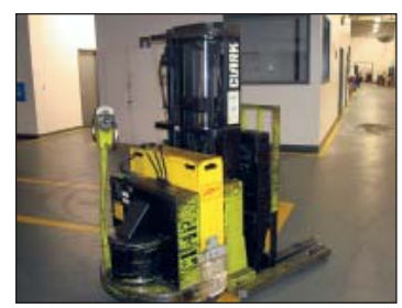
CLARK ELECTRIC LIFT MODEL SP30

REMOVAL: DUE TO STRICT REMOVAL REQUIREMENTS AND A FIXED REMOVAL DATE ALL BUYERS WILL BE REQUIRED TO UTILIZE PEDOWITZ RIGGING COMPANY FOR REMOVAL OF ALL LOTS OTHER THAN HAND CARRY LOTS; PLEASE CONTACT ANDY CONTI 203-410-8948 FOR ALL REMOVAL QUOTES.