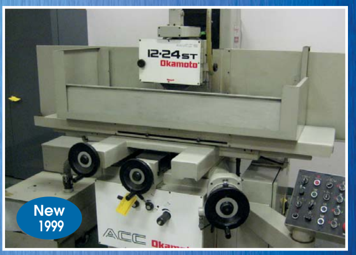
OKAMOTO 12"X 24" HYD. SURFACE GRINDER