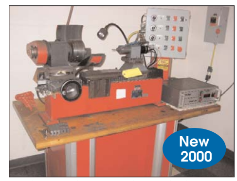
DIE QUIP DIE GRINDER MODEL DQ-70M