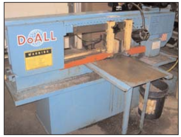
DO-ALL HORIZ. BANDSAW