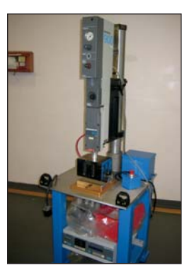
BRANSON 901 ULTRASONIC WELDER