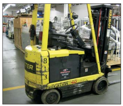
2 HYSTER 3,500 LB ELECTRIC FORKLIFTS MODEL E40XM2S