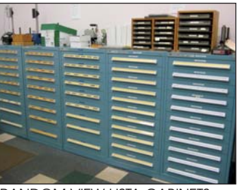
RANDOM VIEW LISTA CABINETS