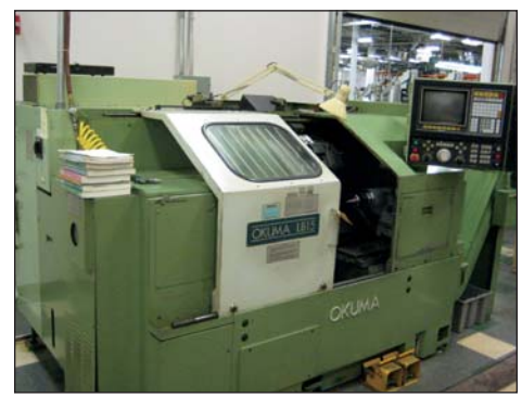
OKUMA CNC TURNING CENTER MODEL LB15