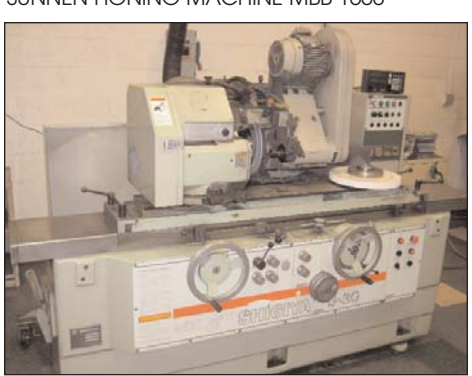
SHIGIYA UNIVERSAL # G-30-ID/OD GRINDER