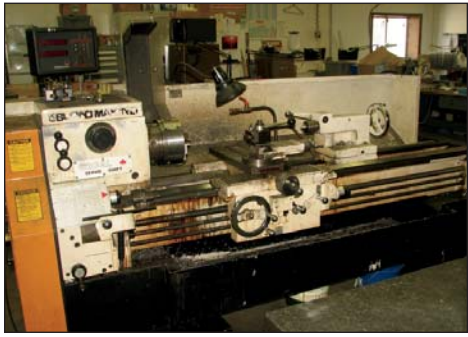
LEBLOND/MAKINO LATHE 15" X 48"