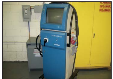
FAST HEAT DIGITAL HOT RUNNER CONTROLLER