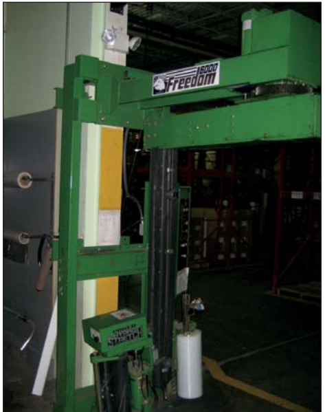
FREEDOM 6000 ROTARY STRETCH PALLET WRAPPER