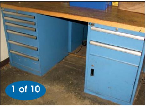
LISTA TOOL CABINET WORKBENCHES