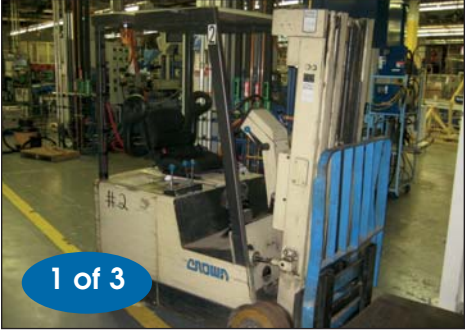
CROWN 3,000 LB ELECTRIC FORKLIFT #30 SCTT