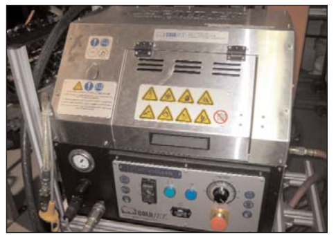
COLD JET MICRO CLEAN SYSTEM