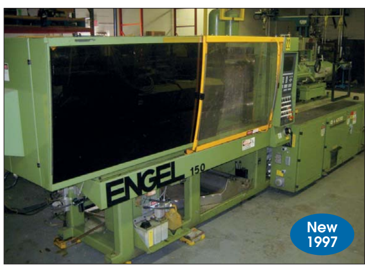
ENGEL INJECTION MOLDER #ES700/150