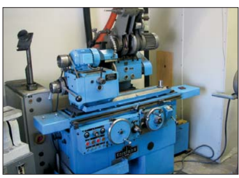
KARSTENS UNIVERSAL GRINDER 6" X 30"