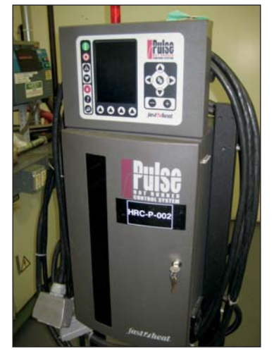
FAST HEAT PULSE DIGITAL HOT RUNNER CONTROLLER