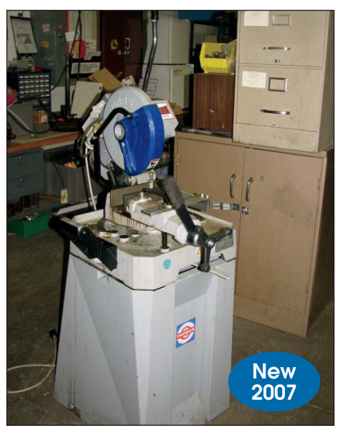
DAKE COLD SAW #315-S-CUT