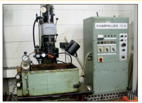
CHARMILLES EDM #D10