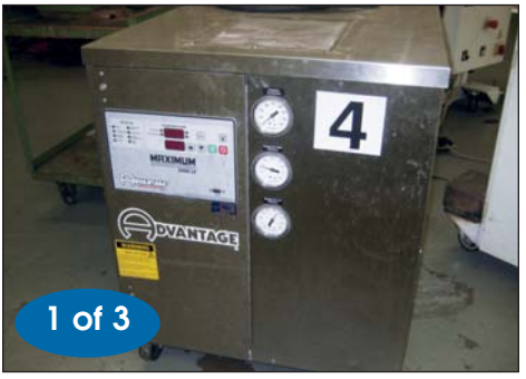
ADVANTAGE 1 TON PORTABLE CHILLER