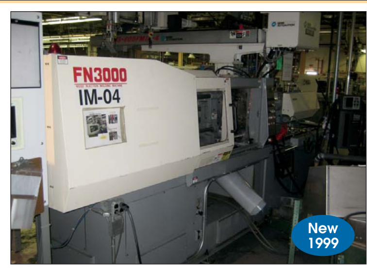
NISSEI 154 TON INJECTION MOLDER #FN3000