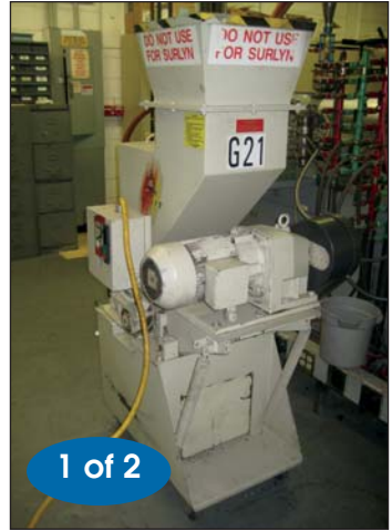
BALL & JEWELL GRANULATOR #LSV22

(12) Maguire Multi-Component Color Blending And Batch Weighers Model Web-140R, 140 lbs/hr