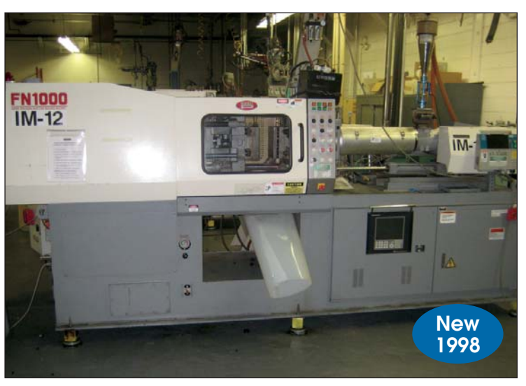
NISSEI 89 TON INJECTION MOLDER #FN1000