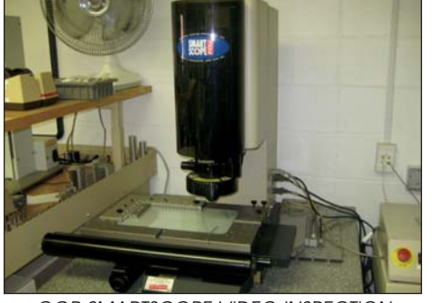
OGP SMARTSCOPE VIDEO INSPECTION SYSTEM #FOV