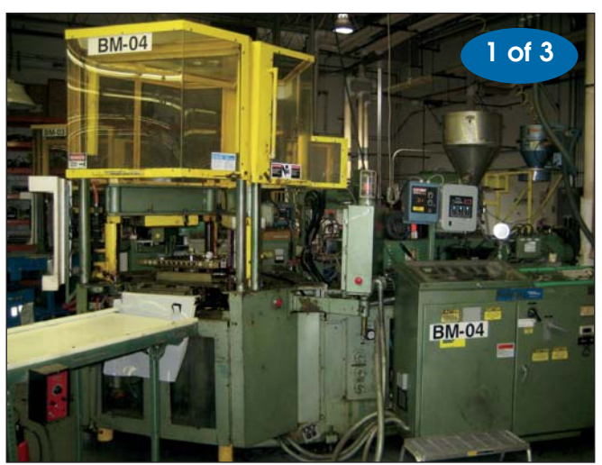
RAINVILLE BLOW MOLDER #IBM54-3