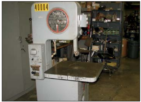
DOALL 16" VERTICAL BAND SAW