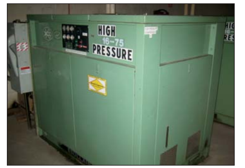
SULLAIR ROTARY SCREW AIR COMPRESSOR #16-75