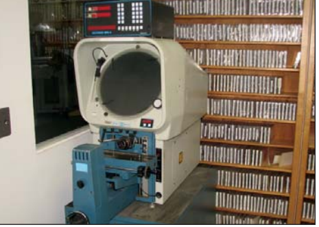
DELTRONIC OPTICAL COMPARATOR