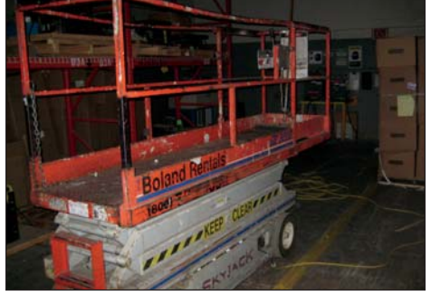
SKY JACK SCISSOR LIFT #SJII3220