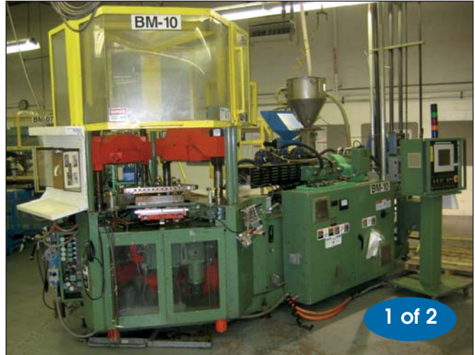
UNILOY BLOW MOLDER #54-3