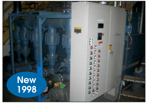
ADVANTAGE 200T CHILLED WATER SYSTEM #PTS3000-SP-SS-CL

(12+) Custom Fabricated Assembly And Decorating Machines, Including: Bowl Feeder, Rotary Table, Hot Stamper And Or Pad Printer & Glue Dispenser (1996-2001)