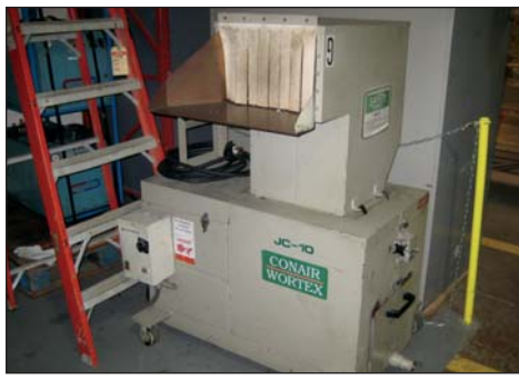
WORTEX GRANULATOR #JC-10