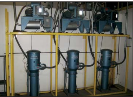
CONAIR FRANKLIN PUMP LOAD STATION