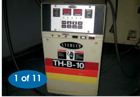
STERLCO TEMPERATURE CONTROLLERS