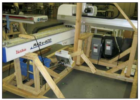
YUSHIN ROBOT #RAIIA-400