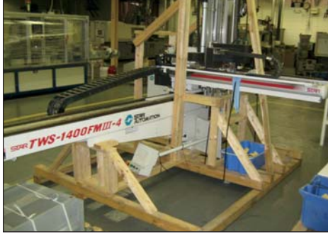
STAR AUTOMATION ROBOT #TWS-1400FMIII-4