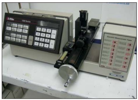
Z-MIKE MICROMETER #1201B