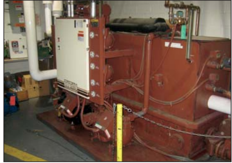
ADVANTAGE 300T CHILLED WATER SYSTEM #ATS3302P-CL9-FF