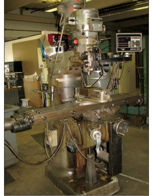
BRIDGEPORT CNC VERTICAL MILL, SWI CONTROL