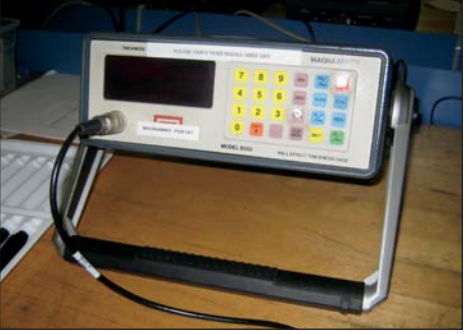
MAGNA-MIKE HALL EFFECT THICKNESS GAGE #8000

Wilton Belt Sander 6" X 12" Model 4300 S/N 33617 Delta Vertical Belt Sander 6" & 12" Disc Grinder And Base