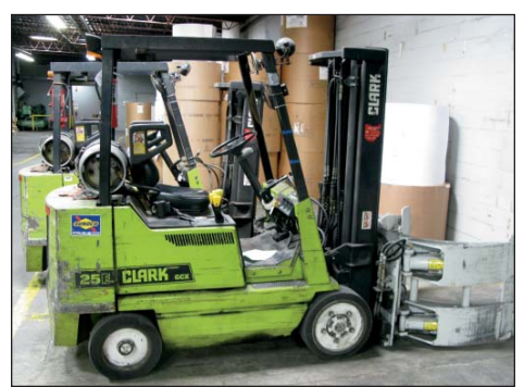
CLARK GCX25E FORKLIFT MODEL W/ROLL CLAMP