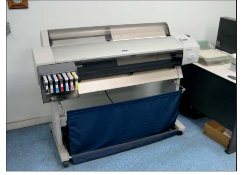
EPSON STYLUS PRO 9800 PROOFER