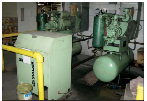
VIEW OF SULLAIR ROTARY SCREW AIR COMPRESSORS