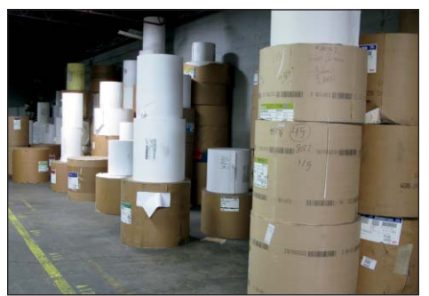
VIEW OF PAPER INVENTORY