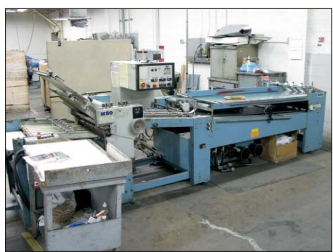
MBO FOLDER MODEL B26-1-26/4C