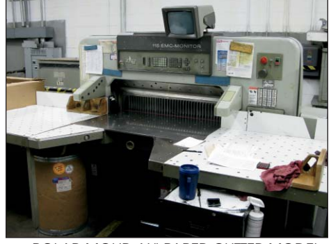
POLAR MOHR 46" PAPER CUTTER MODEL 115 EMC