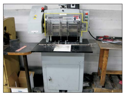
DEXTER LAWSON SUPER DUTY 5-SPINDLE DRILL