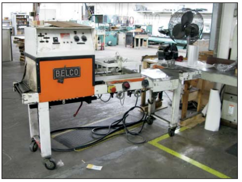
BELCO PACKAGING MACHINE MODEL STC