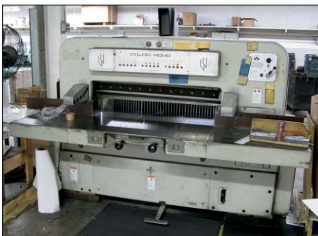
POLAR MOHR 46" PAPER CUTTER MODEL 115CE