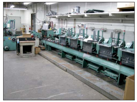
CONSOLIDATED OSAKO 230 SADDLE STITCHER LINE

MBO Folder Model B26-1-26/4C Type KO4/87, S/N H10/79, MBO Digital Controls, RA Attachment MBO Folder Model B26C 1264, S/N 01.1900.05.D, MBO Digital Controls MBO Knife Folding Unit Model Z6, Digital Counter, S/N G9777 Quad-Tech Folder