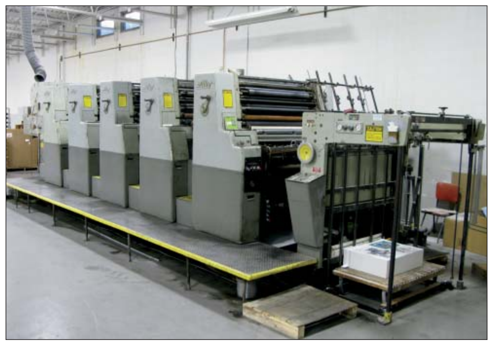
MILLER 5/COLOR SHEET FED PRESS, MODEL TP-38