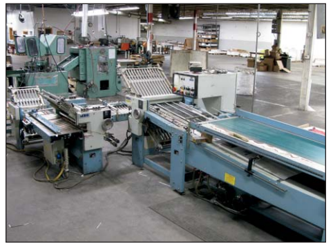
MBO FOLDER MODEL B26C