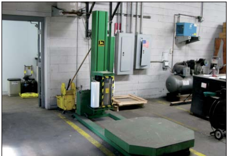
JOHN DEERE ROTARY STRETCH PALLET WRAPPER