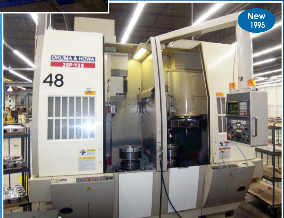
OKUMA & HOWA #2SP-V35 VERTICAL MACHINING CENTER

INSPECTION DATE: MONDAY, JUNE 21 9:00 AM - 4:00 PM