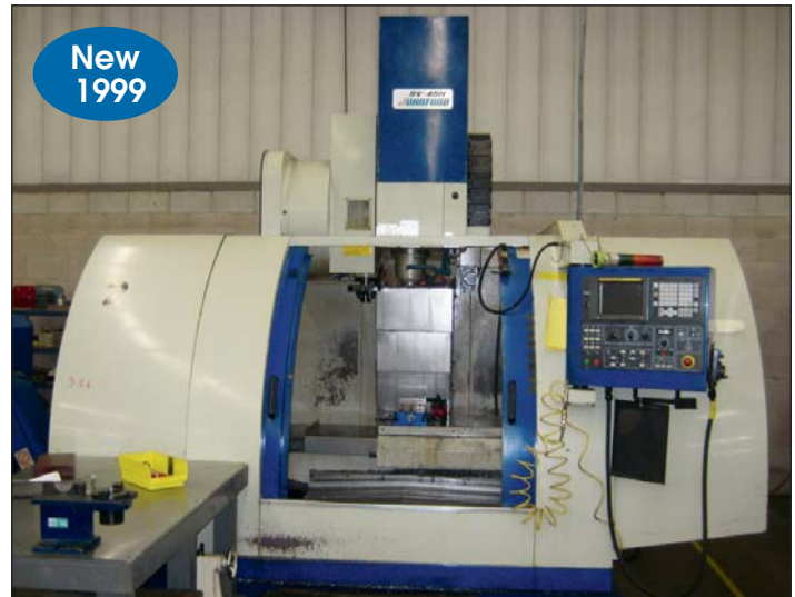
Johnford #SV-45H/APC Vertical Machining Center