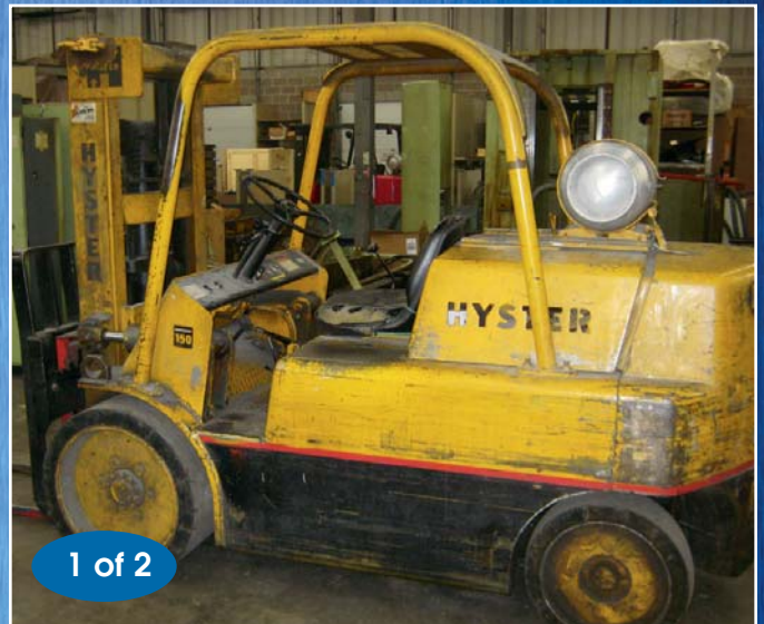
Hyster 15,000 lb. Forklifts # S150A

AUCTION INFORMATION: WWW.THOMSAUCTION.COM OR 203-458-0709