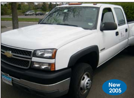
Chevrolet Silverado Pickup