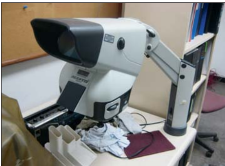
Mantis Vision Scope