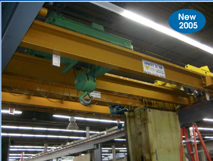
Capco 25 Ton Bridge Crane