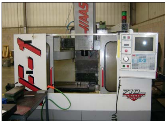
Haas #VF-1 Vertical Machining Center