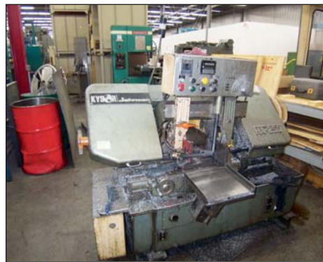
Kysor/Johnson #HA-250 Horizontal Band Saw