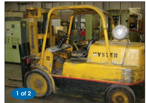
Hyster 15,000 lb. Forklifts # S150A