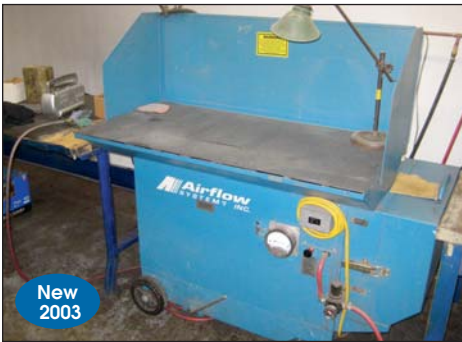
Airflow Downdraft Grinding Table #DTH1700