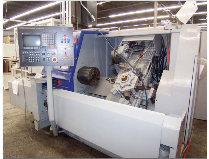
Jones & Lamson #TNC-A Slant Bed Turning Center