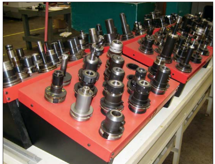
View of CNC Tool Holders