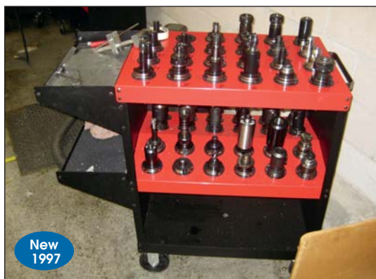
CNC Tool Holders w/Huot Cart