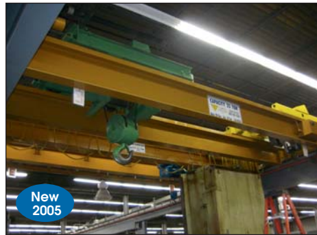
Capco 25 Ton Bridge Crane