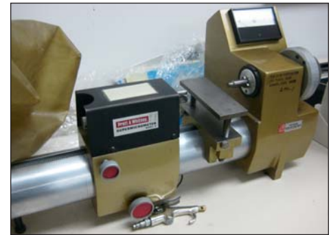
Pratt & Whitney #B Super Micrometer