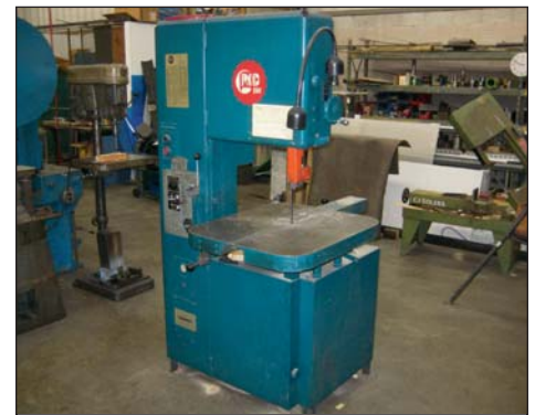
Grob #4V-18 Vertical Band Saw