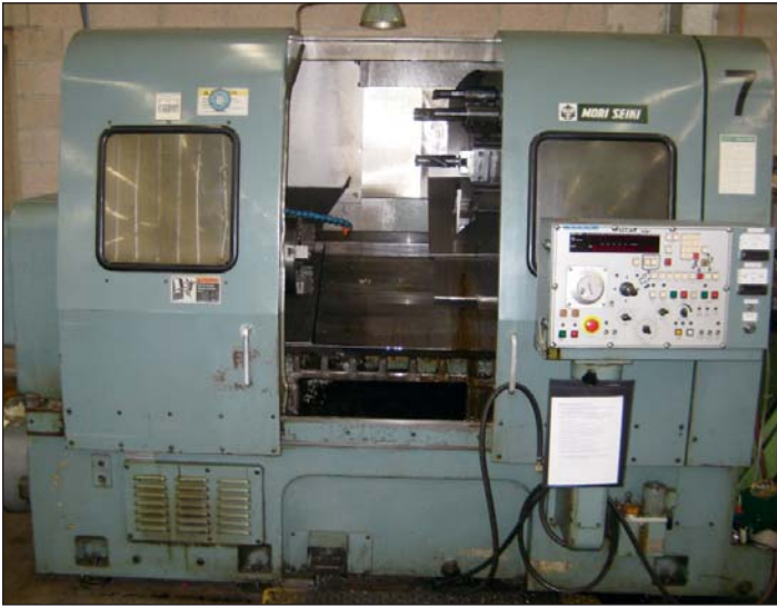
Mori Seiki #SL-4 Slant Bed Turning Center