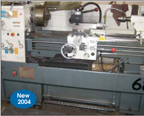
Victor #1640GS Gap Bed Engine Lathe