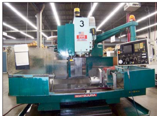
Matsuura #MC- 1000V5 Vertical Machining Center