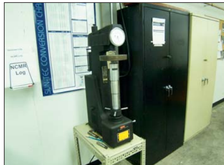
Wilson Rockwell #5TT-BB Hardness Tester