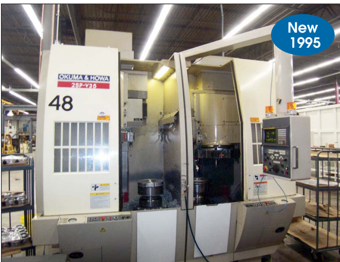
Okuma & Howa #2SP-V35 Vertical Machining Center