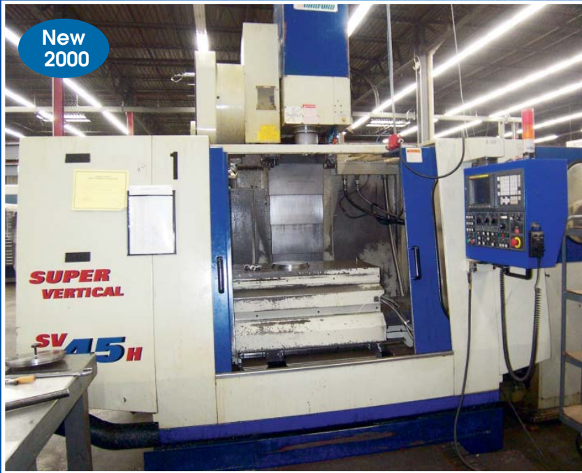
Johnford #SV-45H Vertical Machining Center

BY ORDER OF SECURED CREDITOR STANDARD MANUFACTURING GROUP 70 HORIZON DRIVE BRISTOL, CONNECTICUT