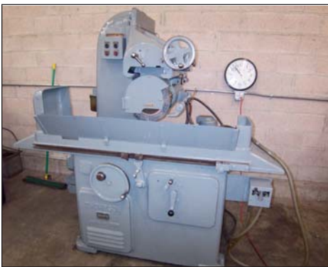
Thompson 8" X 24" Hydraulic Surface