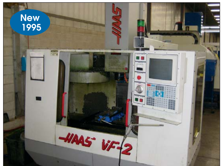
Haas #VF-2 Vertical Machining Center