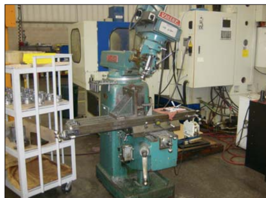
Victor 3 HP Vertical Milling Machine #380V