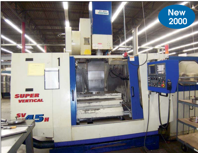
Johnford #SV-45H Vertical Machining Center