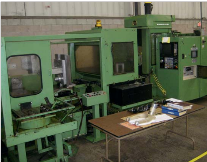
Hitachi Seiki #HC500 Horizontal Machining Center