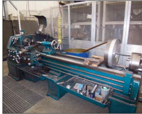
Martin #KM200 Engine Lathe