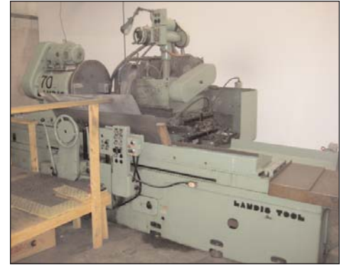
Landis Cylindrical Grinder