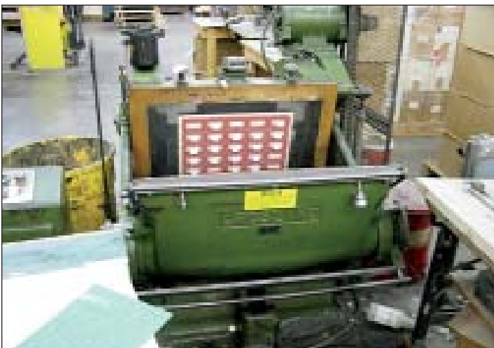
Crosland Die Cutter, 22"x 34"