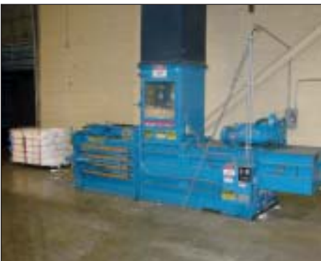
C&M Horizontal Baler Model 3030-4225