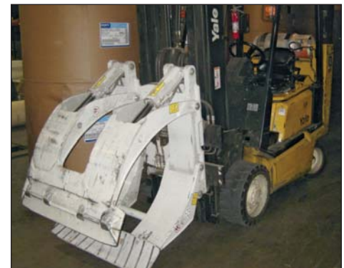
Yale 5,000 lb. LPG Forklift w/Roll Clamp