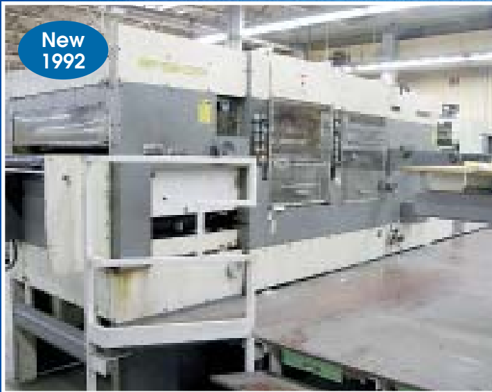
Bobst Auto Platen SP102-CER Die Cutter/Blanker

AMES SAFETY ENVELOPE COMPANY 12 TYLER STREET SOMERVILLE, MA USA