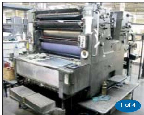
Heidelberg 2/C Printing Press Model SORSZ