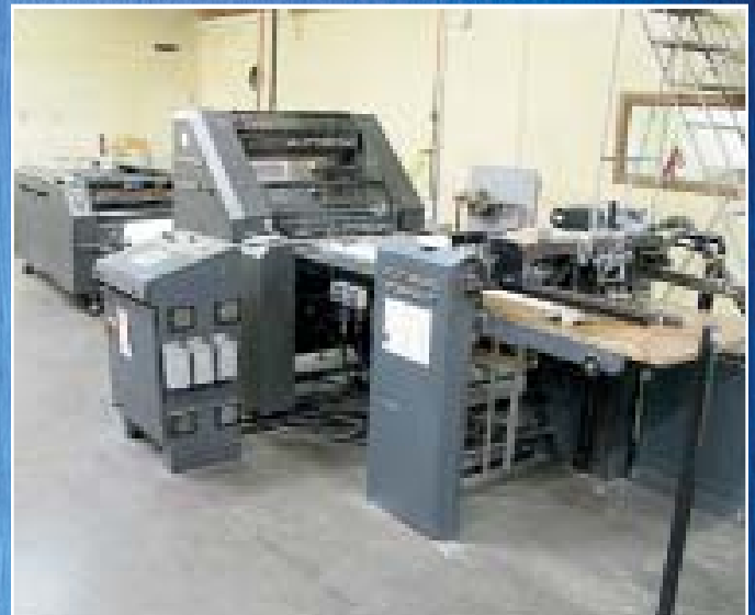
Autobond Single Sided Film Laminator

AUCTION INFORMATION: WWW.THOMSAUCTION.COM OR 203-458-0709