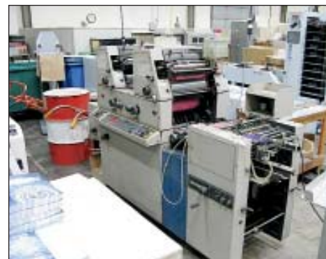
Ryobi 2/C Offset Duplicator Model 3302M