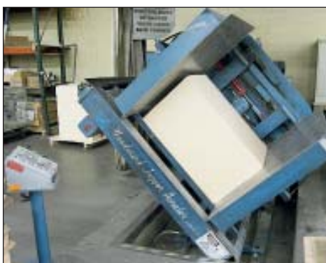
Woodward Skid Turner Model S/400