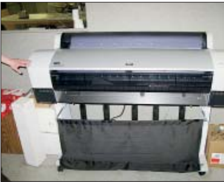
Epson 9800 Proofer