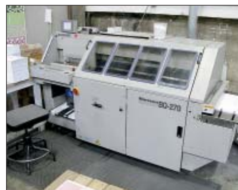
Horizon Perfect Binder Model BQ-270