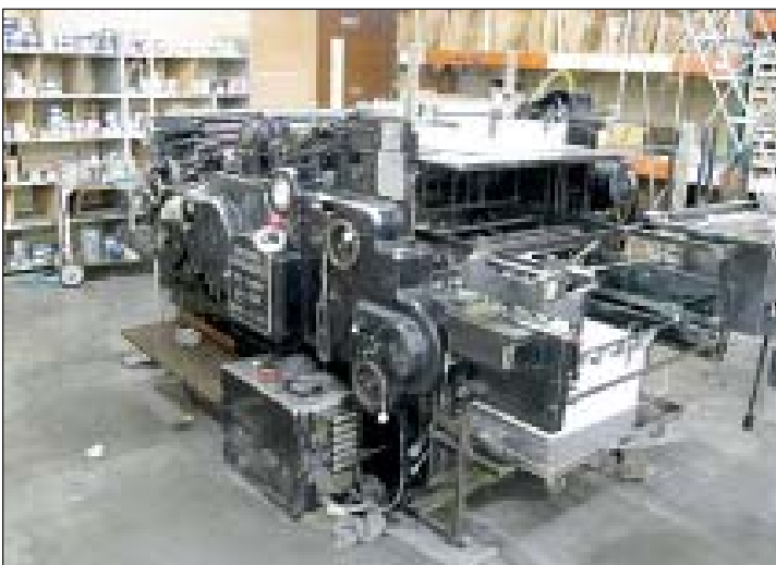
Heidelberg #SBBZ Die Cutter, 22"x 32"