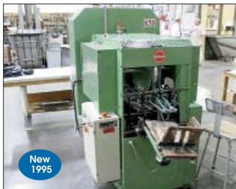
Kugler Automation Multi Hole Punch