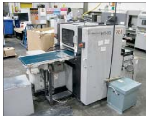
Horizon 3-Knife Trimmer Model HT-70