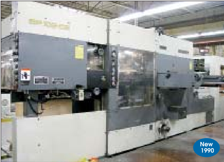
Bobst Auto Platen SP102-CE Die Cutter