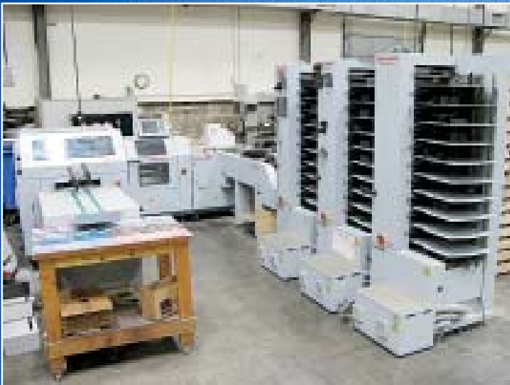
Horizon Stitchliner 5500