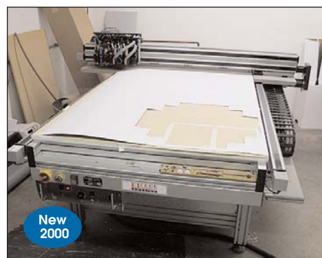
Elcede CNC Sample Maker Model NCP160-4S