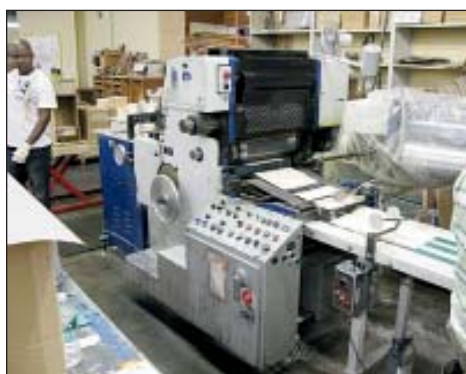
Ryobi Offset Duplicator Model 3200CD