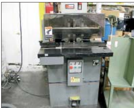
Baum 3-Spindle Drill