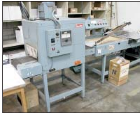
Shanklin Packaging Machine Model S24C