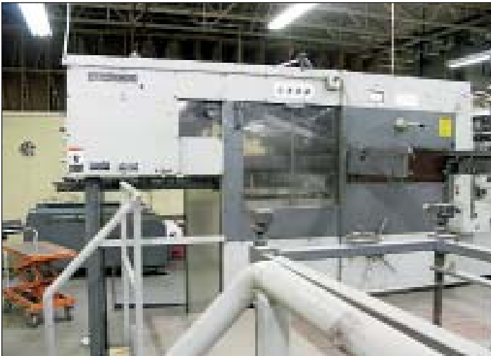
Bobst Die Cutter Model Auto Platen SP102E