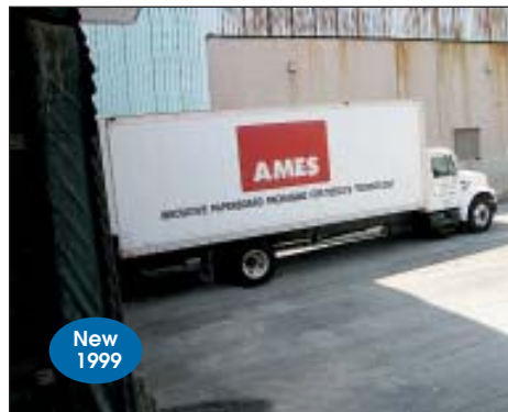
International 24' Box Truck Model 2700