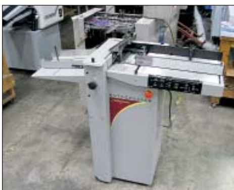
Morgana Auto Creaser