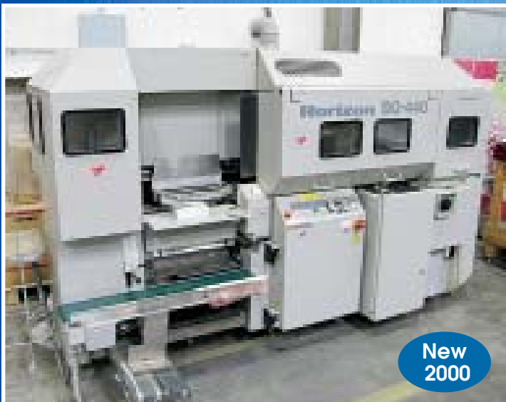
Horizon Perfect Binder Model BQ-440