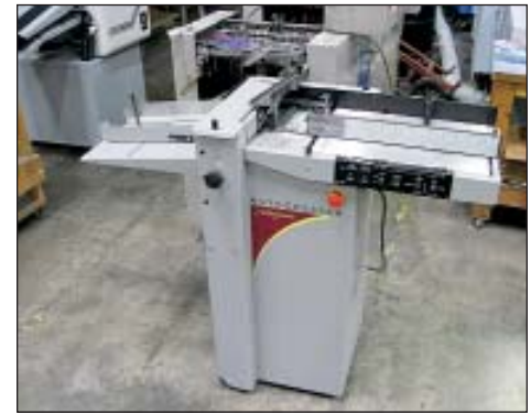
Morgana Auto Creaser