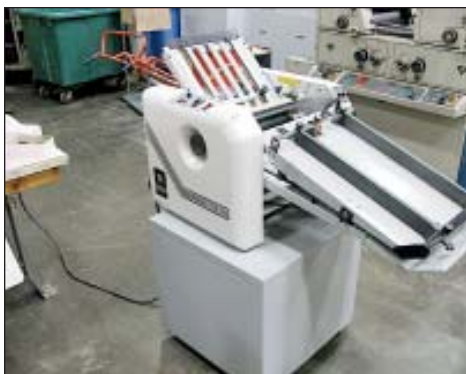
Baum Folder Model 714XLT