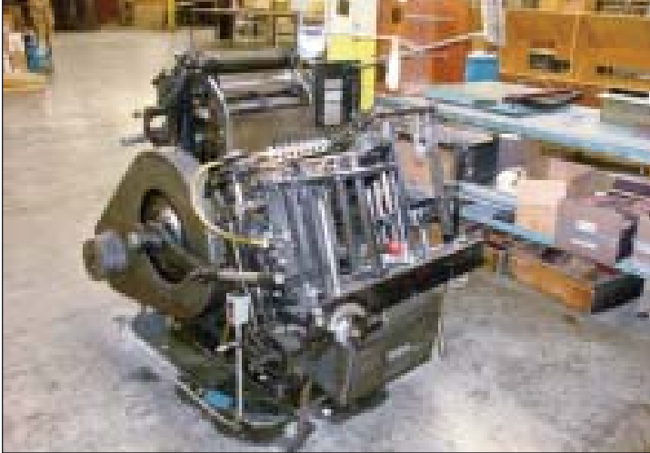
Heidelberg Original 14" x 22" Die Cutter