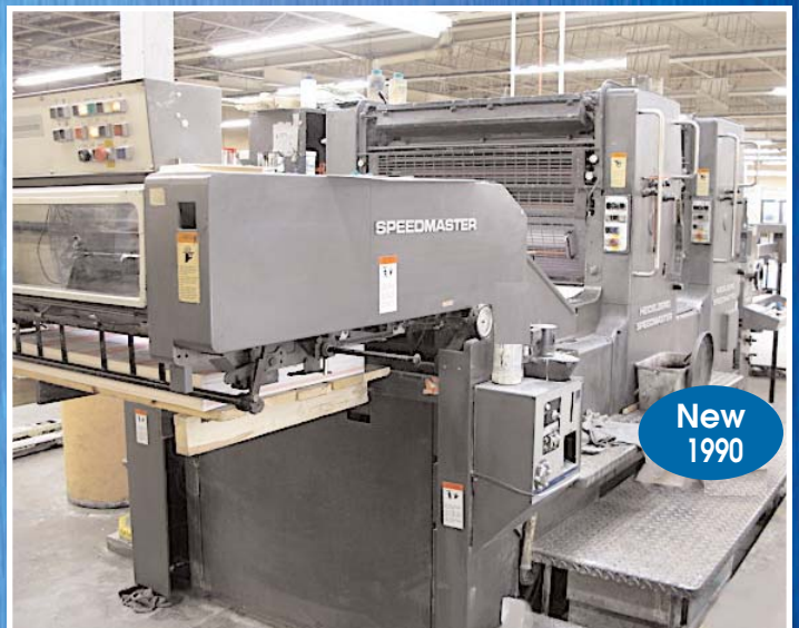
Heidelberg 2/C Printing Press Model 102ZP

SALE DATE: WEDNESDAY, JULY 21 • 10:30 AM (ET)