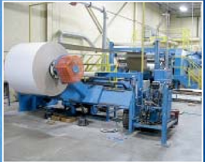
Jagenberg 65" Synchro-Sprint Sheeter