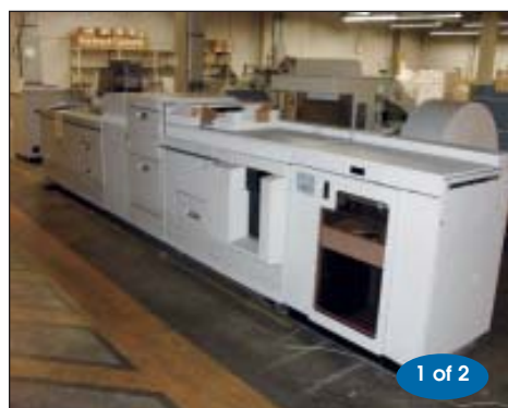
Xerox Digital Printing Press Model 6180