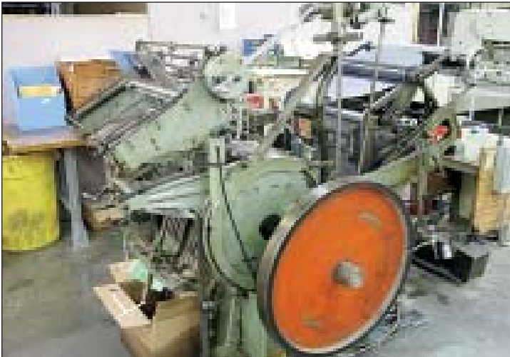
Kluge Model IND Die Cutter, 14x20