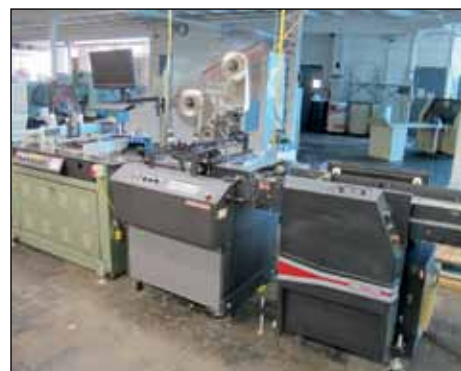
VARIABLE DATA PRINT SYSTEM W/ XI JET INKJET PRINTER AND SECAP JET 1 TABBER