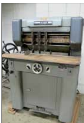
LAWSON HIGH SPEED PAPER DRILL MODEL HEAVY DUTY