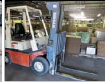
NISSAN LPG FORKLIFT MODEL 30