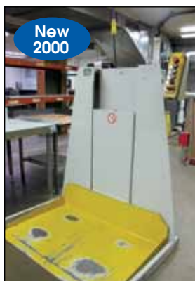
New 2000 POLAR MOHR PAPER LIFT MODEL LW1000-4