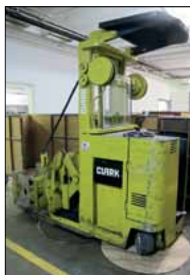
CLARK NARROW AISLE LIFT TRUCK W/ROLL CLAMP MODEL NP500-35