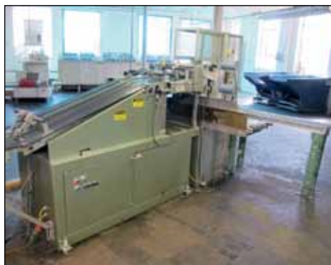
KIRK RUDY DELIVERY/STACKER MODEL 703