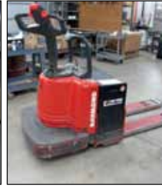
RAYMOND 3000 LB. ELECTRIC PALLET JACK