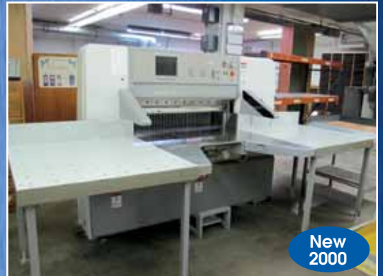
Polar Mohr Paper Cutter Model 115ED