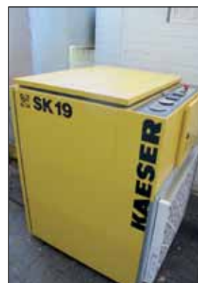
KAESER ROTARY SCREW AIR COMPRESSOR MODEL SK19