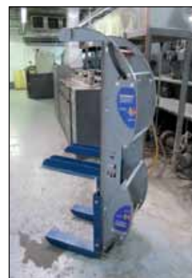
E-Z 41 PILE TURNER