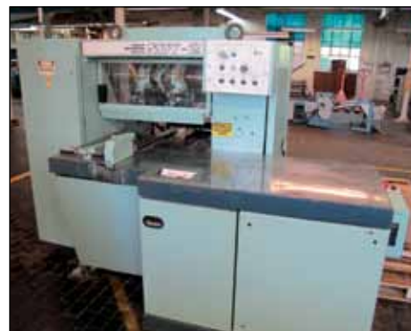
ORIGINAL PERFECTA POLYGRAPH 3-KNIFE TRIMMER MODEL SDY-2