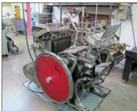
KLUGE DIE CUTTER