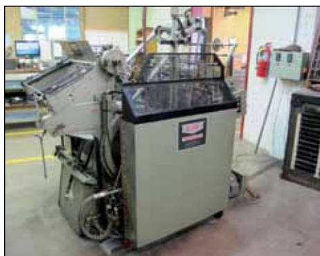
KLUGE DIE CUTTER / FOIL STAMPER MODEL EHD 14 X 22