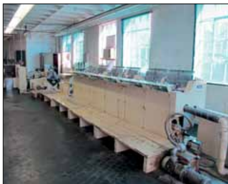
MCCAIN 2000 SADDLE STITCHER LINE