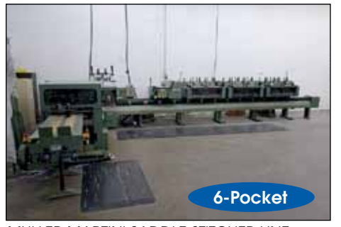
MULLER MARTINI SADDLE STITCHER LINE MODEL MINUTEMAN