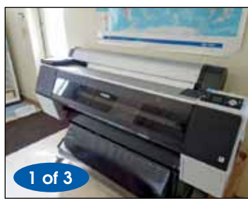
EPSON STYLUS PRO PROOFER