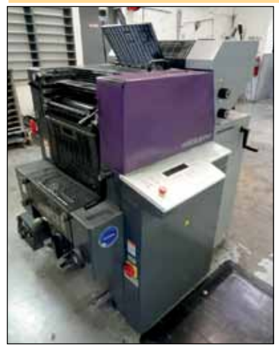
HEIDELBERG QUICKMASTER PRINTING PRESS MODEL QM-46-2