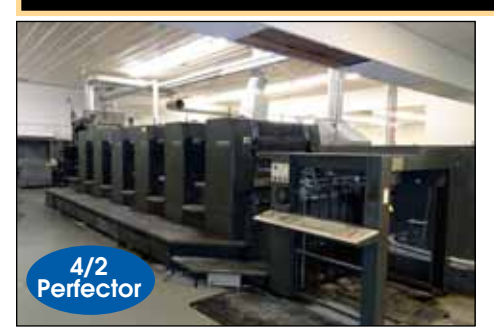
HEIDELBERG 6-COLOR SHEET FED PRINTING PRESS MODEL SM102-6-P3