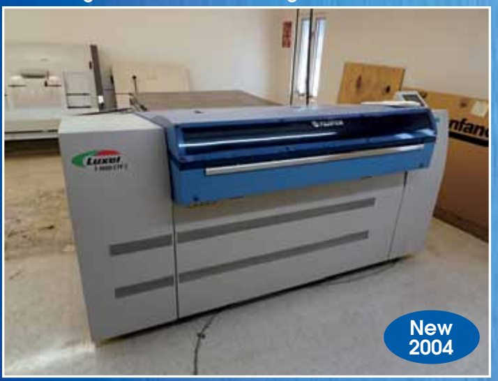
Fuji Film CTP System Model Javelin Luxel T9000 CTPII