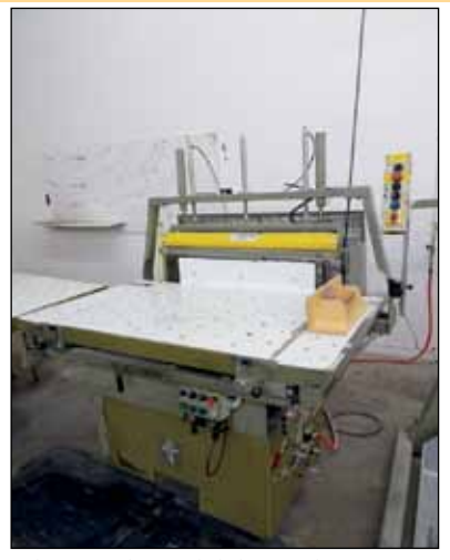
POLAR MOHR JOGGER MODEL RAB5