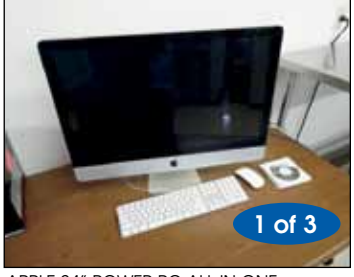
APPLE 24" POWER PC ALL IN ONE

Zeks High Temp Compressed Air Dryer Model HA040A100, S/N 202937