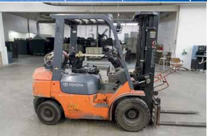
Toyota 5,000 lb LPG Forklift Model 7FGU25

THURSDAY, OCTOBER 12, 1:00 PM (ET) INSPECTION: WEDNESDAY, OCTOBER 11, 9 AM TO 4 PM (Local)