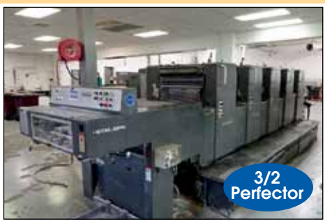
HEIDELBERG 5-COLOR SHEET FED PRINTING PRESS MODEL MOFP-H