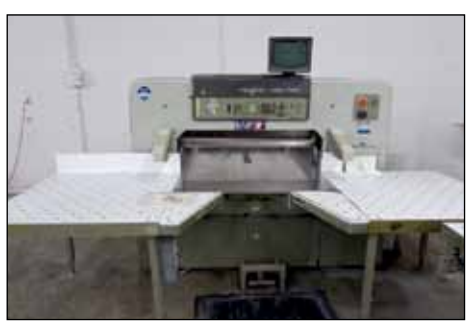
POLAR MOHR 45" PAPER CUTTER MODEL 115-EMC-MON