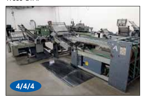
STAHL FOLDER MODEL TF78