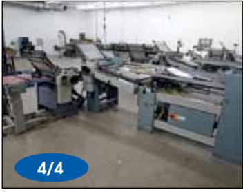
STAHL FOLDER MODEL TF56