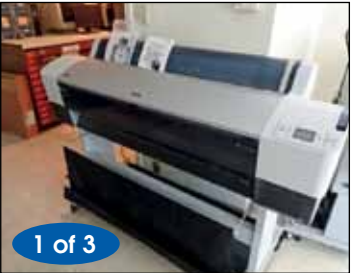
EPSON STYLUS PRO PROOFER