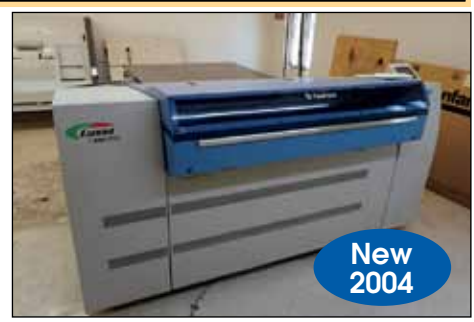
FUJI FILM CTP SYSTEM MODEL JAVELIN LUXEL T9000 CTPII