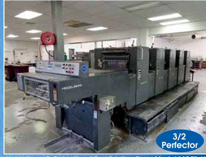
Heidelberg 5-Color Sheet Fed Printing Press Model MOFP-H