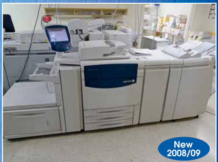
Xerox 700 Digital Color Press