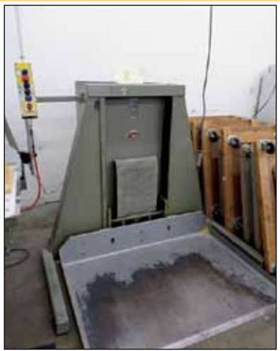
POLAR MOHR PAPER LIFT MODEL L-1000-W-6