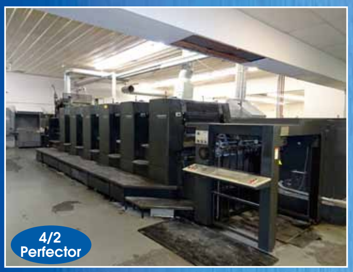
Heidelberg 6-Color Sheet Fed Printing Press Model SM102-6-P3

SALE DATE: THURSDAY, OCTOBER 12, 1:00 PM (ET) INSPECTION: WEDNESDAY, OCTOBER 11, 9 AM TO 4 PM (Local Time)