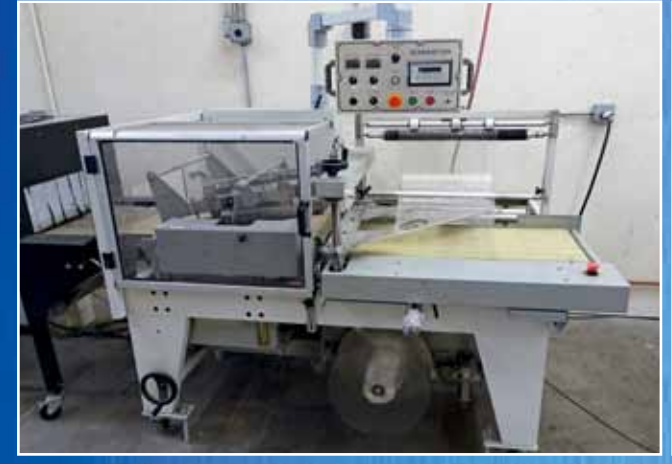
Texwrap L-Seal Automatic Packaging Machine Model 2219

THURSDAY, OCTOBER 12, 1:00 PM (ET) INSPECTION: WEDNESDAY, OCTOBER 11, 9 AM TO 4 PM (Local)