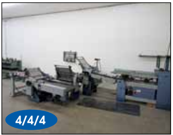
STAHL FOLDER MODEL TF56