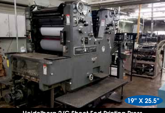
Heidelberg 2/C Sheet Fed Printing Press Model SORKZ