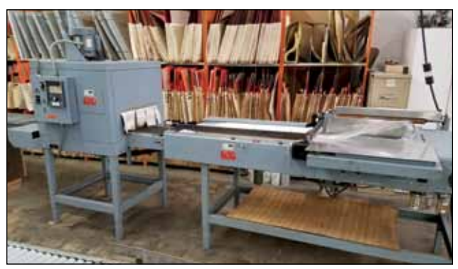
SHANKLIN A-2 SHRINK WRAPPER