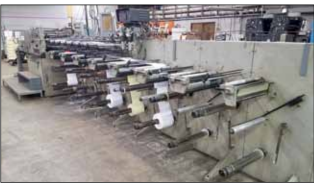
DIDDE 6-STATION WEB KLECT COLLATOR