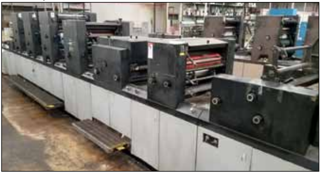
DIDDE 3/C WEB PRESS MODEL 860, 17.5" WIDTH, 17" CUT-OFF