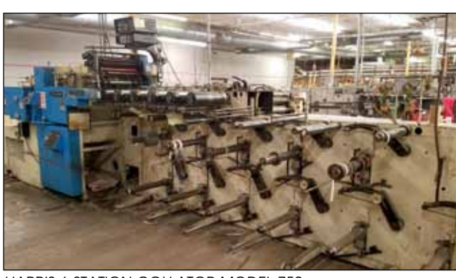
HARRIS 6-STATION COLLATOR MODEL 750