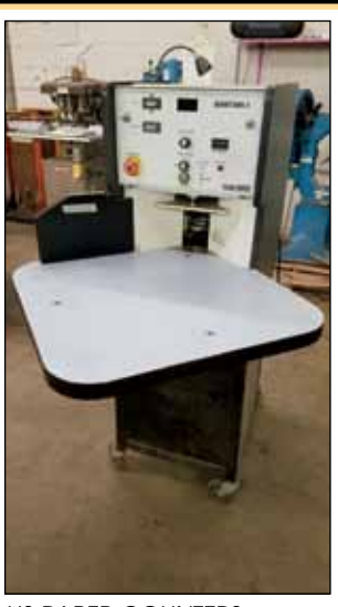
US PAPER COUNTERS BANTAM-1 PAPER COUNTER