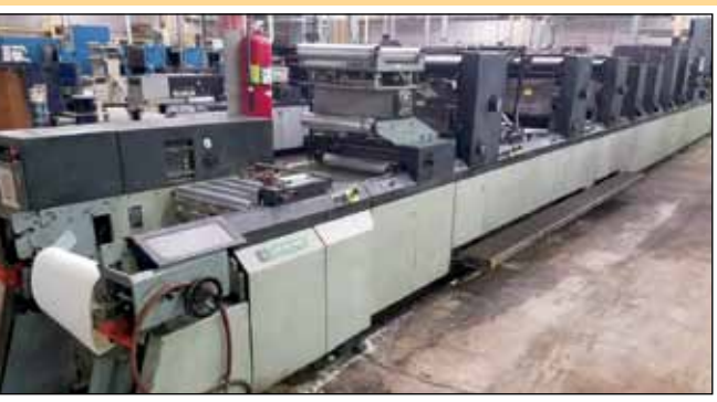
DIDDE 3/C WEB PRESS MODEL DGS-860, 18" WIDTH, 14" CUT-