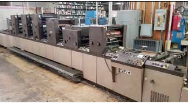
DIDDE 3/C WEB PRESS MODEL 860, 17.5" WIDTH, 17" CUT-OFF