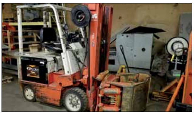
DATSUN ELECTRIC ROLL CLAMP FORKLIFT MODEL CYB02