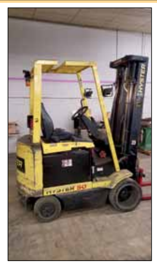
HYSTER 5000 LB ELECTRIC FORKLIFT MODEL 50 W/ROLL CLAMP