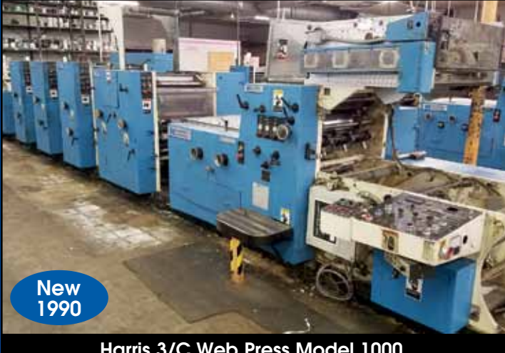
Harris 3/C Web Press Model 1000, 20.5" Width, 22" Cut-Off