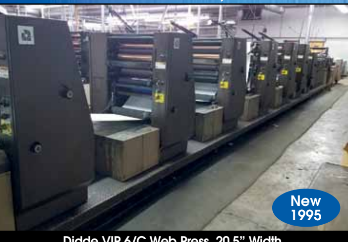
Didde VIP 6/C Web Press, 20.5" Width, Variable Cut-Off 17", 22" & 24"