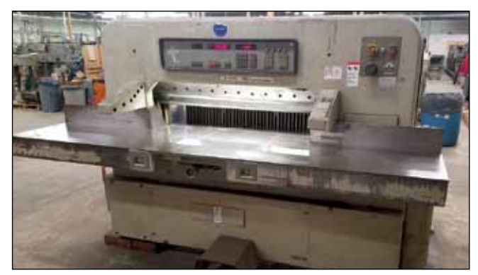
POLAR MOHR PAPER CUTTER MODEL 115EMC