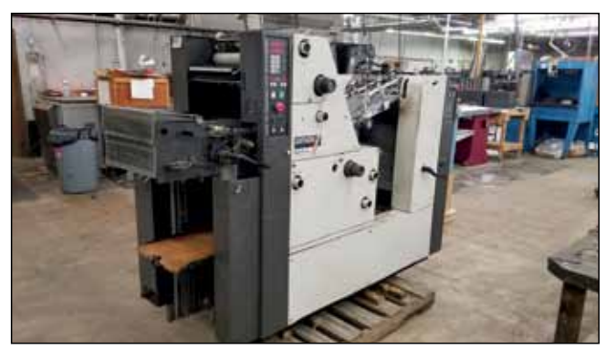
HAMADA OFFSET PRINTING PRESS MODEL DUETTO IIS