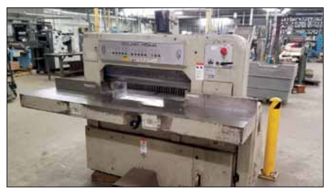
POLAR MOHR PAPER CUTTER MODEL 92 CE