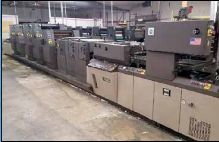
Didde VIP 4/C Web Press, 20.5" Width, Variable Cut-Off