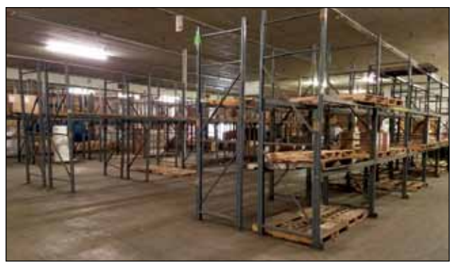
VIEW OF PALLET RACKING