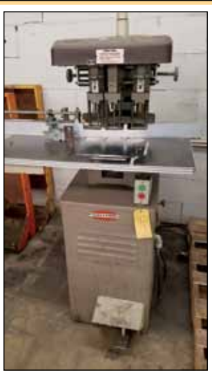
CHALLENGE EH-3A PAPER