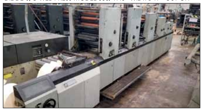
DIDDE 2/C WEB PRESS MODEL 175, 17.5" WIDTH, 17" CUT-OFF