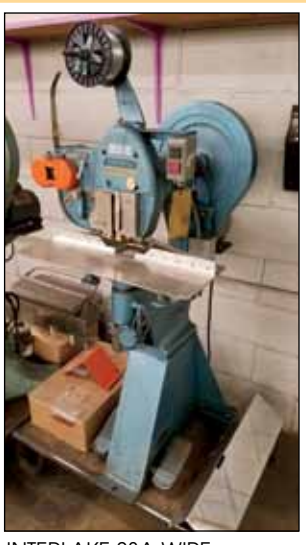
INTERLAKE S3A WIRE STITCHER