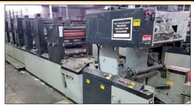
DIDDE 5/C WEB PRESS, 20.5" WIDTH, 22" CUT-OFF