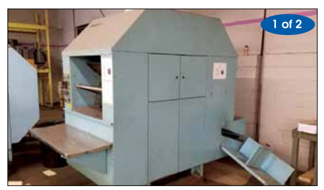
KANSA PADDER KP2824