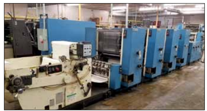
HARRIS 3/C WEB PRESS MODEL NMC1000H, 20.5" WIDTH, 22" CUT-OFF