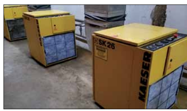
(3) KAESER ROTARY SCREW AIR COMPRESSORS MODEL SK26