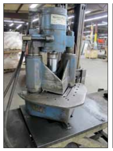
WHITNEY 18-TON 6" HYDRAULIC CORNER NOTCHER MODEL 610