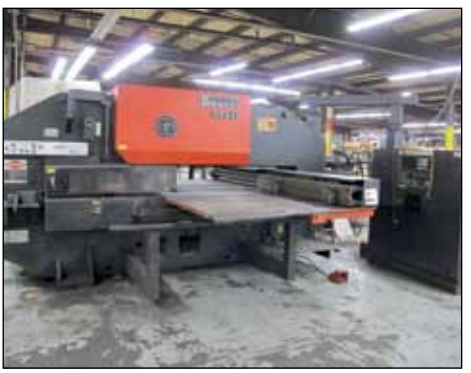
AMADA 30-TON TURRET PUNCH MODEL PEGA-305072