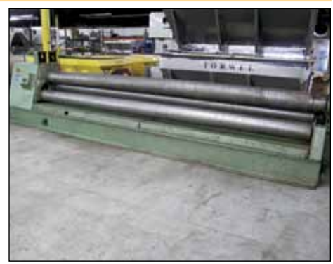
ROUNDO 14' HYDRAULIC 3-ROLL PLATE BENDER MODEL PS205