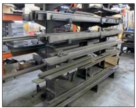
LARGE ASSORTMENT OF PRESS BRAKE DIES