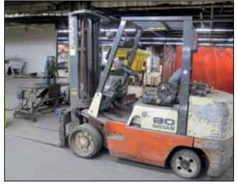
NISSAN 8,000 LB LPG FORKLIFT TRUCK MODEL 80