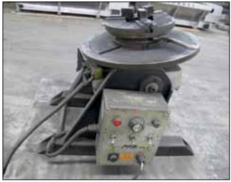
PROFAX WELDING POSITIONER