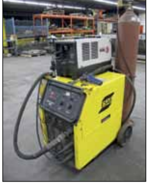
ESAB 300A MULTIMASTER 260 MIG/TIG WELDER

Harrison Tool Room Lathe Model 600, S/N 160268, 12-2500 RPM