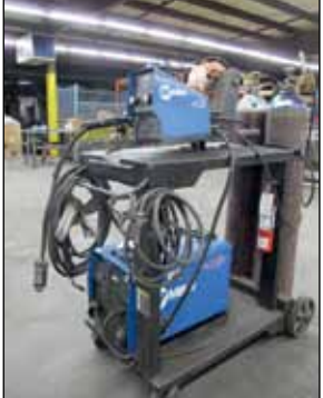
MILLER INVISION 436P DC INVERTER ARC WELDER

Whitney 18-Ton 6" Hydraulic Corner Notcher Model 610, S/N 610-096-12698