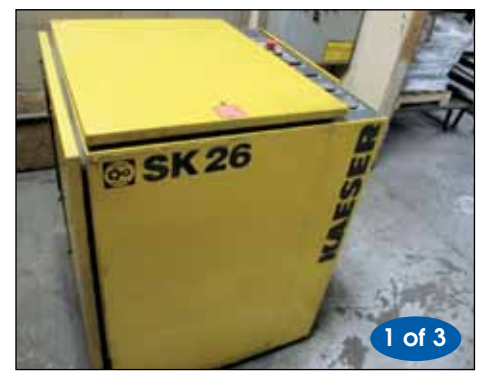
KASER 20 HP ROTARY SCREW AIR COMPRESSOR MODEL SK26