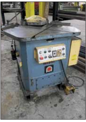
AMADA HYDRAULIC POWER NOTCHER MODEL CSW-220