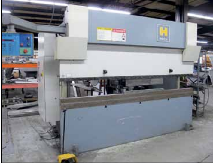
HACO 120-TON CNC PRESS BRAKE MODEL SYNCHROMASTER SRM120-10