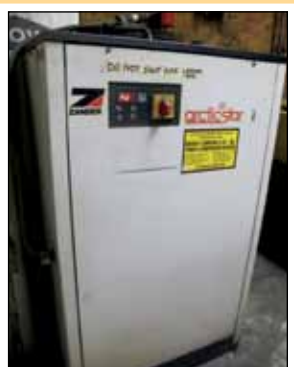
ZANDER ARTIC STAR COMPRESSED AIR DRYER