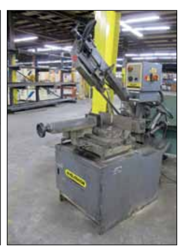
HYD-MECH HORIZONTAL BAND SAW MODEL DM8