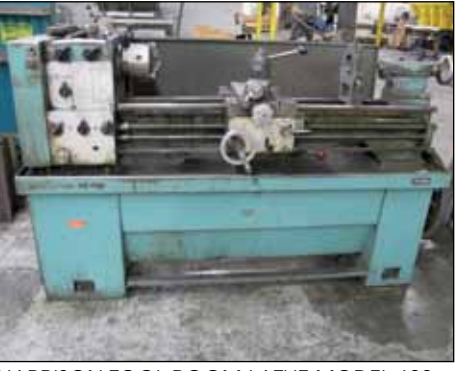
HARRISON TOOL ROOM LATHE MODEL 600

Process Heating Co. Gas Fired Walk in Drying Oven, S/N 1654, 500 Degrees F Max Temp, 500 MMTBU, Partlow Temp Control, Approx 12' X 7 1/2' X 7' H, 36" X 75", Overhead Exhaust