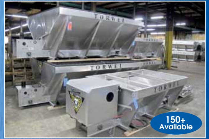
Large Offering of Ace Torwel Products

Omax Water Jet Cutting System Model Maxiem 2040