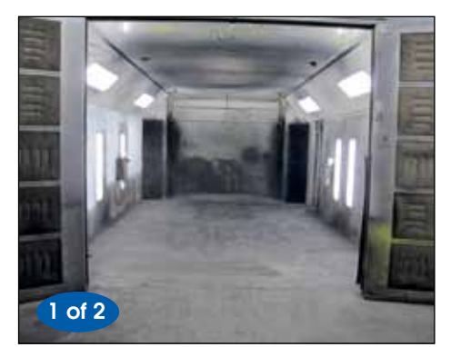
COOL-MET MODULAR GALVANIZED WALK IN SPRAY BOOTH