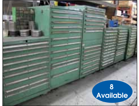
VIEW OF VIDMAR CABINETS