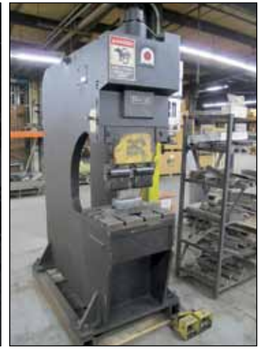
AMADA 30-TON HYDRAULIC C-FRAME PRESS MODEL SPH-30C