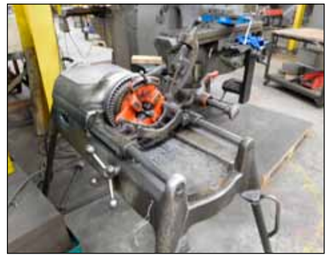
RIGID 535 PIPE THREADER