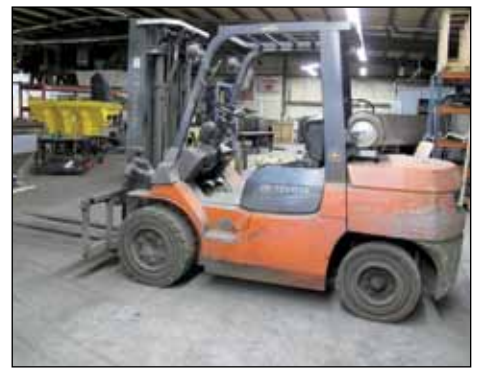
TOYOTA 8,000 LB LPG FORKLIFT TRUCK MODEL 7FGKU40