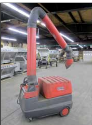
LINCOLN ELECTRIC PORTABLE EXHAUST HOOD