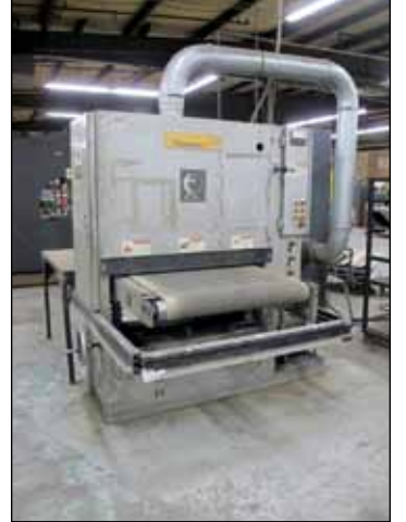
TIME SAVER BELT SANDER MODEL 137-1HP/75