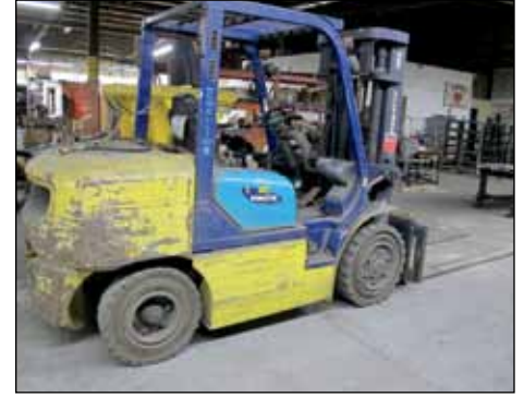
KOMATSU 6,500 LB LPG FORKLIFT TRUCK MODEL FG4021-7