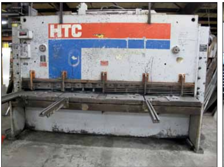
HTC HYDRA-TOOL 10' SHEAR MODEL 500-10-PSII