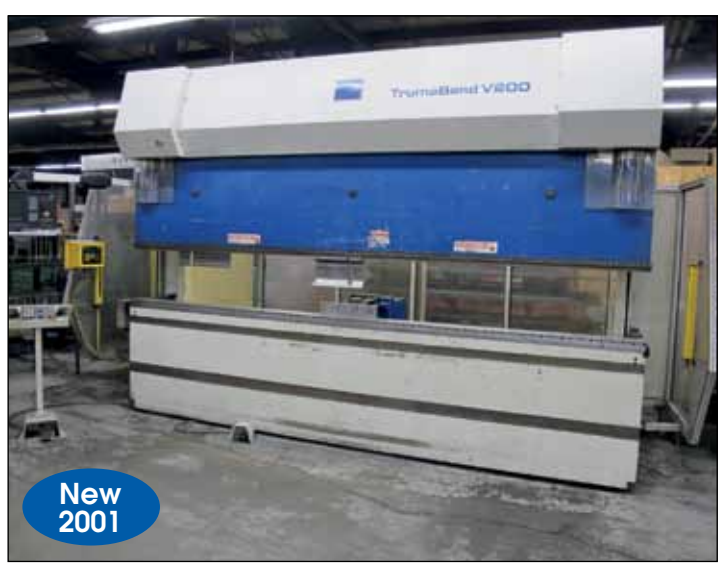
TRUMPF 220-TON CNC HYDRAULIC PRESS BRAKE MODEL TRUMABEND V200