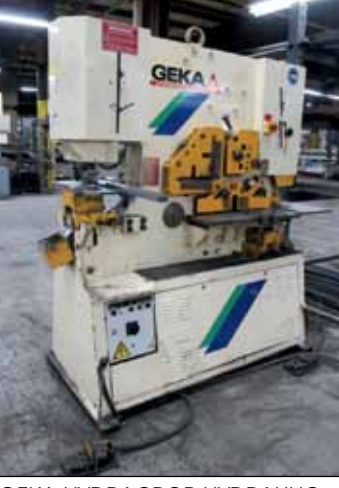
GEKA HYDRACROP HYDRAULIC IRONWORKER MODEL HYD110