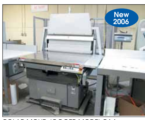
POLAR MOHR JOGGER MODEL RA4