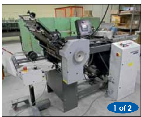
STAHL HEIDELBERG 20" PILE FEED FOLDER MODEL 1220E-4-P-3