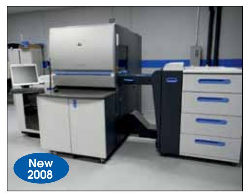
HEWLETT PACKARD INDIGO 5500 DIGITAL PRINTING PRESS