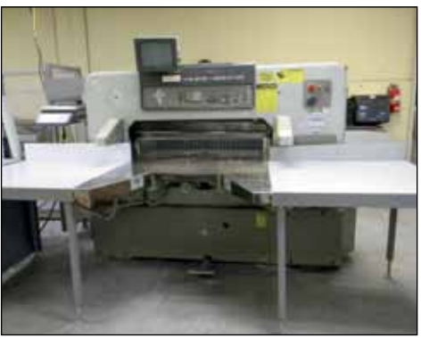
POLAR MOHR 45" PAPER CUTTER MODEL 115-EMC-MON