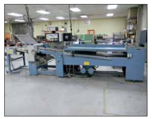
MBO 26" FOLDER MODEL B26