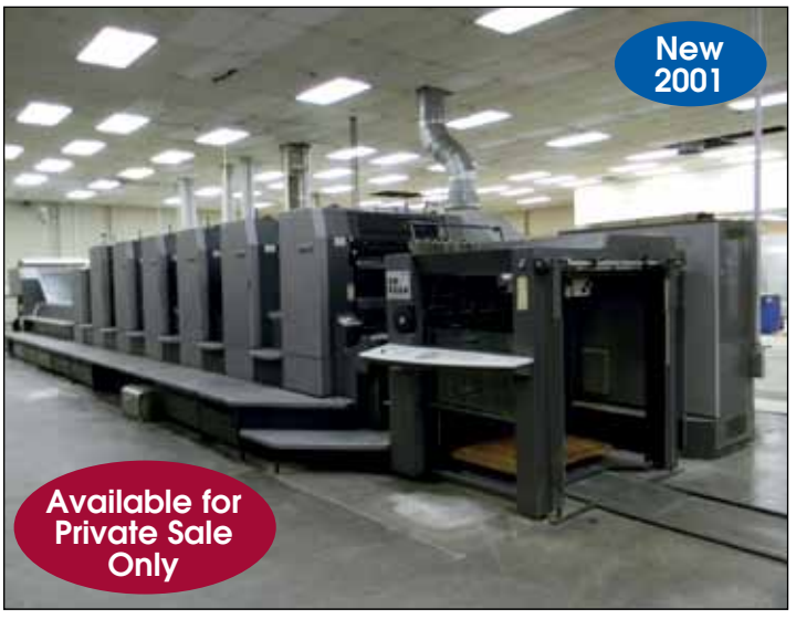
HEIDELBERG 6-COLOR SHEET FED PRINTING PRESS MODEL CD102-6+L