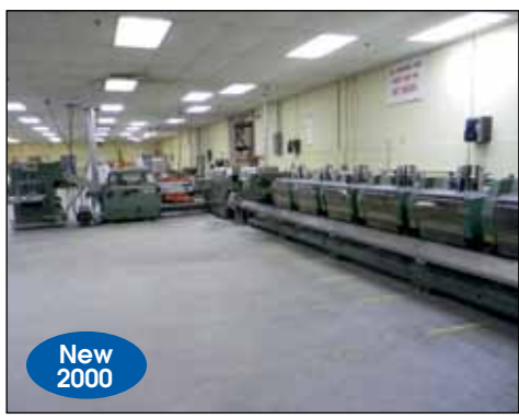
MULLER MARTINI BRAVO-T SADDLE STITCHER