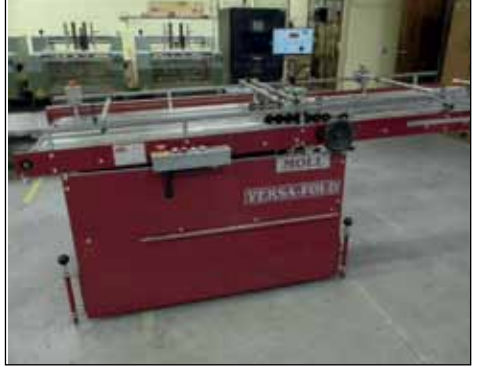
DICK MOLL 30" VERA FOLD MODEL