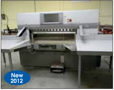
POLAR MOHR 54" PAPER CUTTER MODEL 137-XT-PI US