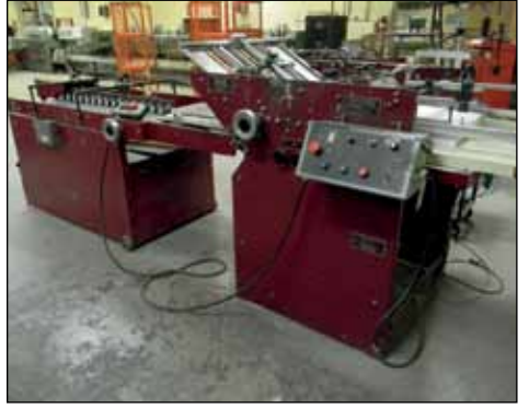
DICK MOLL POCKET FOLDER GLUER