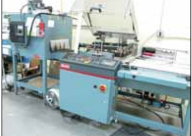
SHANKLIN L-SEAL PACKAGING MACHINE # A26A

Seal Laminator Model Image 410 GBC Laminator Model Discovery 80, S/N TBRO261LR711850