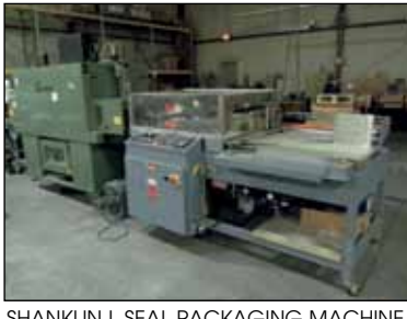
SHANKLIN L-SEAL PACKAGING MACHINE MODEL A27A