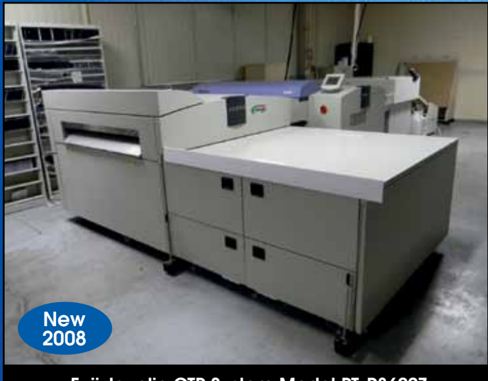
Fuji Javelin CTP System Model PT-R8600Z