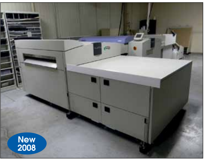
FUJI JAVELIN CTP SYSTEM MODEL PT-R8600Z