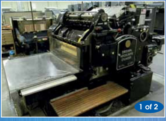
Heidelberg SBG Cylinder Die Cutter Press 22" x 30.25"

INSPECTION DATE: Tuesday, December 12, 9 AM TO 4 PM (LOCAL TIME)