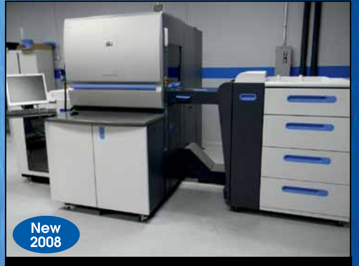
Hewlett Packard Indigo 5500 Digital Printing Press