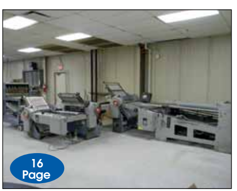
STAHL 26" FOLDER MODEL $1426B