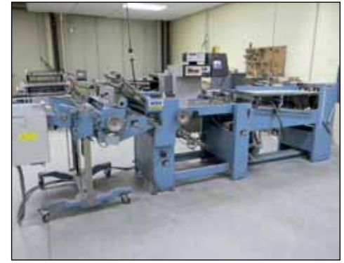
MBO 20" FOLDER MODEL B20