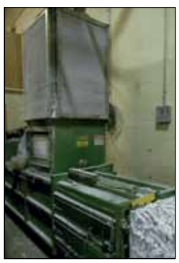
MAREN HORIZONTAL BALER # 423