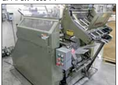
KLUGE 14" X 22" HOT FOIL EMBOSSER S/N EHD 145551