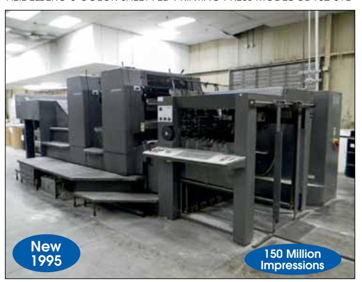
HEIDELBERG 2-COLOR SHEET FED PRINTING PRESS MODEL SM102-2P