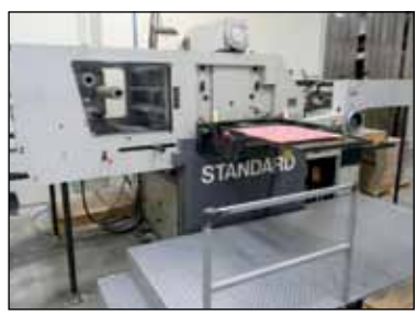
STANDARD STARMATIC FOIL STAMPER