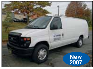
FORD E250 VAN