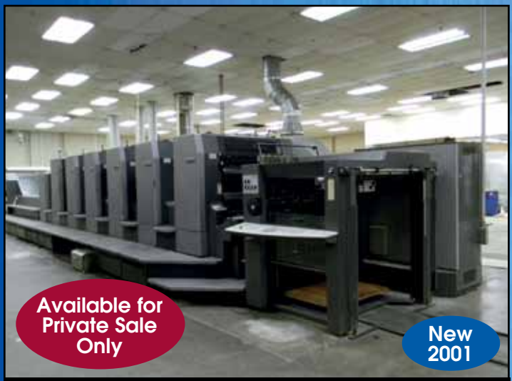
Heidelberg 6-Color Sheet Fed Printing Press Model CD102-6+L

SALE DATE: WEDNESDAY, DECEMBER 13,1:00 PM (ET) OPEN HOUSE INSPECTION: TUESDAY, DECEMBER 12, 9 AM TO 4 PM (LOCAL TIME)