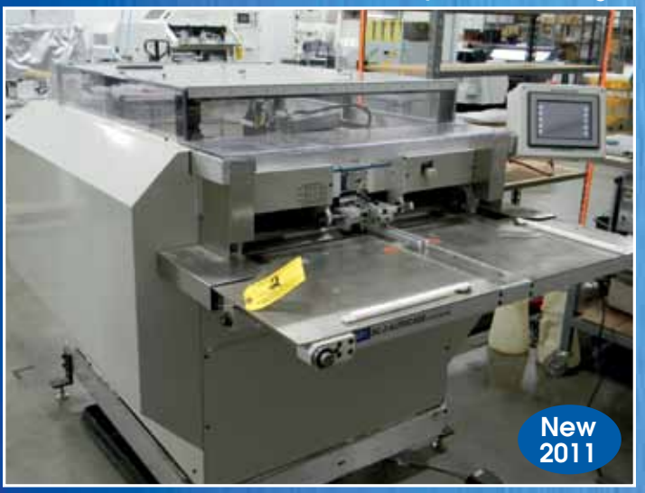
GP2 Technologies Autocase Machine Model SC-2