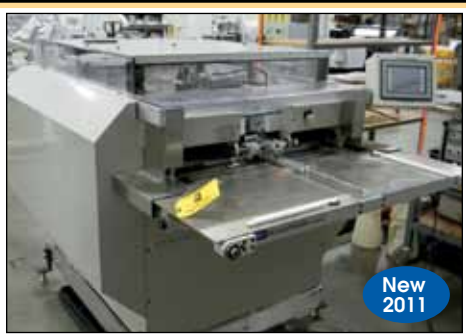
GP2 TECHNOLOGIES AUTOCASE MACHINE MODEL SC-2

Fuji Digital Photo Book Printer Model Minilab Frontier 570, S/N 3135082 Fuji Digital Photo Book Printer Model Minilab Frontier 570, S/N 3135360