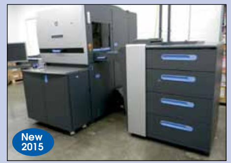
HP INDIGO 5600 DIGTAL PRINTING PRESS