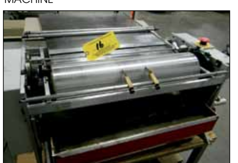
GP2 TECHNOLOGIES GLUER