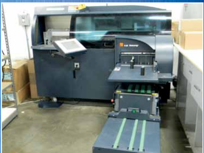
CP Bourg Perfect Binder Model BB3002-EVA