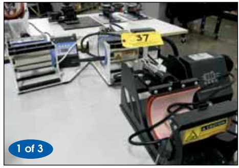
RINCON HORIZONTAL MUG HEATER PRESS