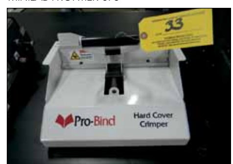
PRO BIND HARD COVER CRIMPER