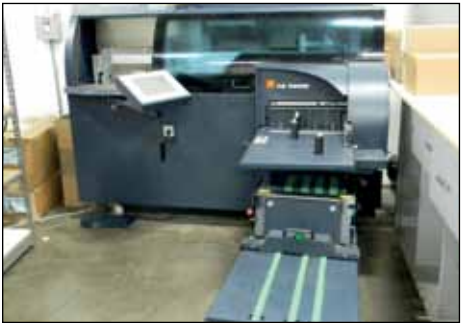
CP BOURG PERFECT BINDER MODEL BB3002-EVA