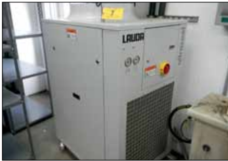
LAUDA CHILLER MODEL ULTRACOOL UC-0140SP