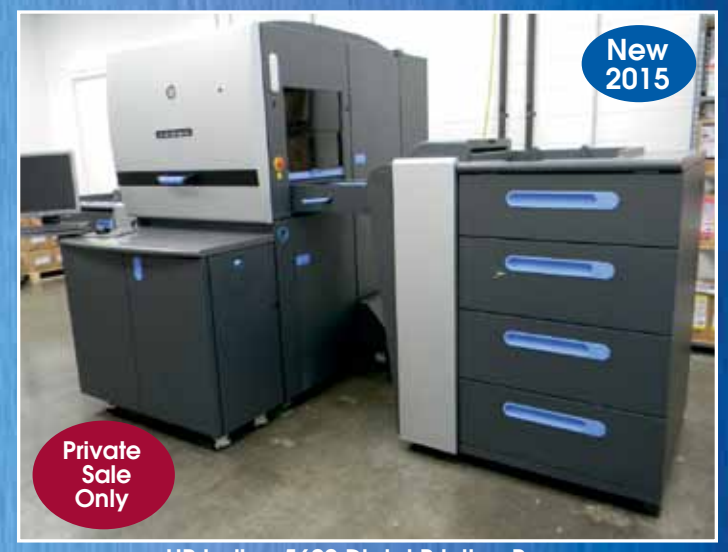
HP Indigo 5600 Digtal Printing Press