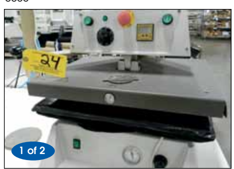
INSTA HEAT HOT SEAL PRESS MODEL 721