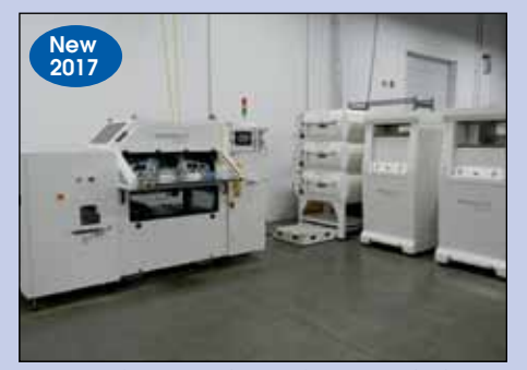
IEN INDUSTRIE AUTOMATICA VP PHOTO STORY BOOK PROCESSING SYSTEM

Count Machinery EZ Creaser Model 2016, Lauda Chiller Model Ultracool UC-0140SP, Power Ex 5 HP Rotary Screw Air Compressor Model ACS-40, (2) Duster 3000 & 2000 Dust Collectors, Jet Dust Collector Model DC-1100VX, Amco Humidity system