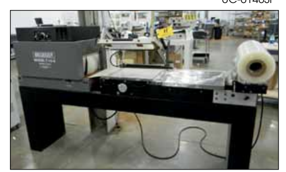
BESSLER L-SEAL PACKAGING MACHINE MODEL 1913-GSM