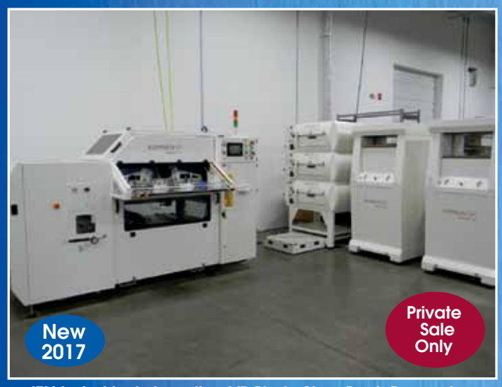
IEN Industrie Automatica VP Photo Story Book Processing

SALE DATE: THURSDAY, MARCH 15, 1:00 PM (ET) INSPECTION: WEDNESDAY, MARCH 14, 9 AM TO 4 PM (Local Time)