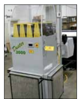
DUSTER 3000 DUST