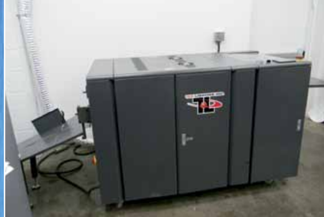
DUPLO Slitter/Cutter/Creaser Model DC-645