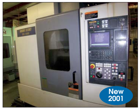
MORI SEIKI VMC MODEL SV-403