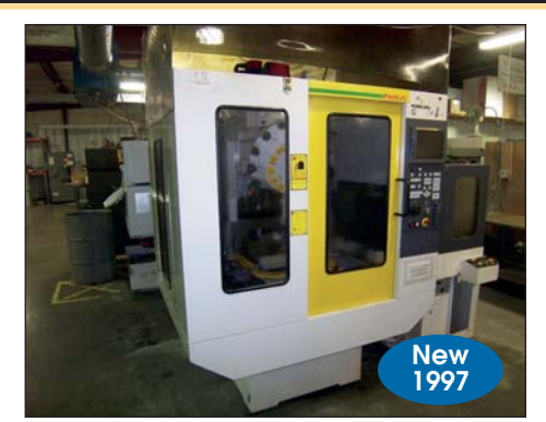
FANUC ROBODRILL MODEL ROBODRILL MODEL A-T14I