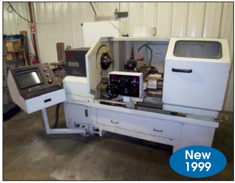
FRYER CNC LATHE MODEL ET-18