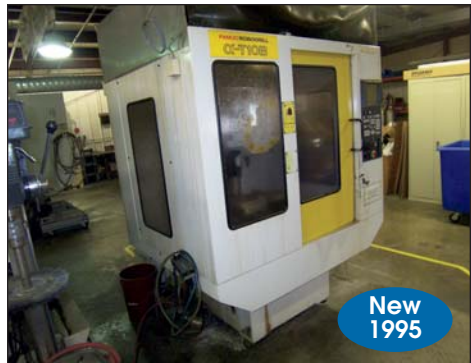
FANUC ROBODRILL MODEL ROBODRILL MODEL A-T10