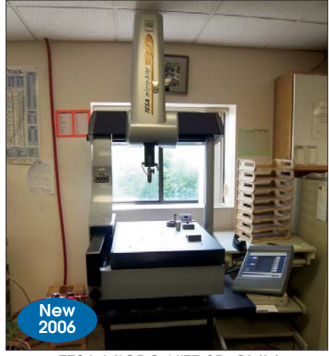
TESA MICRO-HITE 3D CMM