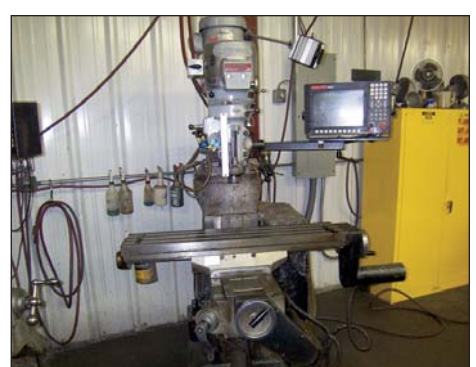
BRIDGEPORT 2 HP SERIES 1 VERTICAL MILLING