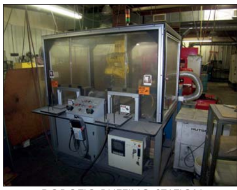
ROBOTIC BUFFING STATION W/ FANUC LR MATE 2001

2000 TCM 5,000 LB. LPG Forklift Model FG25N5T S/N A31T59195, 130" Lift Ht, 2-Stage Mast, Side Shift, Pneumatic Tires,