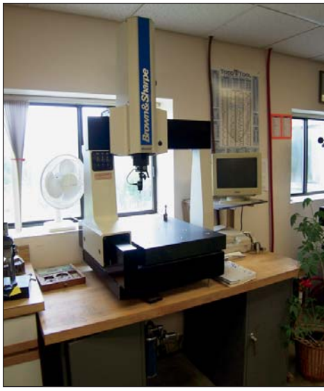
BROWN & SHARP MICROVAL CMM

Clausing 14" Optical Comparator Model 4301, S/N 430283, 6" x 13", Work Stage Misc. Inspection Tooling Including: Lock Gauges, Pin Gauges, Micrometers, Height Stands, Thread Gauges, Veneers, Etc.