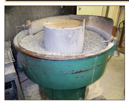
SWEECO 64" FINISHING MILL