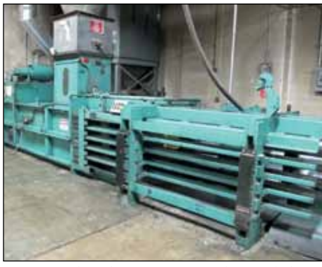
MAREN HORIZONTAL BALER MODEL 72-OE-76 AUTO

(3) Crown Electric Pallet Jack Model WP2300, S/N 5A394325, 5A394324 & 5A394323