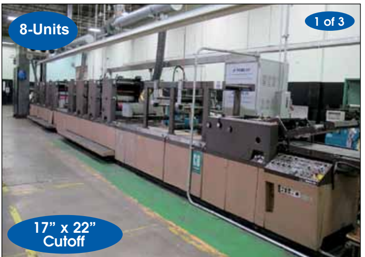
DIDDE ML WEB PRINTING PRESS