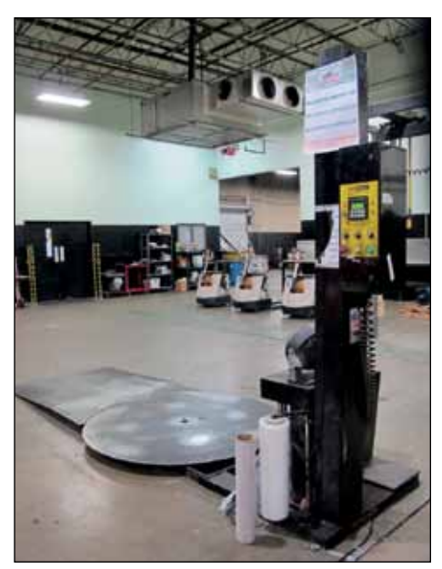
IPM ROTARY STRETCH PALLET WRAPPER MODEL LP/10PPS