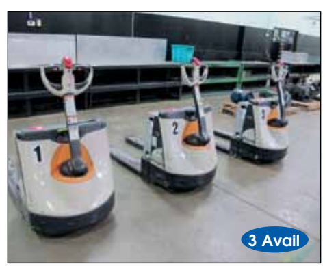
CROWN ELECTRIC PALLET JACK MODEL WP2300

FS Curtis Compressed Air Dryer, S/N 460090800