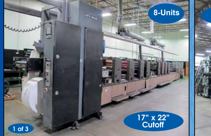
Didde ML Web Printing Press

The Flyer, Inc. 201 Kelsey Lane, Unit A, Tampa, FL 33619 SALE DATE: WEDNESDAY, AUGUST 15, 1:00 PM (ET) OPEN HOUSE INSPECTION: TUESDAY, AUGUST 14, 9 AM TO 4 PM (LOCAL TIME)