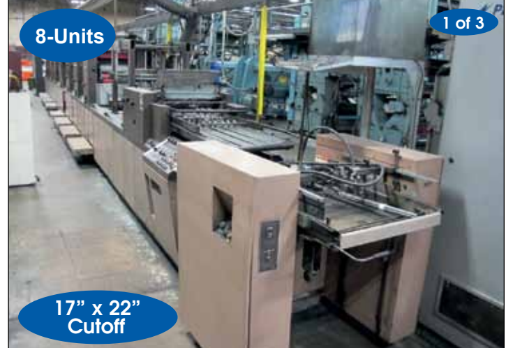
DIDDE ML WEB PRINTING PRESS