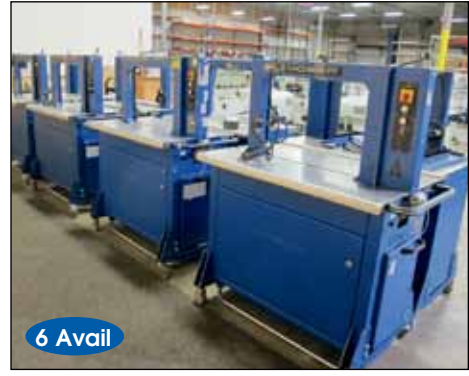
EAM MOSCA STRAPPER MODEL ROMP4

Challenge Jogger Model COMPANION Bench Top