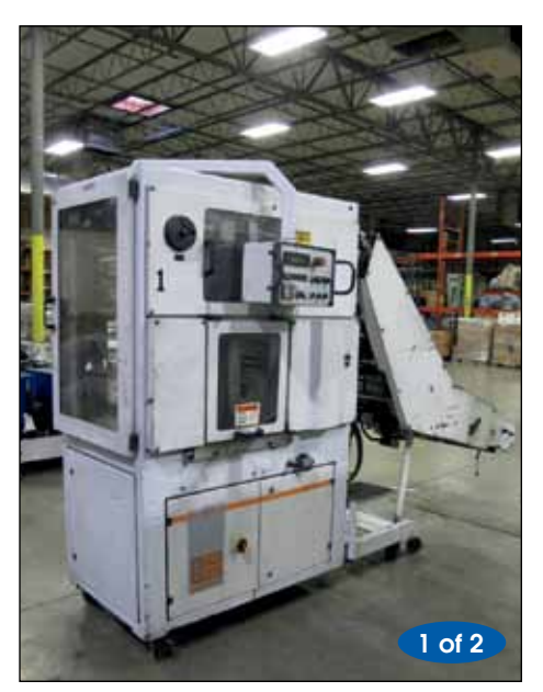
GAMMERLER STACKER MODEL KL507/1