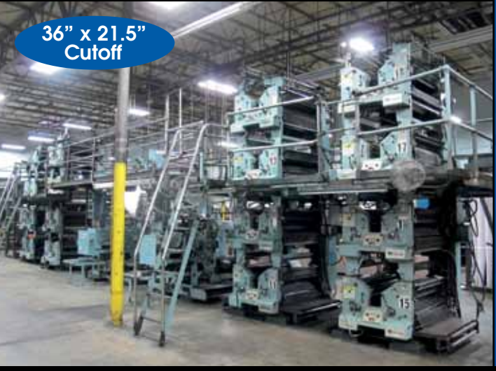
Goss Open Web Newspaper Press