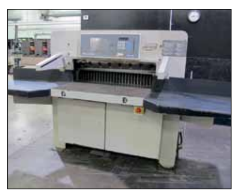
CHALLENGE CHAMPION PAPER CUTTER MODEL 370XT