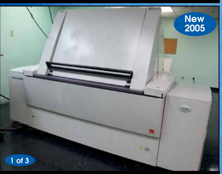
Creo Newsetter CTP Model TSM