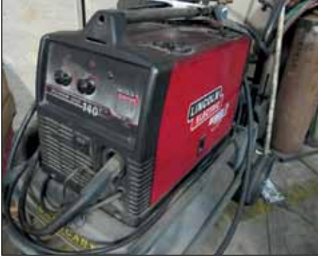
LINCOLN POWER MIG 140 WELDER