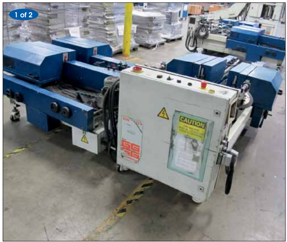
GAMMERLER INLINE ROTARY TRIMMER MODEL RS101