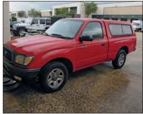
1998 TOYOTA TACOMA PICKUP

ONLINE PRINTING AUCTION COMPLETE CLOSURE OF NEWSPAPER & PUBLICATIONS PRINTER GOSS & DIDDE WEB PRESSES • IN-LINE PRESS EQUIPMENT CTP MACHINES • COMPLETE BINDERY • PLANT SUPPORT