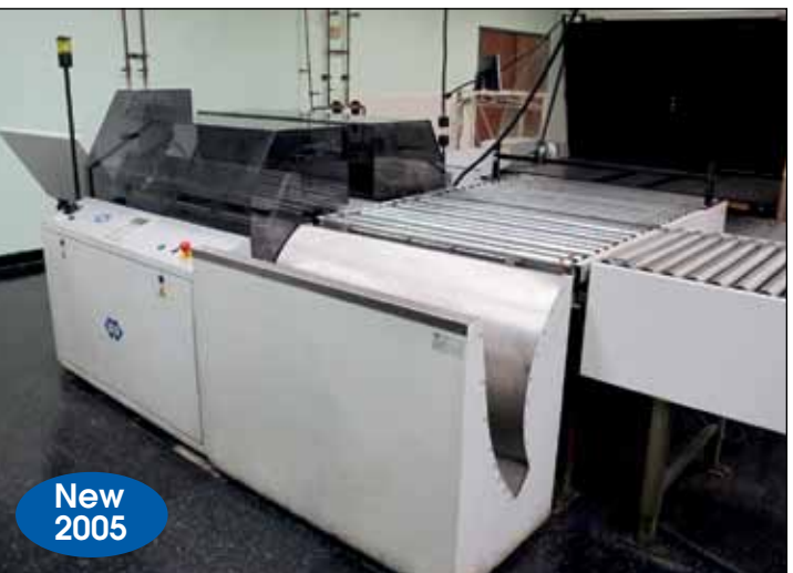
NELLA PLATE REGISTER PUNCH SYSTEM MODEL RAO-900S