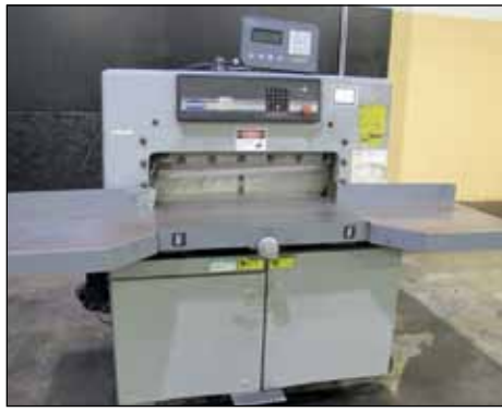
CHALLENGE PAPER CUTTER MODEL 305MPC

(6) EAM Mosca Strapper Model ROMP4, (New 2005)