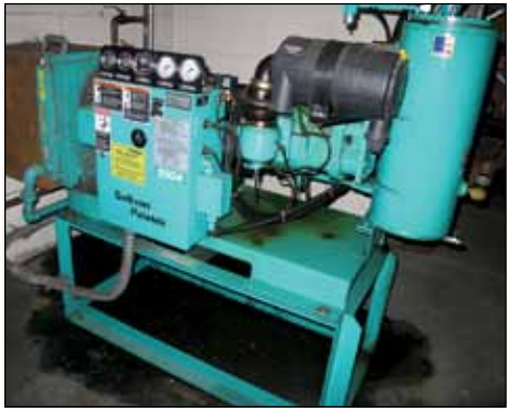
SULLIVAN PALATEK ROTARY SCREW AIR COMPRESSOR MODEL 25-D4