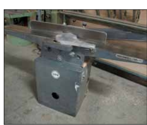
ROCKWELL DELTA 10" JOINTER