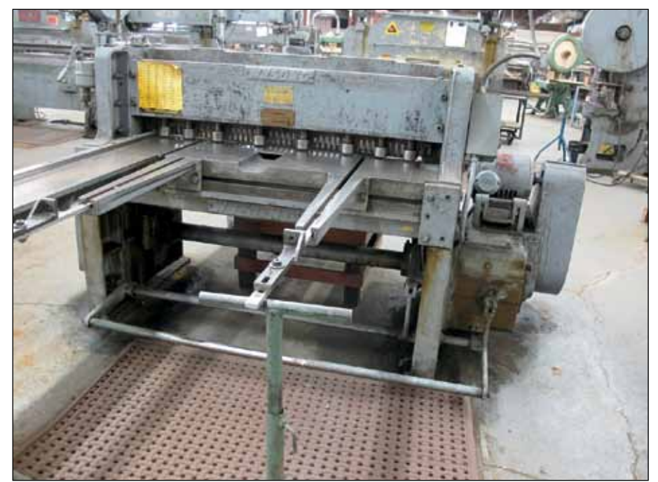
WYSONG 4' POWER SQUARING SHEAR