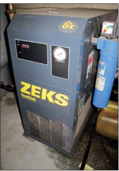
ZEKS COMPRESSED AIR DRYER