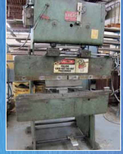
Chicago Dries & Krump 4' x 15 Ton Press Brake Model L35-L13845

INSPECTION DATE: TUESDAY, JUNE 5, 9 AM TO 4 PM (LOCAL TIME)