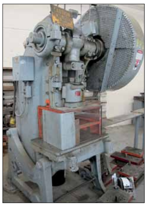
L&J #5 OBI PRESS