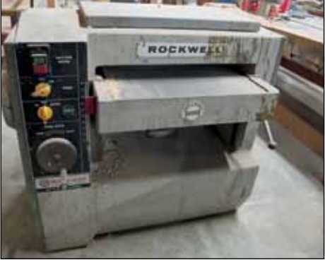
ROCKWELL PLANER, 24" X 9"

(2) Shuster Wire Straightener/Cutoff Machine