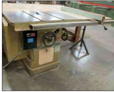
POWERMATIC TABLE SAW