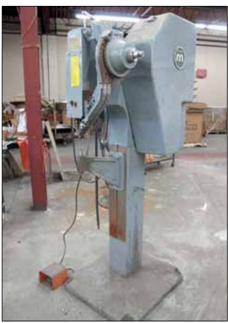
MILFORD RIVET MACHINE