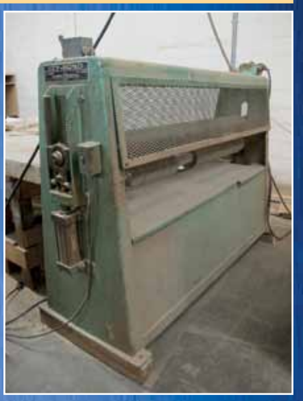
Evans Royal EZY-Bond Pinch Rolls Model 200B