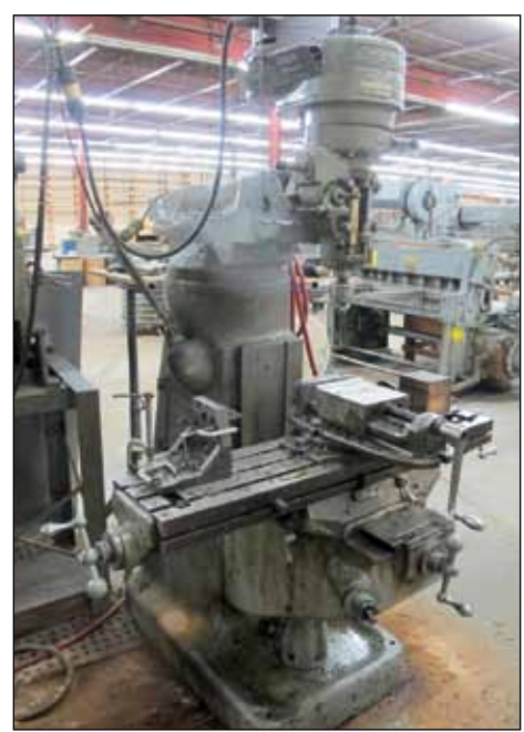
BRIDGEPORT 1 HP MILLING MACHINE