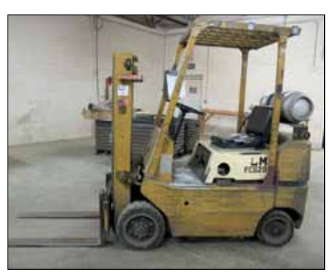
TCM 3000 LB FORKLIFT MODEL FCG20N5

Leech 6" x 12" Hand Feed Surface Grinder