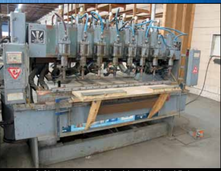
Lors 8-Station Welder Machine MW1 w/ Entron Controls

Shuster Wire Straightener/Cutoff Machine