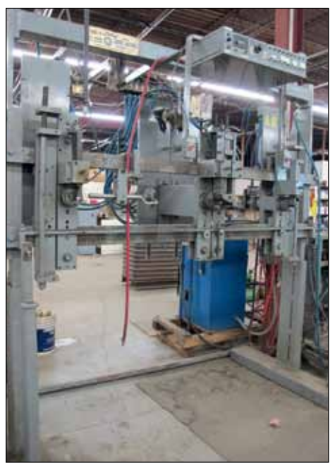
LUBOW BENDING MACHINE COMPACT FOLDING BRAKE MODEL CFB18,