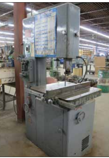
DOALL VERTICAL BAND SAW