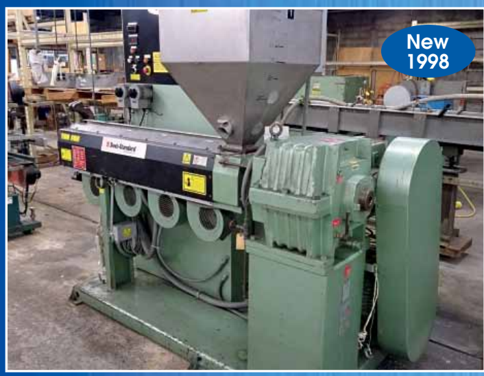
2.5 Davis Extruder 25/1 L/D

SALE DATE: WEDNESDAY, September 26, 1:00 PM (ET) INSPECTION: TUESDAY, September 25, 9 AM TO 4 PM (ET)