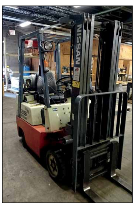
NISSAN FORK LIFT 3500LB TRIPLE MAST SIDE SHIFTER

Sanford 6 x 12 Hand Feed Surface Grinder