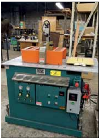
CDS UP CUT SAW MODEL CTS6.5-13