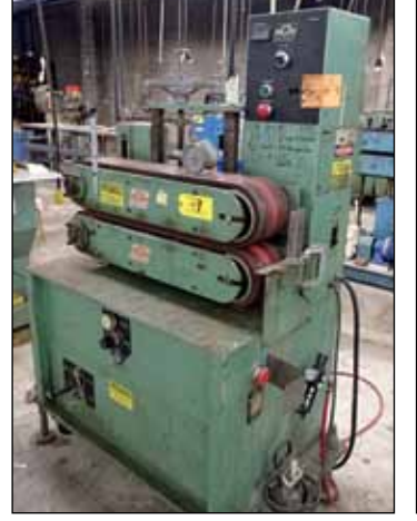
RDN PULLER MODEL 230-6