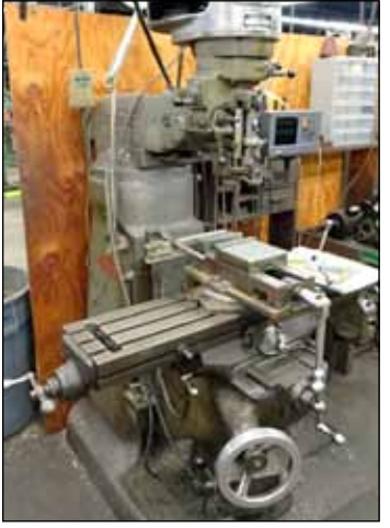
BRIDGEPORT 1 HP VERTICAL MILLING MACHINE