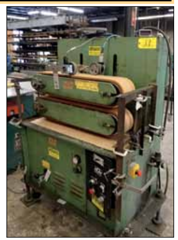
RDN PULLER 6" X 30", EXTRA CLEARANCE FOR WIDE PART EXTRUSION