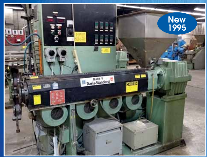
2.5 Davis Standard Extruder Model Mark V