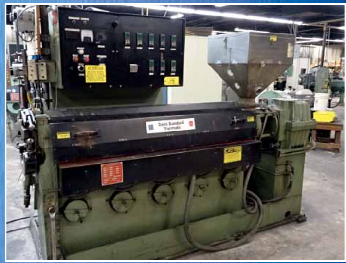
3" Davis Standard Extruder 25/1 L/D-40HP