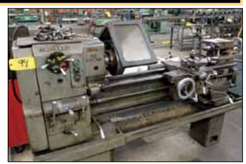
CINCINNATI 12 1/2 X 36 LATHE W/ 10" 4-JAW CHUCK