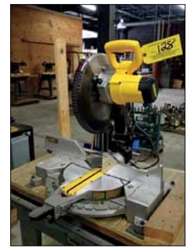
DEWALT 12" COMPOUND MITER SAW MODEL DW715

Please Note All Extruder Lines will be sold with each component lotted separately check posted lot catalog(www.thomasauction.com)