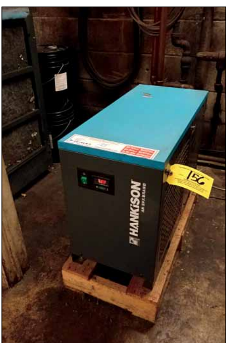
HANKINSON AIR DRYER MODEL HPR125