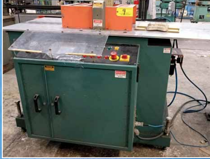
CDS Servo Traveling Cut Off Saw Model CSS