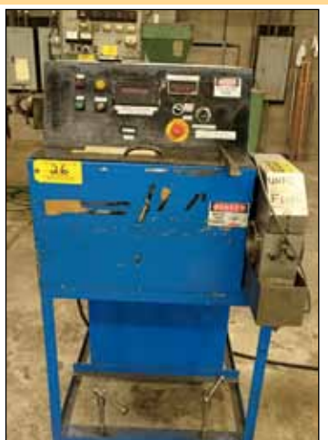
OD - FLY KNIFE CUTTER, SERVO DRIVEN