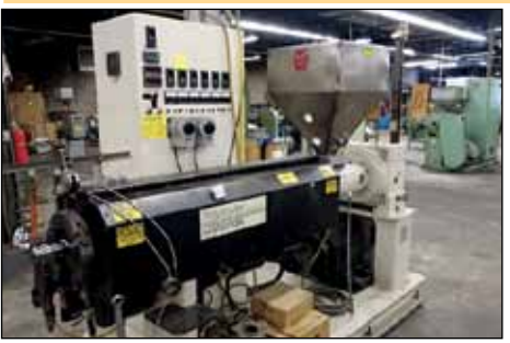
POLYTRUDER 2.5 EXTRUDER 24/1 L/D, 40 HP AC