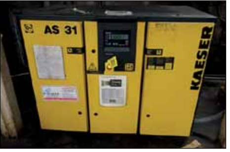
KAESER AS31 -25 HP AIR COMPRESSOR 2002