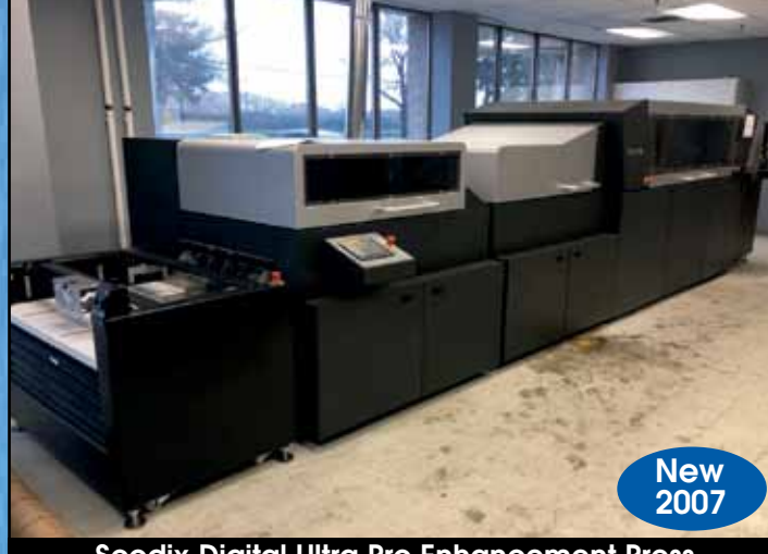
Scodix Digital Ultra Pro Enhancement Press Model SCO-1300-96, 21.5" x 31" (Markham)