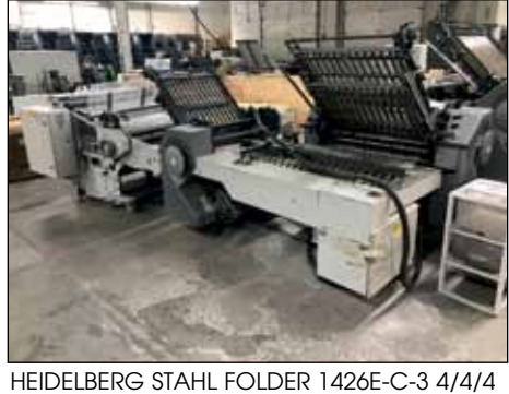
HEIDELBERG STAHL FOLDER 1426E-C-3 4/4/4 (MARKHAM)