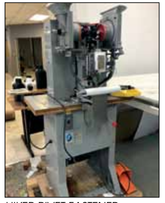
HIKER RIVET FASTENER HM308HMS (MARKHAM)