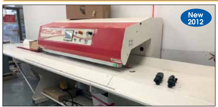
FLEXA SIGN MAKER APOLLO 155 IMPULSE WELDER (MARKHAM)