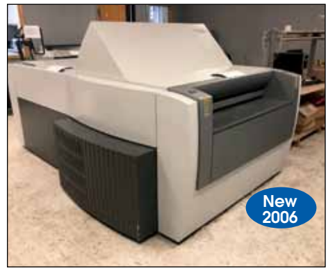
HEIDELBERG SUPRASETTER PLATEMASTER MOD D-69115 (MARKHAM)