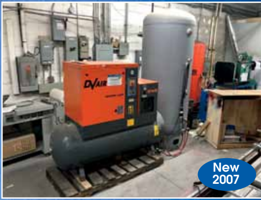
Devair Rotary Screw Air Compressor 15 HP (Markham)