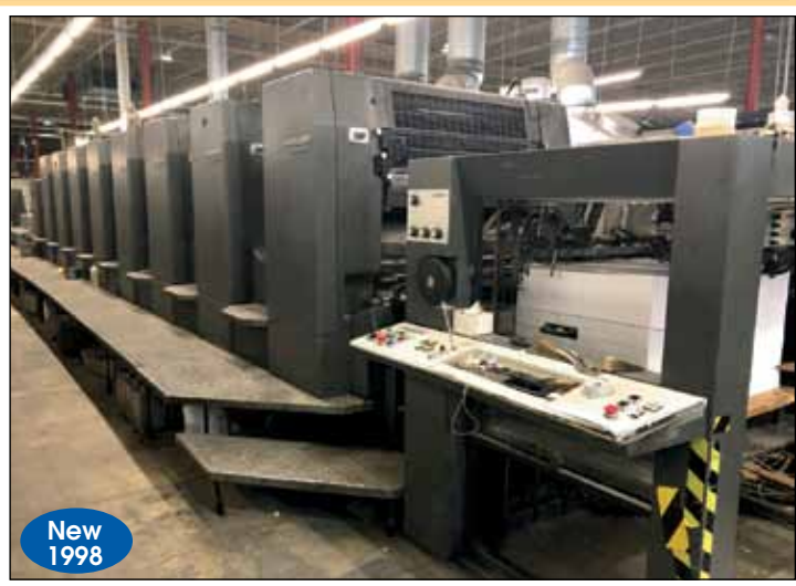
HEIDELBERG SM 102-8P+L/BIELOMATIK CUTSTAR PLUS 102/114 (MISSISSAUGA)