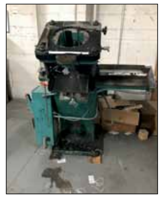
PMC MOD F.82 DIE CUTTER (MARKHAM)