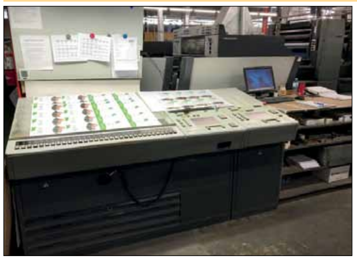
HEIDELBERG CD102-6-L, CONTROL CONSOLE (MARKHAM)