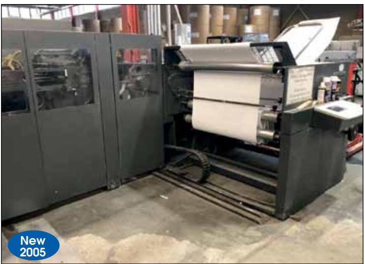
BIELOMATIC CUTSTAR PLUS 102/114 (HEIDELBERG 8C) (MISSISSAUGA) POLAR MOHR CUTTER 137-EMC-MON (MARKHAM)