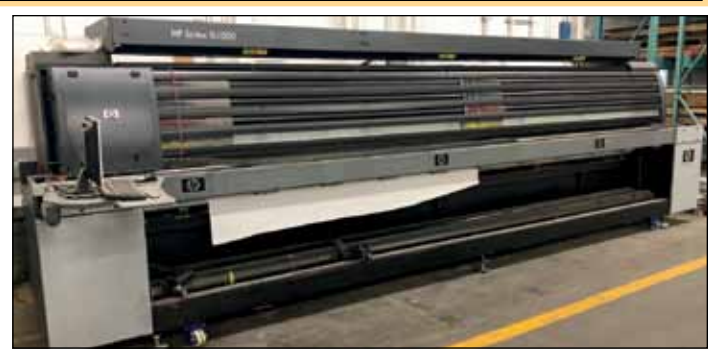
HP INVENT SCITEX XL1500 DIGITAL PRINTER (MISSISSAUGA)