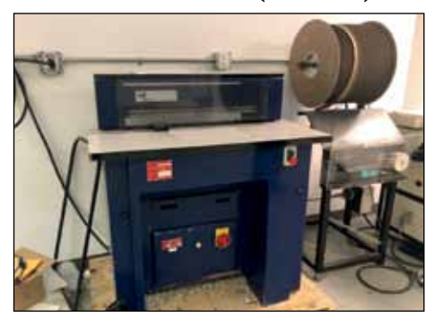
JAMES BURN MOD EP700 MULTI HOLE PUNCH (MARKHAM)