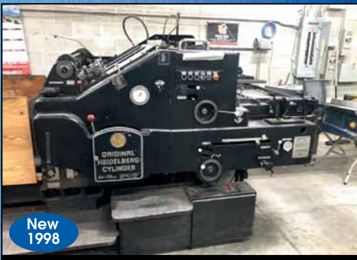
Heidelberg Cylinder Press 25 1/4" x 35" (Markham)

Sale Date: Wednesday, November 28, 1:00 PM (ET) Open House Inspection: Tuesday, November 27, 9 AM To 4 PM (Local Time)