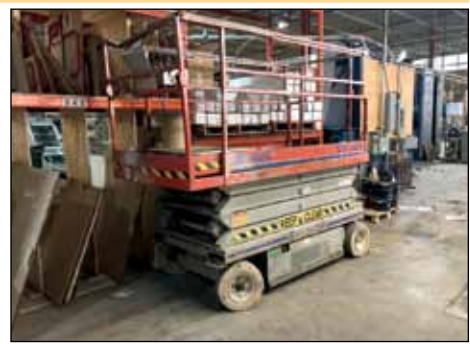
SKYJACK PLATFORM SCISSOR LIFT 4626 (MISSISSAUGA)