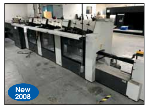
HEIDELBERG STITCHMASTER MOD ENM-10 /6PKT/COVER FEEDER (MARKHAM)