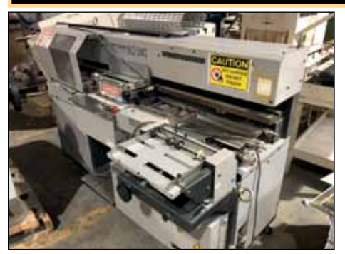
HORIZON BQ-240 PERFECT BINDER (MISSISSAUGA)