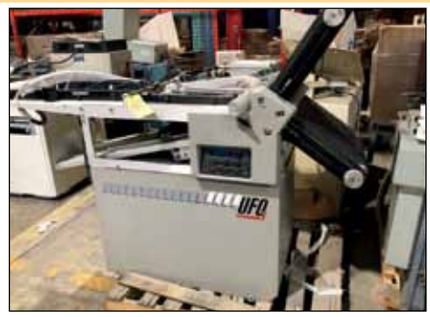
MORGANA BINDER UFO-1 PAPER FOLDER (MISSISSAUGA)