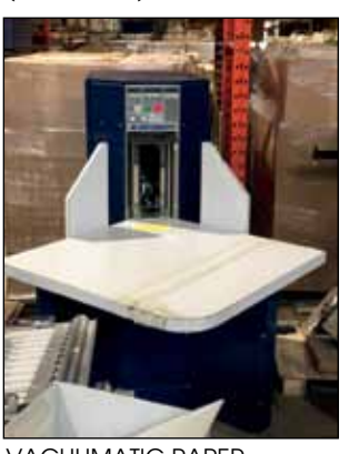
VACUUMATIC PAPER COUNTER (MISSISSAUGA)