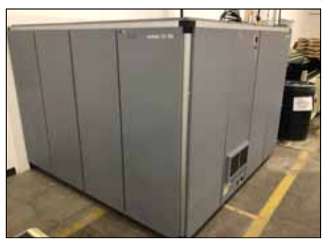
DURST LAMBDA 131HS LARGE FORMAT DIGITAL LASER IMAGER (MISSISSAUGA)