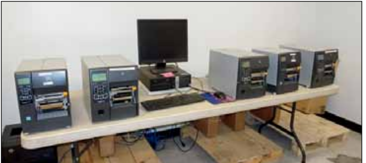
Labeling Machines Datamax-Oneil; Zebra 4M