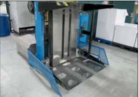
Albo Pile Turner / Aerator / Jogger