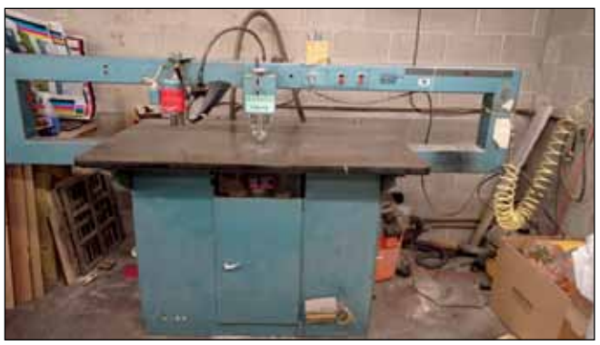
Sandvic Mod PV 1200 Drill

15-DIGITAL SCALES-FLOOR & BENCH DAY 1 & DAY 2 Setra, Rice Lake, S-Yc