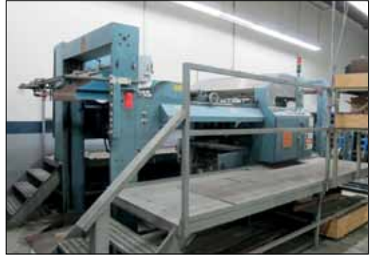
Nordson Hot Melt Glue System Maxson Rotary Single Knife Sheeter Model Problue7