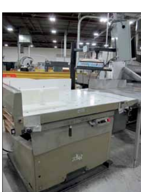
Polar Mohr Jogger RB5