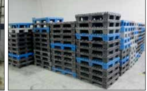
450+ Plastic Pallets