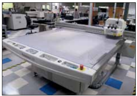
Esko / Kongsberg Cad Router