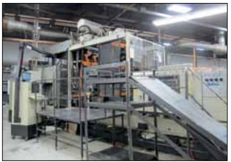
Sencorp 3200SD Servo Driven 30x40