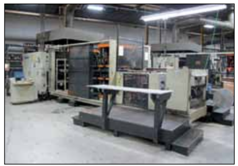
Sencorp 2500: 30x33