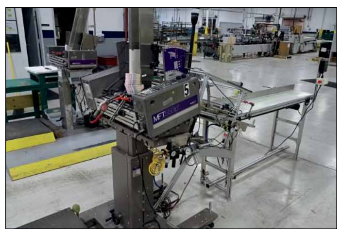
(8)MTF Friction Feeders/Delivery Conveyors, Models: MTF550 & MTF350;