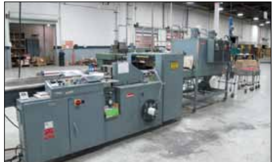
Shanklin Shrink Wrapper/ Tunnel/Scrap /Retrieval