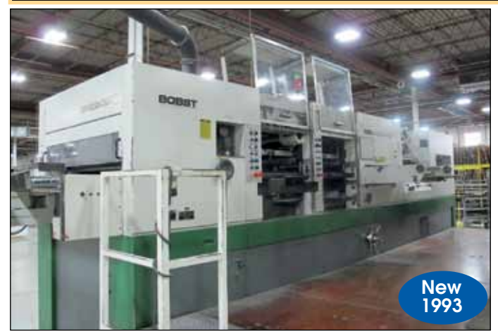
Bobst Die Cutter Model SP 102-CERII Autoplaten, 9,000 S/H