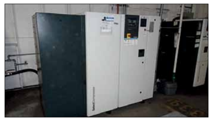
50 HP Kaeser Select Model BSD50T Air Compressor 2008