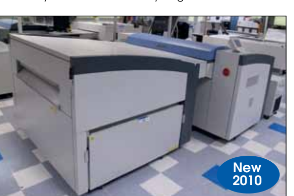
Fuji Javellin CTP System Model PT-R8800III, 2010