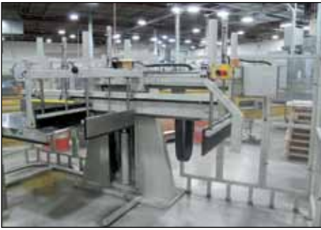
Polar Mohr Transomat Model 1ER/10/4,