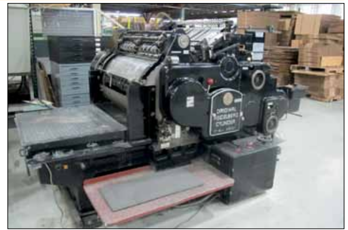
Original Heidelberg Cylinder Die Cutter Model SBB 22.5" X 32.25"

Large Selection of Spare Parts and Tooling for Bobst Die Cutters