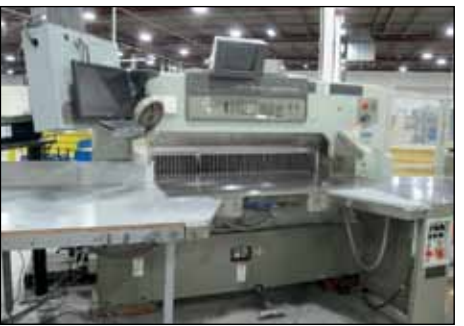
Polar Mohr Paper Cutter Model 137EMC MON