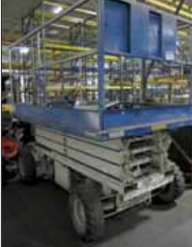
Marc Platform Scissor Lift 4' x 8'