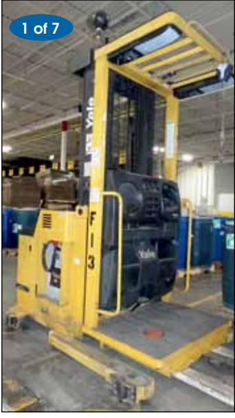
Selco Baler Model V5-HD