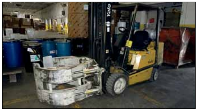
Yale Mod GLC060TFANAVE082; 6000 lb cap, / Cascade Clamp Model 45F-RC-05G;