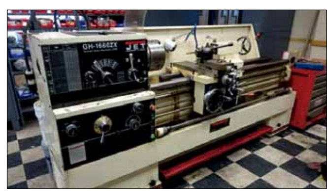
Jet 17/25" x 40"/60" Centers Gap Bed Lathe