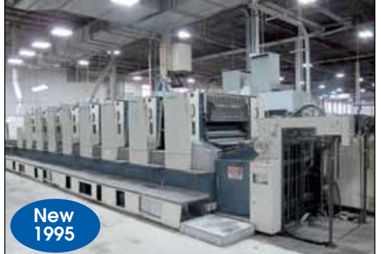
Komori 8-Color Sheet Fed Printing Press Model L-840, 28" x 40"

PRINTING PRESSES -SHEET FED- DAY-1 Komori Model L-840- 8C, S/N 117 (New 1995), 292 Million Impressions, 28" X 40", Tower Coater, Extended Delivery, Britcan 3-Lamp UV Drying System in Delivery, Interdeck UV Drying System W/ (3) Movable Lamps, APC, ABW, Komorimatic Dampening, PQC Remote Ink And Register Console, Electro Sprayer Delux 40 Powder Spray, (4) Royse Space Saver Recirculators, Tri-Service Chiller/ Heater, Industrial Coolina System Chiller, Komori APC Plate Bender