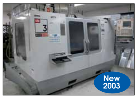
HAAS MODEL VF-3D MOLD MAKER