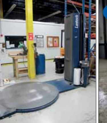
Lantech Mod Q 300 Pallet Stretch Wrappers