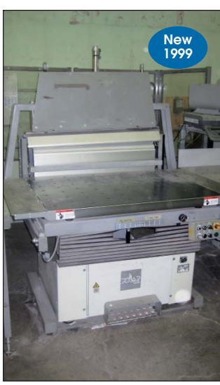
Polar Mohr Paper Jogger Model RA-4