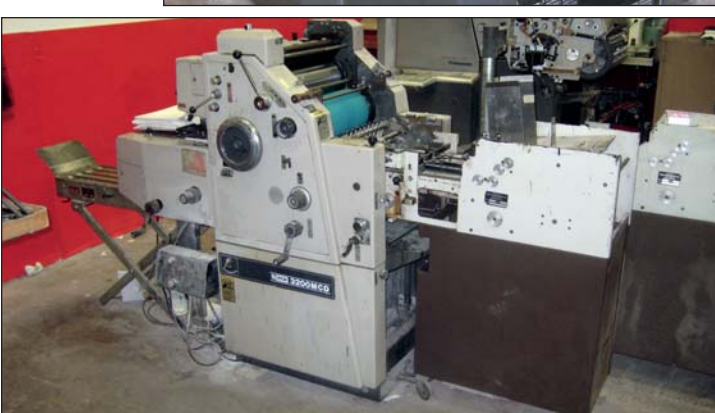
Ryobi 3200MCD 2/C Offset Duplicator