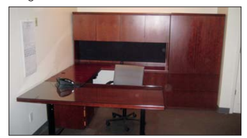
View of Executive Office