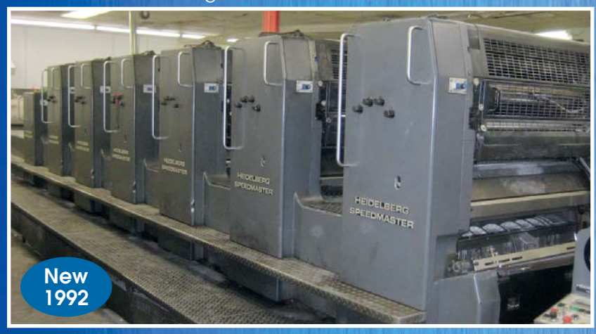
Heidelberg SM102-6-S+LX Printing Press