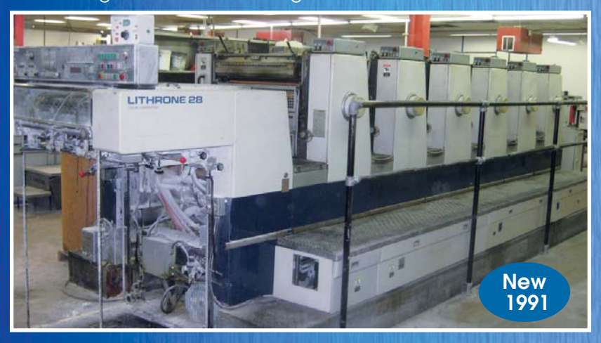
Komori L628 Printing Press