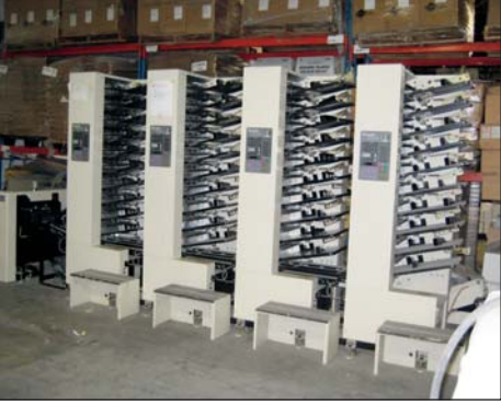
Duplo Collating System Model DC-10000S

Strapex Semi Automatic Strapping Machine Model Aİlpack ES-102 S/N 96061159