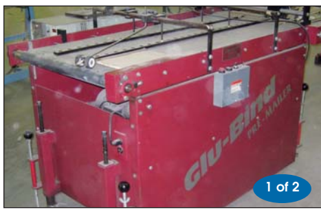
Dick Moll Glue Bind Pre-Mailer