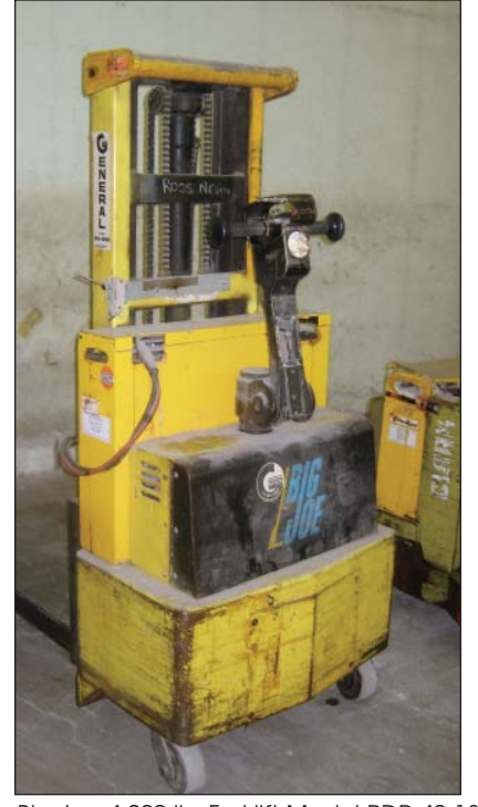
Big Joe 4,000 lb. Forklift Model PDP-40-130