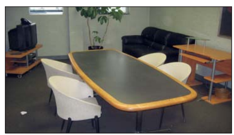
View of Conference Room