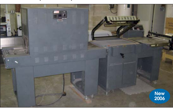
Heat Seal #HDS-2024 Packaging Machine