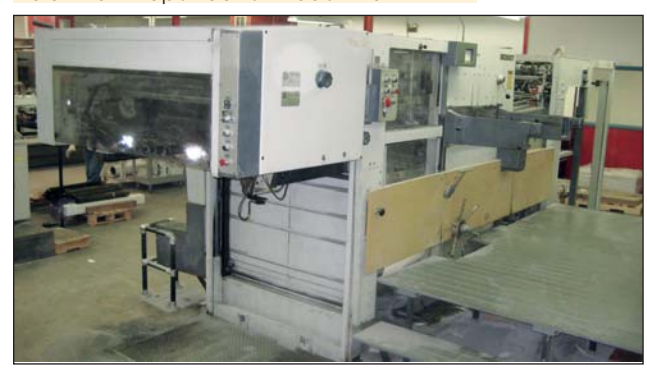
Bobst Die Cutter Model SP-112OE-300T