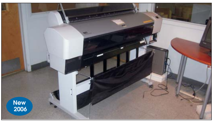
Kodak Matchprint/Epson Stylus Pro 9800 Proofer

Phone System: Avaya Merlin Magic Phone System WITH Approximately (25) Phone Sets