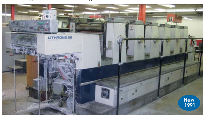
Komori L628 Printing Press