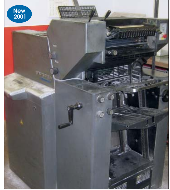
Heidelberg Printmaster QM46-2 Offset Pres