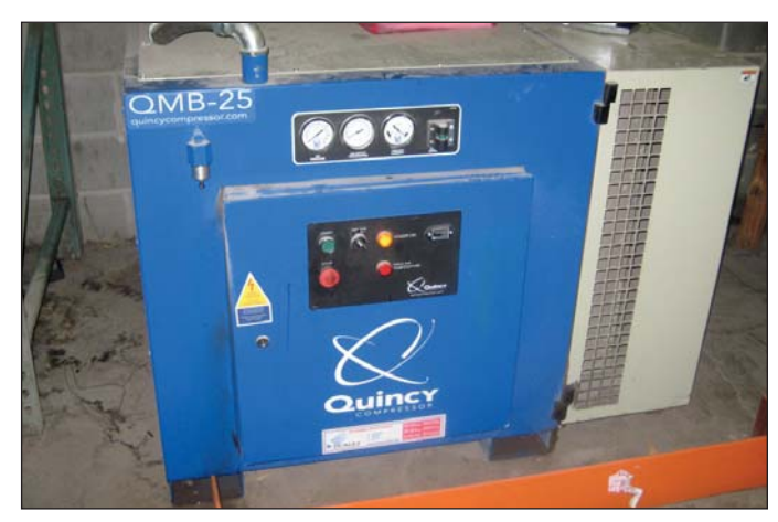
Quincy 25 HP Compressor Model QMB025