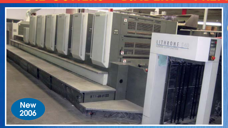
Komori LS-640-III Printing Press

• KOMORI & HEIDELBERG PRESSES DIE CLITTERS • RINDERV • PREPRESS • PLANT SLIPPORT