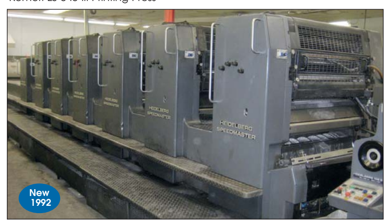
Heidelberg SM102-6-S+LX Printing Press