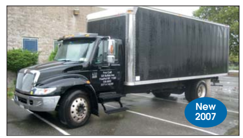
International Box Truck Model 4300