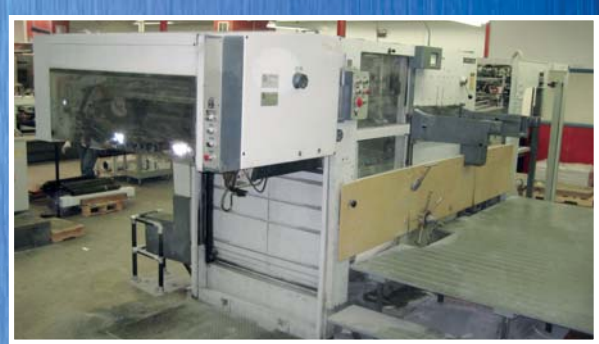
Bobst Die Cutter Model SP-112OE-300T