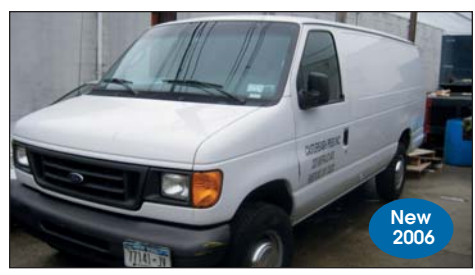
Ford E350 Super Duty Van