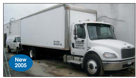
Freightliner Box Truck Business Class M2