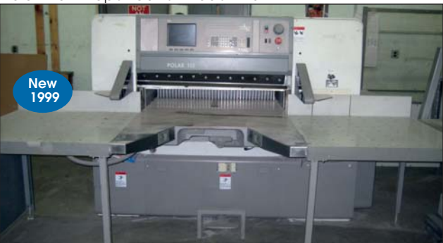
Polar Mohr Paper Cutter Model 115-ED