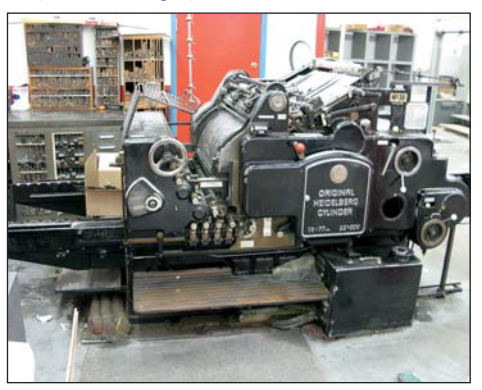
Original Heidelberg Die Cutter Model SBG