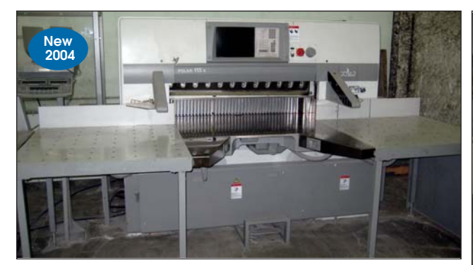
Polar Mohr Paper Cutter Model 115X