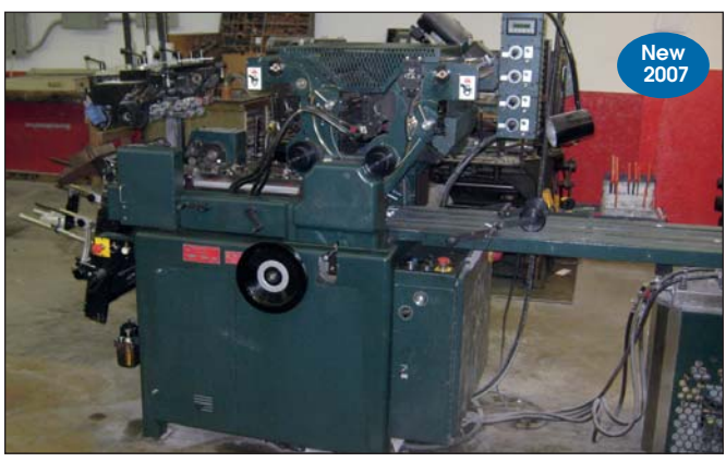
Halm Superjet Plus Perfecting Envelope Press

Ryobi 3200MCD 2-Color Offset Duplicator, S/N 6257, Townsend T-51 Swing Away Head, Varn Kompac II Automatic Dampening, Airtech Mizer Plus Powder Spray, (2) Press Specialties Feed Units, Press Specialties Take-Off Conveyor