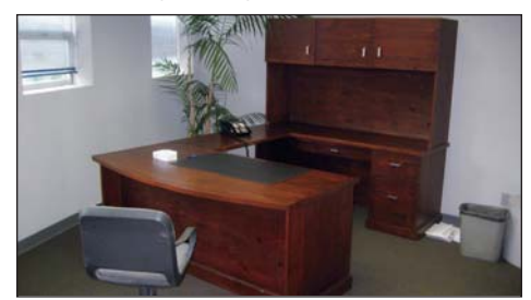
View of Executive Office