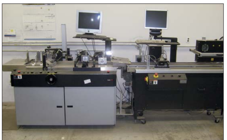
Cheshire Videojet #7000 Inkjet Line