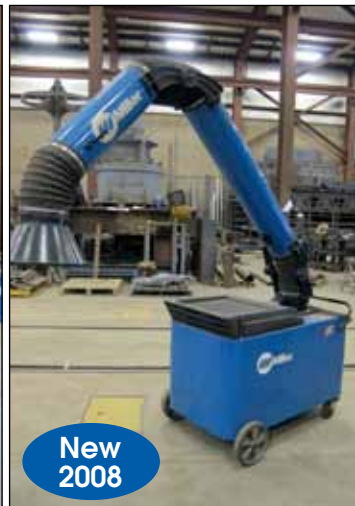
MILLER MWX-D FUME EXTRACTOR