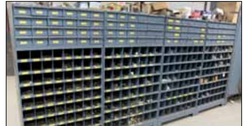
PARTS BINS & LARGE HARDWARE INVENTORY