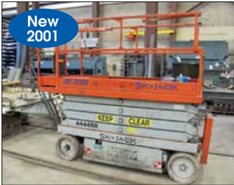
SKYJACK SJ-III-3226 SCISSOR LIFT