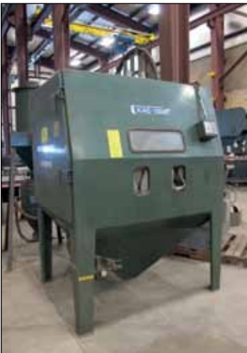
1998 MAXI BLAST ADC1210 SAND BLASTER SAND RECLAIMING POT