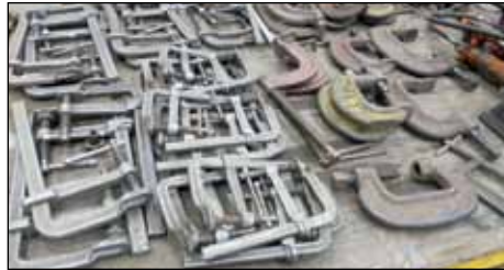
LARGE ASSORTMENT OF C-CLAMPS