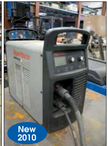
HYPERTHERM POWERMAX-85 PLASMA CUTTER