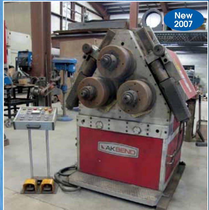
Akyapak/AK Bend APK-101 Profile Bending Machine