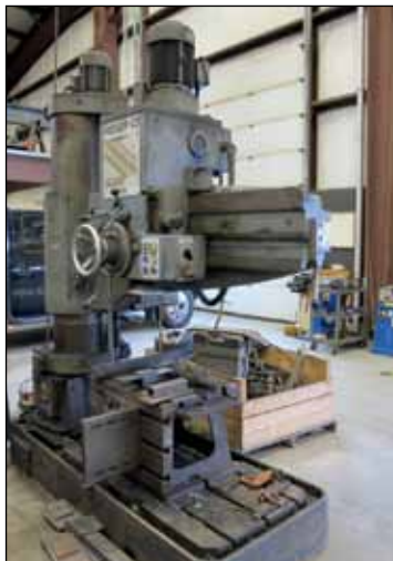
MEUSER M50R/45252 RADIAL ARM DRILL, 48" ARM