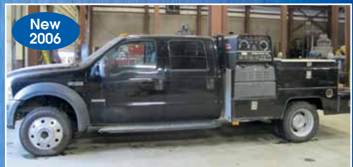
Ford F550 Welders Truck