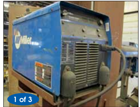
MILLER INVISION 456-MP WELDER