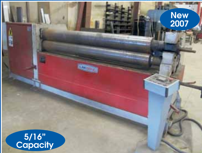
Akyapak/AK Bend ASM-S200 X 2100 Plate Bending Rolls

INSPECTION: TUESDAY, MARCH 26, 9 AM TO 4 PM (ET)