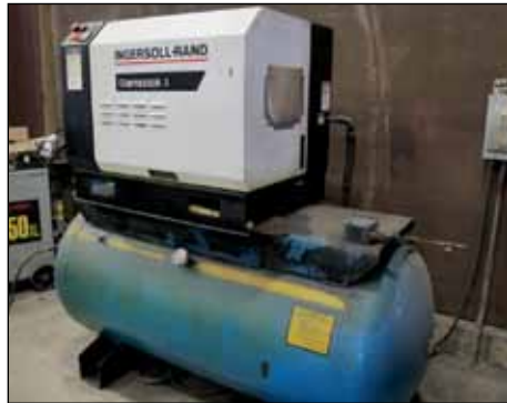
INGERSOLL RAND ROTARY SCREW AIR COMPRESSOR