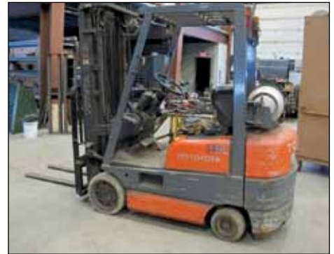
1999 TOYOTA 426FGCU18 FORKLIFT, 3000 LB, LPG