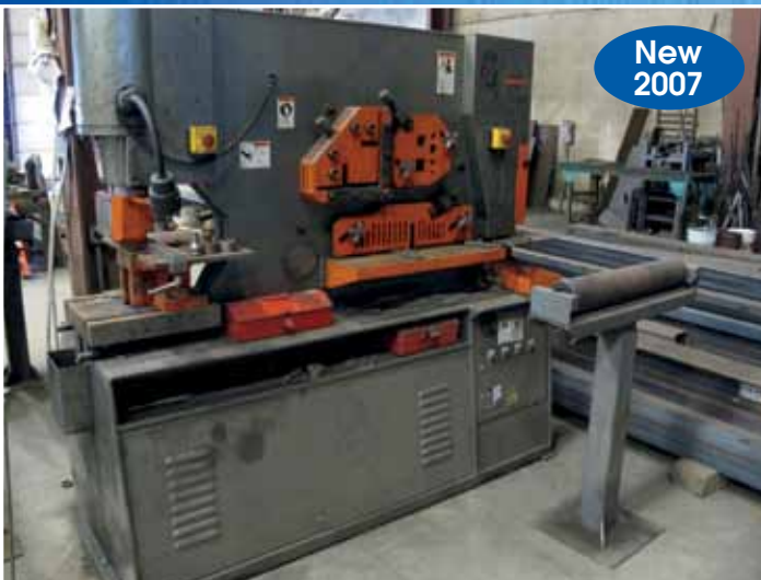
Spartan Marvel IW110D Hydraulic Iron Worker