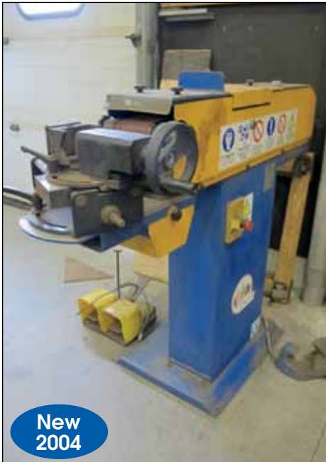
ERCOLINA EN100 PIPE AND TUBE NOTCHER