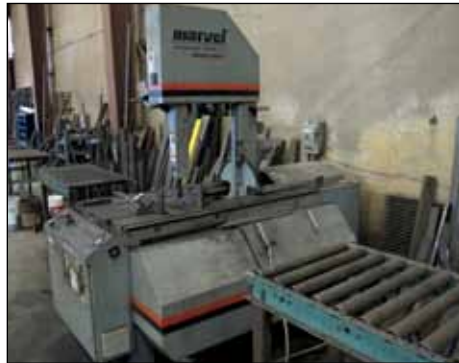
MARVEL SERIES 8 MARK III METAL BAND SAW