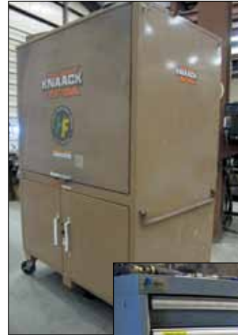
KNAACK JOB BOX

Vidmar Tools Cabinets, Raw Materials, Rigging Equipment, Welding Wire, Job Boxes, Fastener Supplies & Cabinets, Liquid Storage Cabinets, Porta-Cool Fans, Rigid Pipe Thread Stands, C-Clamps, Welding Tables, Hand Tools, Power Tools, Storage Cabinets, Work Benches, etc.