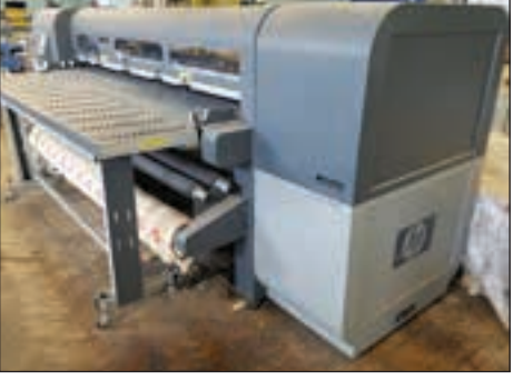
HP SCITEX WIDE FORMAT PRINTER MODEL FB700