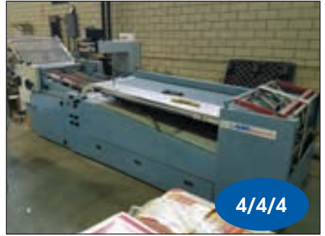
MBO FOLDER MODEL B32-S-C, PERFECTION SERIES