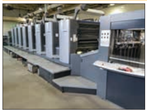
HEIDELBERG 8/C PRINTING PRESS MODEL SM102-8-P