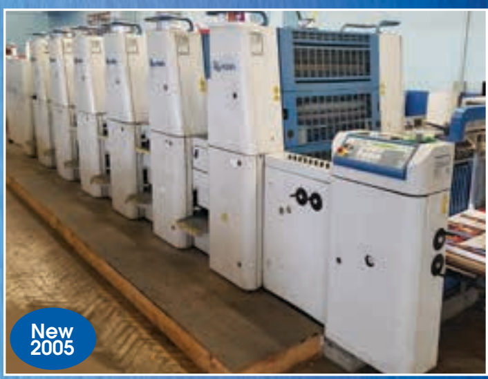
KBA 5/C Printing Press Model Performa 74-5+L

Heidelberg 8/C Printing Press Model SM102-8-P