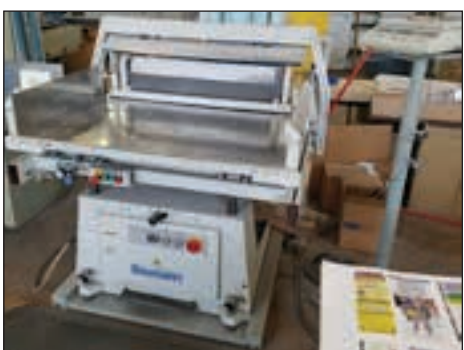
BAUMANN JOGGER MODEL BSB3L