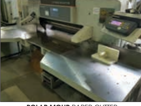
POLAR MOHR PAPER CUTTER MODEL 137-EMC-MON