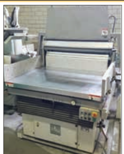
POLAR MOHR JOGGER MODEL RA4