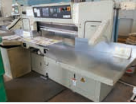
SABER PAPER CUTTER MODEL S-137