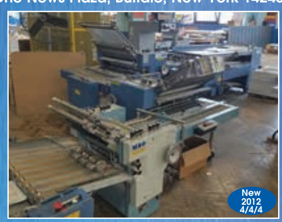
MBO B26 FOLDER, PERFECTION SERIES

INSPECTION: WEDNESDAY, MAY 1, 9 AM TO 4 PM (ET)