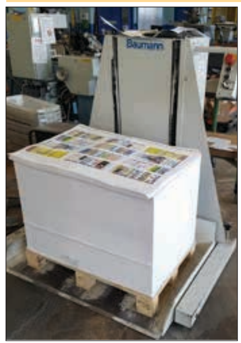
BAUMANN PAPER LIFT MODEL NUP650