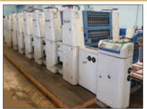
KBA 5/C PRINTING PRESS MODEL PERFORMA 74-5+L