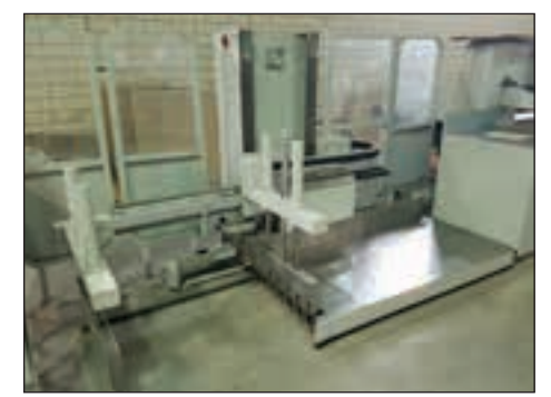
POLAR MOHR TRANSOMAT MODEL TR1EL-145-3