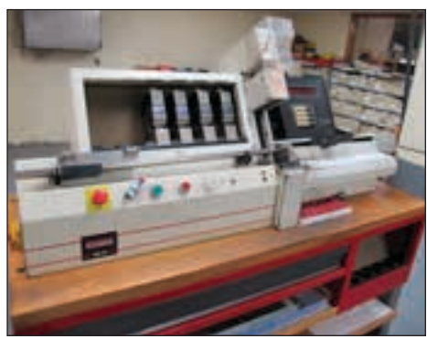
ELCEDE SC6 RULE PROCESSOR