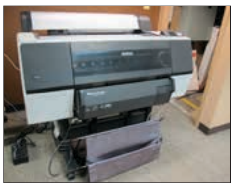
EPSON STYLUS PRO 7900 PROOFER