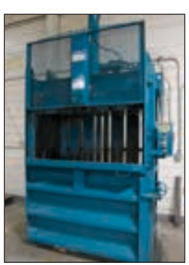
MARATHON VERTICAL BALER MODEL V6030-04

CNC Control, S/N037021 (New 1990) Elcede NCC107 Laser Cutting System S/N 041011 (New 1990)