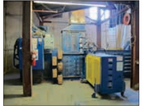
AMERICAN BALER HORIZONTAL BALER MODEL PAC4029730

Maxson MOK 65" Double Knife Sheeter, S/N 6350M (New 2004) Equipped With Dual Roll Stands, Automatic Splicing, Quick Pallet Discharge, Dual