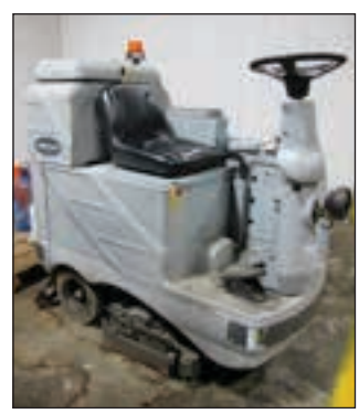
ADGRESSOR FLOOR SWEEPER MODEL AXP