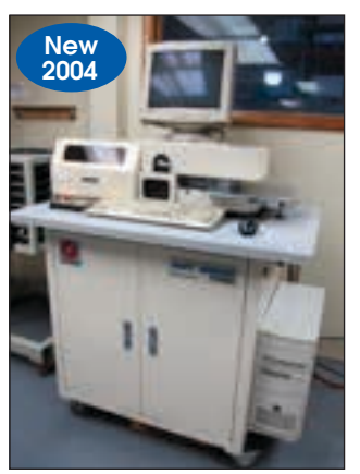
SOC KOREA EASY BLENDER TURBO EBT-2000 DIE BENDER