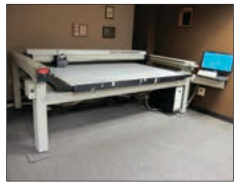
DATA TECHNOLOGY SAMPLE CUTTING TABLE