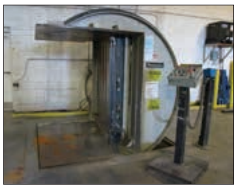
AUTOMATAN AERATOR/JOGGER MODEL A 73VA