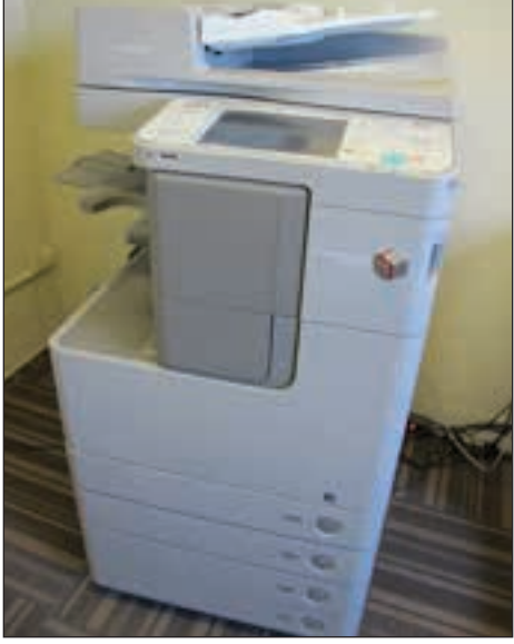
CANON IMAGERUNNER ADVANCE COPIER