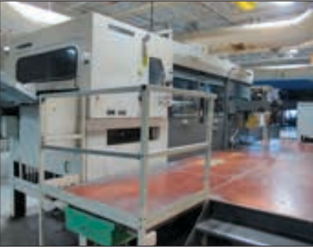
BOBST SP-130-ER 51" DIE CUTTER/BLANKER