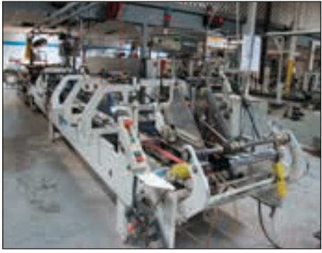
JAGENBERG 925 FOLDER/GLUER, STRAIGHT LINE