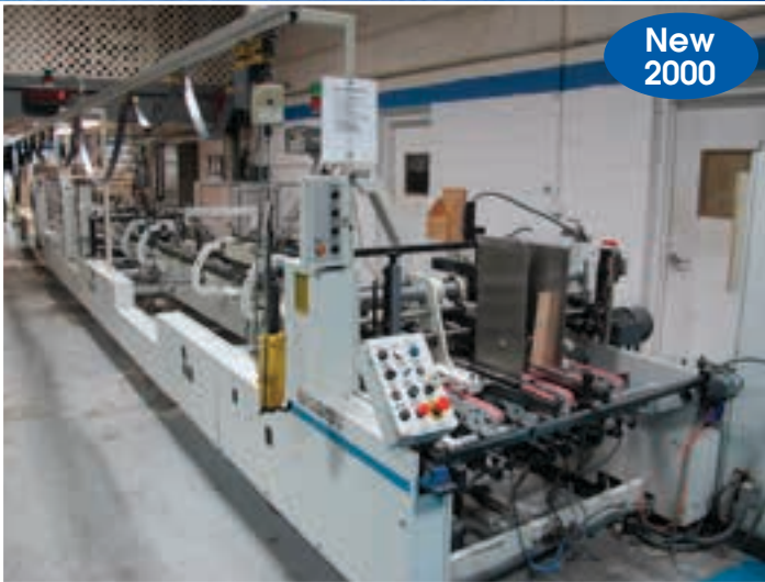
Bobst Alpina 110-Matic A-3 42" Folder/Gluer

Bobst Alpina 130-Matic-A-3 50" Folder/Gluer