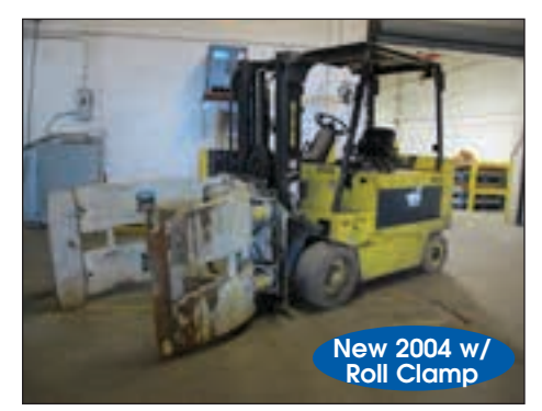
HYSTER 120XL3 FORK TRUCK