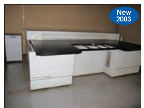
CREO TRENDSETTER VLF QUANTUM CTP SYSTEM

Bobst SP-130-ER 51" Die Cutter/Blanker, S/N 0577-004-02 (New 1986) Equipped With 3-Sets Of Chases & 2-1mm Thin Plates, Plus Tooling, Oil Conditioning Cabinet, Lead Edge Trim Removal, 205,250,456 Impressions, 55,000 Hours