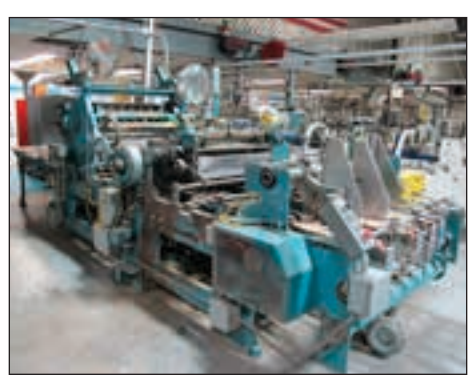
WESTERN SLOPE WINDOW MACHINE MODEL GLADIATOR