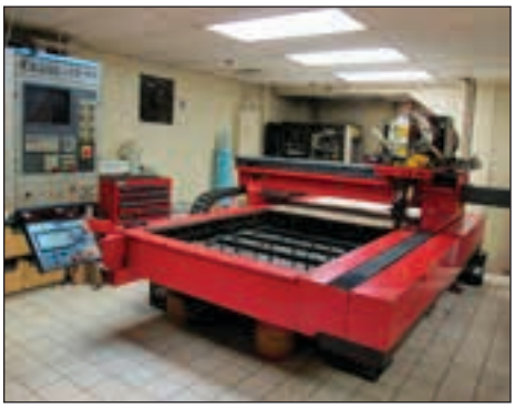
ELCEDE LCS160 LASER CUTTING TABLE