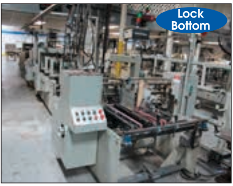
BOBST DOMINO 90-MATIC 36" FOLDER/GLUER