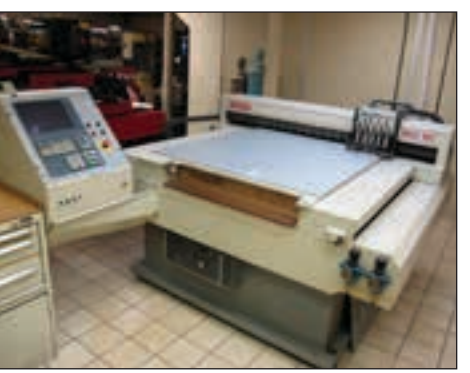
ELCEDE NCC107 LASER CUTTING SYSTEM