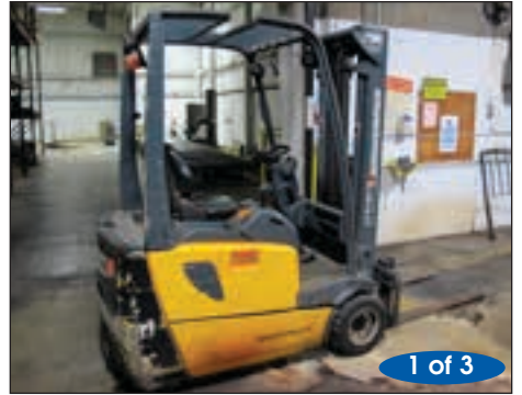
JUNGHEINRICH ELECTRIC FORKLIFT