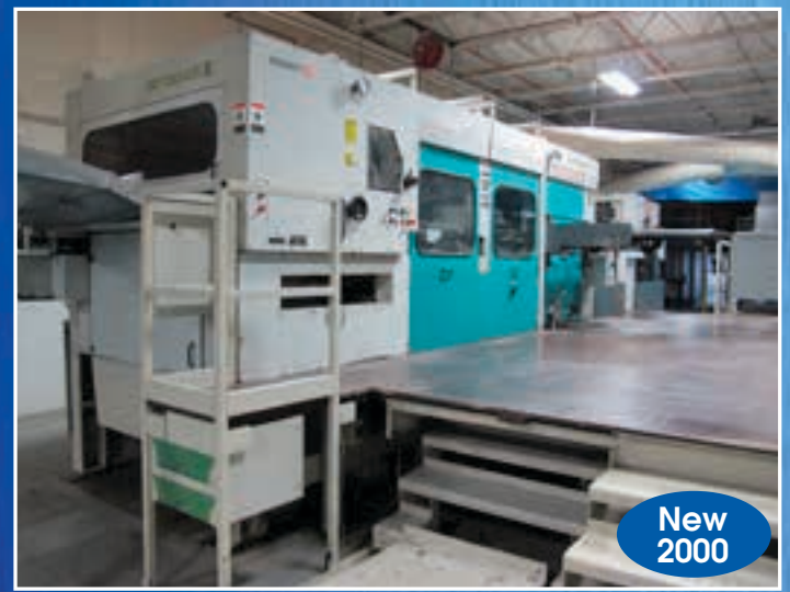
Bobst SP-130-ER-II 51" Die Cutter/Blanker