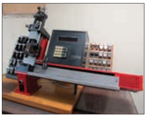
ELCEDE HC3 LIPPER/STRAIGHT CUTTER/ NOTCHER