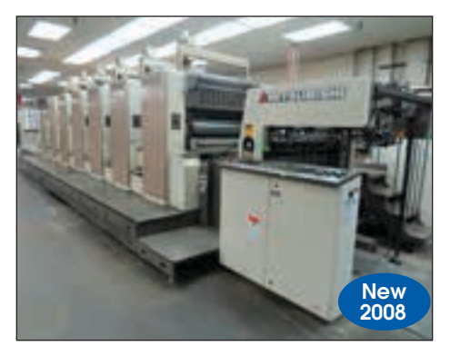
MITSUBISHI 6C-MODEL D30000LS-6 -COATER, 267 MILLION IMPRESSIONS