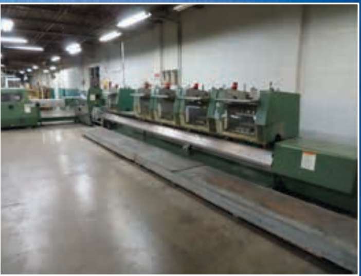
Muller Martini Prima Saddle Stitcher 6-Pk, Cover Feeder, 3-Knife Trimmer

Muller Martini Mono Block Perfect Binder, 27-Pkts, 18-Clamp Binder, Muller Martini #3672