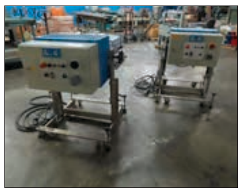
(2) GUK Z-KNIFE FOLDER MODEL ZK500 2010 & 1998