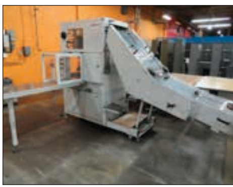
GAMMTECH STACKER MOD KL507/1