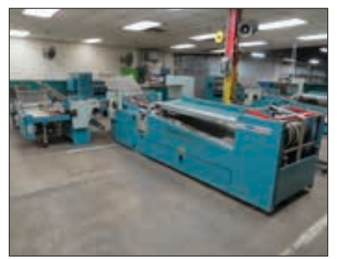
MBO PERFECTION SERIES; B32-S-1-32/4(4/4/4)