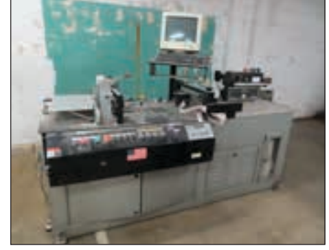
3-KIRK RUDDY TABBERS; 535; 537; PROTAB

Quincy 125 HP Rotary Screw Air Compressor Model QSI-600 Quincy 75 HP Rotary Screw Air Compressor Model QAI-370 ACA318, S/N 97871 Premier Compressed Air Dryer