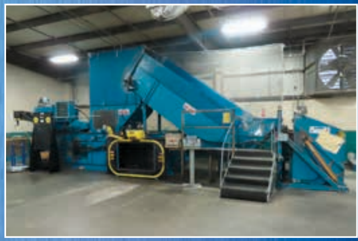
Summit Baler Model PR-9S, Hydraulic Auto Dumper & Conveyor, 70 HP