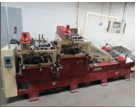
PRIM HALL OFF-LINE TIPPER MOD 5-286