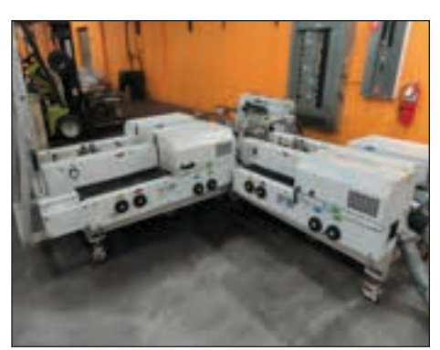
GAMMERLER ROTARY TRIMMER MOD RS111/530