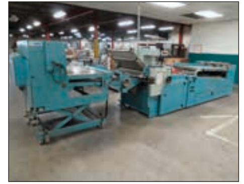
MBO B26, PERFECTION SERIES, DUAL FEED, 4/4/4