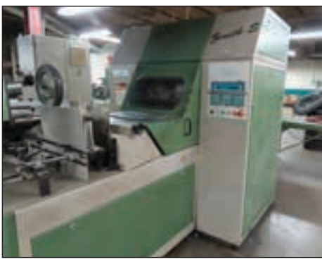
ZENITH 3-KNIFE TRIMMER