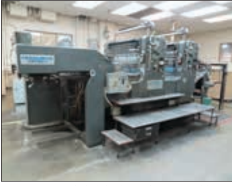
HEIDELBERG 2-COLOR MODEL SM102P