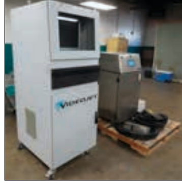
2-KIRK RUDDY VARIABLE DATA PRINT LINES

ITW Dynatec Dynmelt S Series Hot glue Unit S/N 135820101671 (2) TEC Catalytic Afterburners Model HXC 4000 & Quantum 3000