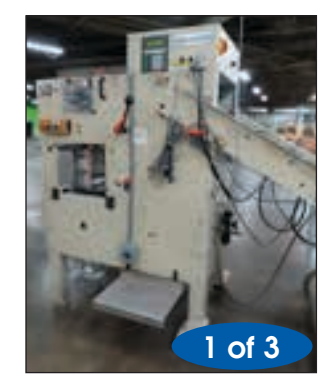
3-RIMA STACKERS #RS10S