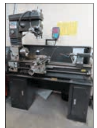
GRANITE ELITE 1-MAX LATHE 13X 40:CC