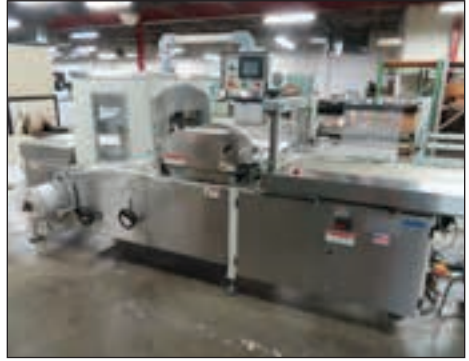
STORK TEXWRAP MODEL 2203;/ BELCO HEAT SHRINK TUNNEL