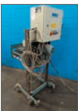
2-MBO KNIFE FOLDERS Z2 & Z6