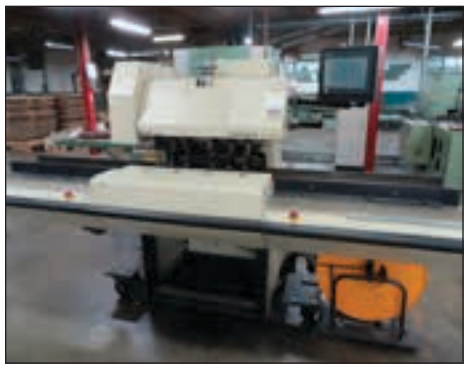
LAWSON CLASSIC CNC 6 SPINDLE DRILL