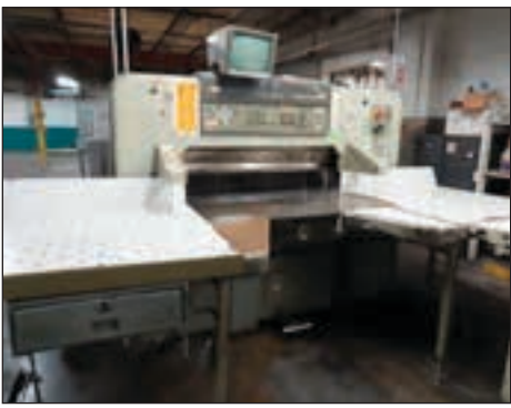
POLAR MOHR 45" PAPER CUTTER MODEL 115EMC-MON