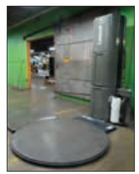
(2) LANTECH ROTARY STRETCH PALLET WRAPPERS