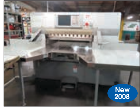
POLAR MOHR 45" PAPER CUTTER MODEL 115X