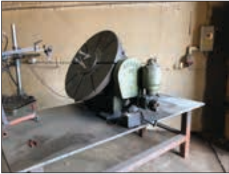
ROTAB 36 WELDING POSITIONER