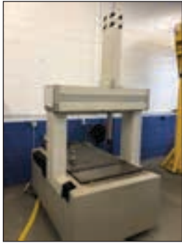
HELMEL ENGINEERING CHECKMASTER MODEL 430-251 MICROSTAR CMM