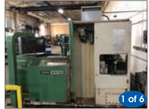
KITAKO MT4-170 4-SPINDLE CNC CHUCKER