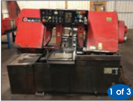
AMADA HFA400W HORIZONTAL BAND SAW