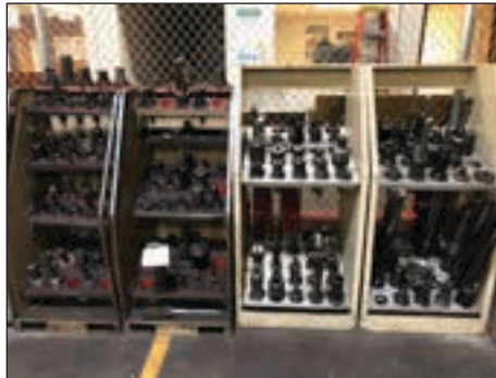
(500+) TOOL HOLDERS