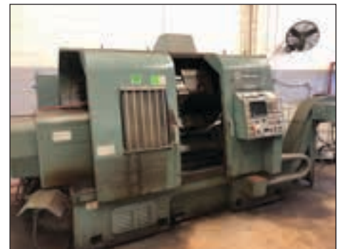
MORI SEIKI SL-5 CNC SLANT BED TURNING CENTER