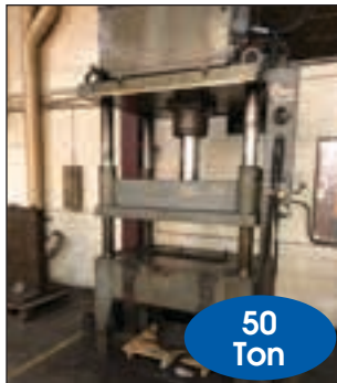
KR WILSON 4-POST HYDRAULIC PRESS