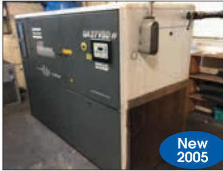
ATLAS COPCO 50 HP ROTARY SCREW AIR COMPRESSOR MODEL GA37VSDFF