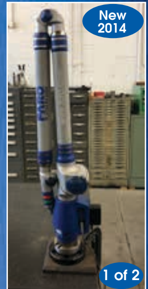
Faro Platinum Arm Portable