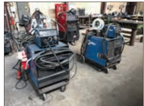
VIEW OF MILLER WIRE FEED WELDERS

Calipers, Dial Indicators, Thread Gages, Block Gages, Pin Gages, Height Stands, Ring Gages, Plug Gages, ID Gages, etc.