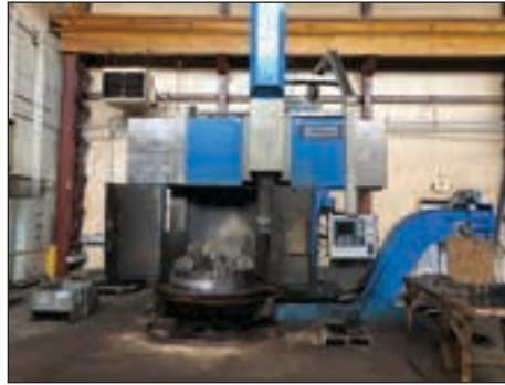
49" SCHEISS AMERICA CNC VERTICAL BORING MILL