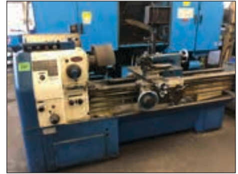
24" X 60" OKUMA MODEL LS LATHE