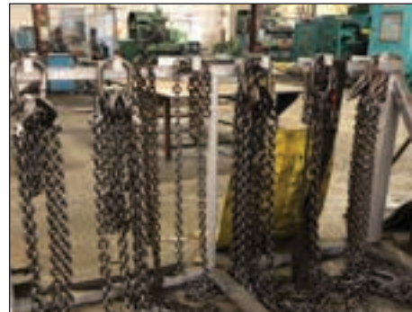
CHAINS AND RIGGING SUPPLIES