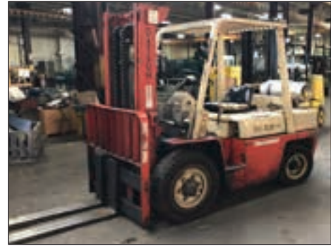
DATSUN 8000 LB LPG FORKLIFT