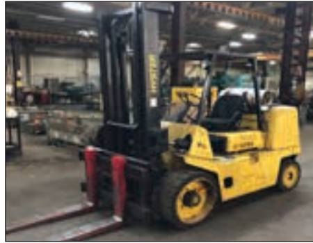
HYSTER 12,000 LB LPG FORKLIFT MODEL S155XL