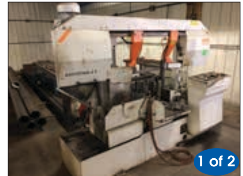
KASTO KASTOTWIN A4 HORIZONTAL BAND SAW