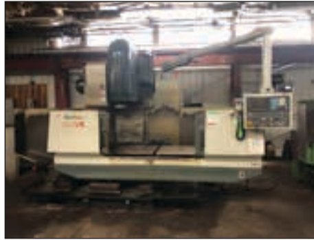
ENSHU 650VX CNC VERTICAL MACHINING CENTER