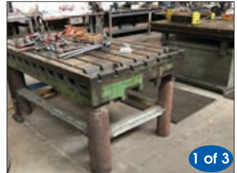
HEAVY DUTY SLOTTED WELDING TABLE