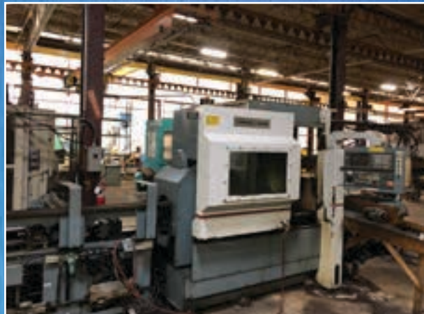
Bardons & Oliver Model 36 CNC Tube & Pipe Cutoff Machine

OPEN HOUSE INSPECTION: OCT. 1, 2 & 3, 9 AM TO 4 PM (ET)