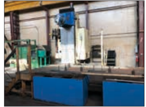
ANAYAK HVM5000 CNC BED MILL WITH UNIVERSAL HEAD