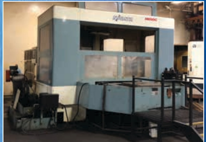
Niigata HN80C CNC Horizontal Machining Center