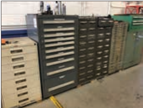
VIEW OF TOOLING CABINETS