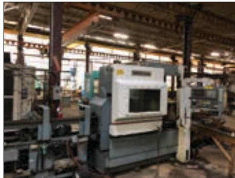
BARDONS & OLIVER MODEL 36 CNC TUBE & PIPE CUTOFF MACHINE