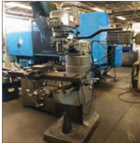
BRIDGEPORT 2 HP VERTICAL MILLING MACHINE, S/N 262191