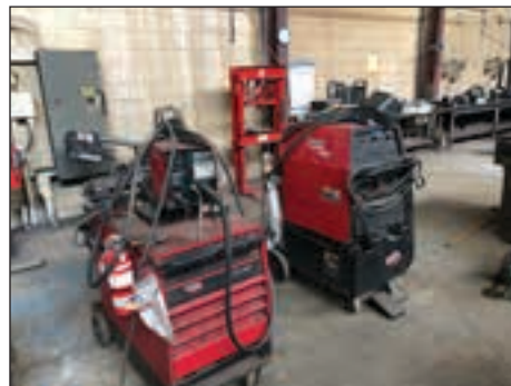
VIEW OF LINCOLN ELECTRIC WELDERS