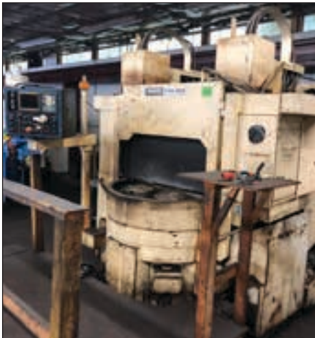
KITAKO VT4-350 4-SPINDLE CNC VERTICAL CHUCKER