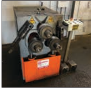
COMAC/CARRELL MODEL 303-HV ANGLE BENDING ROLL