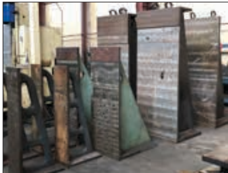
LARGE ASSORTMENT OF RIGHT ANGLE FIXTURES