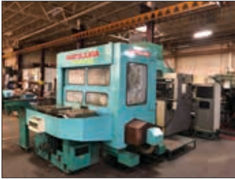
MATSUIURA MC-900H-PC2S 4-AXIS CNC HORIZONTAL MACHINING CENTER

SALE DATES: OCT. 2 & 3, 11:00 AM (ET) EACH DAY