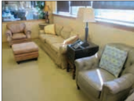
EXECUTIVE OFFICE SUITE