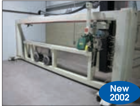
MILLER WELDMASTER CS112-SB