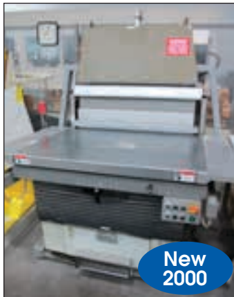
POLAR MOHR JOGGER MODEL RA-4