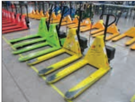
VIEW OF PALLET JACKS AND PAPER LIFTS