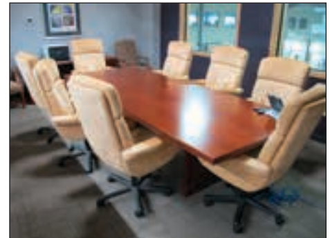
EXECUTIVE CONFERENCE ROOM

Cabinets, Portable Carts, Wire Baskets, Plastic Pallets, etc.