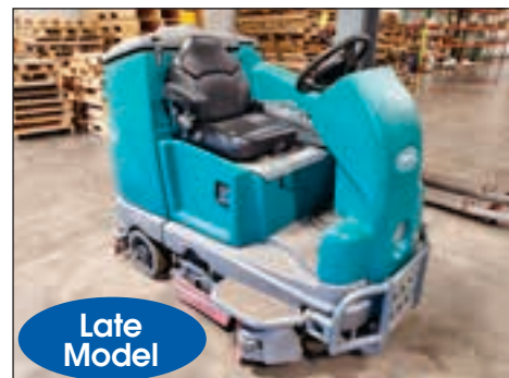
TENANT T16 FLOOR SWEEPER

Large High-Quality Office: Executive Suites, Executive Conference Rooms, Customer Lounges, Employee Training Rooms, Coffee/Cafeteria Room, General Office Areas, Fitness Room, Receptionist Areas, etc.