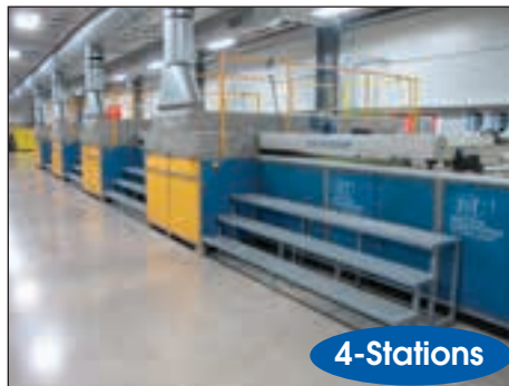
INDUSTRIAL SCREEN PRINTING TECHNOLOGIES SILKSCREEN PRINTER #MULTIGRIP-1522/4/UV