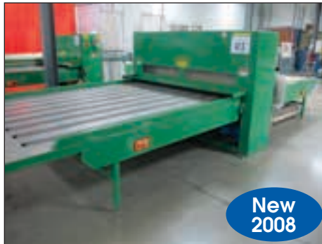
CLEEN CUT FLAT BED DIE CUTTER MODEL DC80