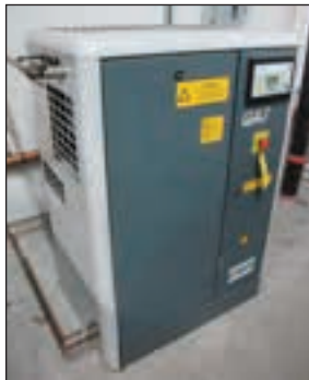
ATLAS COPCO 10 HP ROTARY SCREW AIR COMPRESSOR MODEL GA7