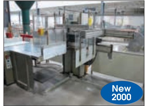
POLAR MOHR TRANSMAT MODEL TR130ER-5