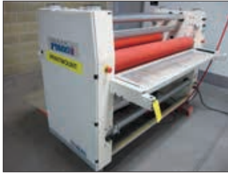
SEAL 2-SIDED LAMINATOR MODEL IMAGE 5500