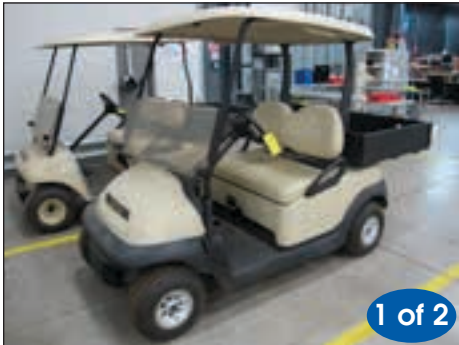
CLUB CAR ELECTRIC GOLF CART