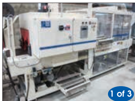
ARPAC AUTO SHRINKWRAPPER MODEL 55GI-20C