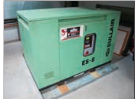
SULLAIR 50 HP ROTARY SCREW AIR COMPRESSOR MODEL ES-8