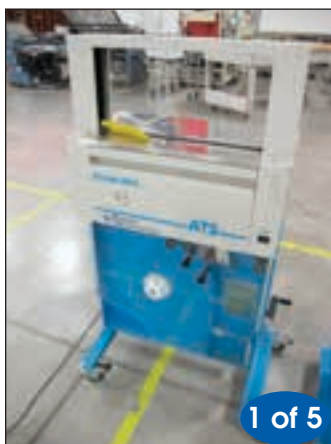
WEXLER BANDING MACHINE MODEL ATS-MS-420S