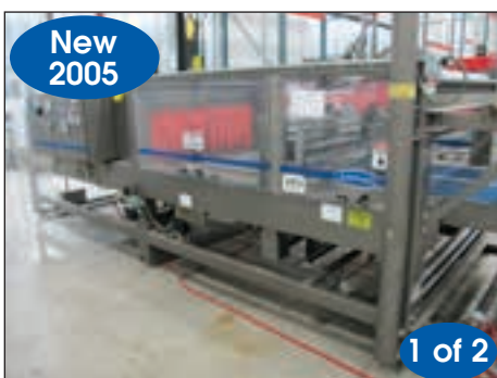
ARPAC AUTO SHRINKWRAPPER WITH TUNNEL MODEL 105-50