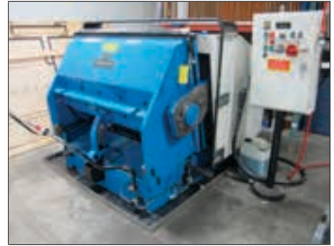
TCZ STANDARD PLATEN DIE CUTTER MODEL 39 X 55