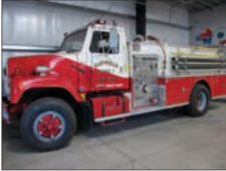
INTERNATIONAL 2524 FIRE TRUCK