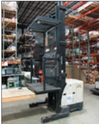
CROWN ELECTRIC AISLE LIFT TRUCK MODEL SP-3450H