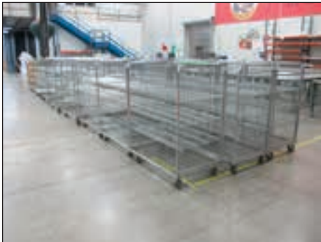
VIEW OF PORTABLE METROL TYPE BINDERY CARTS