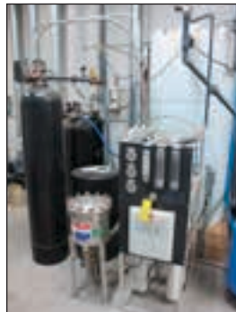
AMERICAN MOISTENING CO. HIGH VOLUME HUMIDIFICATION SYSTEM