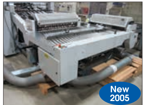
HEIDELBERG PD-94 SCORING/SLITTING/ PERFORATING MACHINE 2-AXIS