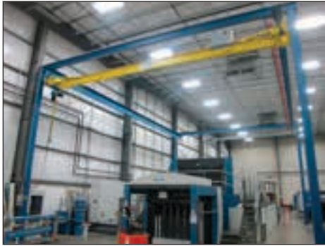
CLEVELAND TRAMRAIL BRIDGE CRANE SYSTEM