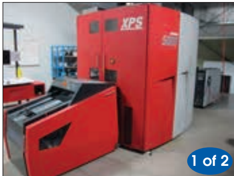
XEIKON MODEL XPS5000 DIGITAL PRESS