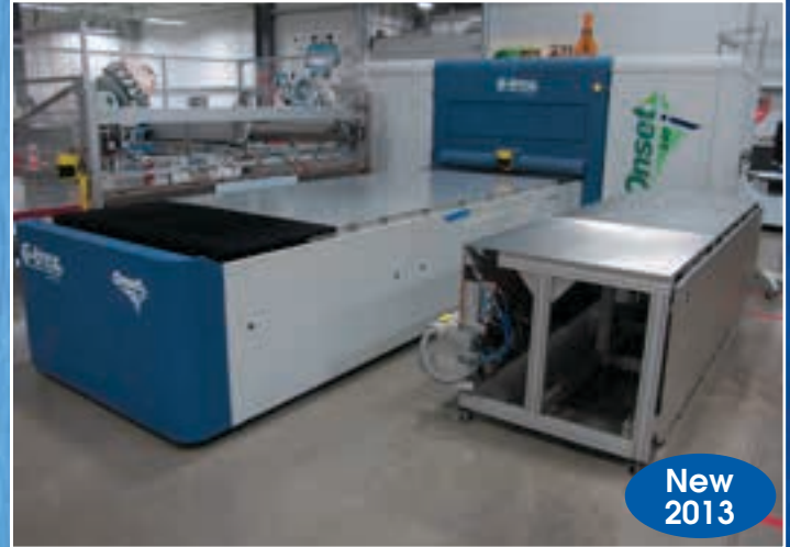
Fuji Films Inca Onset High Volume Flatbed Press