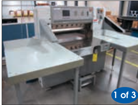
POLAR MOHR 30" PAPER CUTTER MODEL 78X