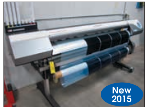
ROLAND VERSA ART RE-640 DIGITAL INKJET UV PRINTER