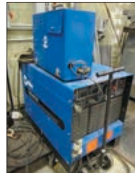
MILLER DELTAWELD 451 WELDER