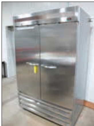
BEVERAGE AIR STAINLESS REACH IN REFRIGERATOR