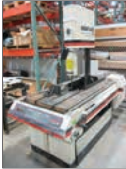
MARVEL SERIES 8 MARK II BAND SAW