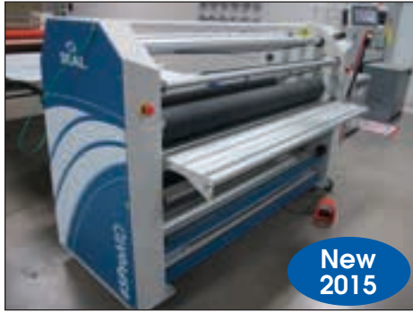
SEAL 2-SIDED LAMINATOR MODEL 62 PRO-D