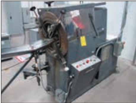
CONSOLIDATED INTERNATIONAL #250 HIGH DIE DIE CUTTER