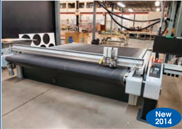
Zund G3 Router/Cutter Model G3 3XL-3200