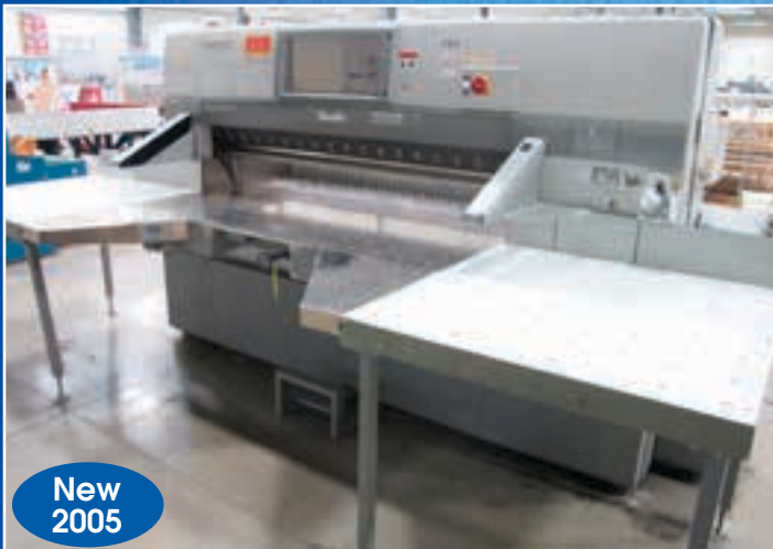
Polar Mohr 69" Paper Cutter Model 176XT