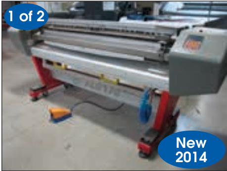
FUTOBA XLD170 CUTTER