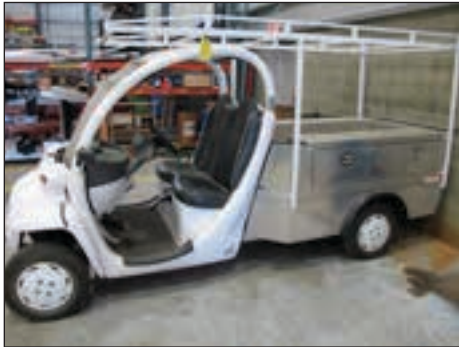
GEM ELECTRIC UTILITY VEHICLE MODEL EL, DIAMOND PLATE UTILITY BODY