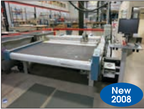
ZUND PRECISION ROUTER/CUTTER MODEL L-3000