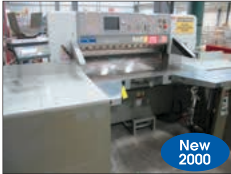
POLAR MOHR 45" PAPER CUTTER MODEL 137ED