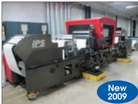
AGFA DOTRIX IPS MODULAR WEB INKJET PRINT