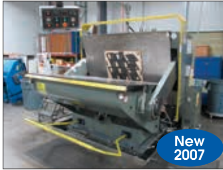
BRAUSSE PLATEN DIE CUTTER MODEL PE2M, 79" X 55"