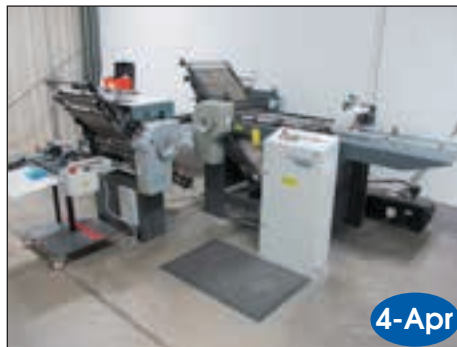
HEIDELBERG/STAHL FOLDER MODEL 1220E-4-P-3