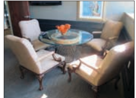
EXECUTIVE OFFICE SUITE