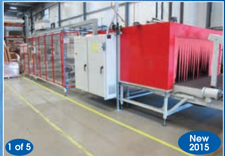
EDL Inline Wrapper Model ILA120-30

SALE DATES: TUES & WEDS, OCTOBER 15 & 16, 1:00 PM (ET)