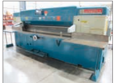
LAWSON 110" PACEMAKER II PAPER CUTTER MODEL 110