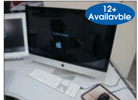
APPLE ALL IN ONE POWER PC