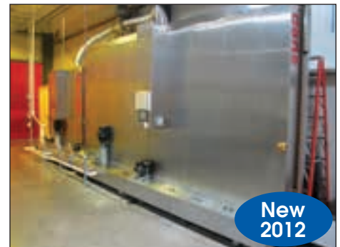
DANE AUTOMATIC SCREEN CLEANER MODEL DVV-380H0-180-HPW