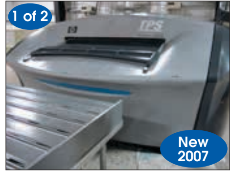
HP SCITEX MODEL TJ8600