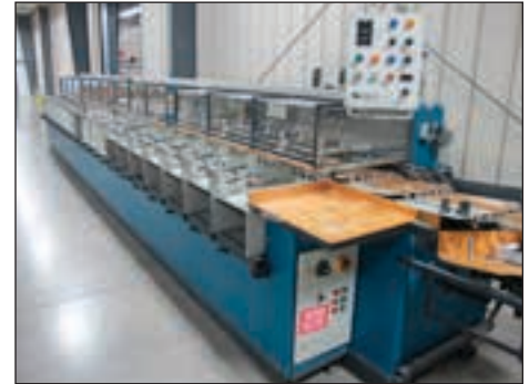
THEISEN & BONITZ COLLATOR MODEL SPRINT 20 POCKET