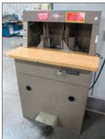
CHALLENGE DUAL CORNER MACHINE MODEL DCM