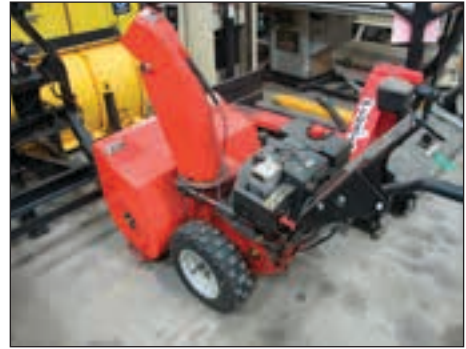
ARIENS ST1028 SNOW BLOWER