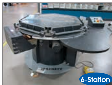
BRACKETT CIRCULAR PADDING MACHINE