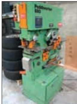
PEDDINGHAUS IRONWORKER MODEL 880