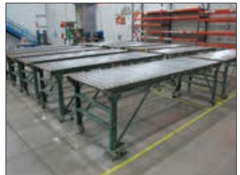
LARGE ASSORTMENT OF ROLLER CONVEYORS

Tennant Floor Scrubber Model T16, S/N T16-24640 (New 2014)