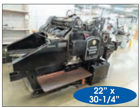
ORIGINAL HEIDELBERG CYLINDER DIE CUTTER MODEL SBG