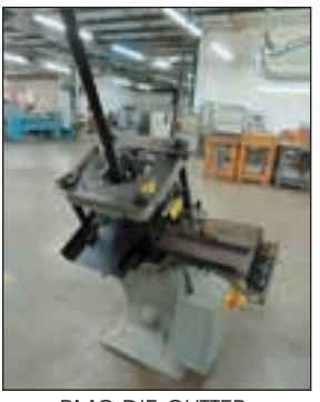
PMC DIE CUTTER, MODEL AB