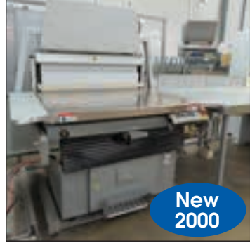
POLAR MOHR SQUEEZE ROLL JOGGER MODEL RA-4