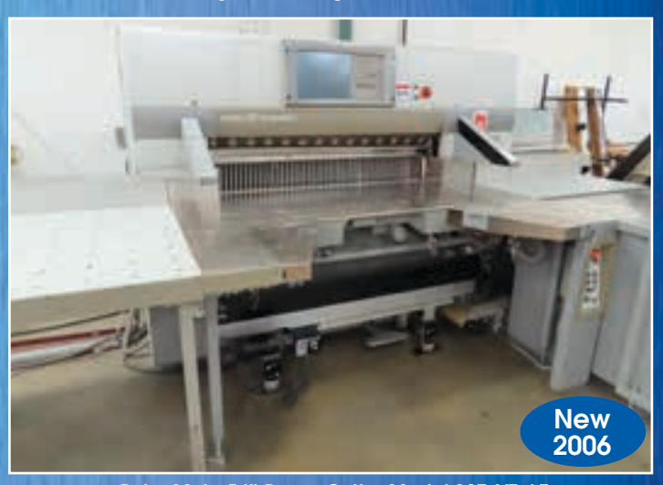
Polar Mohr 54" Paper Cutter Model 137-XT-AT

SALE DATE: Thursday, January 30, 1:00 PM (ET)