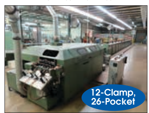
MULLER MARTINI PERFECT BINDER MODEL PANDA II