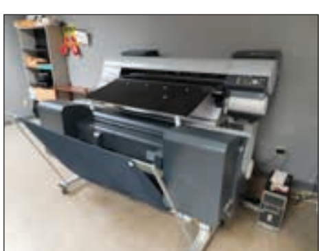
CANON IPF8300S 2-SIDED PROOFER