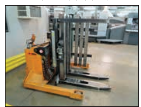
TOPPY MAXI PILE TURNER