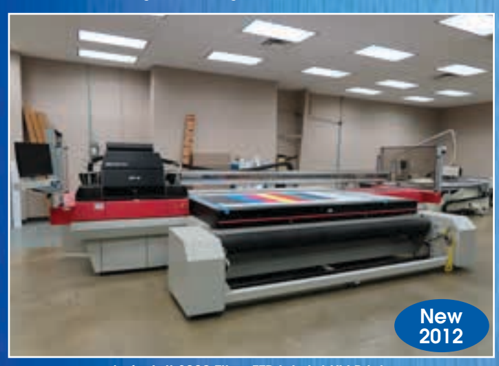
Agfa Jeti 3020 Titan FTR Ink Jet UV Printer