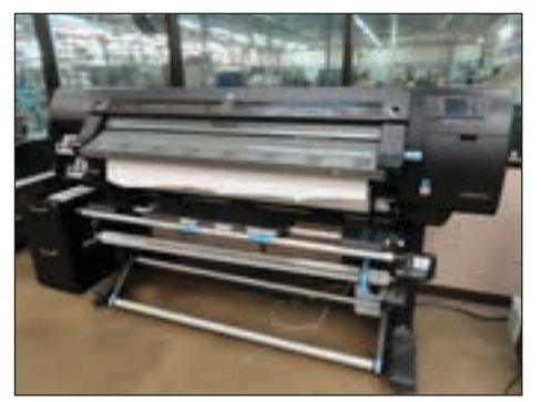
HP DESIGN JET L26500 WIDE FORMAT PRINTER