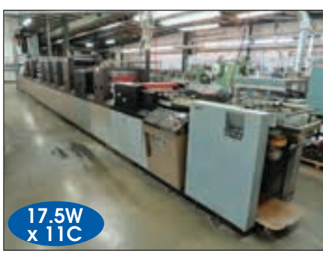
DIDDE 6/C WEB PRINTING PRESS MODEL 206-678