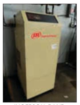
INGERSOLL RAND COMPRESSED AIR DRYER