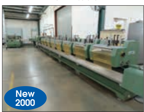
MULLER MARTINI SADDLE STITCHER MODEL BRAVO T