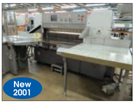
POLAR MOHR 54" PAPER CUTTER MODEL 137 ED