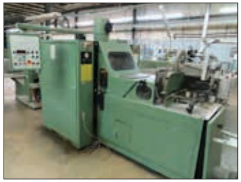
MULLER 3670 3-KNIFE TRIMMER