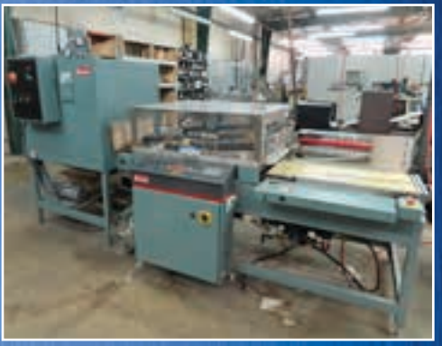
Shanklin L-Seal Packaging Machine Model A27A