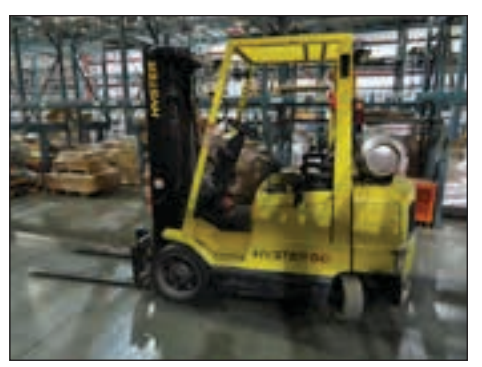
HYSTER 5000 LB LPG FORKLIFT, MODEL 50