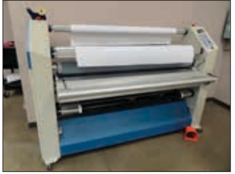
SEAL LAMINATOR MODEL 62 PRO