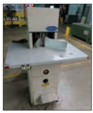
CHALLENGE ROUND CORNER MACHINE MODEL SCM