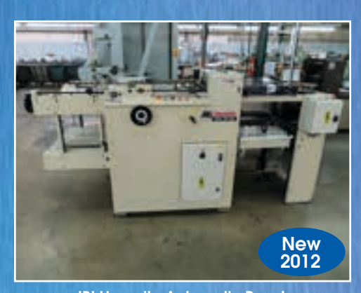
JBI Lhermite Automatic Punch Model EX610

Wednesday, January 29, 9 AM TO 4 PM (ET)