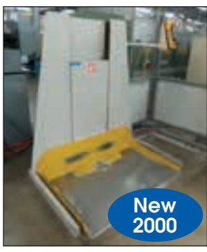
POLAR MOHR PAPER LIFT MODEL LW1000-4