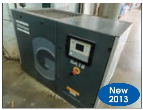
ATLAS COPCO ROTARY SCREW AIR COMPRESSOR MODEL GA18