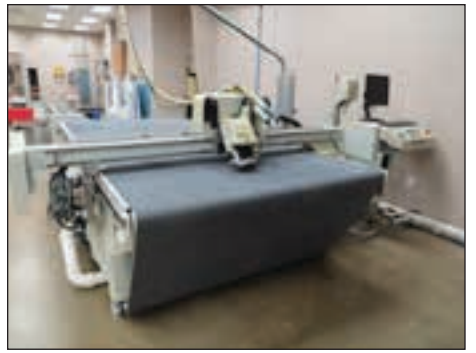
KONGSBERG CUTTING TABLE MODEL I-XP