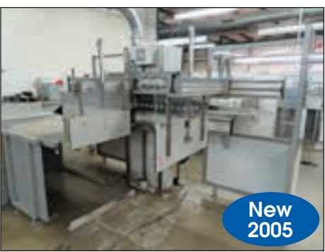
POLAR MOHR TRANSOMAT UNLOADER MODEL TR130EL-5