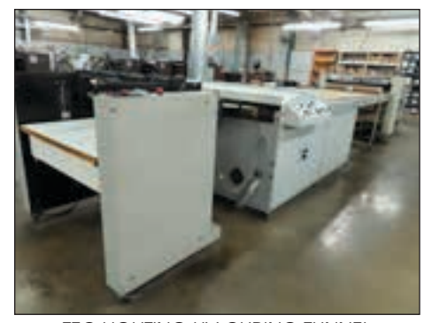
TEC LIGHTING UV CURING TUNNEL MODEL TC4548-1/16-A