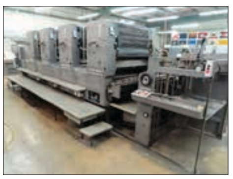
HEIDELBERG 4/C PRINTING PRESS MODEL SM102-VP