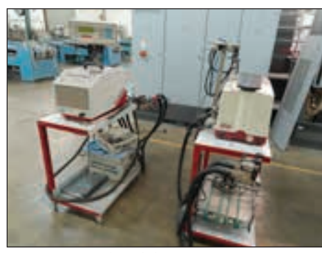
HHS PROGRAMMABLE HOT MELT GLUE SYSTEMS