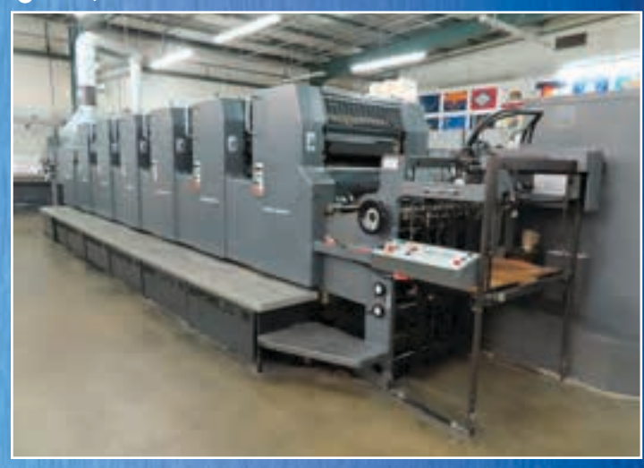
Heidelberg 6/C Printing Press Model MOSP+L