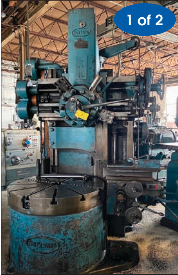
(2) BULLARD 42" VERTICAL TURRET LATHE