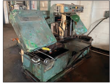
KYSOR HORIZONTAL BAND SAW MODEL HA-16