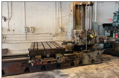
GIDDINGS & LEWIS HORIZONTAL BORING MILL MODEL 350-T