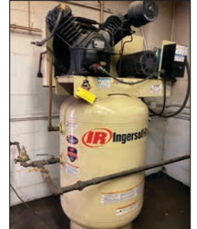
INGERSOLL RAND 2-STAGE VERTICAL TANK AIR COMP