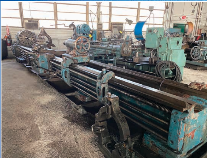
Poreba Lathe Model TR-70B