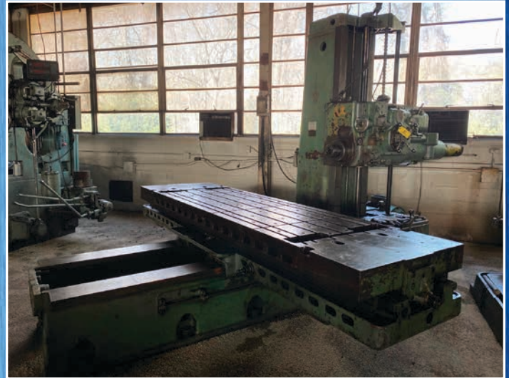
Giddings & Lewis Horizontal Boring Mill Model 340-T