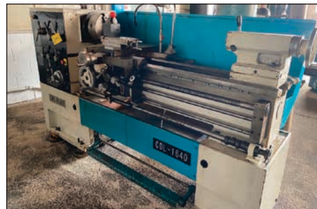
DMTG LATHE MODEL CDL-1640, TRU-TURN