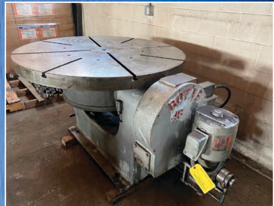
ROTAB 48" MOTORIZED UNIVERSAL ROTARY TABLE