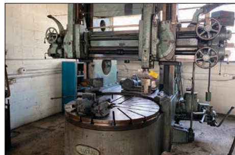
BULLARD 61" VERTICAL TURRET LATHE, MAXI MILL