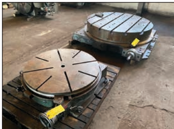
ROTARY TABLES - 6+ AVAILABLE