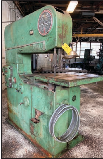
DOALL VERTICAL BAND SAW MODEL 36-3