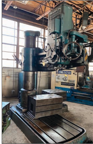
CINCINNATI BICKFORD RADIAL ARM DRILL MODEL NO.6