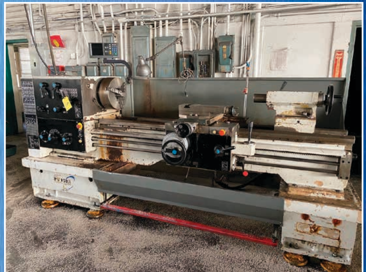
DMTG Lathe Model CDS-206-OC