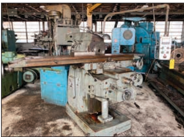
ESK ENSHU HORIZONTAL MILLING MACHINE