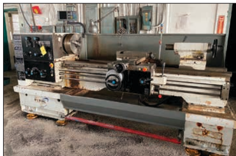
DMTG LATHE MODEL CDS-206-OC