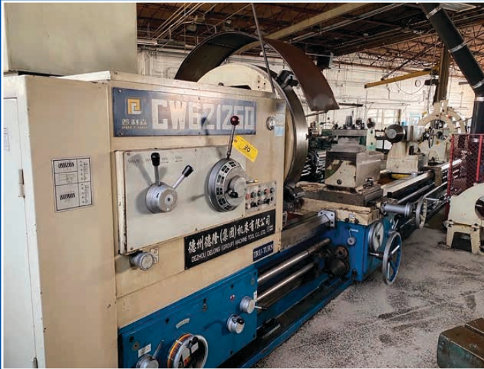
Dezhou Delong Lathe Model CW621250

INSPECTION: WEDNESDAY, MARCH 25, 9 AM TO 4 PM