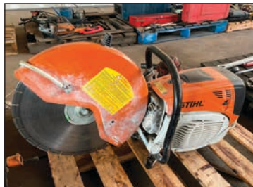
STIHL CONCRETE SAW MODEL TS800, GAS POWERED