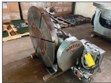
ROTAB 36" MOTORIZED UNIVERSAL ROTARY TABLE