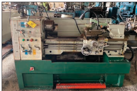
GRIZZLY LATHE MODEL G0509