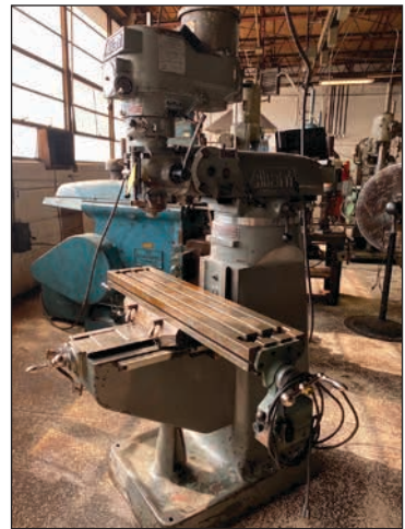
ALLIANT 2 HP VERTICAL MILLING MACHINE, POWER FEED