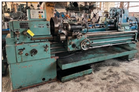
TOS LATHE MODEL 40B