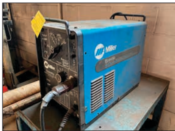
MILLER WELDER MODEL ECONOTIG