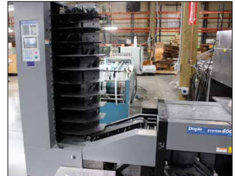
DUPLO SYSTEM 4000 COLLATOR/STACKER

Morgana Autofold Pro Paper Folder Max Sheet Size: 35.4" x 19.6", 6240 SPH, Smart Screen Touch Control