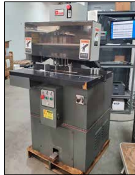
BAUM DRILL MODEL ND-10