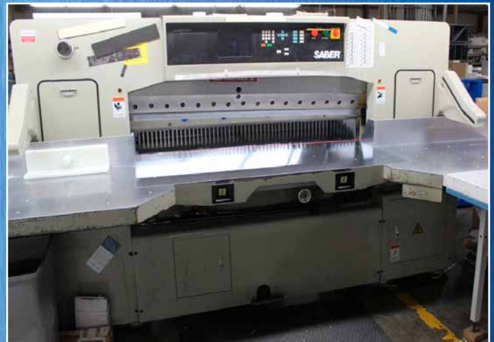
Saber 62" Paper Cutter Model S-158

SALE DATE: Thursday, July 9, 1:00 PM (ET)