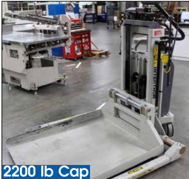
2200 lb Cap

INTERTHOR ELECTRIC WALK BEHIND LIFT MODEL TPS22ME46