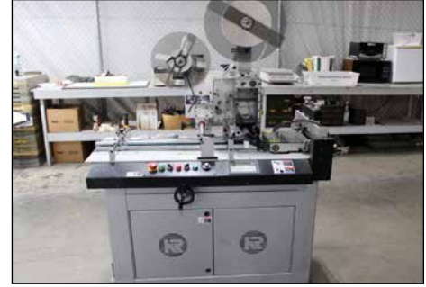
KIRK RUDY TABBER MODEL 535-CS