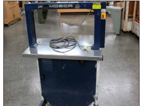
EAM MOSCA STRAPPER MODEL RO-M-P