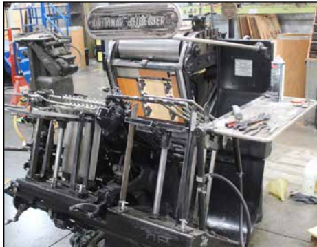
HEIDELBERG 12" X 18" WINDMILL PRESS