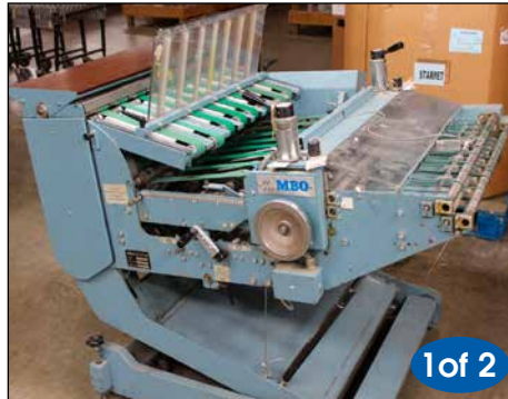
MBO STACKER MODEL FA66ME