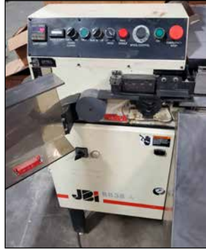
JAMES BURN WIRE-O COIL BINDER BB38A