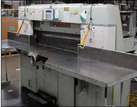
LAWSON PACEMAKER II 59" PAPER CUTTER