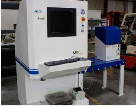
GFI INNOVATIONS MX6 INK FORMULATION DISPENSER