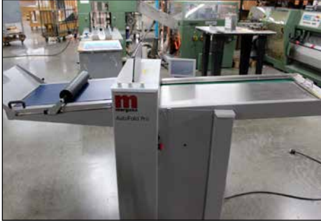
MORGANA AUTOFOLD PRO PAPER FOLDER