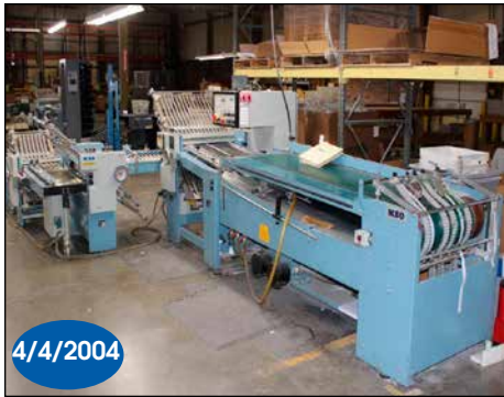
MBO B123 FOLDER