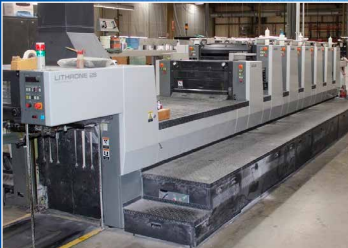
Komori L628 Printing Press with Coater

1490 Southern Road, Kansas City, Missouri 64120