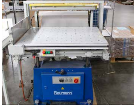
BAUMANN JOGGER MODEL BSB 3L