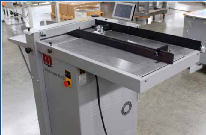
Morgana AutoCreaser Pro 50 Creasing Machine

INSPECTION: Wednesday, July 8, 9 AM TO 4 PM