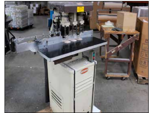
CHALLENGE 3-SPINDLE DRILL MODEL EH-30