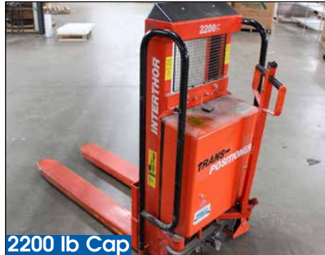
2200 lb Cap

INTERTHOR ELECTRIC WALK BEHIND LIFT MODEL TPS22ME46