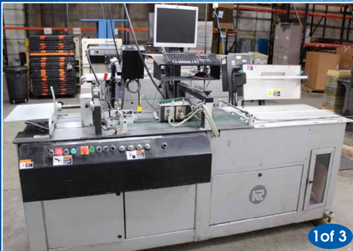
Kirk Rudy Variable Data Inkjet Printer #215