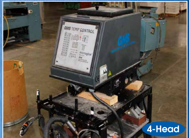
GMS Hot Glue System Model M-34-4