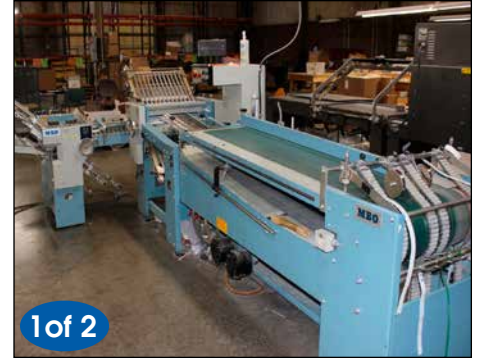
MBO B26-C FOLDER