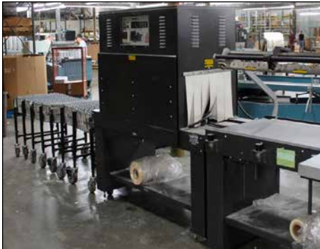
EASTEY L-SEAL PACKAGING MACHINE MODEL ET2016