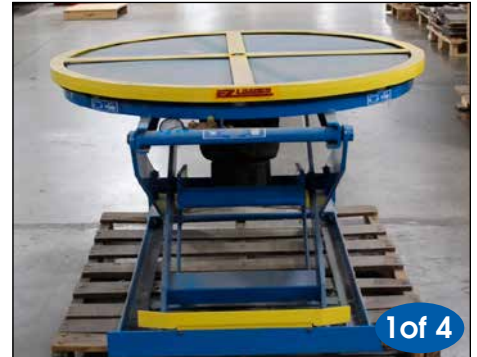
1 of 4