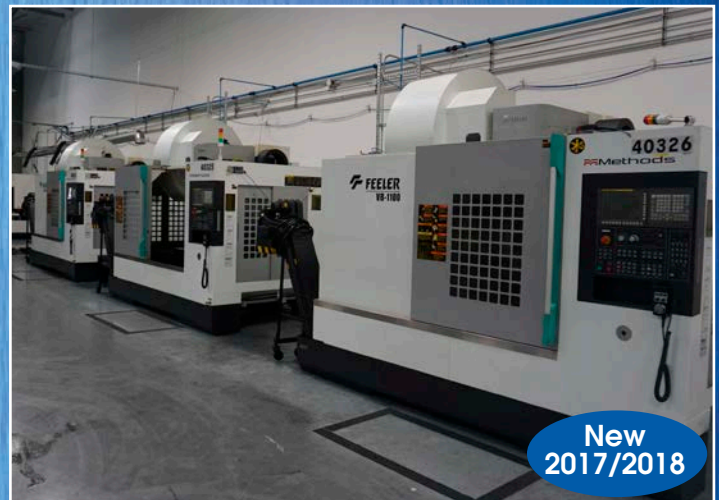
View of Feeler VB1100 Vert Machining Centers