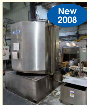
PRECISION METAL WORKS STAINLESS STEEL HEATED PARTS WASHER MODEL 812SS

All Machines Immaculately Maintained For Turbine Engine Component Manufacturer