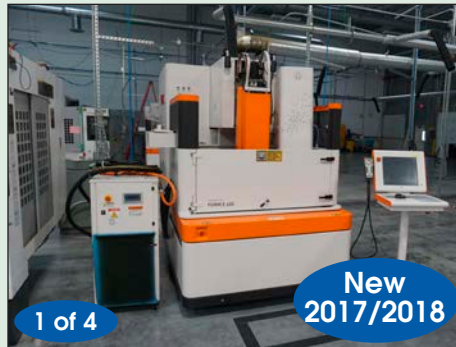
AGIE CHARMILLES FORM E600 CNC DIE SINKING EDM