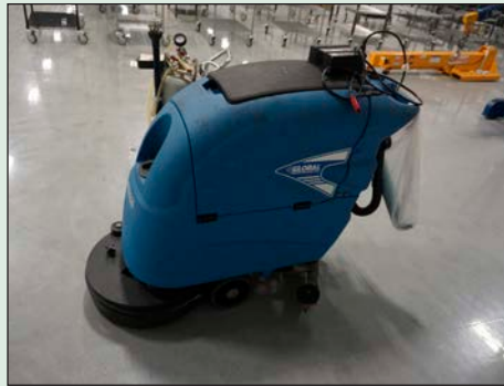
GLOBAL FLOOR SCRUBBER