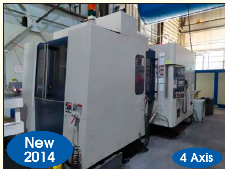
KIWA LITZ HITECH KMH500A-F001 HORIZONTAL MACHINING CENTER