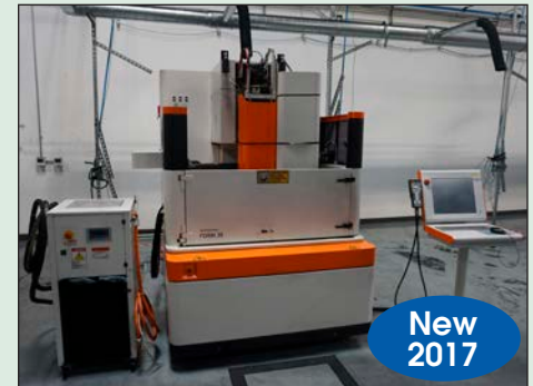
AGIE CHARMILLES FORM 30 CNC DIE SINKING EDM