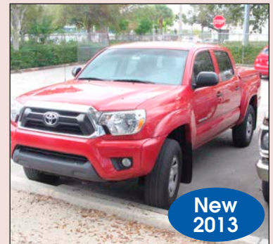
TOYOTA TACOMA PRERUNNE PICKUP