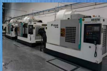
View of Feeler VB1100 Vert Machining Centers