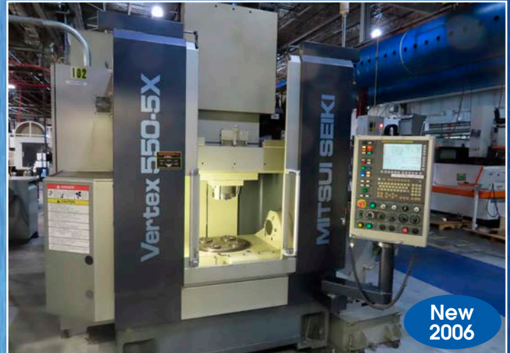
Mitsui Seiki Vertex 550-5X VMC Model VTX55X