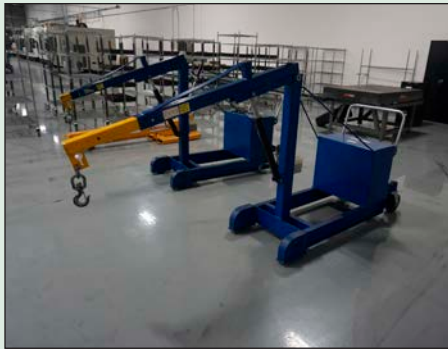
PORTABLE BOOM LIFTS