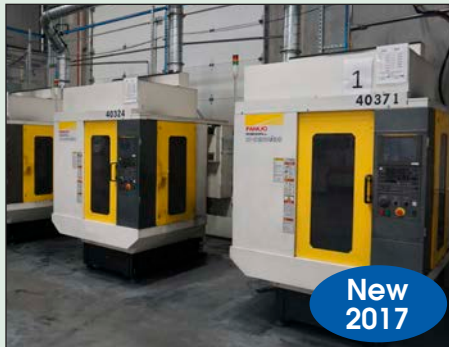
FANUC 3-AXIS ROBODRILLS MODEL A04B-0102-B134-BBH