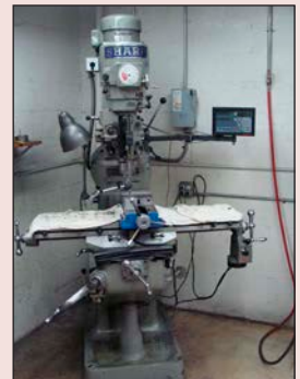
SHARP VERTICAL MILL