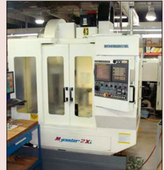
KITAMURA MYCENTER 2XI CNC VERT MACHINING CENTER