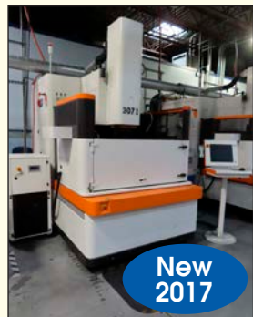
AGIE CHARMILLES FORM 30 DIE SINKING EDM