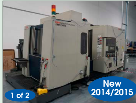
LITZ KIWA METHODS KMH500B-F001 4-AXIS HORZ MACHINING CENTER