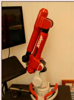
VERISURF-X MASTER 3D GAGE