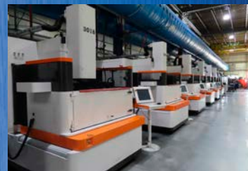
View of Charmilles Form 30 Die Sinking EDM Machines