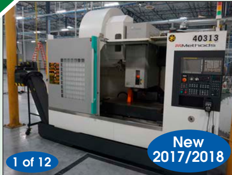
FEELER VB1100 VERT MACHINING CENTER