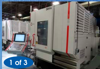
Hermle C12U 5-Axis Vertical Machining Center

Inspection: Wednesday, October 7, 9 AM to 4 PM (local)