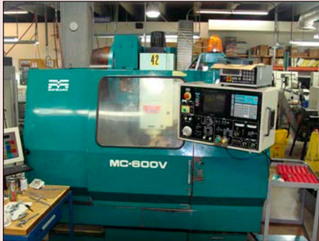
MATSUURA MC-600V CNC VERT MACHINING CENTER