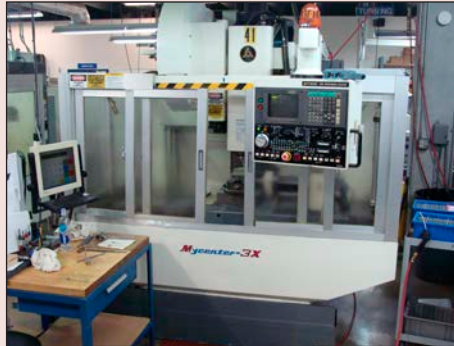
KITAMURA MYCENTER 3X CNC VERT MACHINING CENTER