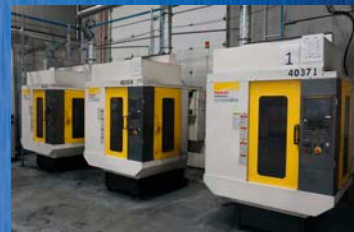
Fanuc 3-Axis Robodrills Model A04B-0102-B134-BBH