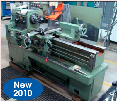
HWACHEON HL460 LATHE