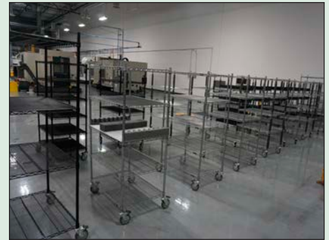
LARGE ASSORTMENT OF METRO RACKS