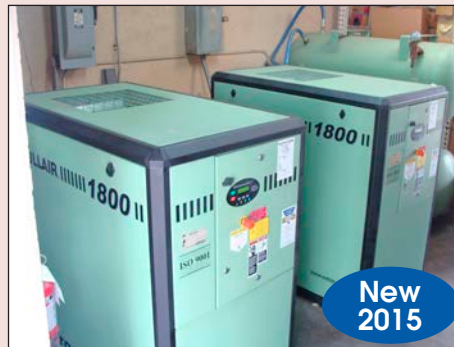
(2) SULLAIR 1809AC ROTARY SCREW AIR COMPRESSORS