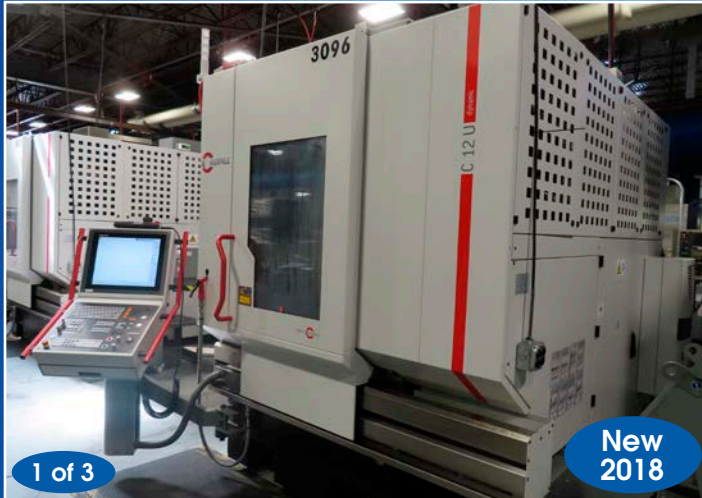
Hermle C12U 5-Axis Vertical Machining Center

Due to Plant Consolidation of Whitcraft Group A World Class Aerospace Engine Component Manufacturer