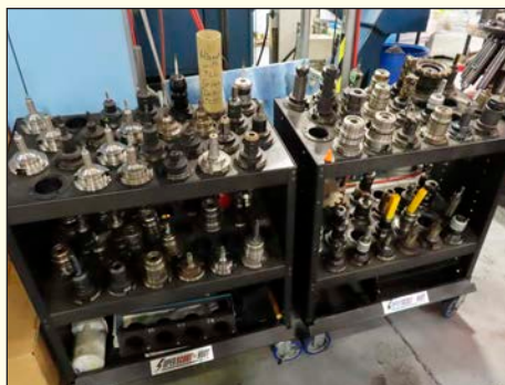
LARGE ASSORTMENT OF CNC TOOL HOLDERS