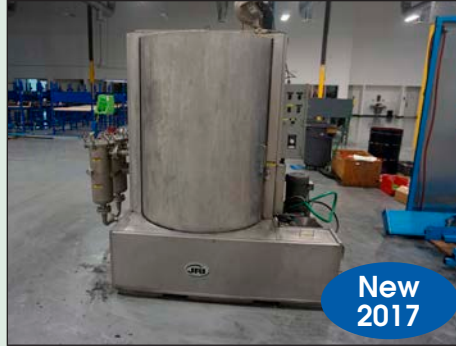
JRI STAINLESS STEEL PARTS WASHER MODEL FLF3648F