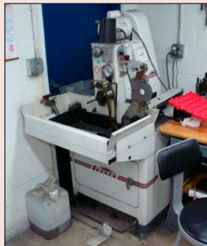
SUNNEN MBB-1660-K HONE