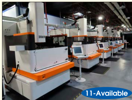
AGIE CHARMILLES FORM 30 DIE SINKING EDM