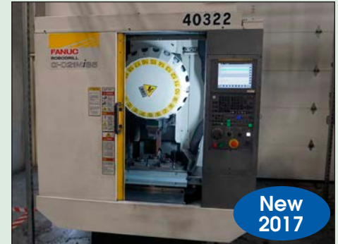
FANUC 3-AXIS ROBODRILL MODEL A04B-0102-B134-BBH