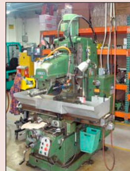
OKK MH-2P VERTICAL MILL