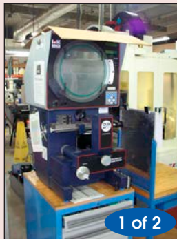
OGP OPTICAL COMPARATORS MODEL BASIC