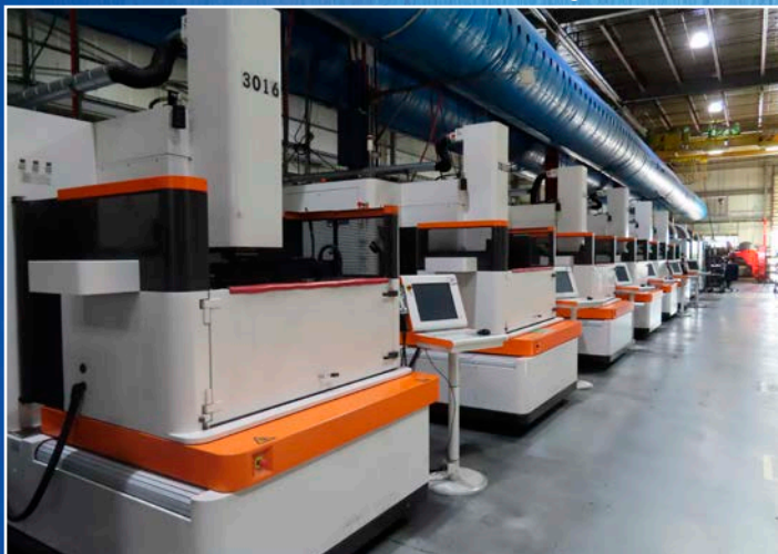
View of Charmilles Form 30 Die Sinking EDM Machines