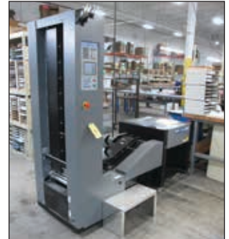
DUPLO SYSTEM 5000 DC-10/60 COLLATOR WITH STACKER