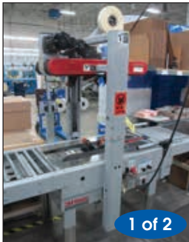
3M-MATIC CASE SEALER MODEL 700R