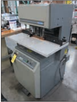
CHALLENGE 3 SPINDLE PAPER DRILL MODEL MS-5