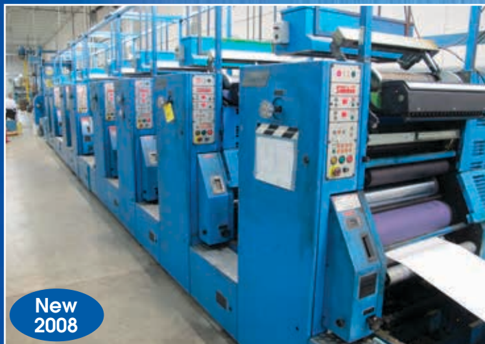
Sanden 8/C Press Quantum 1250 24" x 22.75" Cutoff

7700 68th Ave North, Suite 7, Minneapolis, MN 55428