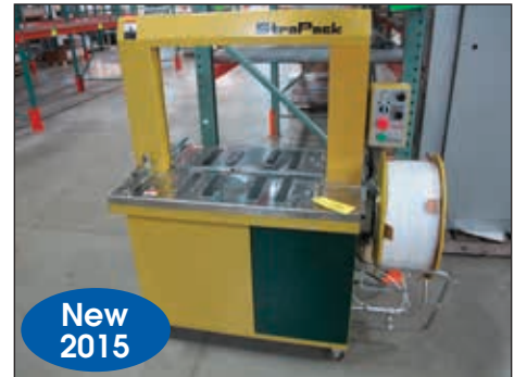
STRAPACK STRAPPER MODEL RQ-8AFB4