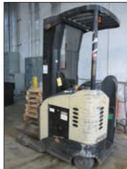
CROWN ELECTRIC STAND UP FORKLIFT MODEL 5200