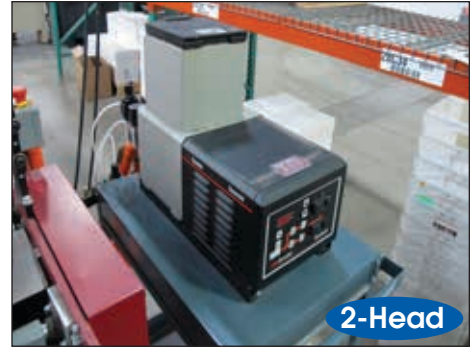
ITW DYNATEC DYNAMINI HOT GLUE SYSTEM