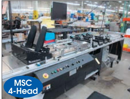
PARAGON VARIABLE DATA PRINT SYSTEM