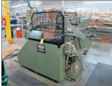
KLUGE DIE CUTTER MODEL EHD14X22