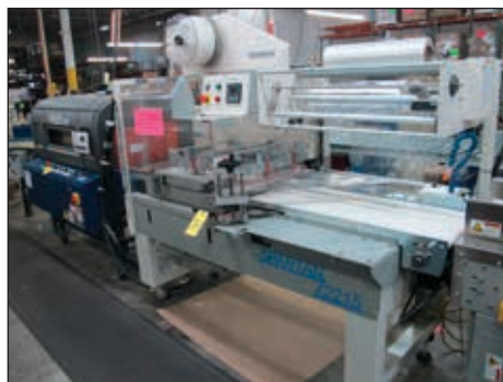
TEXWRAP T2215R PACKAGING MACHINE W/SHANKIN ST700 TUNNEL