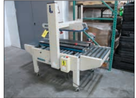
INTERPACK CARTON SEALER MODEL USA2024-SB