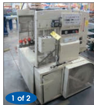
MIEHLE VERTICAL DIE CUTTER