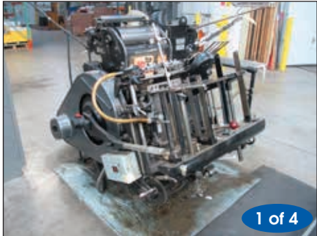
ORIGINAL HEIDELBERG WINDMILL PRESS