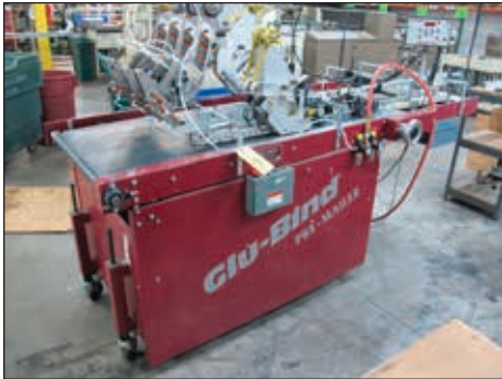
DICK MOLL GLU-BIND PREMAILER