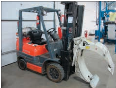
TOYOTA 5000 LB LPG CLAMP TRUCK MODEL 42-6FGCU25