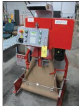
SEALED AIR PACK TIGER PAPER CUSHIONING SYSTEM