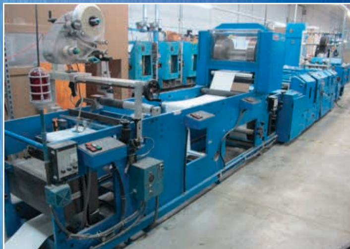
Sanden Processing Line Model V1200