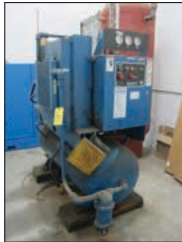
QUINCY 25 HP AIR COMPRESSOR MODEL QSB25