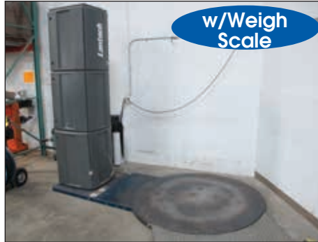
LANTECH Q-SERIES ROTARY STRETCH PALLET WRAPPER