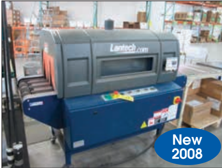
LANTECH HEAT SHRINK TUNNEL #ST700

SALE DATE: FIRST LOT CLOSSES WEDNESDAY, DECEMBER 16, 1:00 PM (ET)