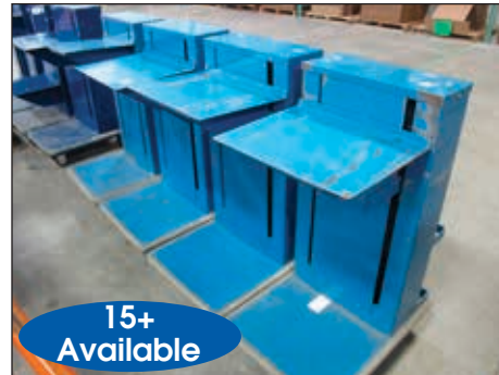
AMF WYOTT LOWERATOR PORTABLE ADJUSTABLE HEIGHT CARTS