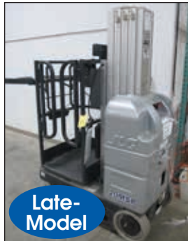
JLG MANLIFT MODEL 20MSP