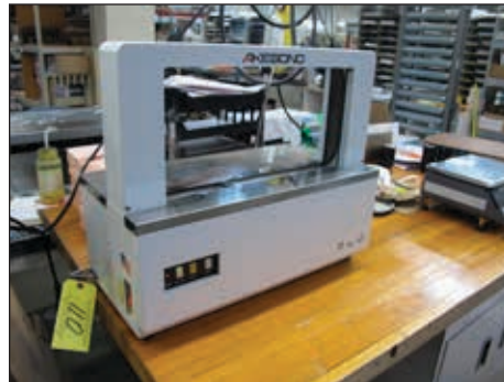
AKEBONA STRAPPER MODEL OB-360