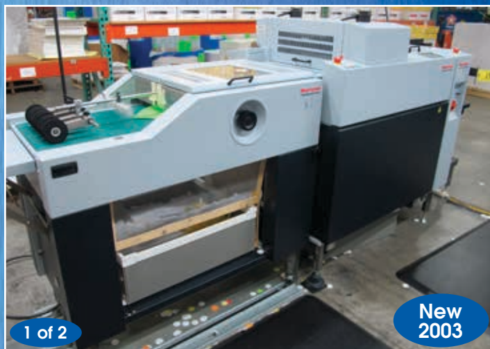
Horizon Rotary Die Cutter Model RD-4055DM

SALE DATE: Wednesday, December 16, 1:00 PM (ET)