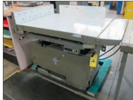
POLAR MOHR JOGGER MODEL RB5