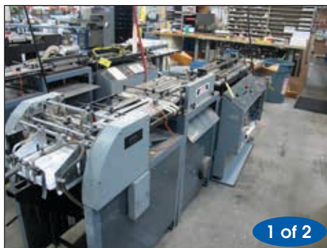
ADVENT HOLE PUNCH/DIE CUT MACHINE MODEL MDCHP