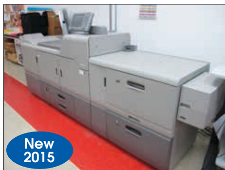
RICOH PRO C7100 DIGITAL PRINT SYSTEM