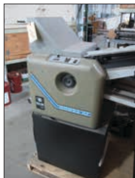
BAUM ULTRAFOLD XLT FOLDER