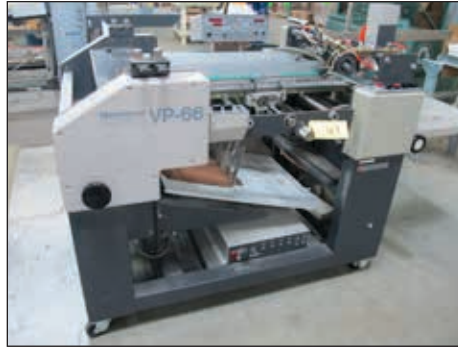
HORIZON PERF SLIT SCORE MACHINE MODEL VP-66