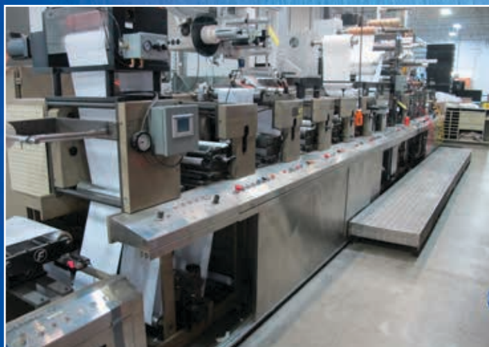
Aquaflex 8/C Flexo Press Model BXX1307, 13" Width