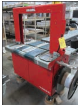
SAMUEL STRAPPING MACHINE MODEL P710