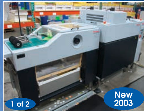
Sanden 8/C Press Quantum 1250 24" x 22.75" Cutoff