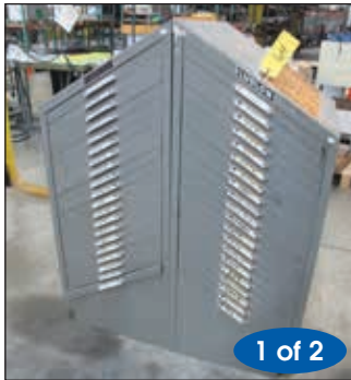
LUDLOW FLAT DIE STORAGE CABINETS