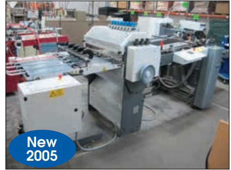
HEIDELBERG STAHL PERF SCORE MODEL SSP-66.D