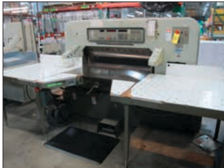
POLAR MOHR PAPER CUTTER MODEL 115EMC