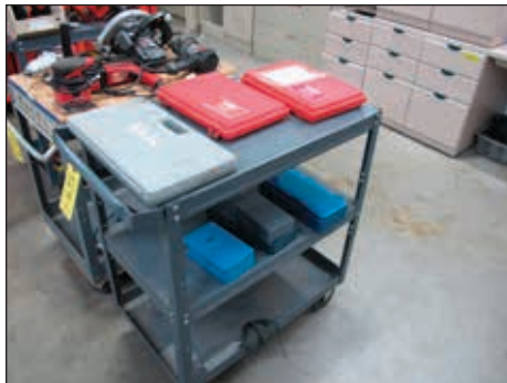
POWER TOOLS, TAPS, DIE, DRILLS