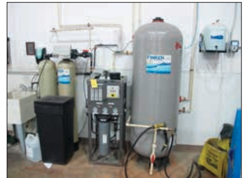
FINKEN WATER TREATMENT SYSTEM