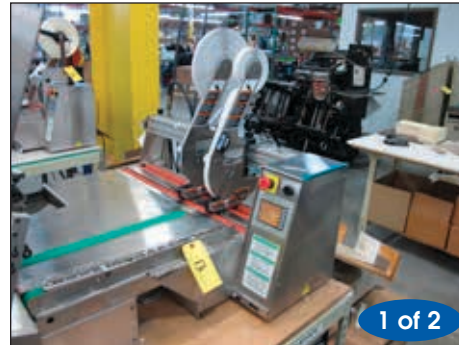
STRAUB LABELLER MODEL PROFACE-T646WI