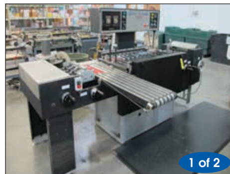
SCOTT 10,000 INDEX TAB MACHINE