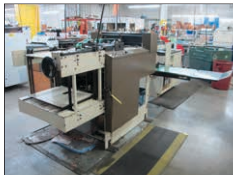
NORTON SPIEL PUNCH MODEL 3120