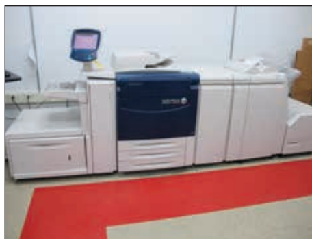
XEROX 770 DIGITAL COLOR PRESS