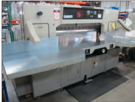
SABER PAPER CUTTER MODEL S-137