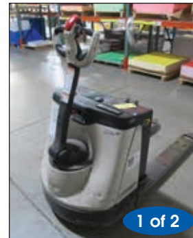
CROWN ELECTRIC PALLET JACK MODEL WP2335-45