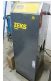
ZEKS COMPRESSED AIR DRYER MODEL 200HSGA400