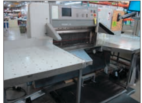
POLAR MOHR PAPER CUTTER MODEL 115E