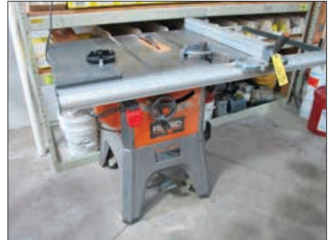
RIDGID TABLE SAW