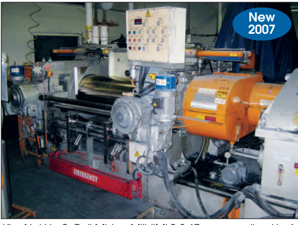
Kim Nai Ho 2- Roll Mixing Mill #ML2-3 (Compounding Line)