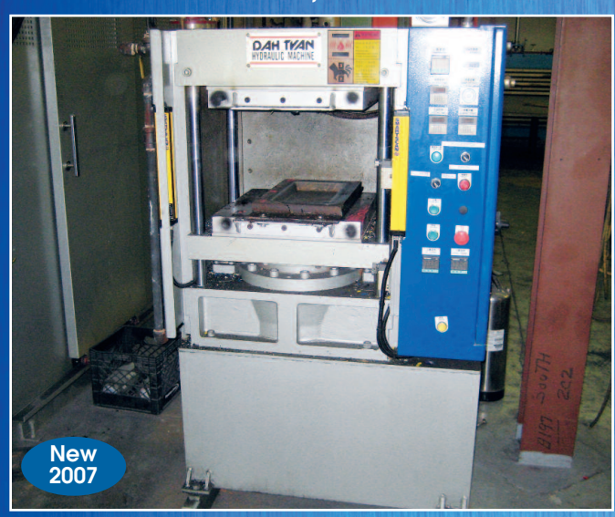
DAHTYAN R&D LAB PRESS

SALE DATE: THURS, DECEMBER 9, 10:30 AM (ET) INSPECTION: WEDS, DECEMBER 8, 9 AM TO 4 PM