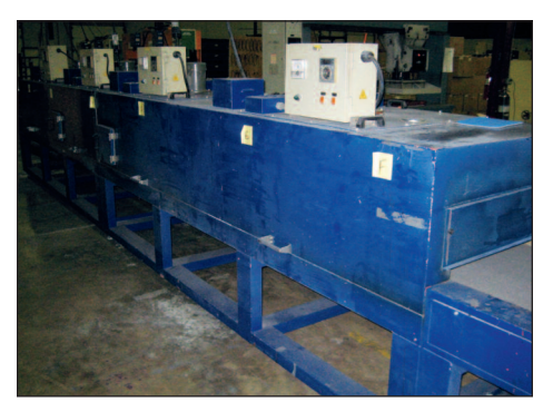
4-Zone Electric Tunnel Type Oven