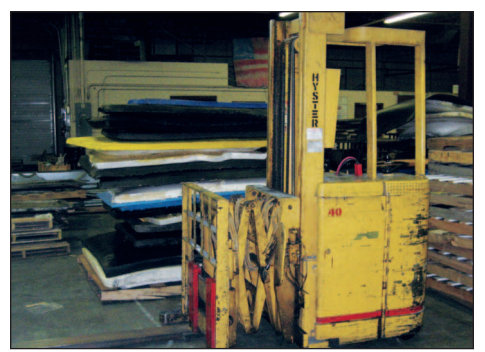
Hyster 2,500 Lb Stand Up Forklift, Model 40