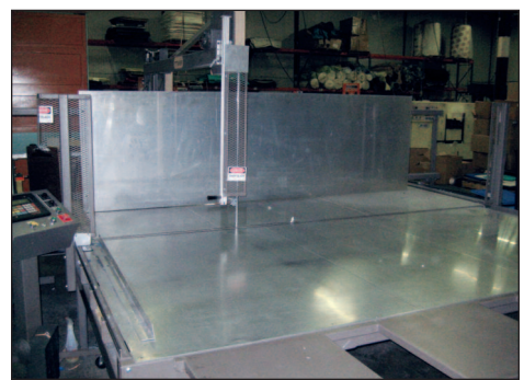
Tarp Foam Cutting Machine/Saw Model AV$40G