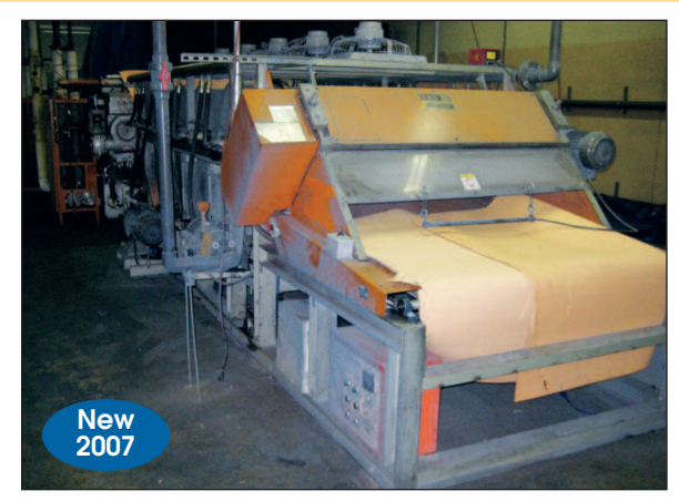
View of Compounding Line