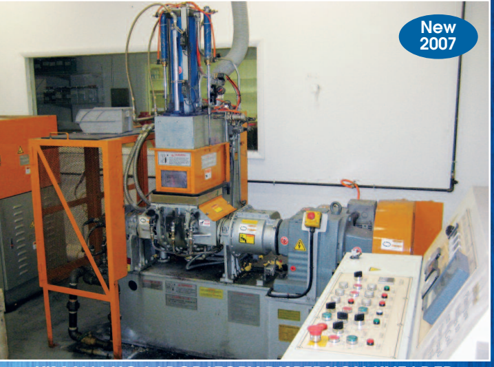
KIM NAI HO LABORATORY DISPERSION KNEADER MODEL YK-3SH