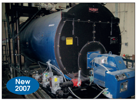
Hurst Hi-Pressure Gas Fired Boiler