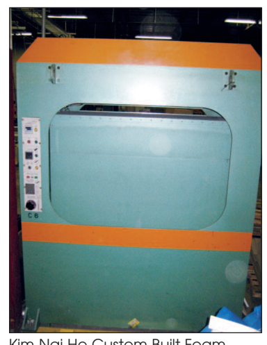
Kim Nai Ho Custom Built Foam Laminating Press