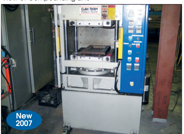
Dahtyan R&D Lab Press