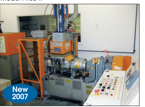
Kim Nai Ho Laboratory Dispersion Kneader Model YK-3SH