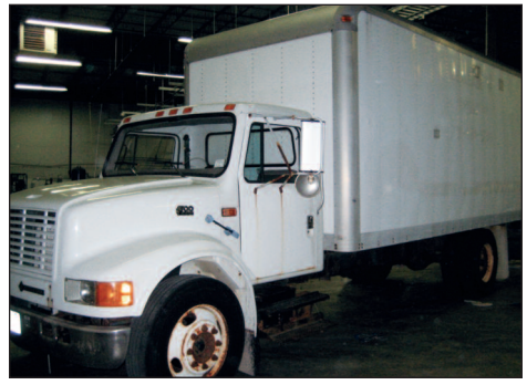
International 4700 Box Truck