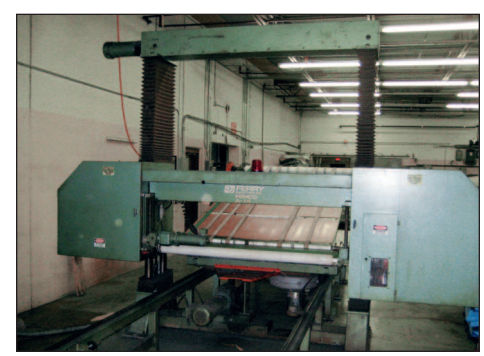
Ferry 80" Splitter/Skiver Model Femco-A-14