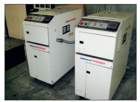
(2) Microtherm Temp Controls CMXO Series

Miller Syncrowave Model 351 AC/DC Welding Power Supply S/N KH362598 (New 1997) w/ Bernard Chiller