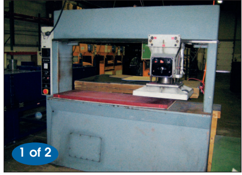
GTH Clicker Press Model 2065