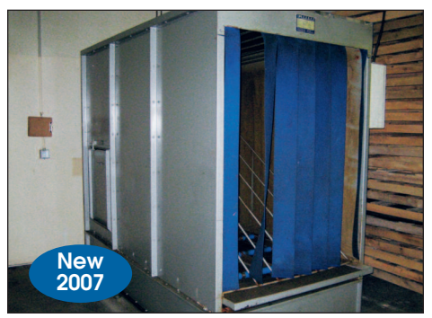
Tinyann Bun Washer, Model TY14