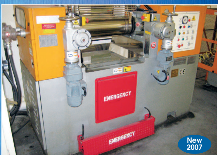
KIM NAI HO 2-ROLL MIXING MILL #ML2-3 (COMPOUNDING LINE)