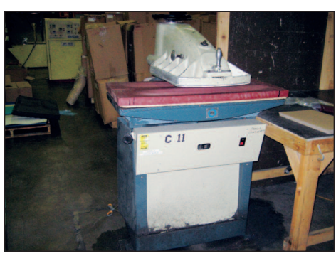
USM Die Clicker Press, Model B1