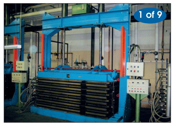
Kim Nai Ho Multi Platen Press