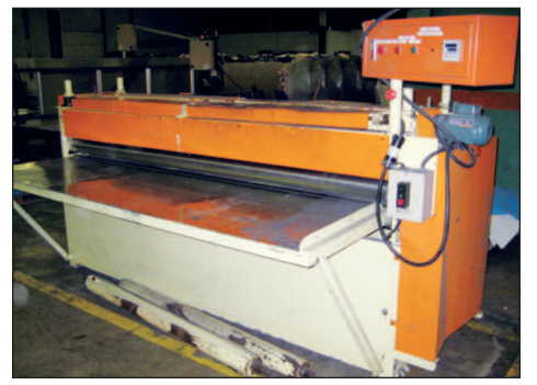
8' Slitter, Single Roll, Multi-Blade