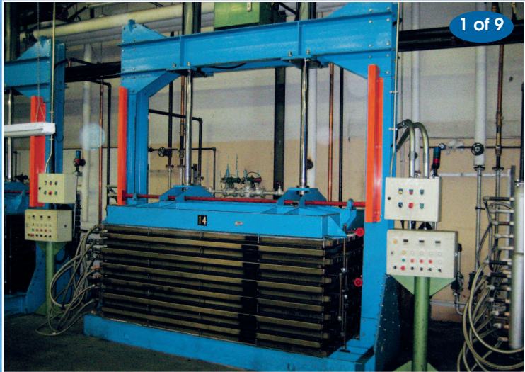
KIM NAI HO MULTI PLATEN PRESS