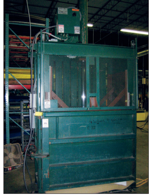
McClain Epco Vertical Baler Model E-11

Sheeter Line w/ Autofeed, Guillotine, Laminating Station, Control Panel