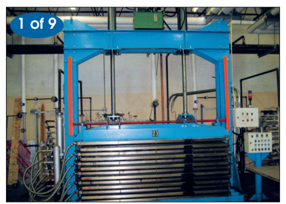
Kim Nai Ho Multi Platen Press