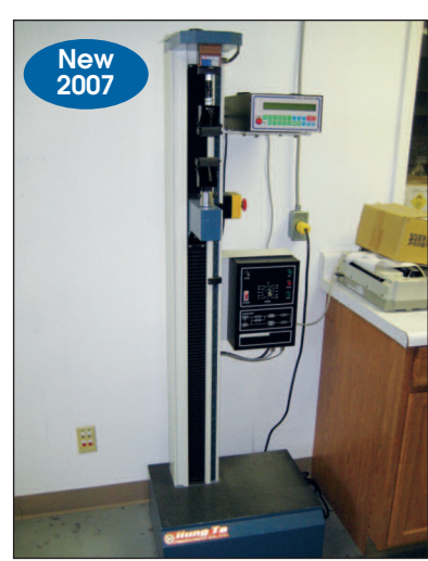
Hung TA Instruments Tensil Tester Model HT8336-S

Kim Nai Ho Stainless Steel Laboratory Mill Model MT2-2, S/N 07193-G (New 2007), 8" x 24" w/ Control, 10 HP, 3 KW, Roll Revolution R.PM Front = 21.93 Rear = 24.2