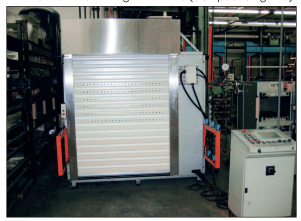
Tinyann Shrouded R&D Single Platen Press