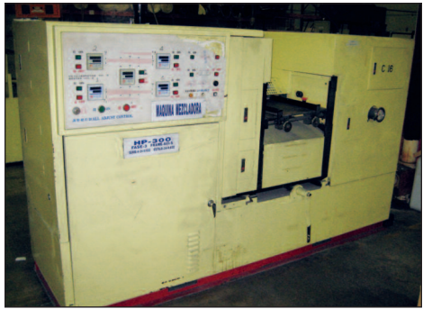
Maquina Mezcladora Buffing Machine Model HP300