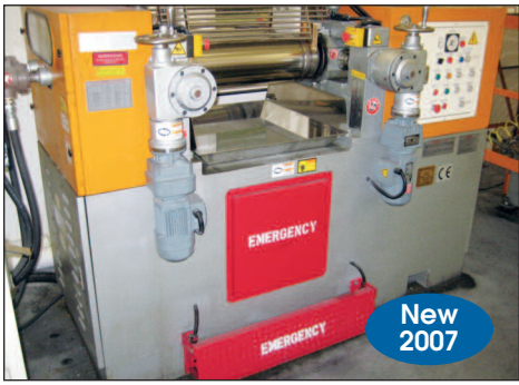
Kim Nai Ho Laboratory Mill Model MT2-2