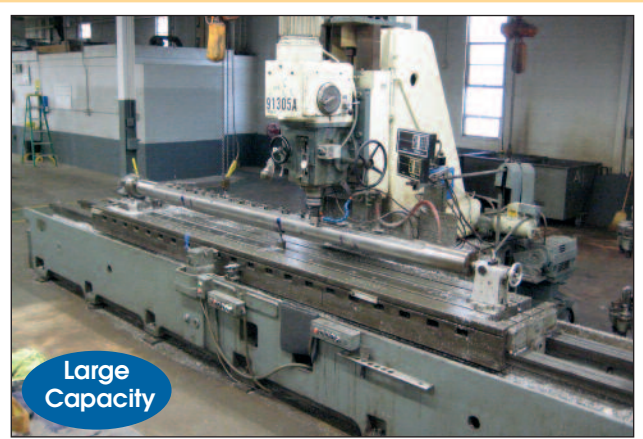
SUNSTRAND VERTICAL BED MILLER