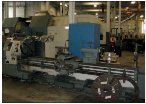
OKUMA # LT HEAVY DUTY LATHE