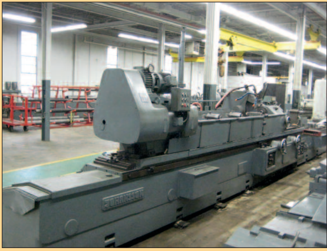
Johansson 28"x 157" Cylindrical Grinder (Overview)