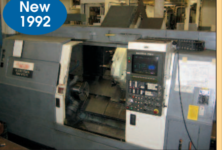
MAZAK # Slant-Turn 35N-1000-ATC-M/C