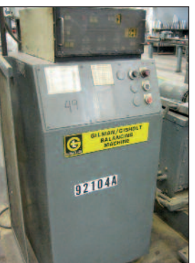
GISHOLT BALANCING MACHINE