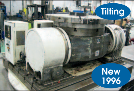
KURAKI-FANUC 15M CNC CONTROLS

ELLIOT-ZEATS 32" CNC TILTING ROTARY TABLE