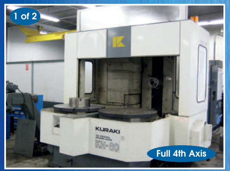
KURAKI # KH-80 CNC HMC