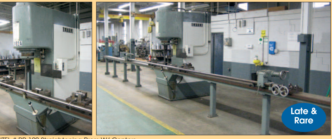
EITEL # RP-100 Straightening Press W/ Centers