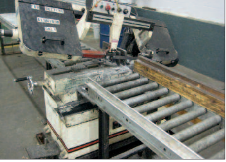
JET HORIZONTAL BANDSAW