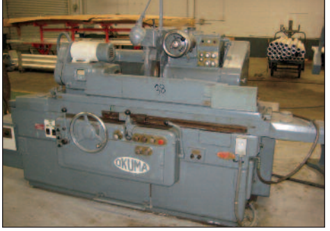
OKUMA 9"x 30" Plain Cyl. Grinder