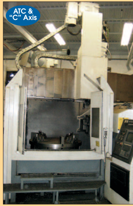
MONARCH 47" CNC VTL with "C" AXIS