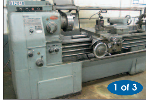
OKUMA # LS 21"x 59" ENGINE LATHES