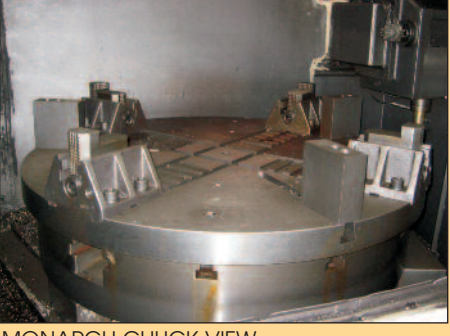
MONARCH CHUCK VIEW