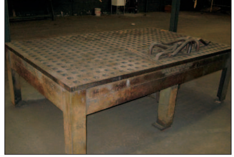
ACORN WELDING TABLE