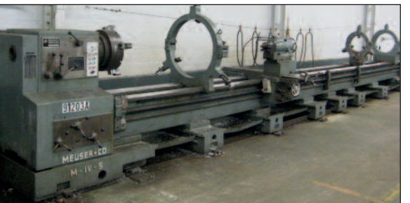
MEUSER 40"/52"x 348" ENGINE LATHE