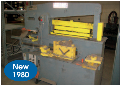
SCOTCHMAN 70 TON Hyd. IRONWORKER