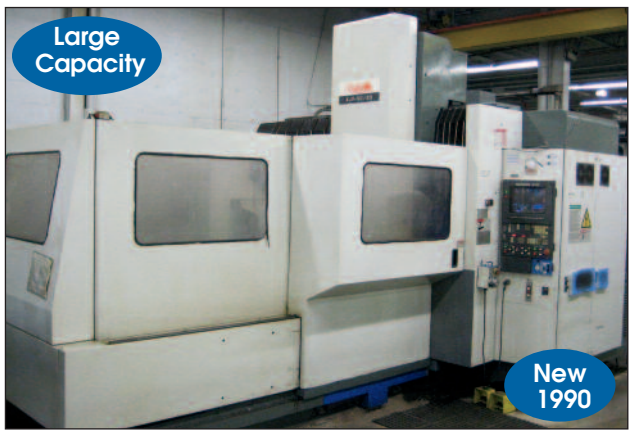
MAZAK # AJV-50/80 CNC VMC