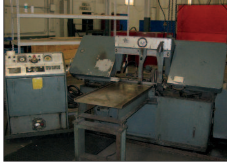
MARVEL # 15-A4 AUTOMATIC BANDSAW