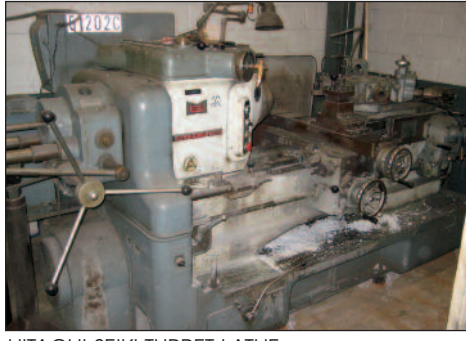
HITACHI-SEIKI TURRET LATHE