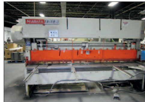
Niagara 10' Power Shear Model 18-10-1/4