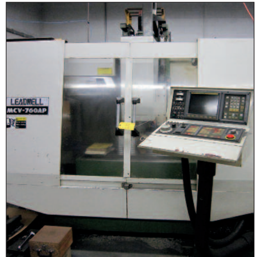
Leadwell MCV-760AP Vertical Machining Center