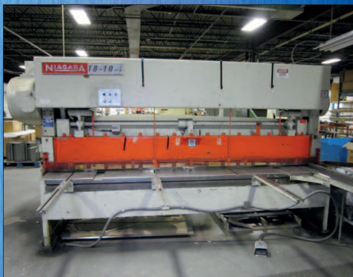
NIAGARA 10' POWER SHEAR MODEL 18-10-1/4