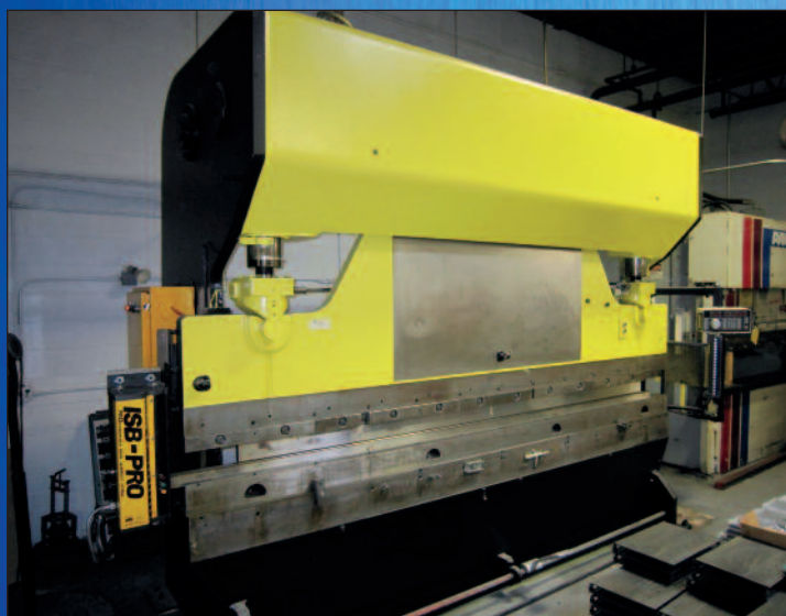
CHICAGO 12' X 150 TON PRESS BRAKE MODEL 1012-R