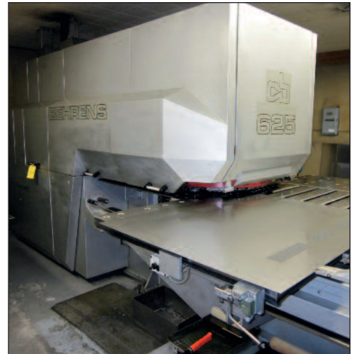
Behrens Versa 25 CNC Turret Punch Press