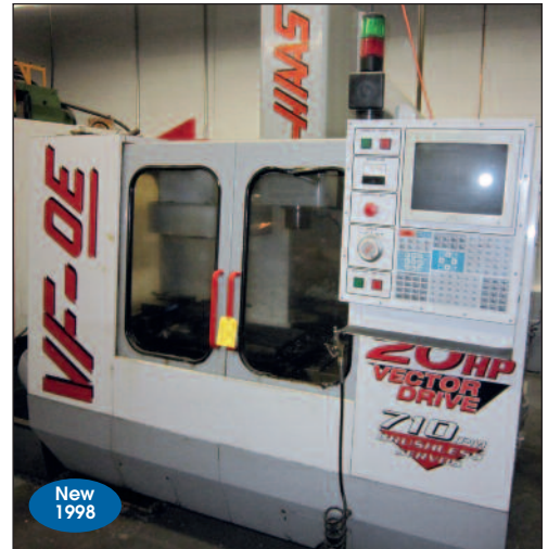
Haas VF-OE Vertical Machining Center