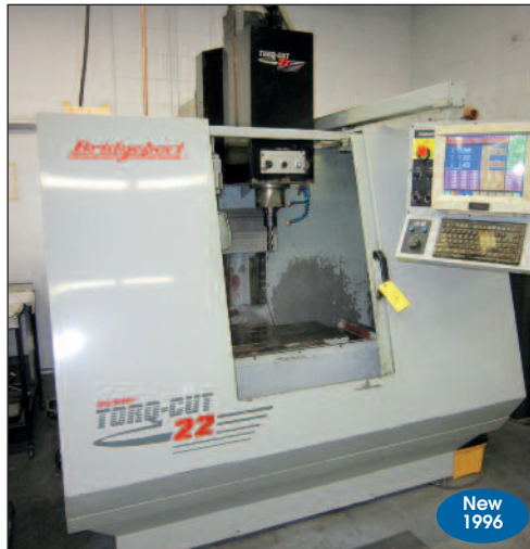
Bridgeport Torq-cut 22 Vertical Machining Center

Niagara 10' Power Shear Model 18-10-1/4, S/N 60962, 1/4" Mild Steel Capacity, Front Operated Back Gauge