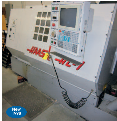
Haas HL-1 Slant Bed Turning Center

Wysong 6' x 35 Ton Press Brake Model 3572, S/N PB59-105, Hurco Autobend Control, 2" Stroke, 3" Adjustment, ISBPC-600 Light Safety Curtain