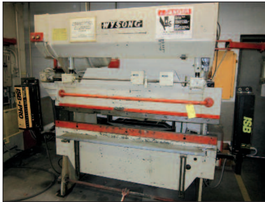
Wysong 6' x 35 Ton Press Brake Model 3572