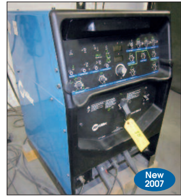
Miller Welder Model Syncrowave 350LX