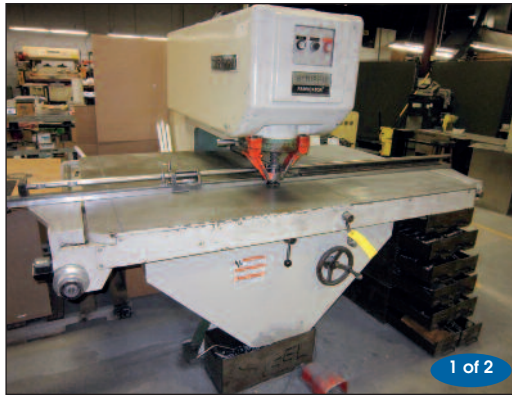
Strippit Punch Press Model Super 30/30