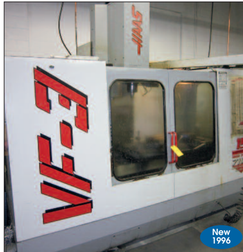
Haas VF-3 Vertical Machining Center

Leadwell CNC Vertical Machining Center Model MCV-760AP, S/N L19012020 (New 1993), FANUC-OMF, S/N 0093269, 220, 3 PH, 60 HZ, 24 Tools, 20" x 40" Table, Travels: X=29.9", Y=20.1", Z=20.1