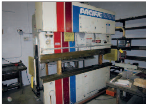
Pacific 8' x 135 Ton Press Brake Model J135-8