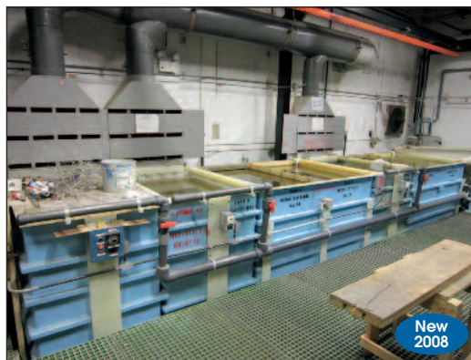
Etch/Iridite Plating System, (15) 400 Gal Tanks.