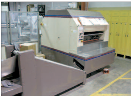
Kansa Series 3 Auto Padding Machine Model KP3814CF