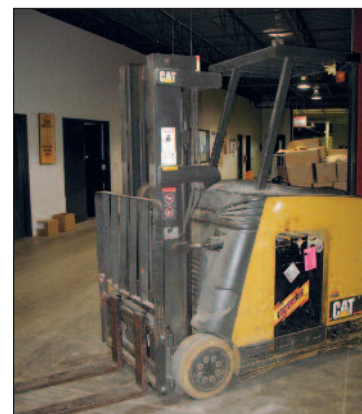
Caterpillar 3000 lb. Forklift Model ED15KS-C30TT