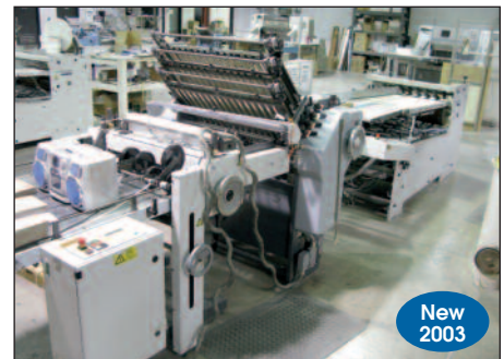
Heidelberg Stahlfolder Folder Model RD-78