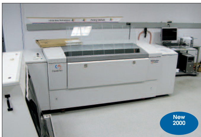
Creo Scitex Spectrum Trendsetter CTP System Model TS8