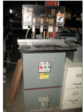
Baum Multiple Spindle Drill Model ND-5