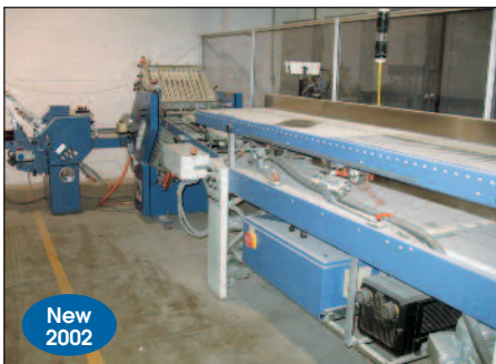
Herzog & Heymann Folder Model 166/02