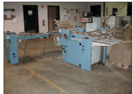
MBO Folder Model B118-1-18/4 P