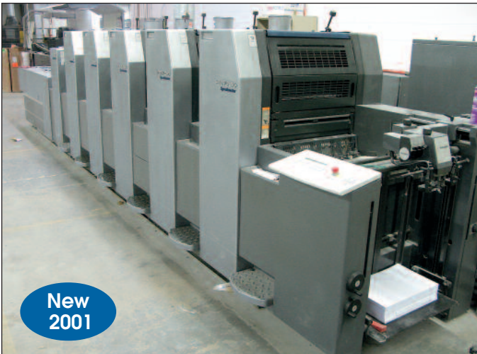
Heidelberg Speedmaster 52-5P3+L 5-Color Press