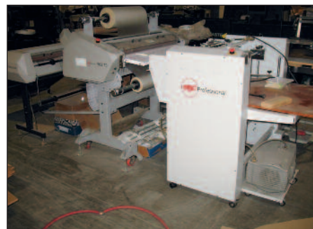
GBC Professional 30" Automatic Laminator