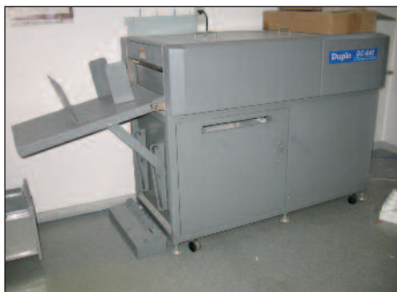
Duplo 14" Slitter/Cutter/Creaser, Model DC-645