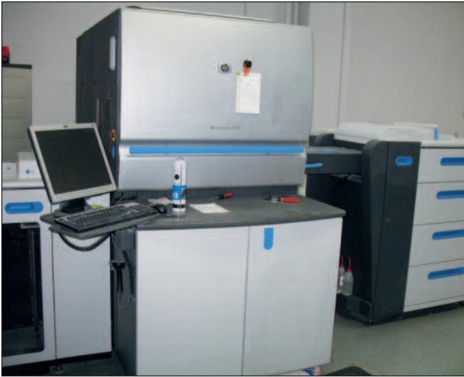
HP Indigo 550 7-Color Digital Press