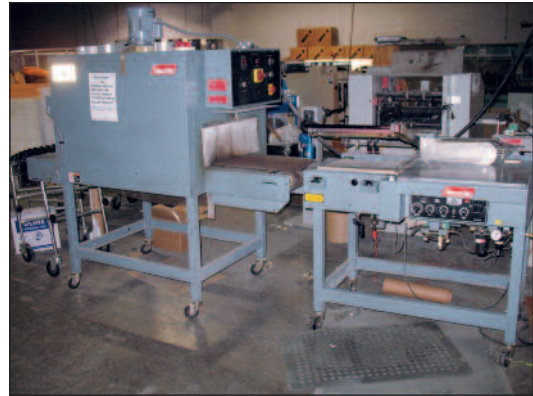
Shanklin Packaging Machine Model S230