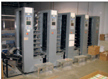
Duplo System 5000 50-Station Automatic Collating Machine