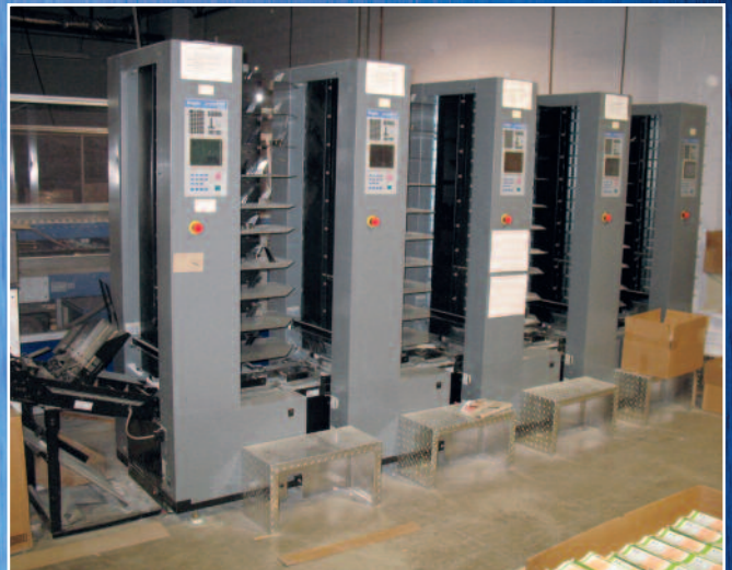
Duplo System 5000 50-Station Automatic Collating Machine

AUCTION INFORMATION: WWW.THOMASAUCTION.COM OR 203-458-0709