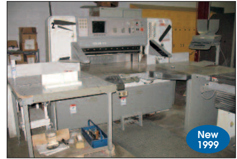
Polar Mohr 45" Power Paper Cutter Model 115ED