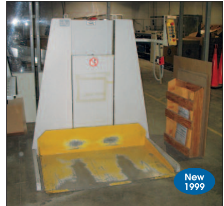
Polar Mohr Stacker/Lift Unit Model LW1000-4