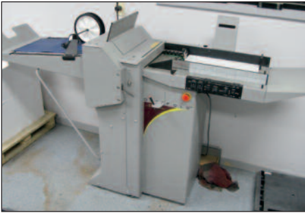
Morgana Digifold Folder/Creaser Model 720-00-02