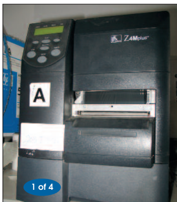
Zebra Label Printers