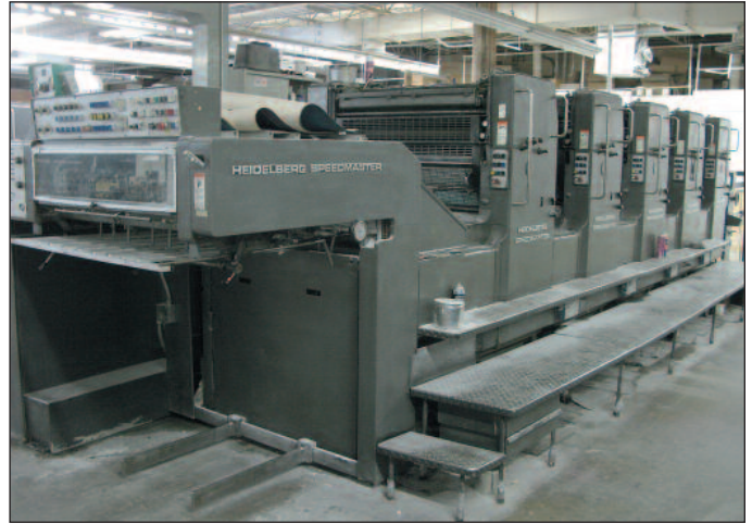
Heidelberg Speedmaster 102F 5-Color Press