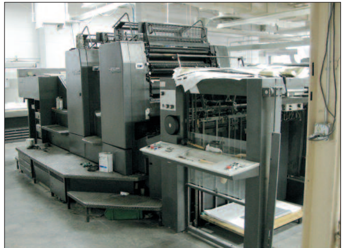
Heidelberg Speedmaster SM102-2-P 2-Color Press