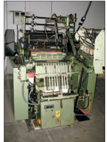
Kluge Die Cutter/Foil Stamper Model EHD14x22