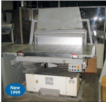
Polar Mohr Jogger Model RA-4