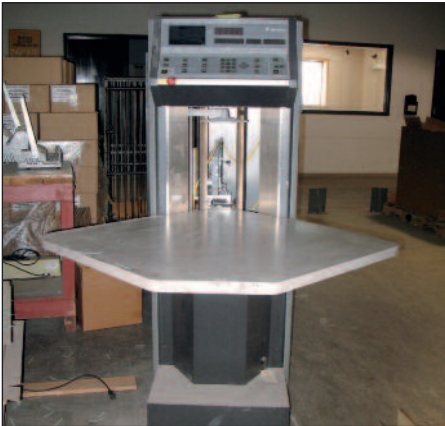
Spartanics Paper Counter Model EZ-KOUNT 750