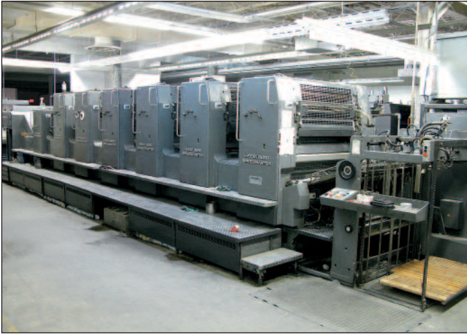
Heidelberg Speedmaster 102 S+L 6-Color Press