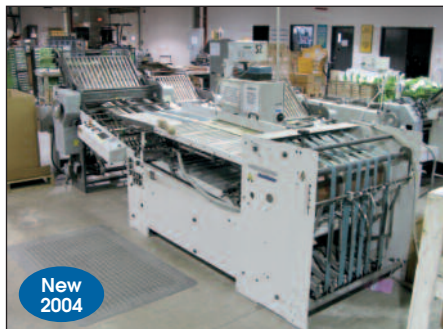
Heidelberg Stahlfolder Folder Model RD-78