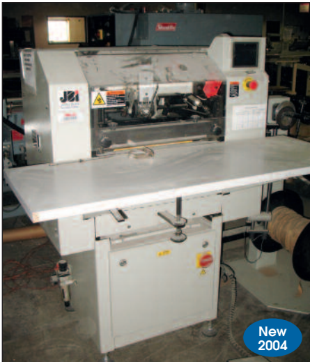
James Burns Wire-O Binding Machine Model BB43/H