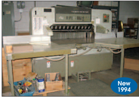
Polar Mohr 45" Power Paper Cutter Model 115EMC