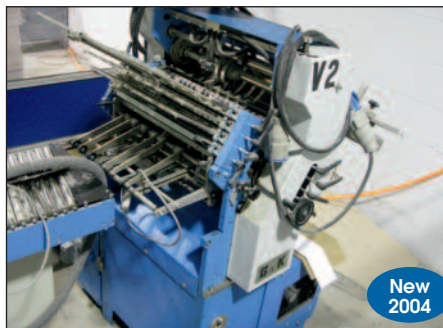
Vijuk G&K 8-Plate Miniature Folder Type FA43/8SVA