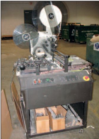
Ameritek Automatic Labeler Model 4 inch