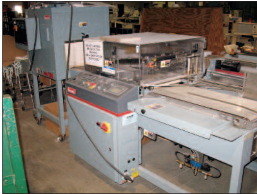
Shanklin Packaging Machine Model A26A