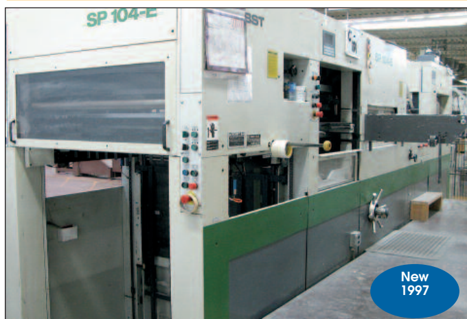
Bobst Die Cutter Model Autoplaten SP 104-E