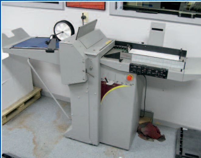
Morgana Digifold Folder/Creaser Model 720-00-02