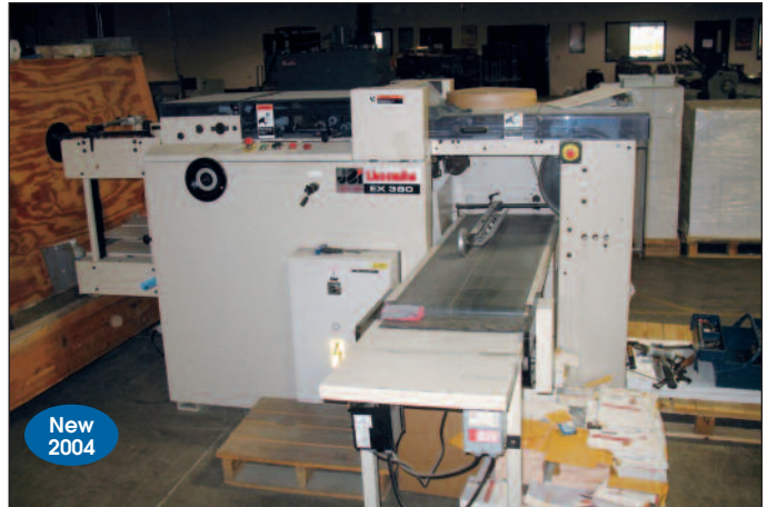
James Burns L'Hermite EX380 Power Punch

Muller Martini Saddle Sticher Line (New 1997) equipped with 6-Inserting Pockets, Cover Feeder Model 1529.0411, Heavy Duty Multi-Head Stitcher, 5' Belt Conveyor Delivery, Roller Conveyor, Extra Knives, Extra Stitching Heads