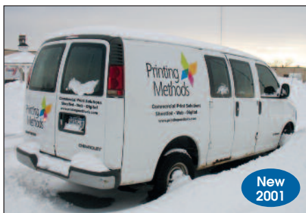
Chevrolet 3500 Express Cargo Van