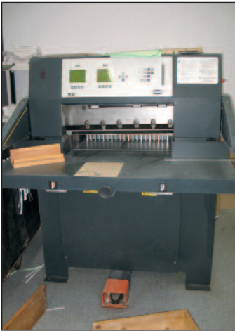
Challenge 26" Power Paper Cutter Model Titan 265 XG