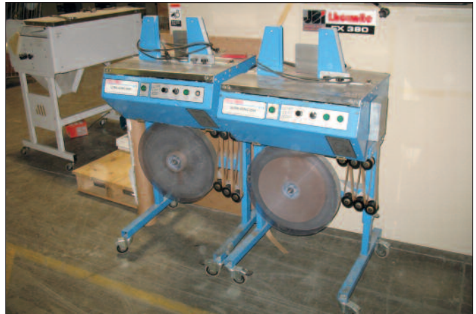
Felins Ultra Sonic 2000 Auto Poly Strapping Machines