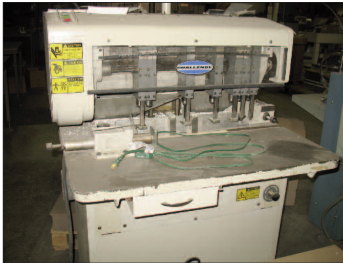
Challenge Drill Model MS-10A