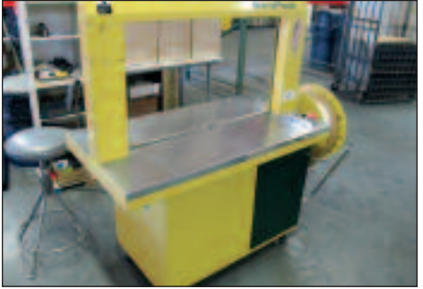
Strapack Automatic Strapping Machine Model RQ-8