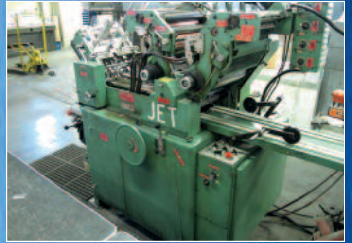
HALM JET 2/C SUPER JET ENVELOPE PRESS MODEL JP-TWOD-6D

MAILCRAFTER INSERTER MODEL 9800L-PM EDGE SERIES