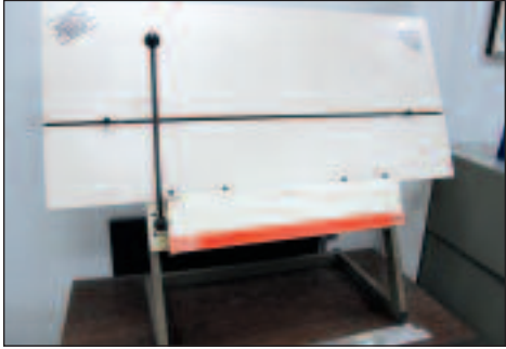
Bacher 2042 Plate Punch