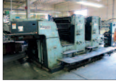
Planeta 2/C Sheet Fed Printing Press Model Super Variant P24 SW