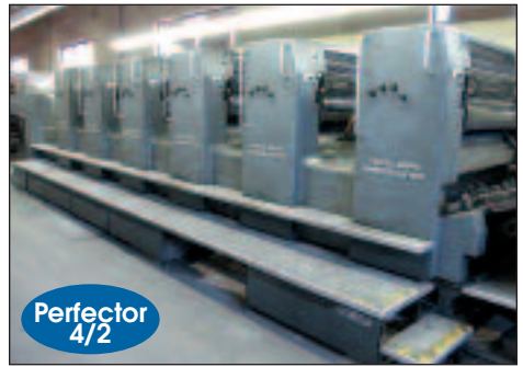
Heidelberg 6/C Sheet Fed Printing Press Model SM102-SP