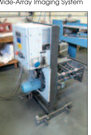
MBO Air Knife Fold Attachment Model Z2