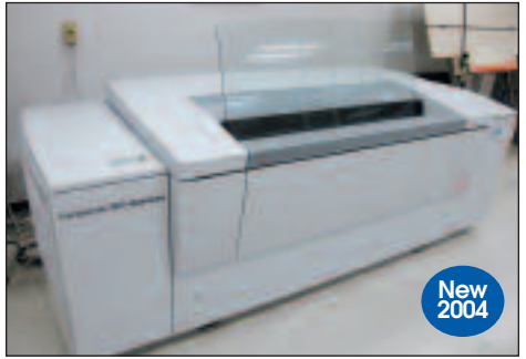
Kodak CTP System Model Trendsetter 800 Quantum