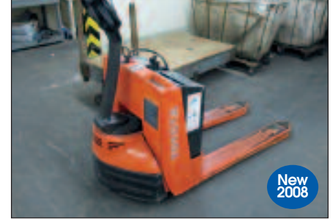
Toyota 4,500 lb. Electric Pallet Jack Model 7HBW23

Strapack Automatic Strapping Machine Model RQ-8 (New 1998); Streamfeeder Reliant 1500 Friction Feeder; X-Rite 341 Densitometer; Bacher 2042 Plate Punch; Clausing Toolroom Lathe; Pedestal Saddle Stitcher Single; Original Heidelberg Windmill Press; Lee Presto 1,000 Lb Lift Table; M.S. Cook Box Stapler Model 9; Walker Turner Drill Press; Lincoln AC225 Welder; (47) 8' High x 4' Deep Uprights for Pallet Racking; Bindery Carts; Work Benches; Light Tables; Flat File Cabinets; Pallet Jacks; etc.