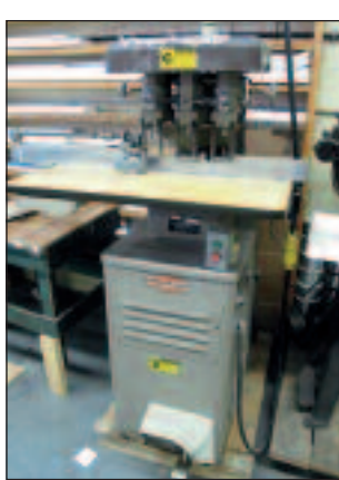
Challenge Paper Drill Model EH-3A