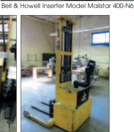
Big Joe 3,000 Lb Electric Walk Behind Forklift Model PDM-30