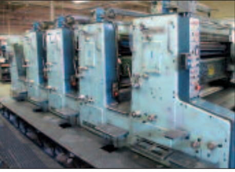
Planeta 4/C Sheet Fed Printing Press Model Super Variant P45 SW2

Muller Martini Saddle Stitcher Line Model JGVS, S/N 64678, (5) ESS Pockets, (2) Stitching Heads, 3-knife Trimmer (Upgraded Direct Drive & New Heads 2 Years Ago)