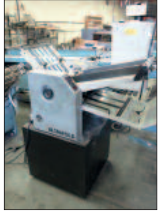
Baum Folder Model Ultrafold 714XE