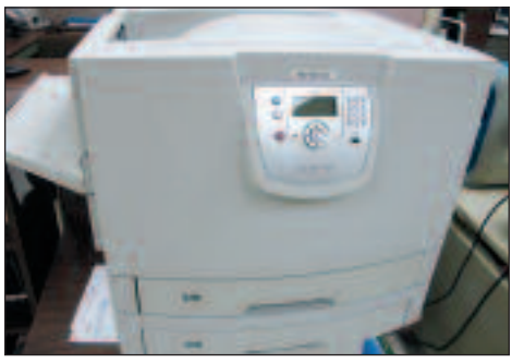
Lexmark C920 Laser Network Printer