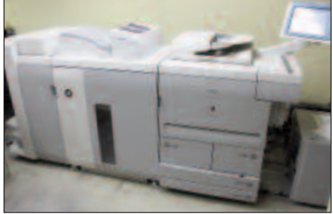
Canon Image Runner 7086 Laser Printer