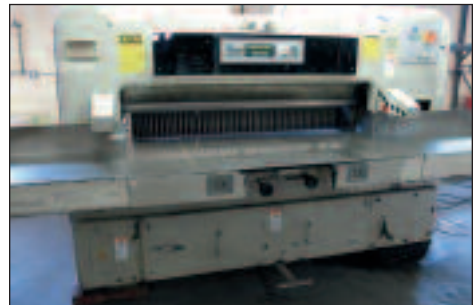
Polar 61" Paper Cutter Model 155 CE