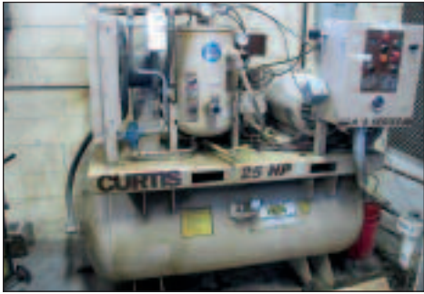
Curtis 25 HP Rotary Screw Compressor Model RS25A