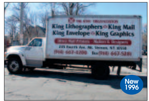
Ford F600 Diesel Truck