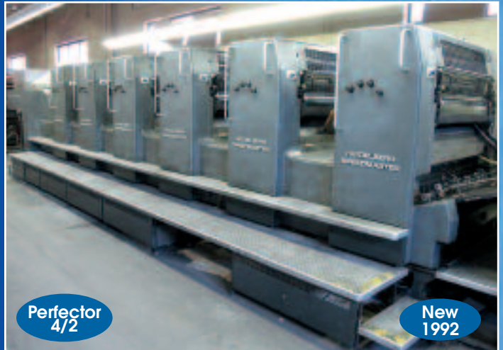
HEIDELBERG 6/C SHEET FED PRINTING PRESS MODEL SM102-SP