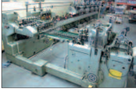
Muller Martini Saddle Stitcher Line Model JGVS