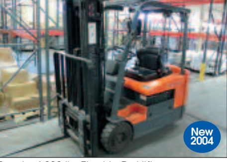
Toyota 4,000 lb. Electric Forklift Model 7FBEU20

Kodak Polychrome 5042 Digital Matchprint Color Proofer S/N SG25V2401Y