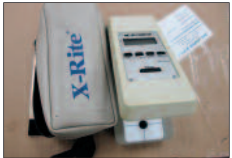
X-Rite 341 Densitometer