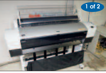
Epson Stylus Pro 9800 Proofer