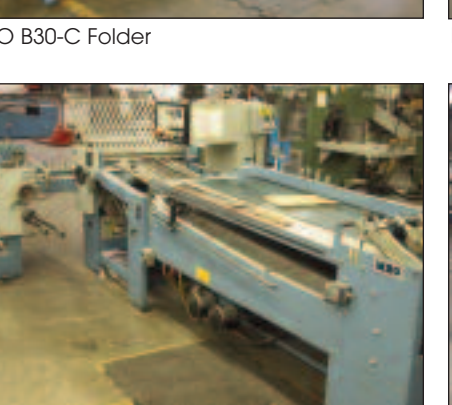
MBO B30 4/4/4