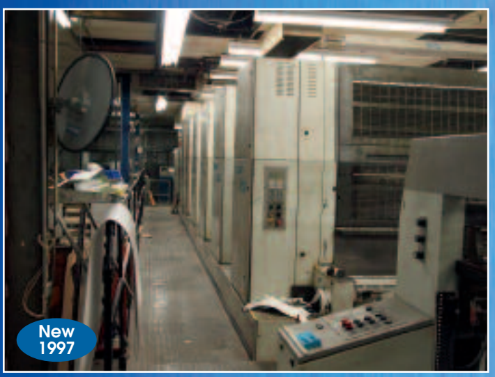
Man Roland 906 Sheet Fed Printing Press