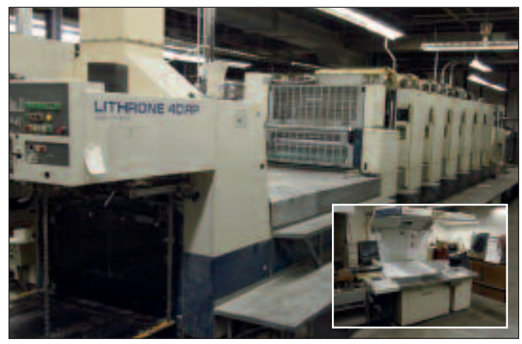
Komori L640RP-III Sheet Fed Printing Press / Komori L640RP-III Console