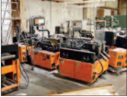
View of Gammerler Trimmers