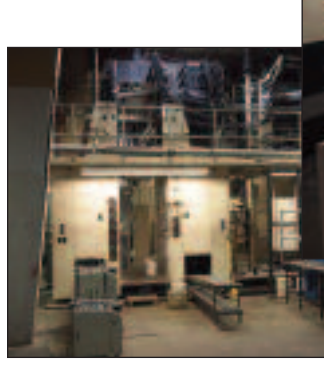
View of L1100 Control Console View of L1100 Folder Section