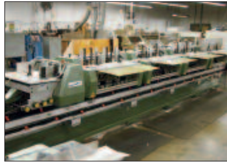
Muller "Presto" Feeders