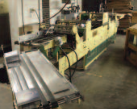
Longford CF-200 5-Card Folder