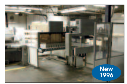
Polar 1ER145-6 Transomat Unloader