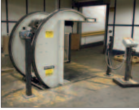
Automatan A7300 Skid Turner Air & Jogger

(2) Nissan 4000 lb LPG Forklifts; (2) Nissan 3000 lb LPG Forklifts; (2) Yale 6000 lb Electric pallet jacks; (2) Hyster 4000 lb Electric Forklifts; (3) Multiton 2000 lb Electric Walkbehind Lifts Model SM20; Interthor Electric Paper Lift Truck