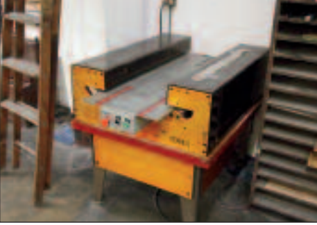
Ternes EMP Register Punch