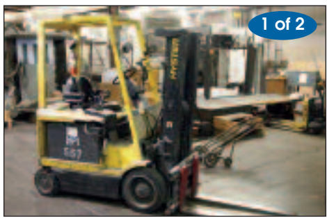
Hyster 4000 lb Electric Forklift