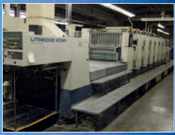
Komori L640RP-III Sheet Fed Printing Press