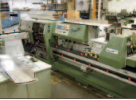
Muller "Presto" Saddle Stitcher

Automatan A7300 skid turner with air & jogger S/N: LH338