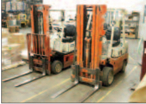
Nissan 4000 lb LPG Forklifts