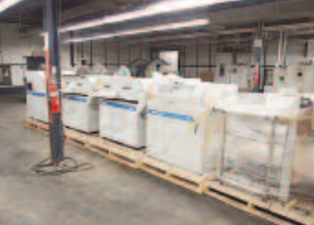
Hunkler Digital Print and Finish Line