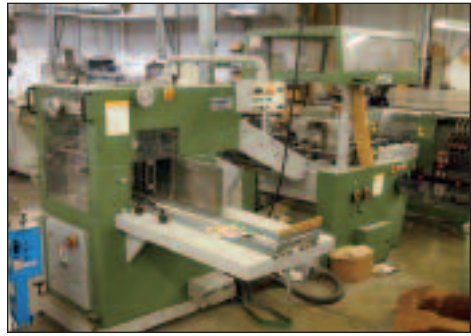
Muller 1540 "Apollo" Stacker/Counter