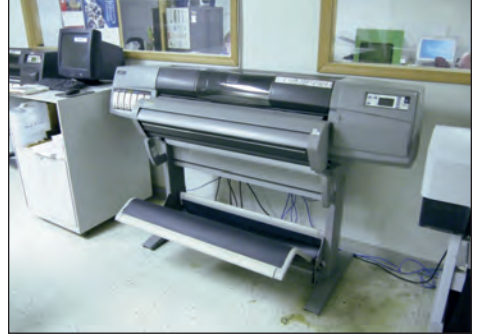
HP 5542 Wide Format Color Dylux Proofer