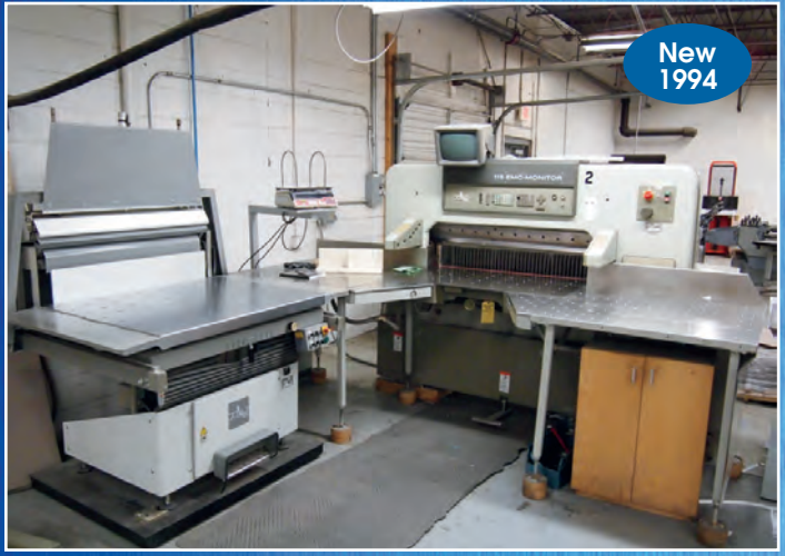
Polar Mohr Paper Cutter Model 115EMC-MON w/RA4 Jogger

SALE DATE: WEDNESDAY, JUNE 15, 10:30 AM (ET) INSPECTION: MONDAY/TUESDAY, JUNE 13 & 14, 9 AM TO 4 PM