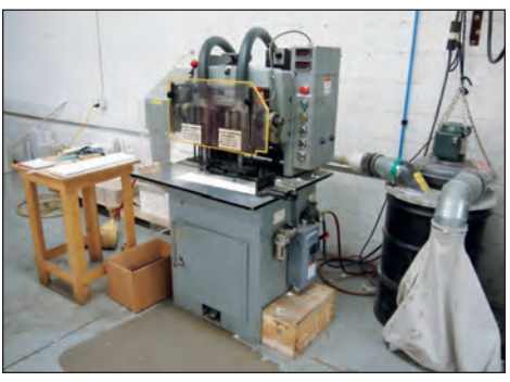
Lawson / Dexter Super Duty Drill Model B3PC