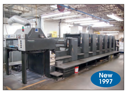
Heidelberg SM102-6-P3+L 6-Color Speedmaster 102 with coater