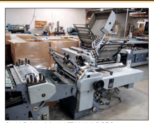
Stahl Folder Model TF66/4-4-2-RF.2