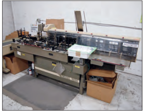
MailCrafter Inserter Model # 9800PM

Shipping Office Including: PC, Canon Printer, Brother Fax Machine, Desks, Chairs, Canon PC1060 Copier, HP Laser Jet 4250 Printer, Pelouze Digital Scale, IBM PC, Zebra Stripe Label Printer