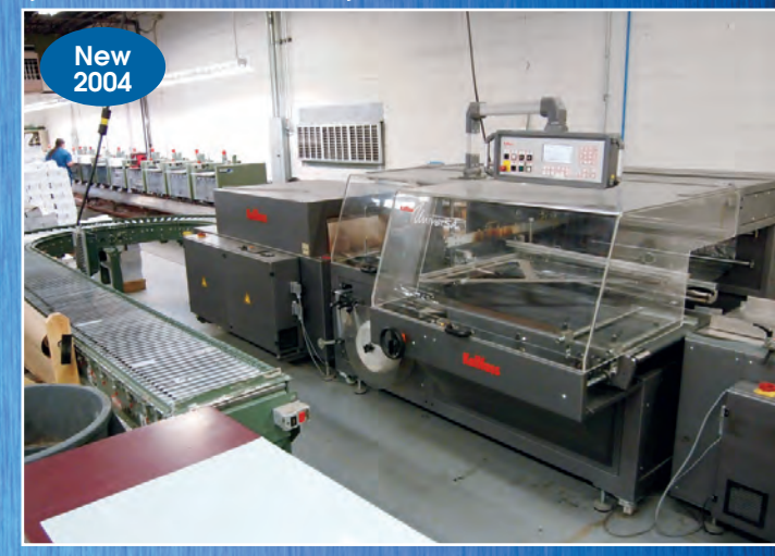
Kallfass Packaging Machine Model MGZ400 Universa

AUCTION INFORMATION • WWW.THOMASAUCTION.COM • 203-458-0709