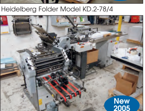
Heidelberg Pharmaceutical Folder Model 1.Tl-36