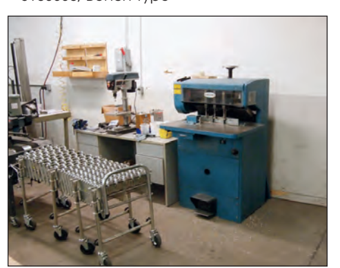
Challenge Paper Drill Model MS10A

Mettler Toledo Digital Scale Model BC, S/N 5168336, Bench Type