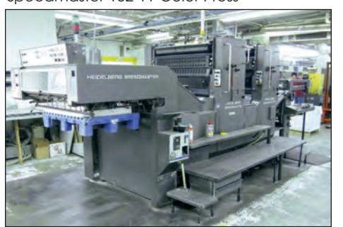
Heidelberg SM102-ZP 2 Color Press