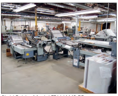
Stahl Folder Model TF66/4442-RF