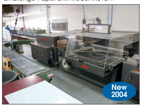
Kallfass Packaging Machine Model MGZ400 Universa