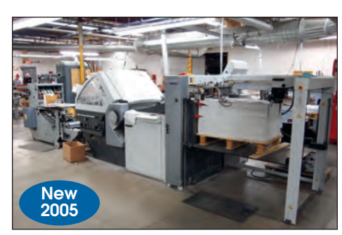
Heidelberg Stahl Folder Model BCUH-78