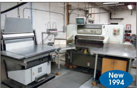
Polar Mohr Paper Cutter Model 115EMC-MON w/RA4 Jogger