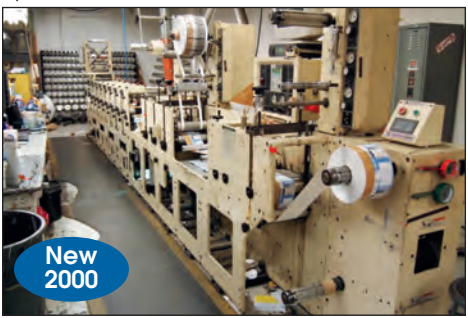
Mark Andy 2200 8-Color Flexographic Printing Press Model 2200-10F New 2000