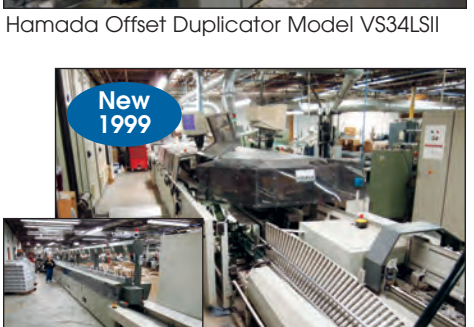
Kolbus Perfect Binder Line, 20 Feed Pockets, Model ZU 804