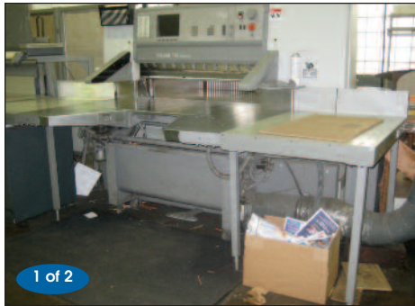
Polar Mohr 115ED Paper Cutter