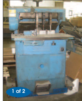
Lawson Heavy Duty Drill