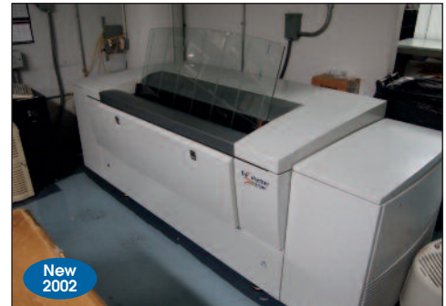
Creo Trendsetter Spectrum TS800F CTP System