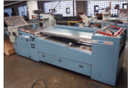
MBO Folder Model B123, Dual Feed Perfection Series