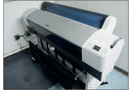
Epson 9800 Proofer