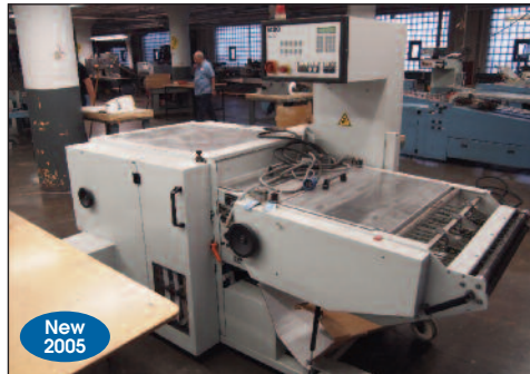
Palemodes ASP Model BA700