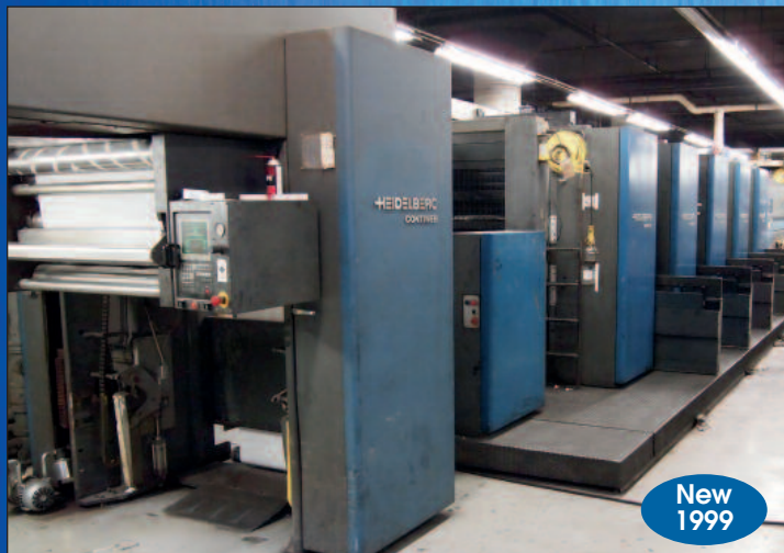
HARRIS / HEIDELBERG M600-B2

INSPECTION: Tuesday, July 26, 9 AM to 4 PM