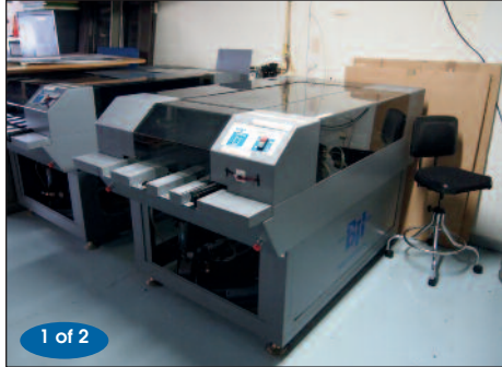
Burgess Industries Plate Benders