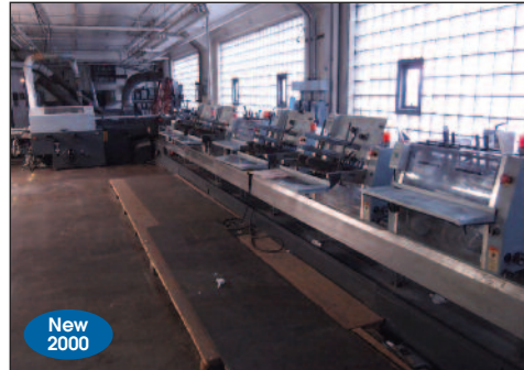
Heidelberg Harris Saddle Stitcher Line Model HS270