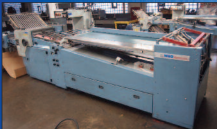
MBO FOLDER MODEL B123, DUAL FEED PERFECTION SERIES

BIDDING CLOSES: Thursday, July 28 at 2:00 PM (CT) INSPECTION: Tuesday, July 26, 9 AM to 4 PM