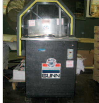
Bunn Tying Machine