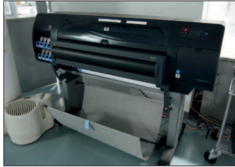
HP Designjet Z6100 Proofer, 5/C