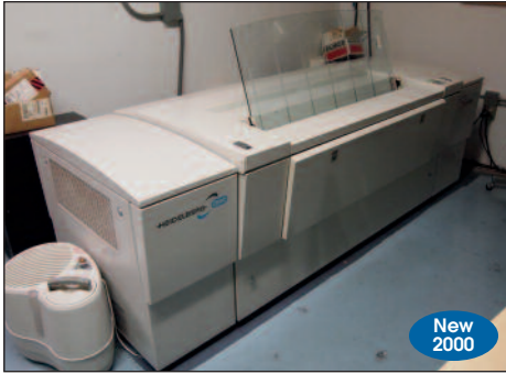
Creo Trendsetter Spectrum 3244F CTP System