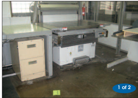
Polar Mohr Paper Jogger Model RW4