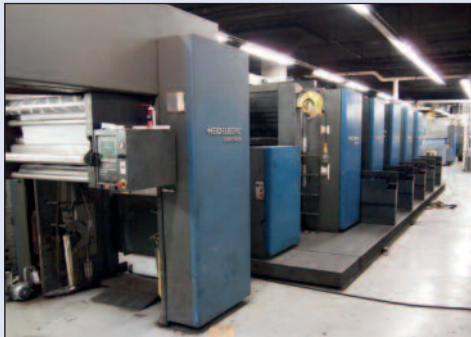
Harris / Heidelberg M600-B2

Harris / Heidelberg M600-B2 SN: MC-Y0241 (New 1999) (built in France), (5) print units (5/5) Single web configuration. 23 9/16" (600 mm) cutoff. 38" (965 mm) web width. Impression count unknown. 50,000 IPH. Contiweb Mdl. SH45 OP splicer ( for single web operation). QTI Mdl. 4000 web guides. Harris / Heidelberg web in-feed. AWS ink levelers on all ink fountains. Harris / Heidelberg web catcher. Print units are 1:1 blanket to plate cylinder ratio. Duotrol dampening. One (1) WPM pattern perforating & scoring unit. WPMination Veriprinter with pattern glueing & "scratch off" applicator & one sided AQ coating. QTI RGS V register controls. QTI closed loop color controls. Auto plate using plate cartridges. Baldwin blanket washers. AWS Vibrapack. AWS central fountain solution circulator. QTI web cutters. Harris / Heidelberg web break detectors. Sngle Ecotherm Mdl. 93/1020 gas dryer with built in pollution controls. Heidelberg JF-20 combination folder with auto change capable of double parallel & delta folding, with spine glueing capability. QTI cutoff controls for the JF folder and 4 / 8 pp folding module & sheeter. Baldwin vertical stacker. Rotocut sheeter. Ink temp. Control.