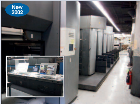
Harris / Heidelberg M600-B2 Web Printing Press