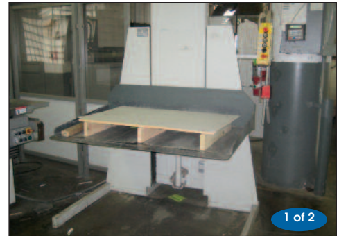
Polar Mohr Paper Jogger Model RW4