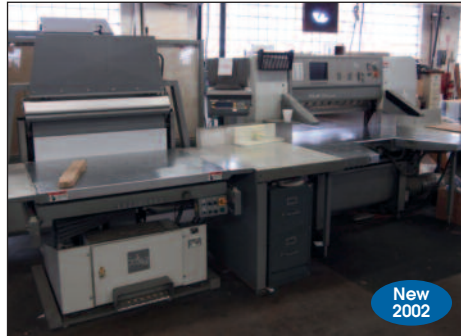
View of Polar Mohr Cutter w/Jogger and Lift