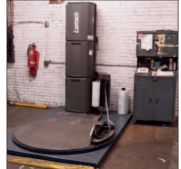
Lantech Rotary Stretch Pallet Wrapper