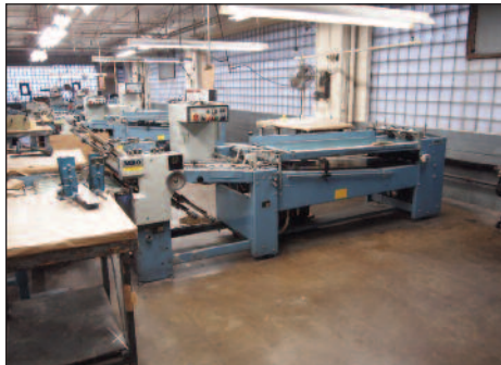
MBO Folder Model B26-S-C