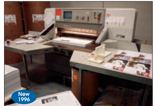
Polar Mohr Paper Cutter Model 115-ED