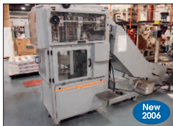
Gammeler Vertical Stacker, Model KL 5000