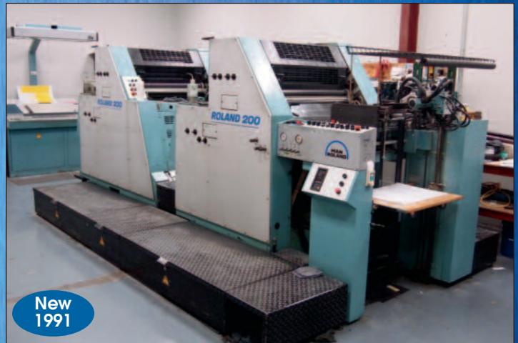
MAN Roland 4/C Sheet Fed Press Model 204