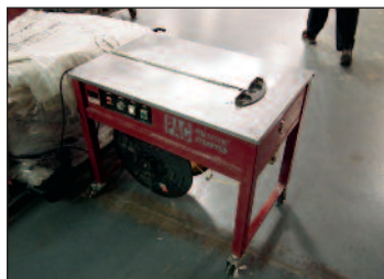
PAC Strapping Machine Model PSM-1412-IC3