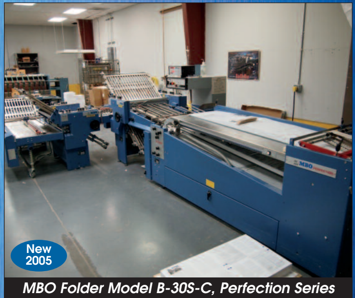
MBO Folder Model B-30S-C, Perfection Series