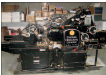
Original Heidelberg Cylinder die- cutter, 15" x 20.5",