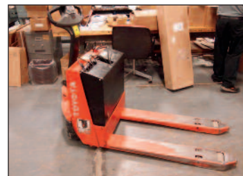
Toyota Electric Pallet Jack