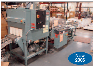
Shanklin Packaging Machine Model A27A