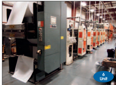
Hantscho Web Press Model Mark II