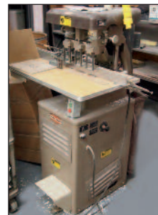
Challenge 3-Spindle Paper Drill