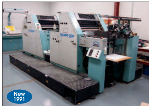
MAN Roland 4/C Sheet Fed Press Model 204