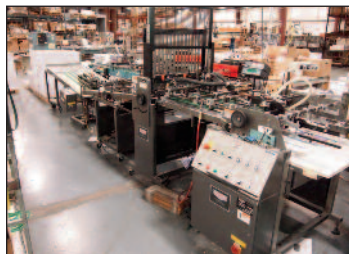
Kluge Unifold Pocket Folder/Gluer