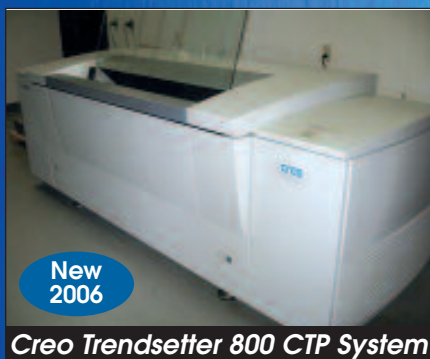
Creo Trendsetter 800 CTP System