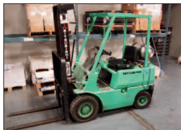
Mitsubishi 3000 lb. LPG Forklift