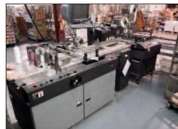
Video Jet Ink Jet Variable Date Print System