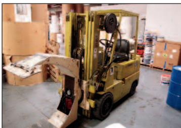
Mitsubishi 5000 lb. LPG Forklift w/Roll Clamp