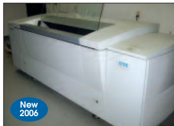
Creo Trendsetter 800 CTP System