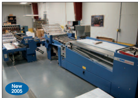
MBO Folder Model B-30S-C, Perfection Series