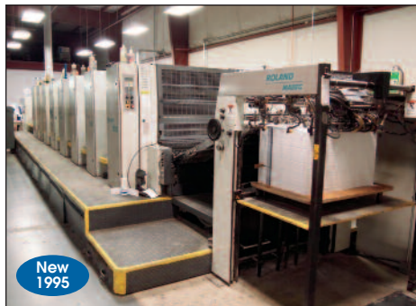
MAN Roland 7/C Sheet Fed Press Model 707 + LV