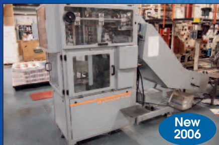
Gammeler Vertical Stacker, Model KL 5000