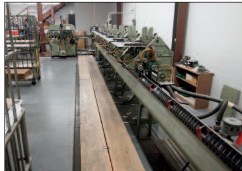
Muller Saddle Stitcher Line Model 221