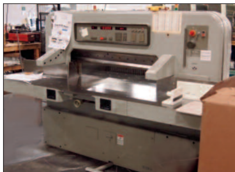
Polar Mohr Paper Cutter Model 115-EMC