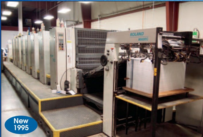
MAN Roland 7/C Sheet Fed Press Model 707 + LV

INSPECTION: Monday, August 1, 9 AM to 4 PM