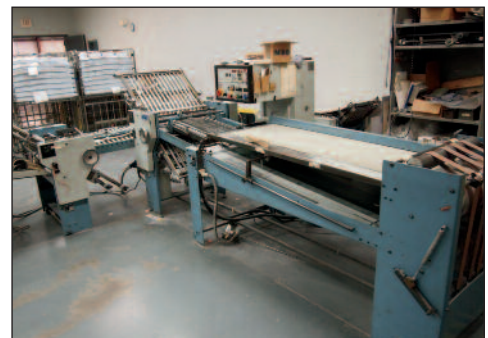
MBO Folder Model T65 4/4/4