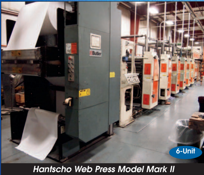
Hantscho Web Press Model Mark II