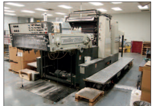
Miller 2/C Sheet Fed Press Model TP104-Plus