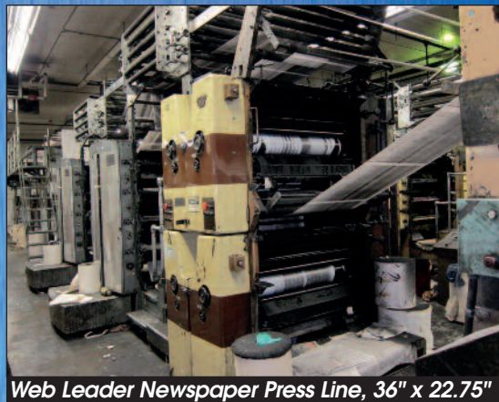
Web Leader Newspaper Press Line, 36" x 22.75"