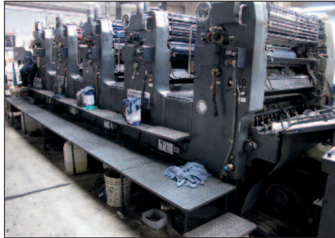
Heidelberg Speedmaster 5/C 40" Press