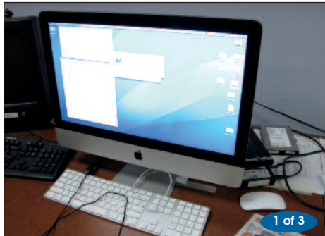
Apple IMac All-In-One PC