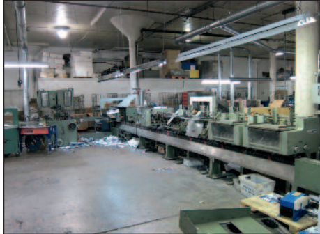
Muller Martini Minuteman Saddle Stitcher Line