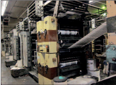
Web Leader Newspaper Press Line, 36" x 22.75"