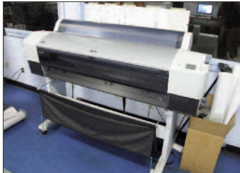
Epson Stylus Pro 9800 Proofer