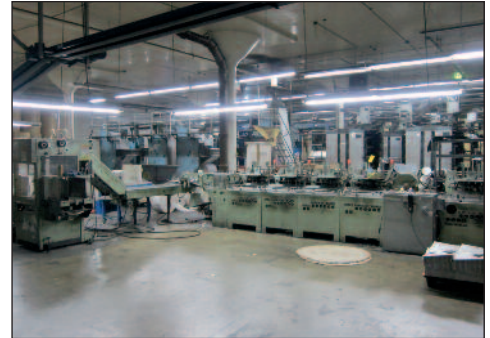
Muller Martini 235 Saddle Stitcher Line