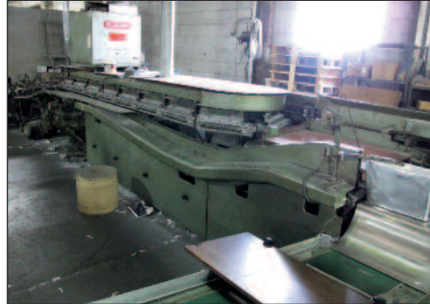
Muller Martini Perfect Binder Line