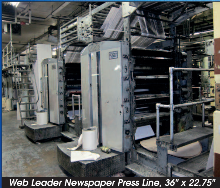
Web Leader Newspaper Press Line, 36" x 22.75"