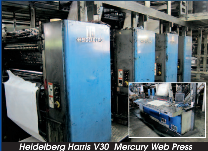
Heidelberg Harris V30 Mercury Web Press

INSPECTION: Tuesday, August 30, 9 AM to 4 PM