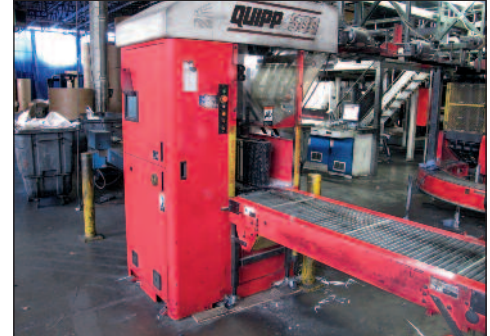
Quipp Stacker Model 500