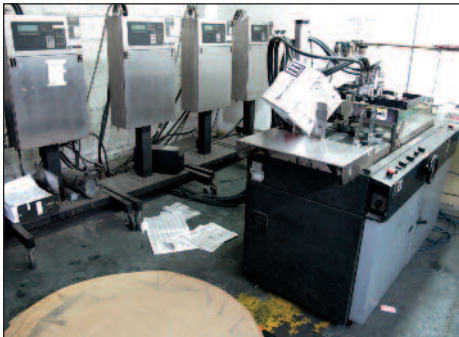
Video Jet Variable Data Print System Model 7000