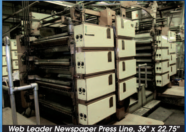
Web Leader Newspaper Press Line, 36" x 22.75"