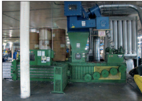
Selco Horizontal Baler, Model HSO-107A