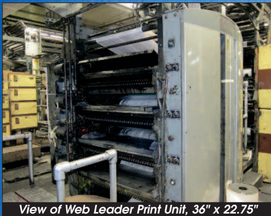
View of Web Leader Print Unit, 36" x 22.75"