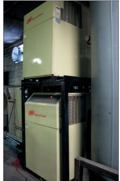
(2) Ingersoll Rand #NVC600A400 Dryers