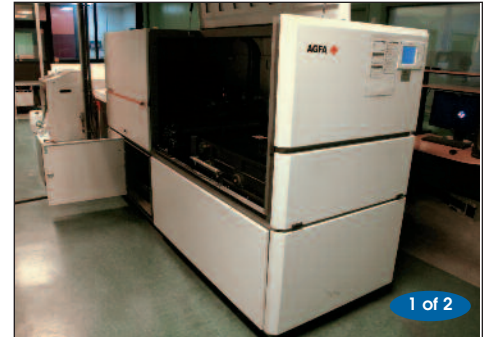
Advantage CL Computer To Plate Systems