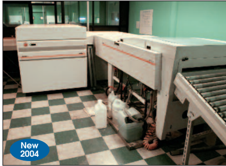
Agfa CTP System Model Galileo VS