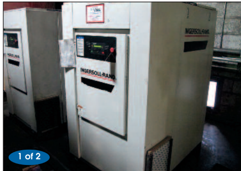
Ingersoll Rand 50 HP Compressor #SSR-EP50SE