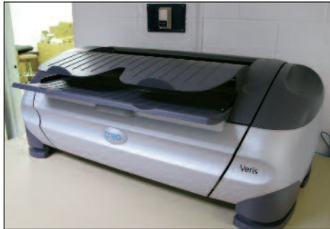
Creo Proofer Model Veris