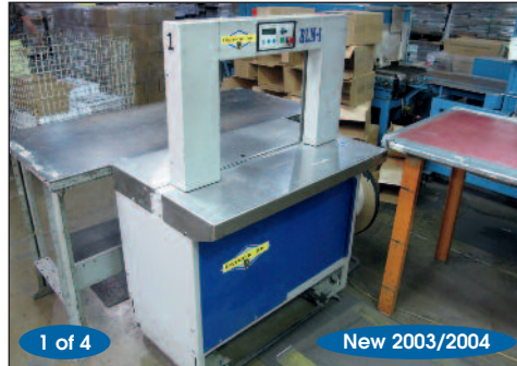
Dynaric Power Strapper Model D2400