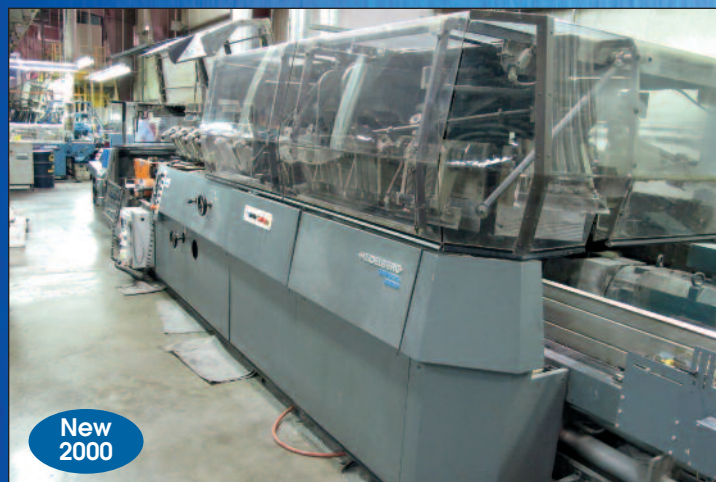
Heidelberg Perfect Binder Model UB227