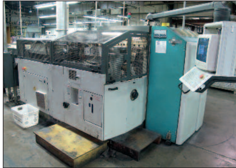
Kolbus HD151.P Trimmer