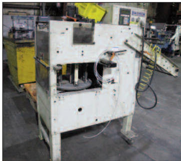
Rima RS12 Stacker