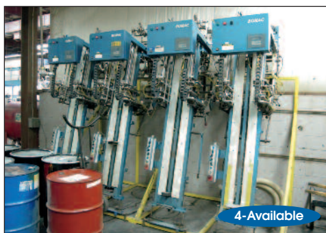
(4) Bomac Feeders, Programmable Control, High Speed