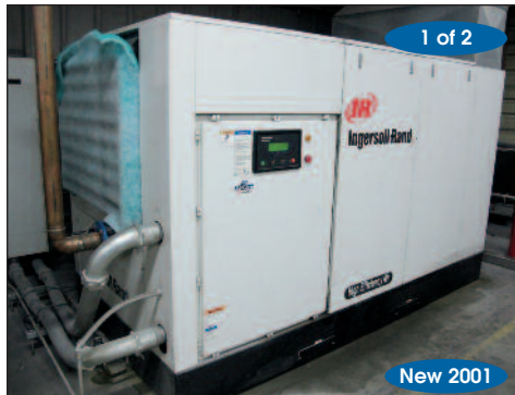
Ingersoll Rand 200 HP Air Compressor Model SSR-EPE-200-2S