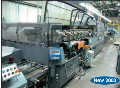
Heidelberg Perfect Binder Model UB227