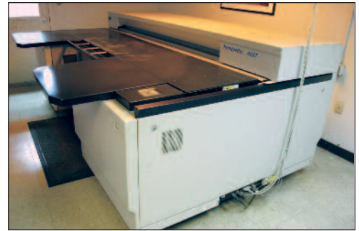
Creo Trendsetter VLF-4557 CTP System