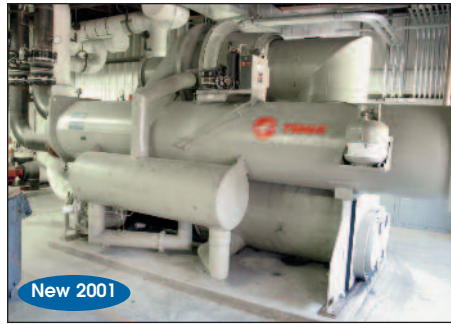
Trane 650-Ton CentraVac Chiller Model CVHF-650