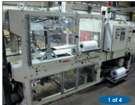
Arpac Shrink Wrapper #55-GI-20C