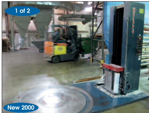
Wulftec Stretch Pallet Wrapper Model WLP-200