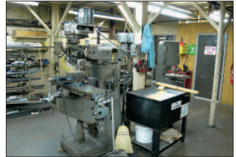
Newport Vertical Milling Machine