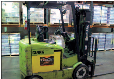
Clark 4800 lb LPG Forklift Model ECS-25