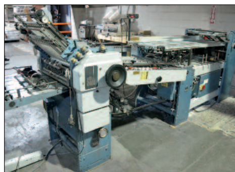
Stahl Folder Model TF56/44RF