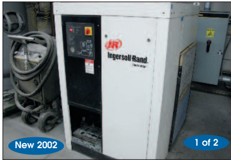
Ingersoll Rand Air Dryer Model TS800