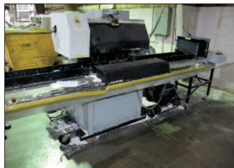
Dexter Lawson Drill Model Classic H DCHR, 6-Spindle