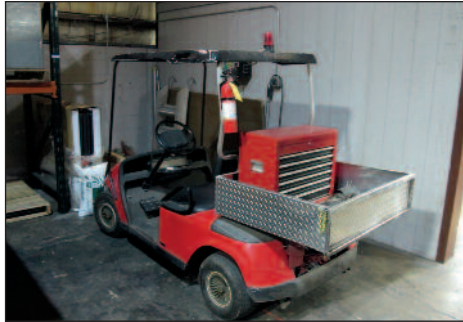
Textron Golf Cart Model EZ-Go