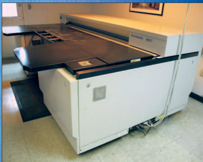
Creo Trendsetter VLF-4557 CTP System