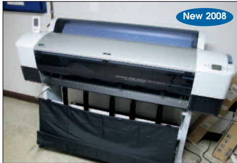
Epson Stylus Pro 9880 Proofer