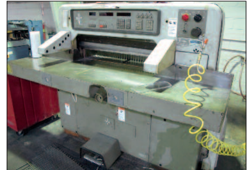
1983 Polar Mohr Paper Cutter Model 92EMC