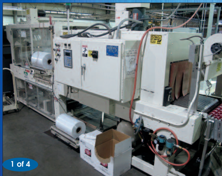
Arpac Shrink Wrapper #55-GI-20C