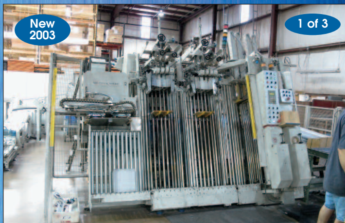
Civienne Auto Double Stream Stackers #ST420/40DS