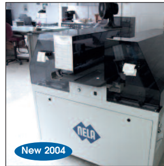
Nela Plate Bender Model HAP-P1000S