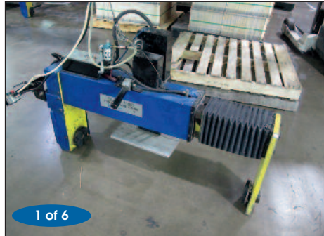
Signature Log Clamp Units model SLC 1 of 6