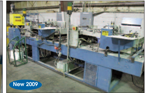
Domino Head and Foot Tabbing Line