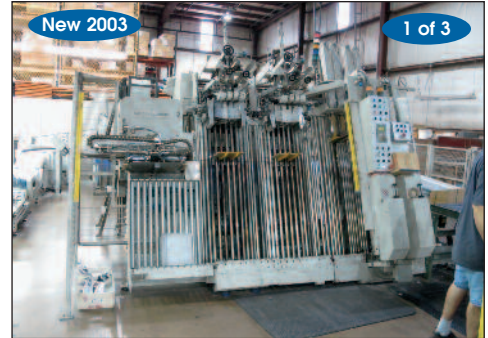
Civiemme Auto Double Stream Stackers #ST420/40DS