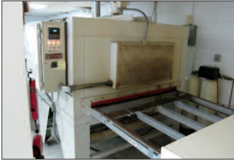
Wisconsin 48" Electric Oven Model SPC-48-HTS/109

PLEASE NOTE: THIS IS AN ONLINE ONLY AUCTION. THERE WILL BE NO ONSITE BIDDING. ALL BIDDING WILL TAKE PLACE OVER THE INTERNET. REGISTER AND BID AT WWW.THOMASAUCTION.COM / AMERICAN PRESS.