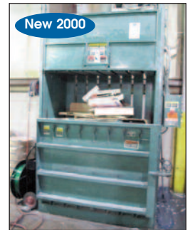
Selco V5-HD Vertical Baler