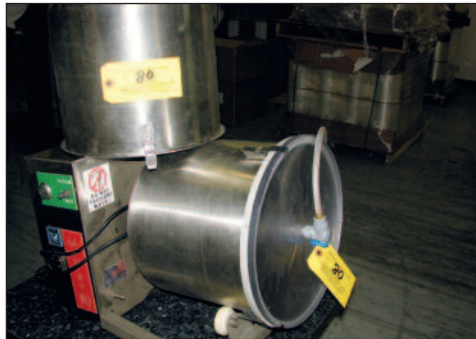
Hollymatic Vacuum Tumbler Model HVT-30