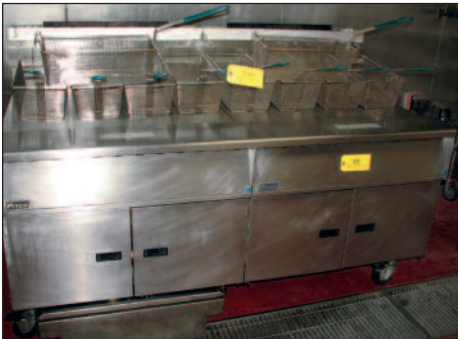
Pitco Frialator S.S. Gas Fryer, Dual Unit w/ (8) Baskets