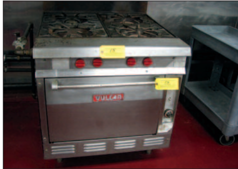
Vulcan Gas 4-Burner S.S. & Black Iron Stove