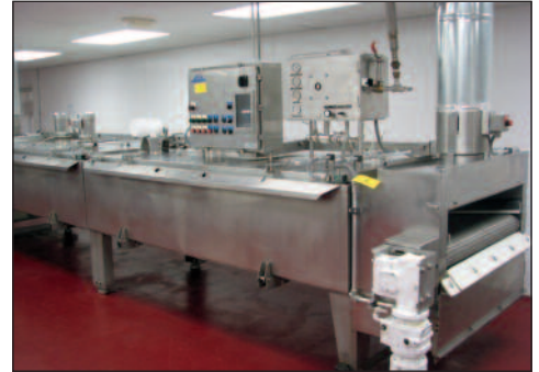
Linde S.S. 30" Nitrogen Freezing Tunnel