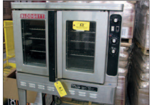
Blodgett S.S. Single Stack Convection Oven