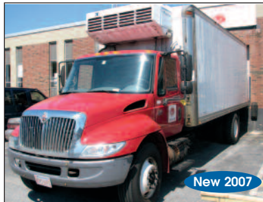
International Box Delivery Van Model 4300