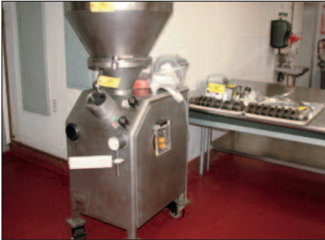
Reiser/Vmag Automatic Stuffer Mod. Robot 500