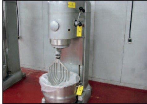
Hobart 80 Qt Mixer w/ Hydraulic Bowl Lift