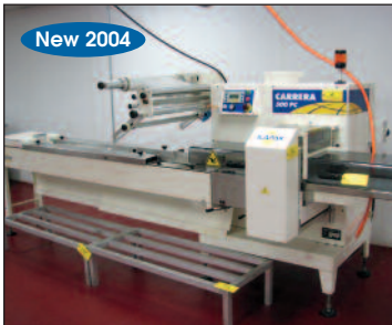
Ilapak Fully Automatic Overwrapper Model Cerrera 500PC