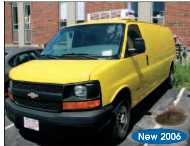
Chevy Refrigerated Van Model Express 2500