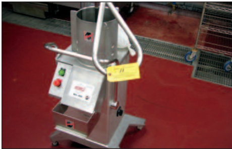
Halde S.S. Julienne Shredder & Cutter Model RG-400