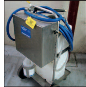
Laffety S.S. Portable Foaming System

IIAPAK OVERWRAPPER MACHINE Ilapak Fully Automatic Overwrapper Model Cerrera 500PC, S/N 04-231 (2004) w/ Model VT24 Microprocessing Controls, Photo Sensor, w/ Infeed & Outfeed Conveyor, Fits Slug Size 14 3/8" Between Tabs, 7" Wide (2004) (5) Pallets w/ Ilapak Film, 10.5", 15.5", 18" & 22.5" Sizes