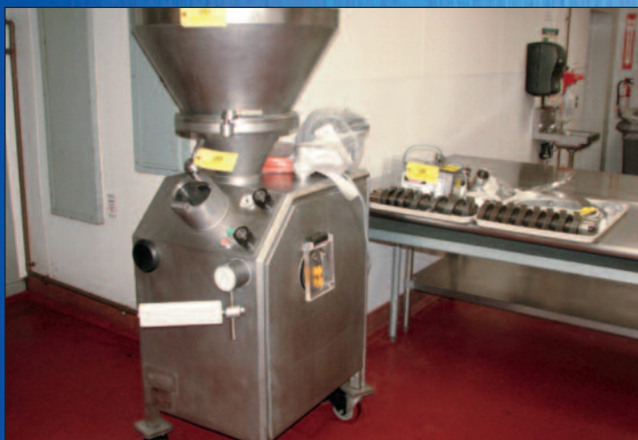
Reiser/Vmag Automatic Stuffer Model Robot 500

BIDDING CLOSES: TUESDAY, SEPTEMBER 20, 1:00 PM (ET) INSPECTION: MONDAY, SEPTEMBER 19, 9 AM TO 4 PM