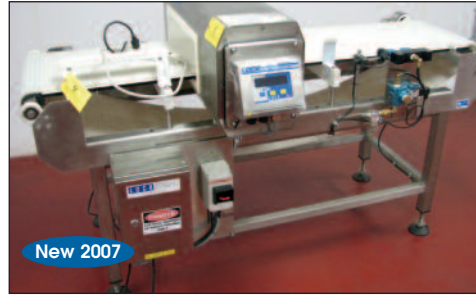
Lock Detector & Weigh Checker Model Met 30+