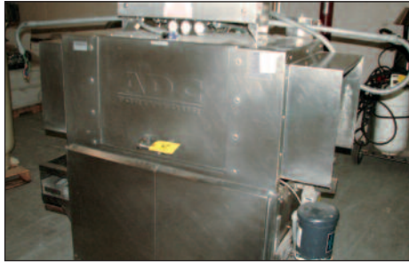
American Dish Service Dishwasher Model ADC-44