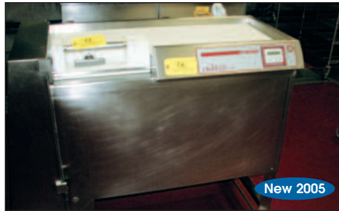
Holac S.S. Meat Cutting Machine Model Cubixx 100L