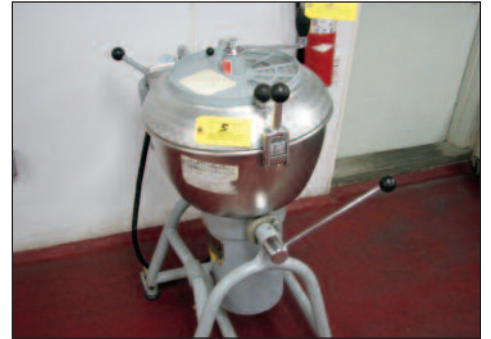
Hobart S.S. & Galvanized Buffalo Chopper Model VCM40