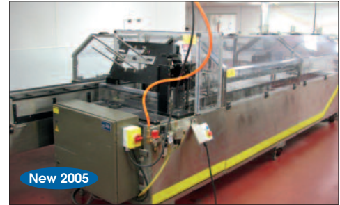
Econoseal E-System Cartoner/Case Erector, Model 1100