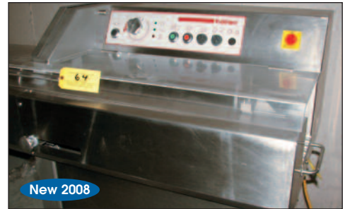
Holac S.S. Universal Cutting/Slicing Machine Model 20/74E8