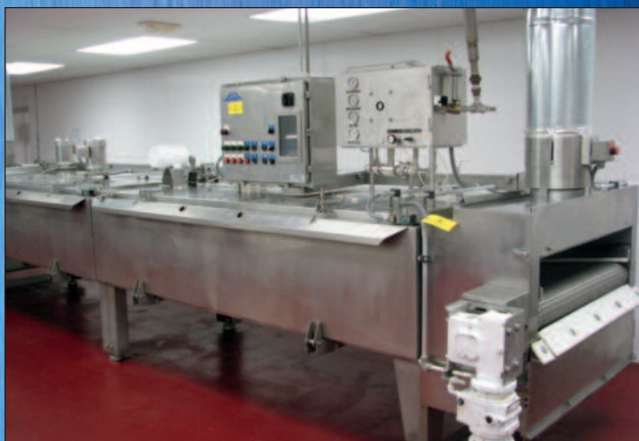
Linde S.S. 30" Nitrogen Freezing Tunnel