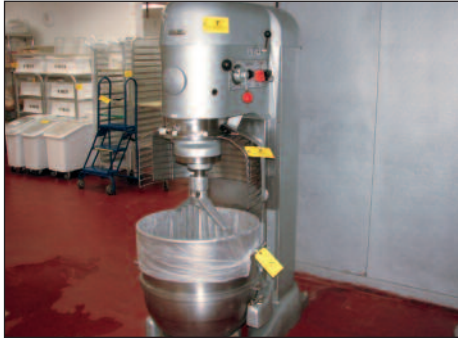
Hobart 140 Qt Mixer Model V1401