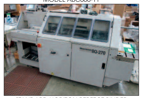
STANDARD HORIZON PERFECT BINDER MODEL BQ-270