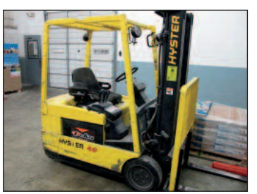
HYSTER ELECTRIC FORKLIFT MODEL J40XMT