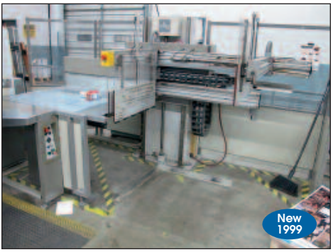
POLAR MOHR TRANSOMAT MODEL TR130ER-5