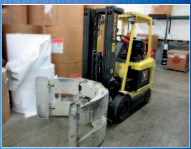
HYSTER 5,000 LB FORKLIFT W/CASCADE ROLL CLAMP

AUCTION INFORMATION • WWW.THOMASAUCTION.COM • 203-458-0709