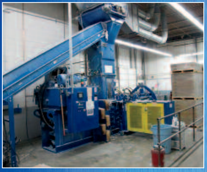
AMERICAN BALER W/VECOPLAN SHREDDER

AUCTION DATE: WEDNESDAY, OCTOBER 19, 10:30 AM (ET) OPEN HOUSE INSPECTION: TUESDAY, OCTOBER 18 (9-4)