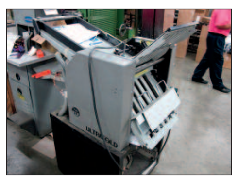
BAUM ULTRA FOLD FOLDER MODEL 714XE