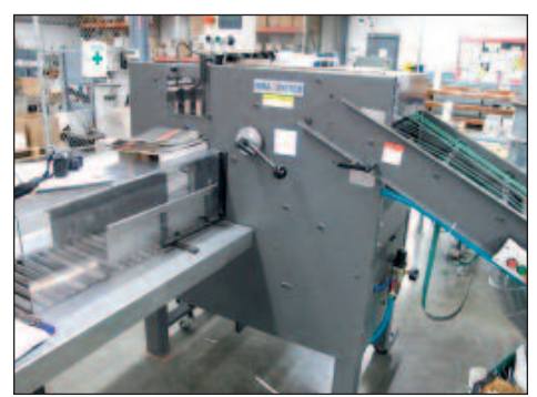
RIMA COUNTER STACKER MODEL RS2510