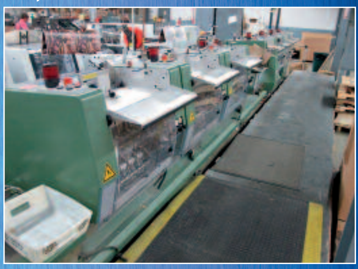
MULLER MARTINI SADDLE STITCHER LINE MODEL PRIMA SB