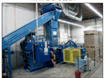
AMERICAN BALER W/VECOPLAN SHREDDER