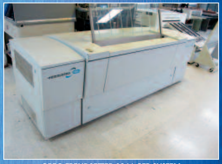
CREO TRENDSETTER 3244 CTP SYSTEM

SALE DATE: WEDNESDAY, OCTOBER 19, 10:30 AM (ET) OPEN HOUSE INSPECTION: TUES. OCTOBER 18th, 9 AM TO 4 PM