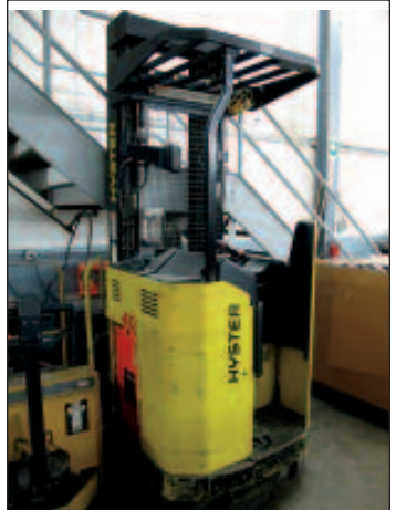
HYSTER ELECTRIC REACH FORKLIFT MODEL N40XMR2