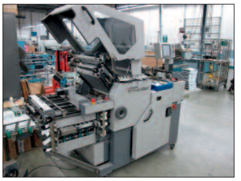
STANDARD HORIZON CROSS FOLDER MODEL AFC-546AKT