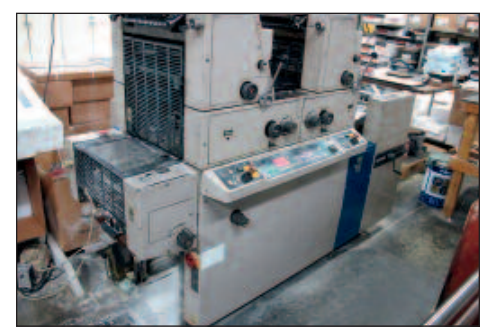
RYOBI 2-COLOR SHEET FED PRESS MODEL 3302M