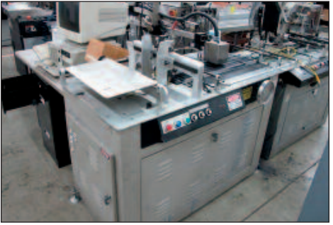
DOMINO JET ARRAY INK JET PRINT SYSTEM MODEL ABC600-11