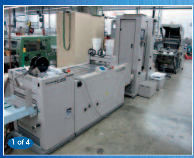
STANDARD HORIZON BOOKLET MAKER: COLLATOR/STITCHER/TRIMMER/FOLDER