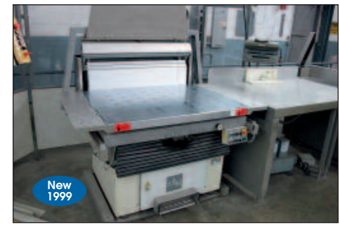
POLAR MOHR JOGGER MODEL RA-4