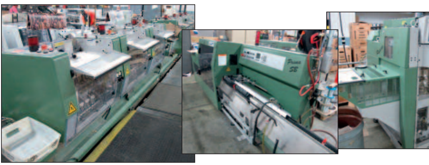
MULLER MARTINI SADDLE STITCHER LINE MODEL PRIMA SB