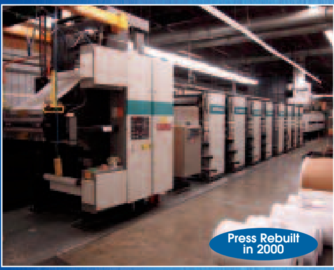
MAN ROLAND ROTOMAN HEATSET WEB OFFSET