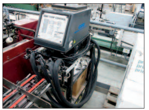
GMS 34-4 MICROGLUE PROGRAMMABLE GLUE SYSTEM