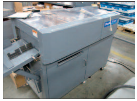
DUPLO SLITTER CUTTER CREASER MODEL DC-645