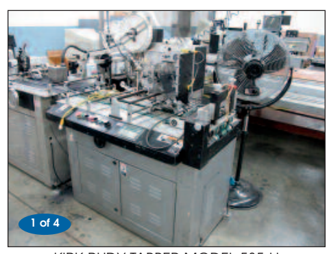
KIRK RUDY TABBER MODEL 535-H