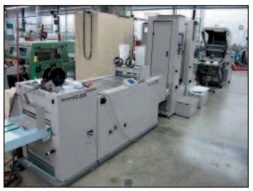
STANDARD HORIZON BOOKLET MAKER: COLLATOR/ STITCHER/ TRIMMER/FOLDER