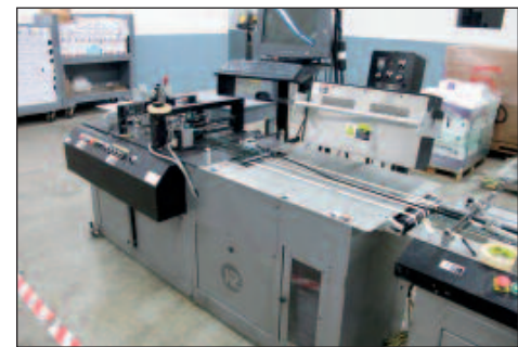
KIRK RUDY INK JET PRINT SYSTEM/LABELER