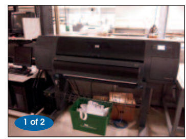
HP DESIGN JET 1050C PLOTTERS