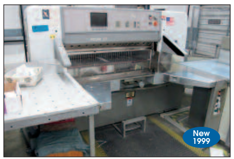
POLAR MOHR PAPER CUTTER MODEL 137ED