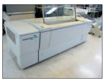
CREO TRENDSETTER 3244 CTP SYSTEM