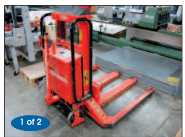
INTERTHOR TRANS-POSITIONER PAPER LIFT, 2000 LB. CAP