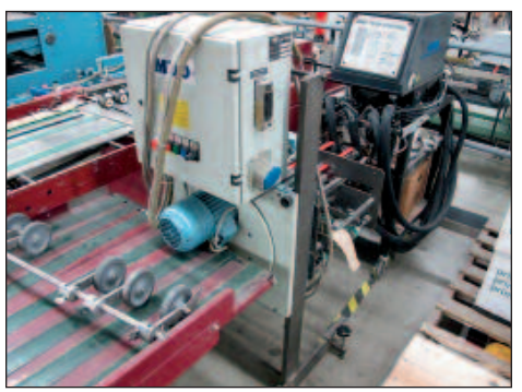
MBO Z2 AIR KNIFE ATTACHMENT