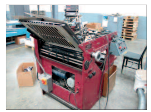
DICK MOLL POCKET FOLD UNIT MODEL MARATHON