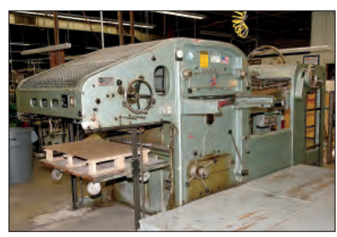
BOBST DIE CUTTER MODEL 1080