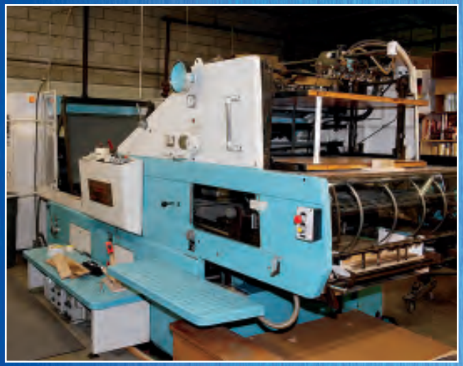
BEDDIS KENLEY 28" X 40" ARTFOIL FOIL STAMPING AND EMBOSSING PRESS MODEL MODEL B

SALE DATE: THURS., OCTOBER 27, 10:30 AM (ET) INSPECTION: WEDS., OCTOBER 26, 9 AM TO 4 PM