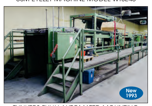
TUNKERS FULLY AUTOMATED MOUNTING MACHINE