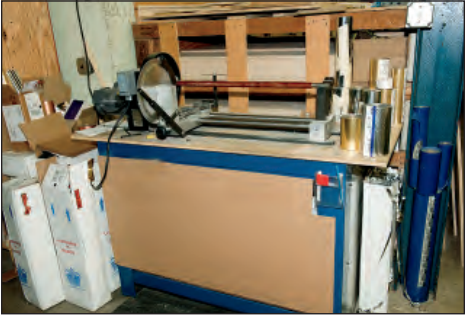
VANSCO HEAVY DUTY FOIL CUTTER MODEL 126-10