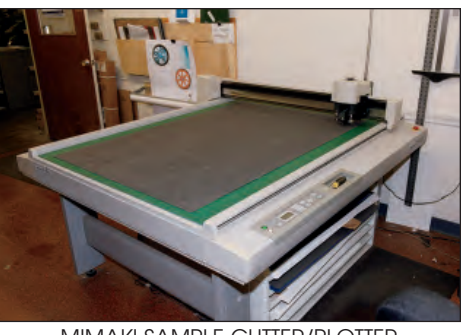
MIMAKI SAMPLE CUTTER/PLOTTER