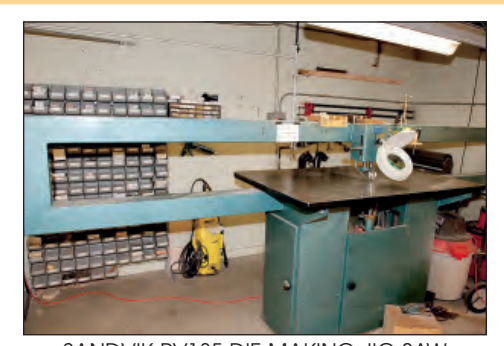
SANDVIK PV185 DIE MAKING JIG SAW MODEL PV1850