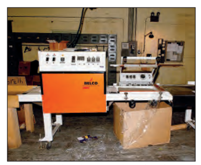
BELCO L-SEAL PACKAGING MACHINE W/HEAT SHRINK TUNNEL