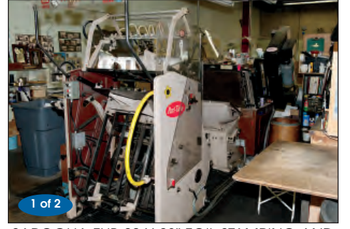
SAROGLIA FUB 20 X 28" FOIL STAMPING AND EMBOSSING PRESS