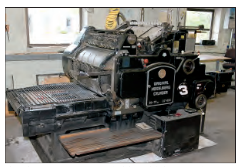
ORIGINAL HEIDLEBERG 22" X 30.25" DIE CUTTER