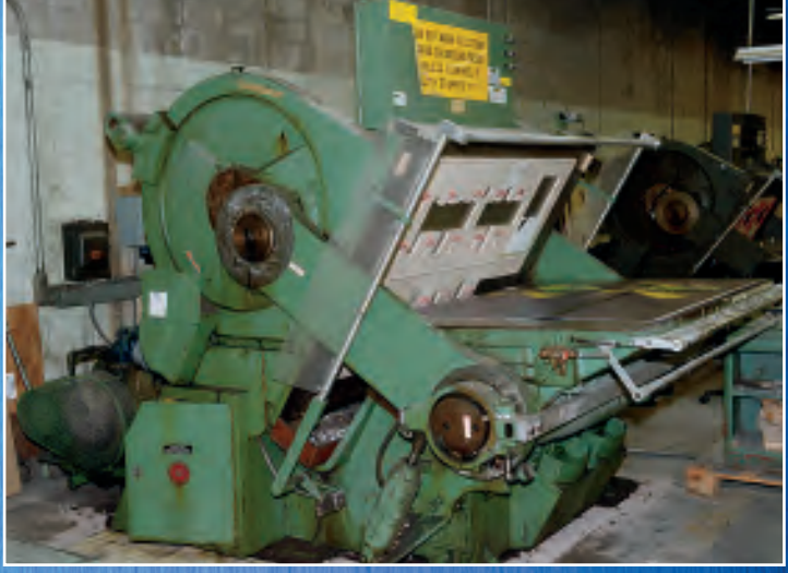
THOMPSON NATIONAL 44" X 66" DIE CUTTER MODEL 10-8-7