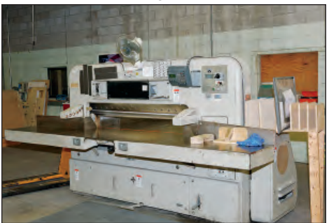
POLAR MOHR 61" CUTTER MODEL 155CE