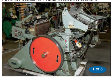
KLUGE 14" X 22" KLUGE FOIL STAMPING AND EMBOSSING PRESS MODEL EHD