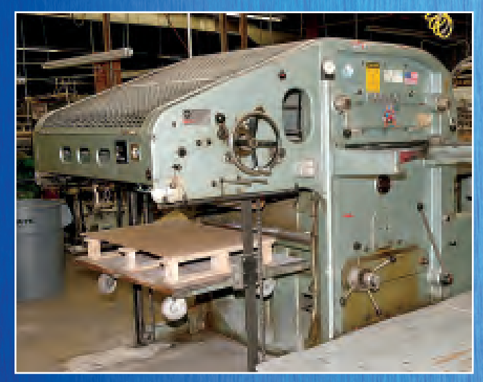
BOBST DIE CUTTER MODEL 1080