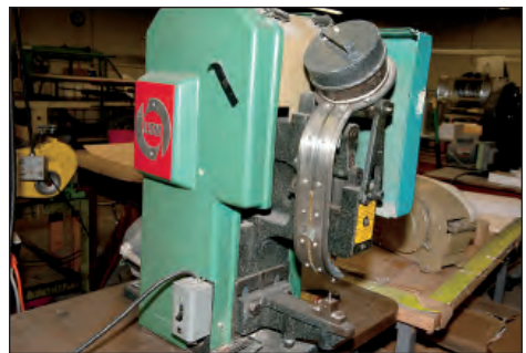
USM EYELET MACHINE MODEL WTSE46