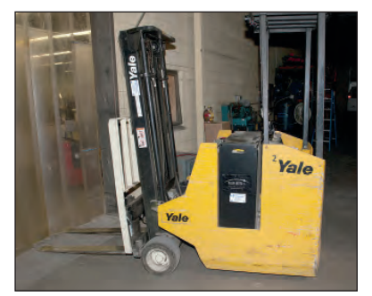
YALE 3000 LB ELECTRIC STAND UP FORKLIFT MODEL FSC030ABN245V083