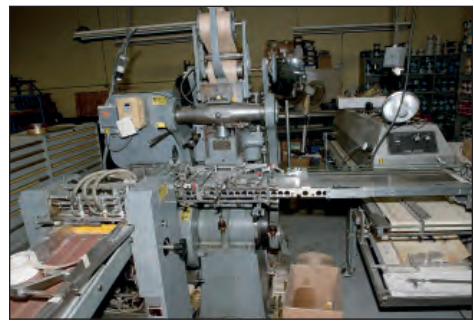
HI SPEED CRONITE 3" X 8" ENGRAVING PRESS