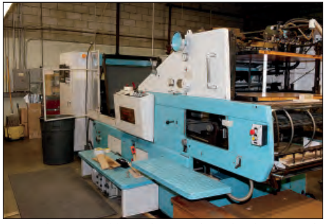
BEDDIS KENLEY 28" X 40" ARTFOIL FOIL STAMPING AND EMBOSSING PRESS MODEL MODEL B