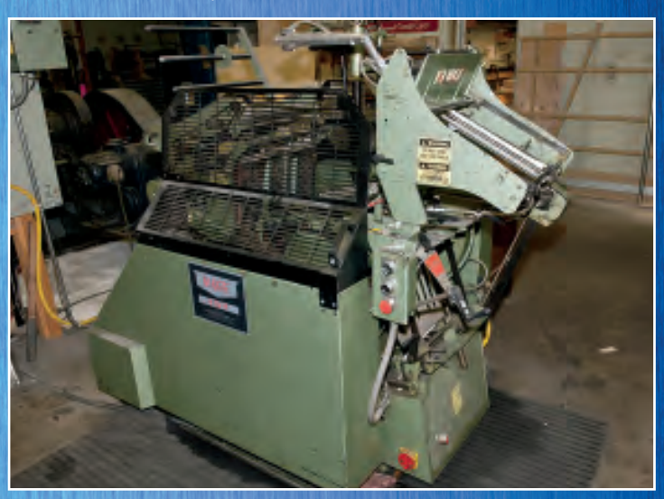
KLUGE 11" X 17" FOIL STAMPING AND EMBOSSING PRESS MODEL D