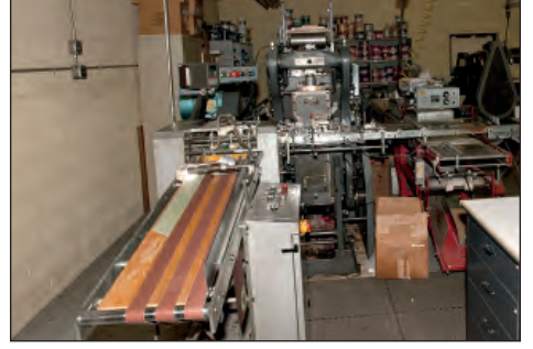
HI SPEED CRONITE 5" X 9" ENGRAVING PRESS