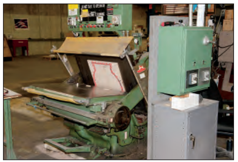
THOMSON NATIONAL 28" X 41" CUTTER AND EMBOSSING PRESS MODEL 8-6 ACDM