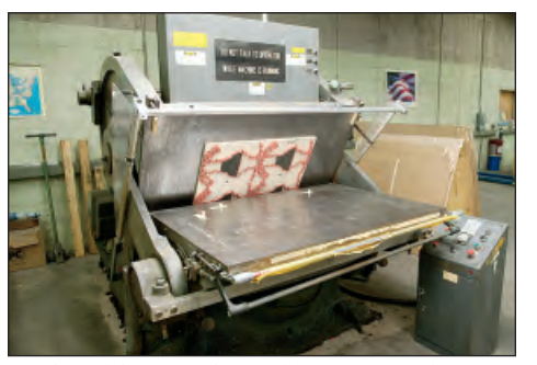
THOMPSON NATIONAL 38" X 54" DIE CUTTER