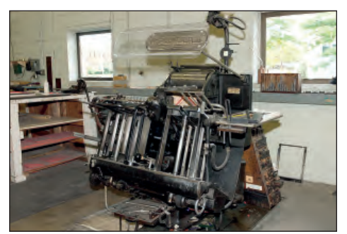
HEIDLEBERG 10" X 15" WINDMILL PRESS