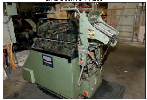
KLUGE 11" X 17" FOIL STAMPING AND EMBOSSING PRESS MODEL D