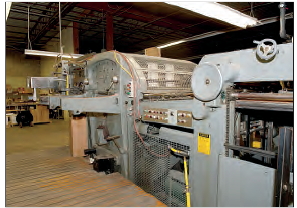
BOBST DIE CUTTER MODEL 1260