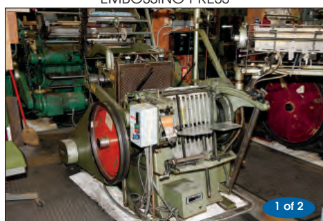
KLUGE 12" X 18" KLUGE FOIL STAMPING AND EMBOSSING PRESS