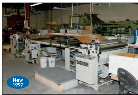
TUNKERS SEMI AUTOMATED MOUNTING MACHINE