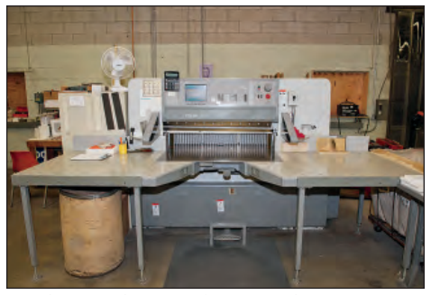
POLAR MOHR 47" CUTTER MODEL 115ED