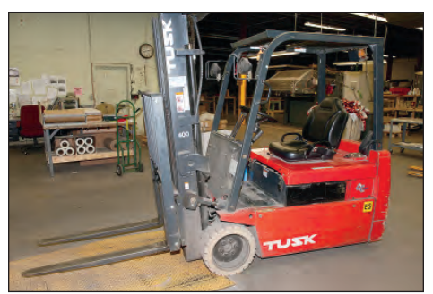
TUSK 3450 LB ELECTRIC FORKLIFT MODEL 400 MBS-3