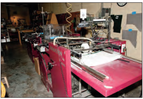
MOLL MARATHON POCKET FOLDER GLUER